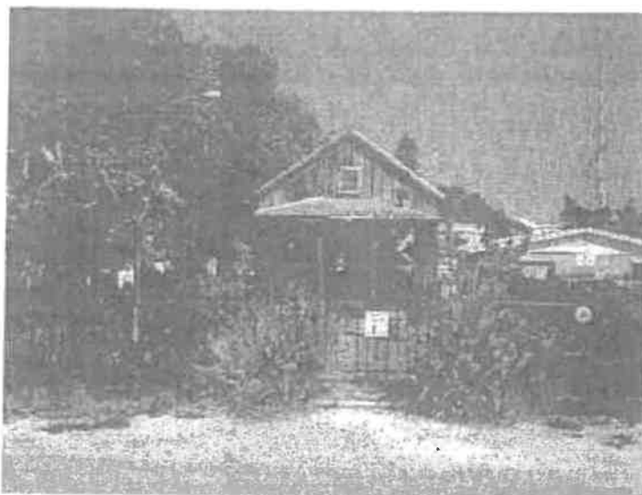
600 BLOCK LOUISA STREET - RE# 00028400-000000