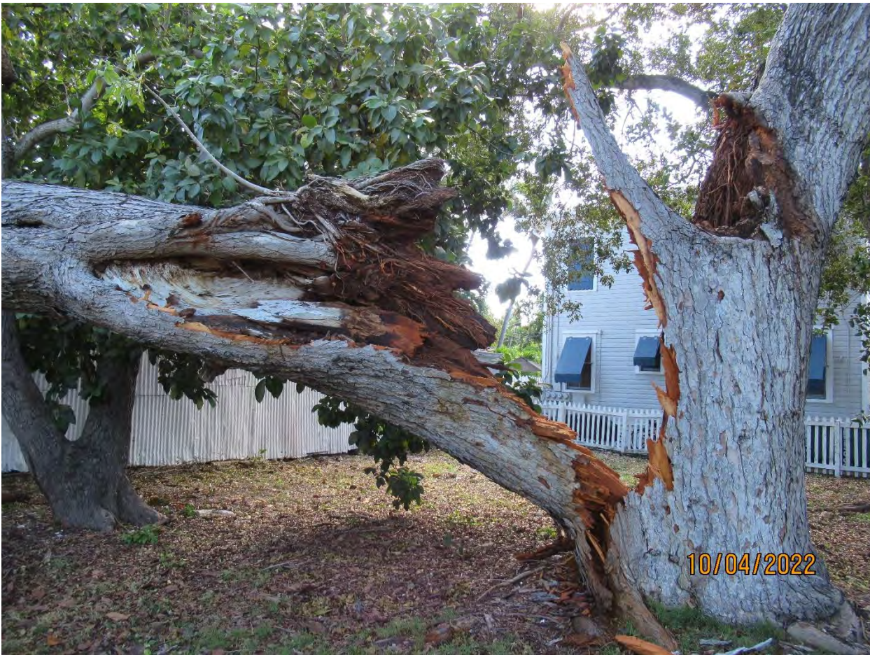
Photo of tree after Hurricane Ian, view 1.