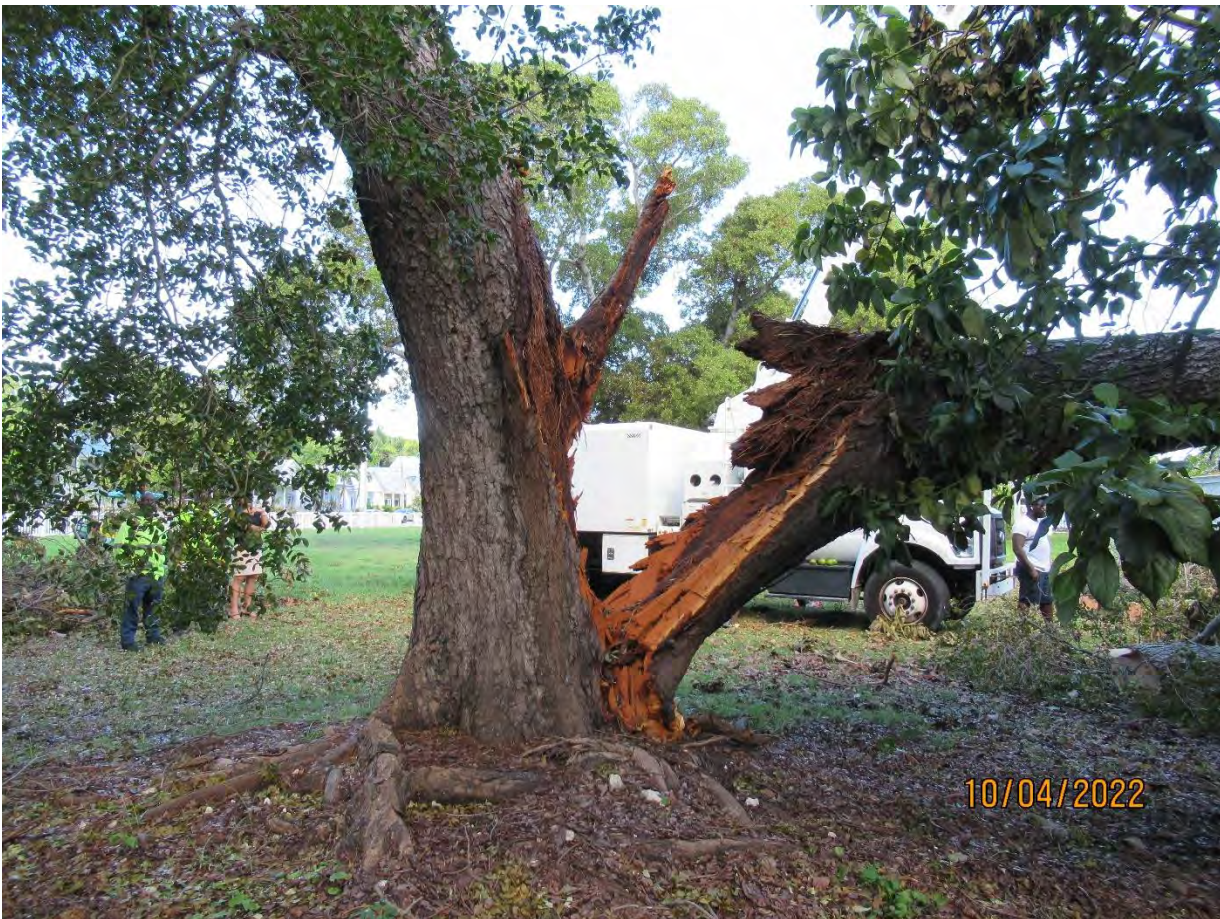
Photo of tree after Hurricane Ian, view 2.