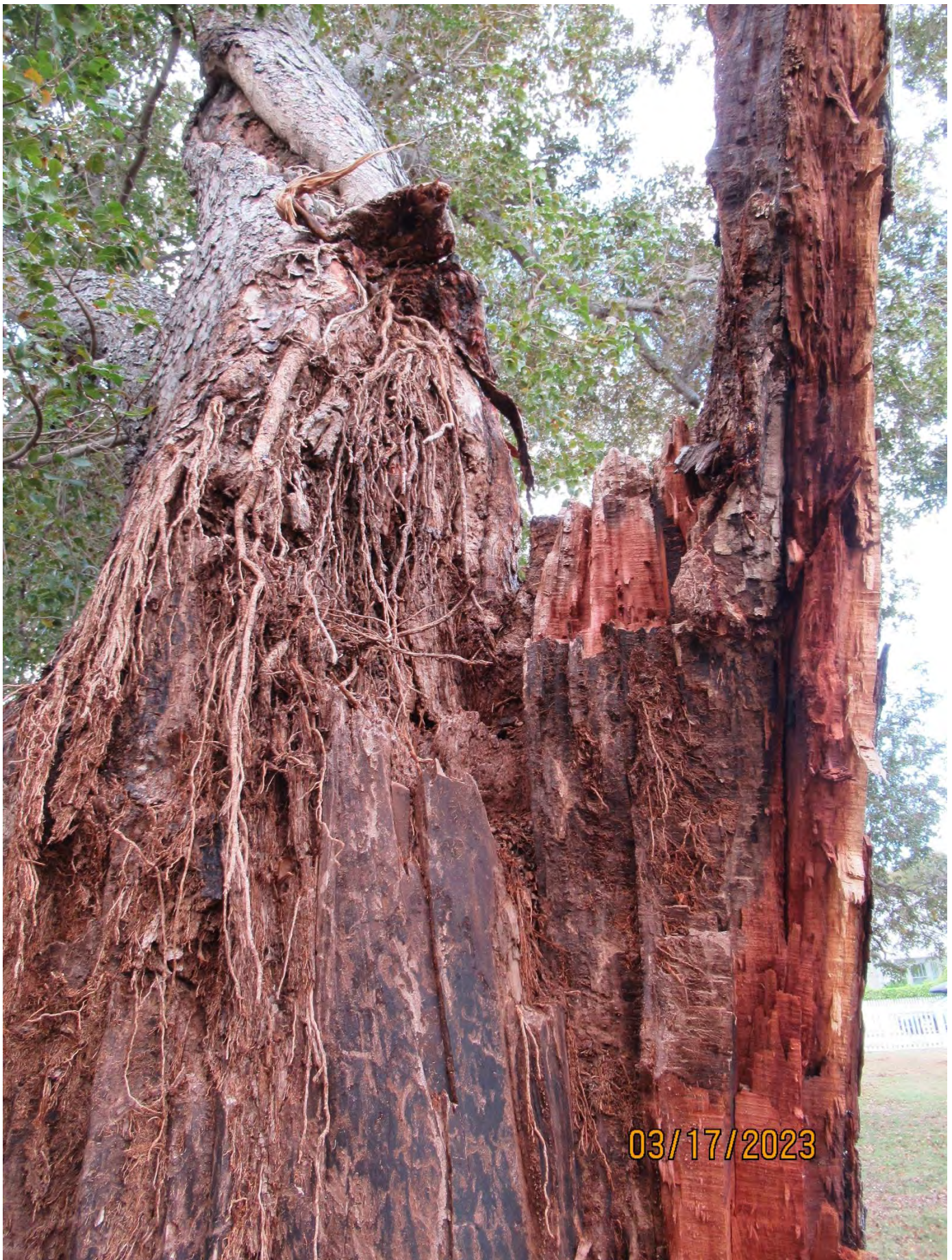
Photo looking at trunk/exposed heartwood area.