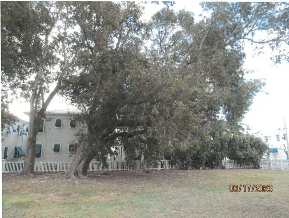
Photo of Mahogany trees to be trimmed.