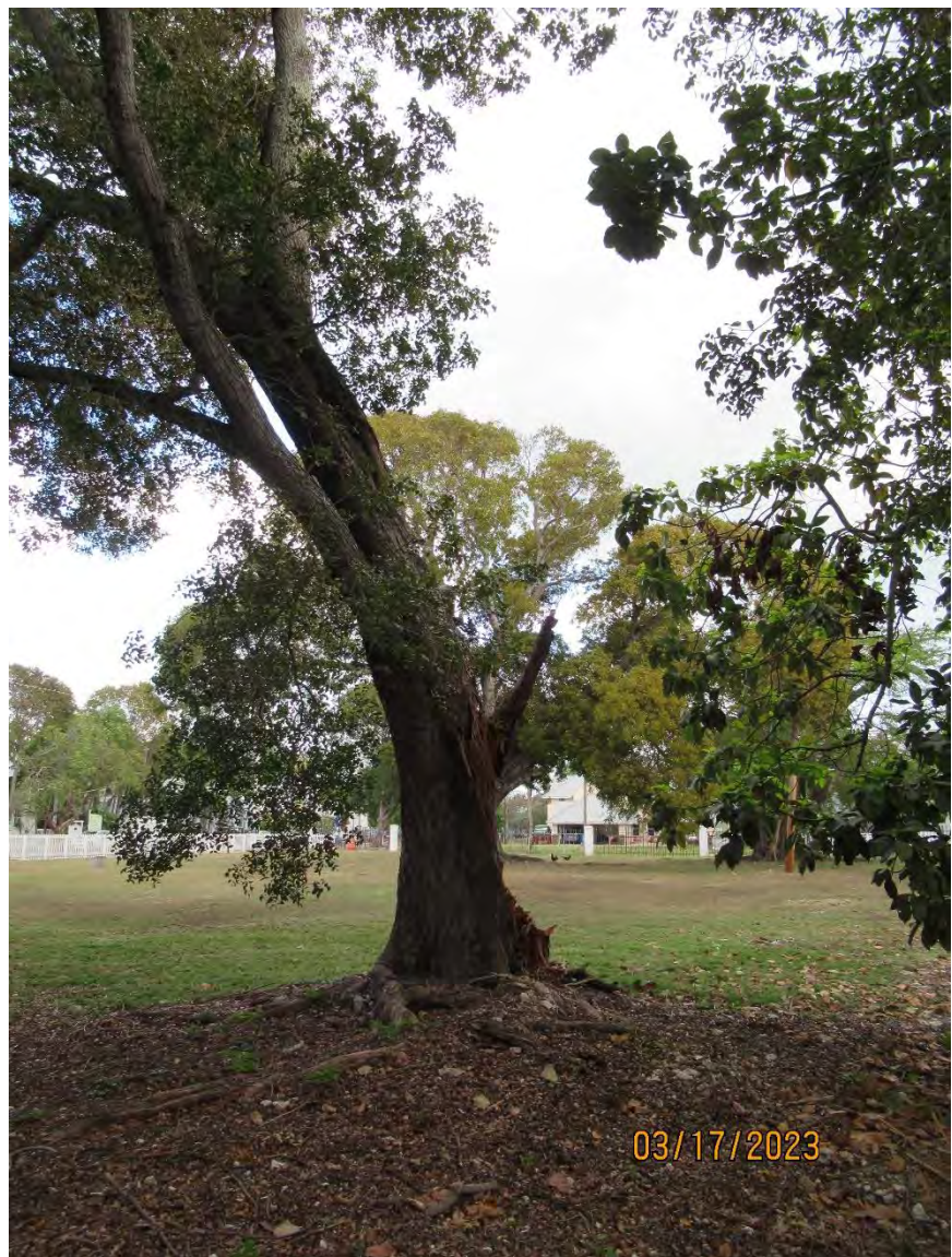
Photo of tree showing half of canopy/tree remaining, view 1.