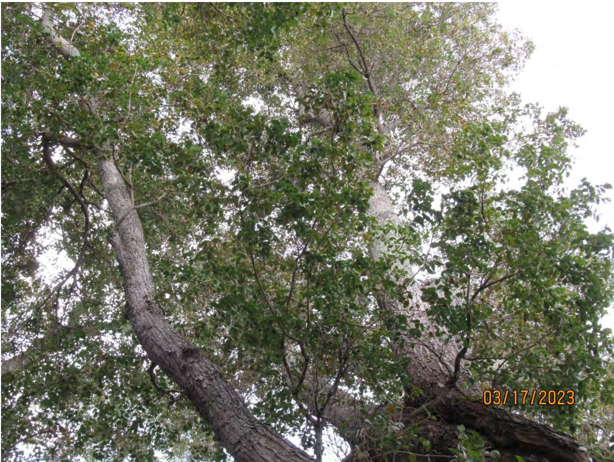
Two photos of remaining canopy, views 2 & 3.