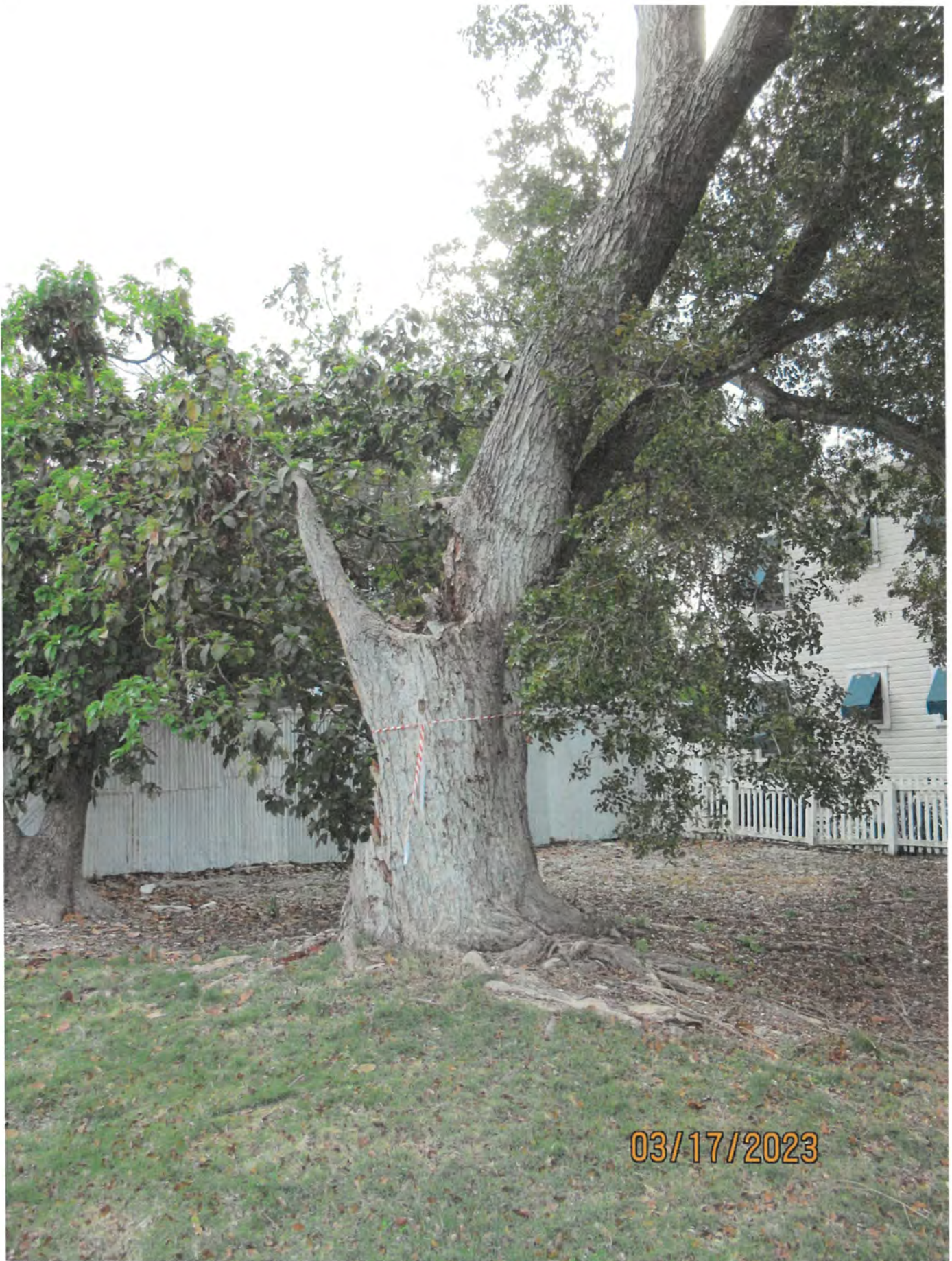
Photo showing half of canopy/tree gone.