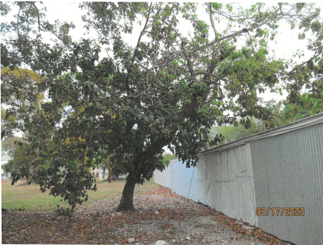
Avocado tree to be trimmed- lifted off structure.