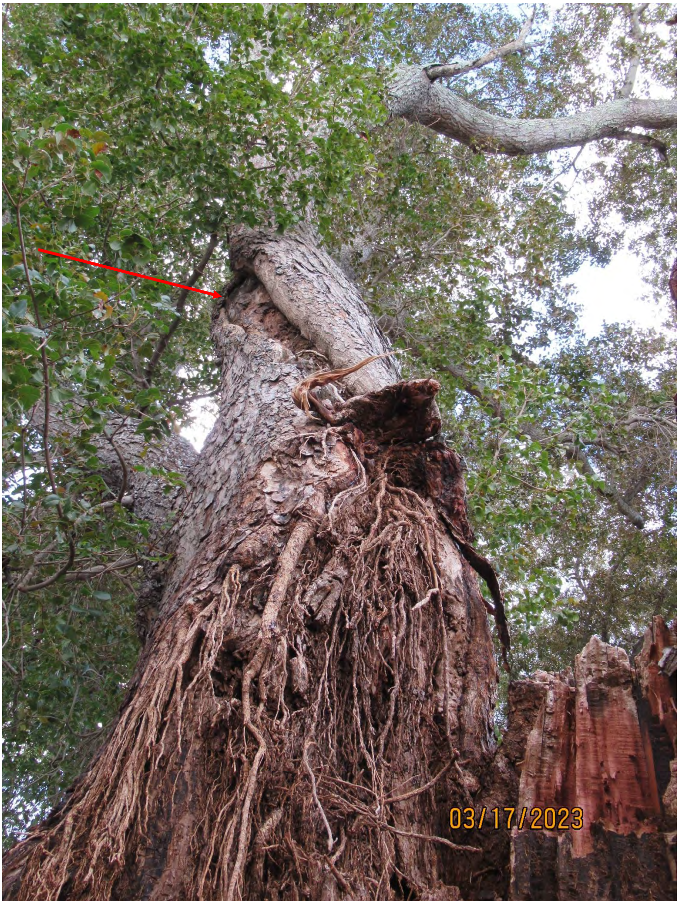
Photo of tear area looking up at remaining canopy trunks. Note decay in main canopy trunk.