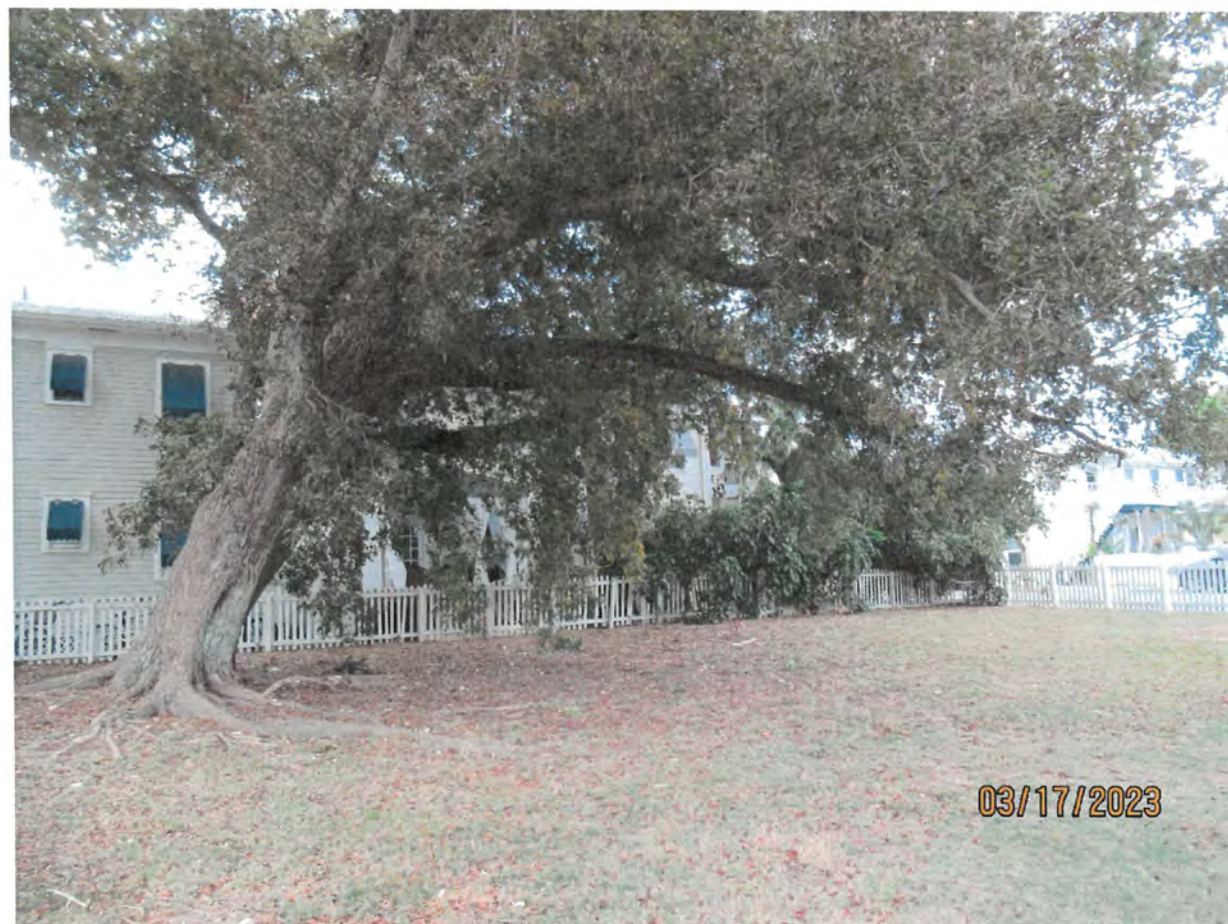
These two mahogany trees will be heavily trimmed to take weight off of lopsided canopy-large branch cuts.