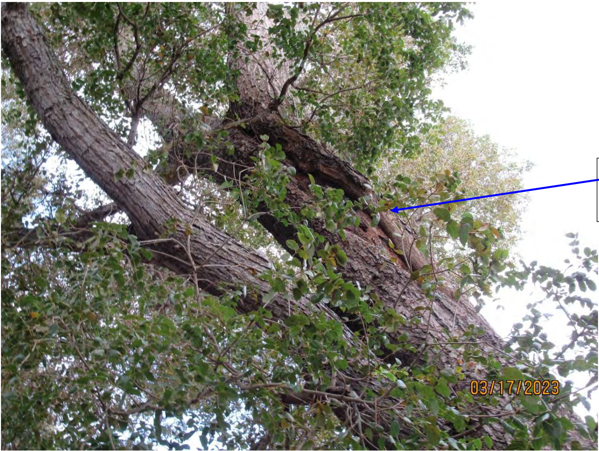
Large decay area in main canopy branch/trunk.