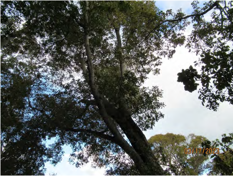
Photo of tree canopy, view 1.