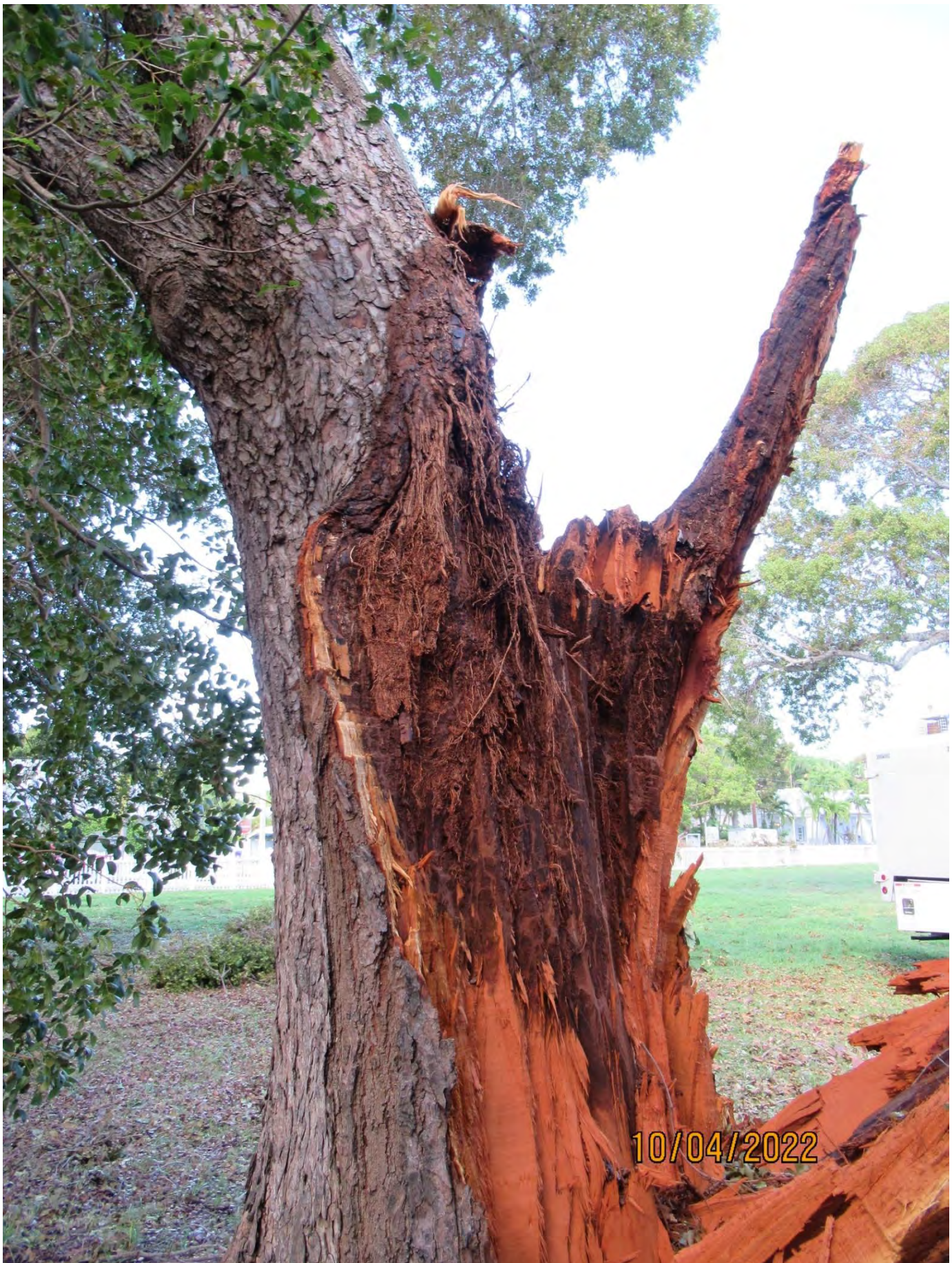
Close up photo of break area after Hurricane Ian.