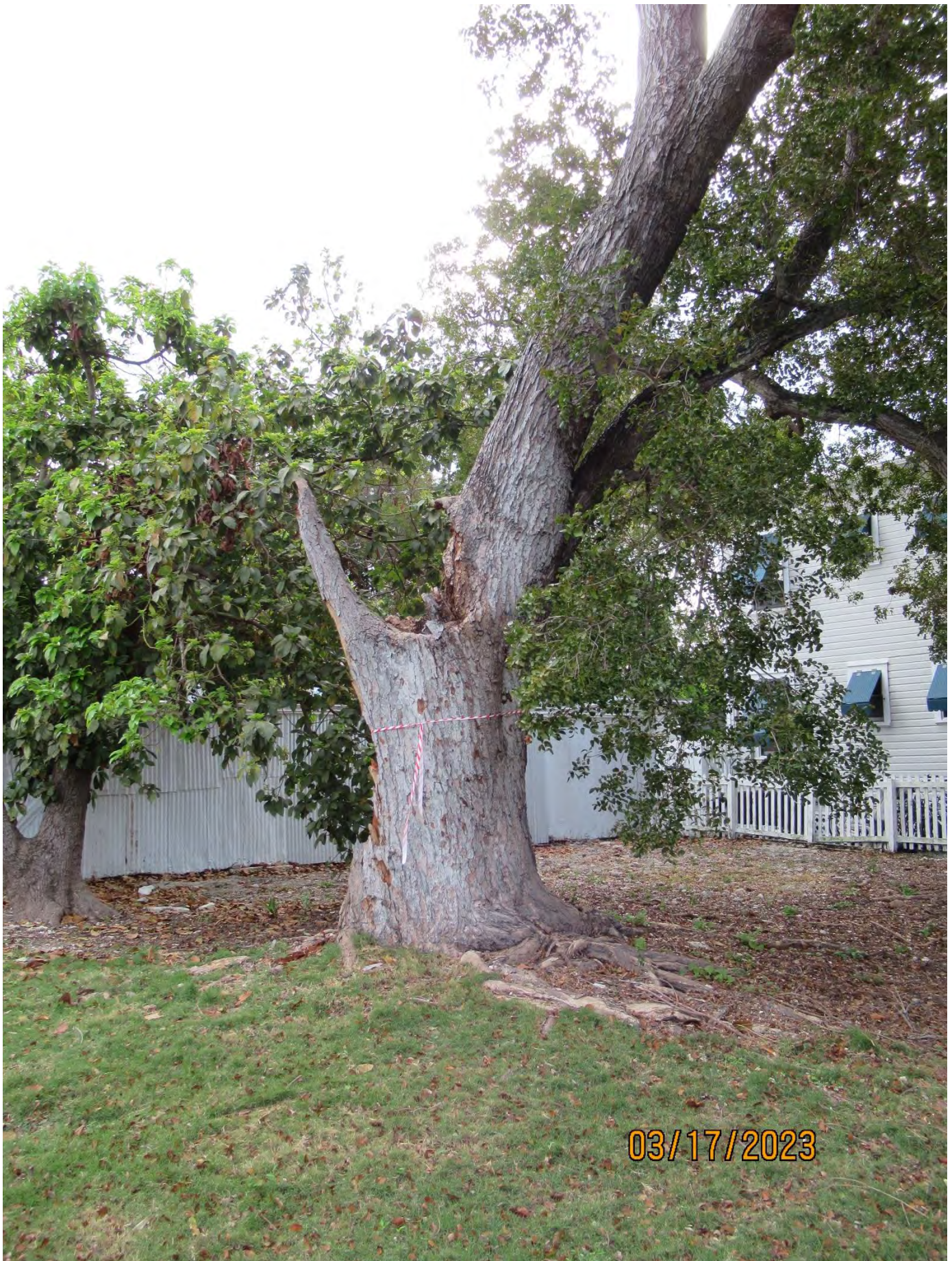
Photo of tree showing half of canopy/tree remaining, view 2.