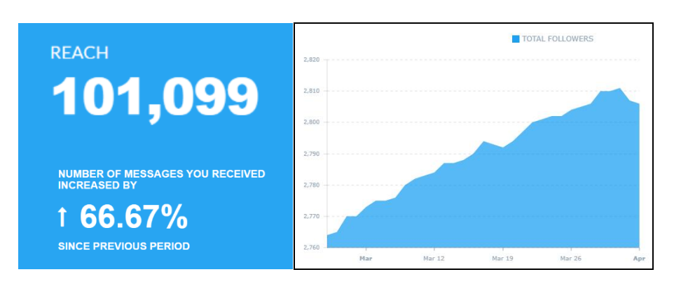
Twitter Follower growth - March 2023

(3/1/2023-4/2/2023) Reach: 101,099 people