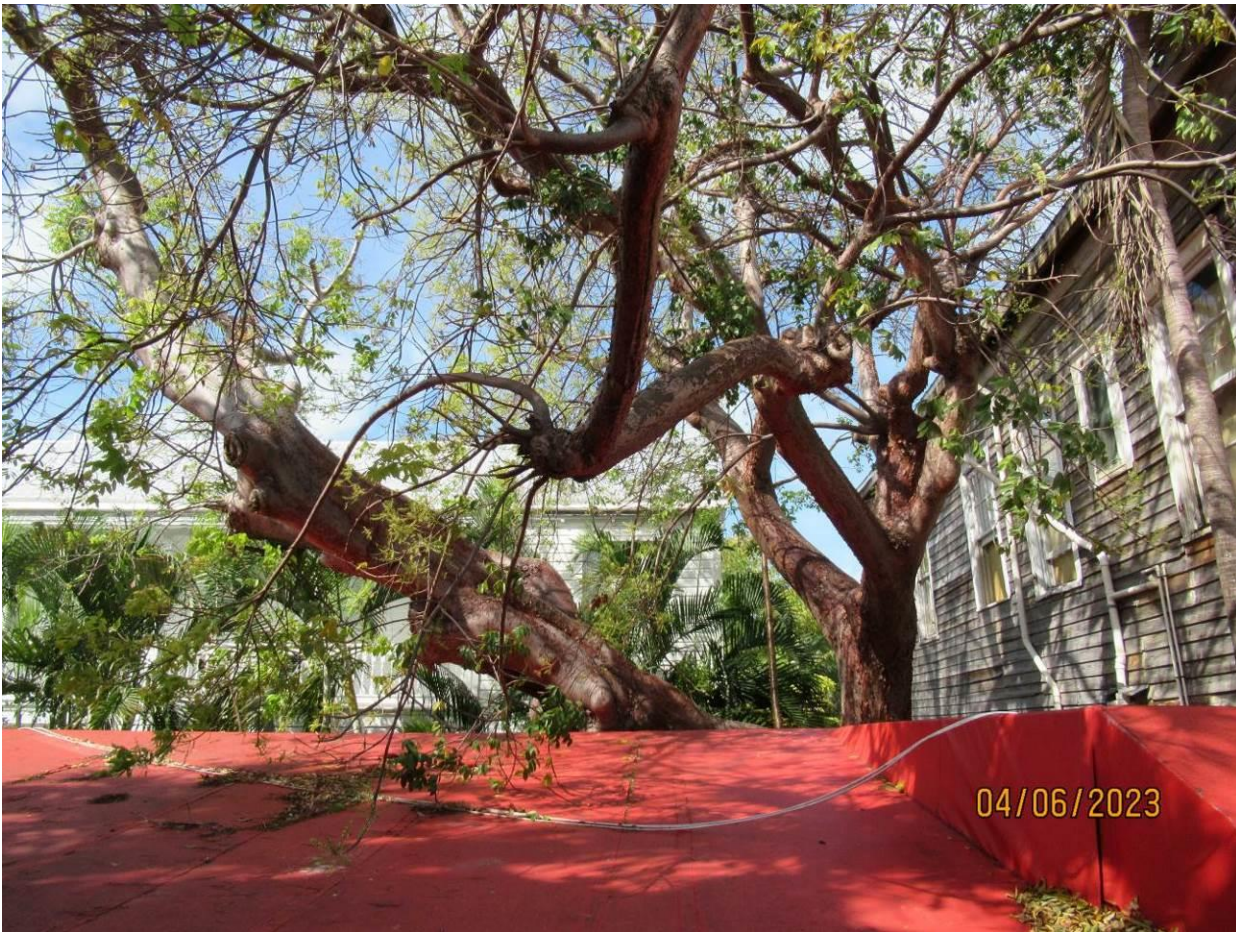
Two photos of tree canopy, views 3 & 4.