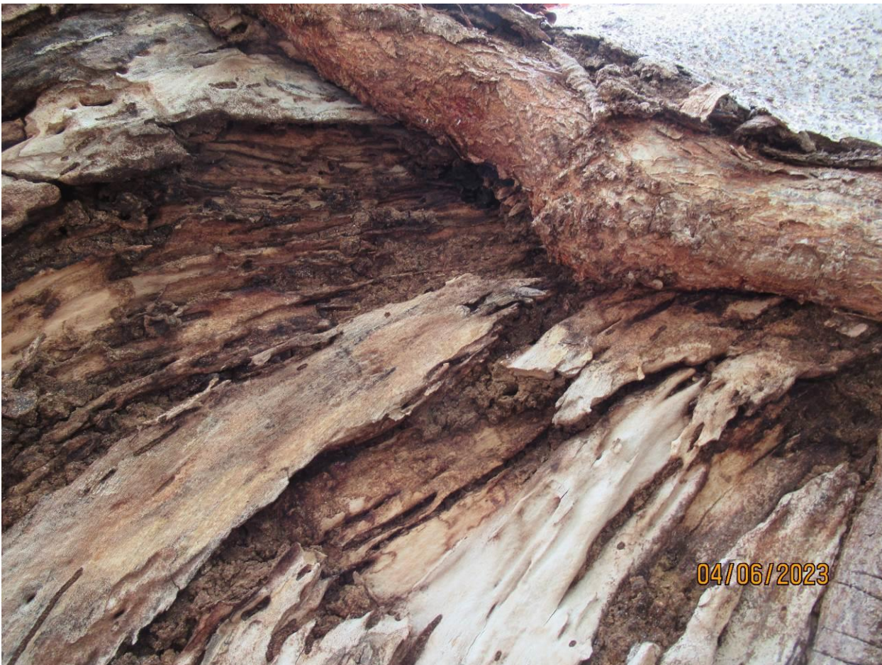
Close up photo of main trunk damaged area showing termite mud view 1.