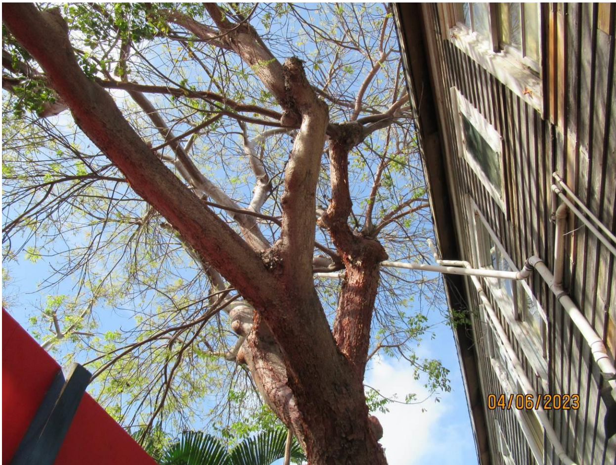
Photo of tree canopy, view 2.