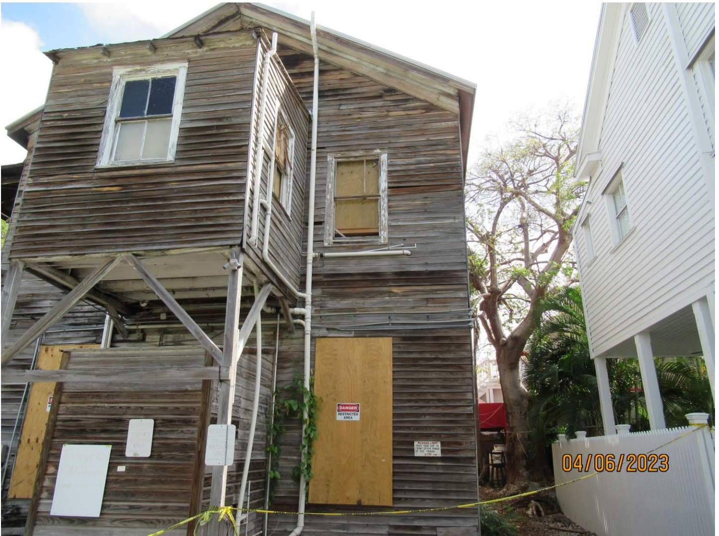
Photo showing location of tree, view 1.

Tree Species: Gumbo Limbo (Bursera simaruba)