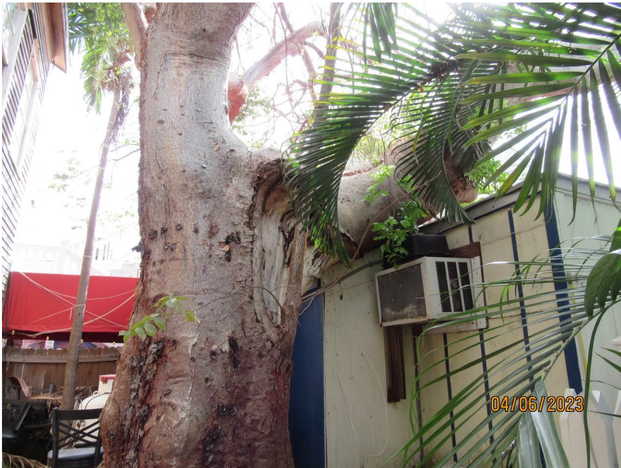
Photo of tree and canopy trunks, view 1.