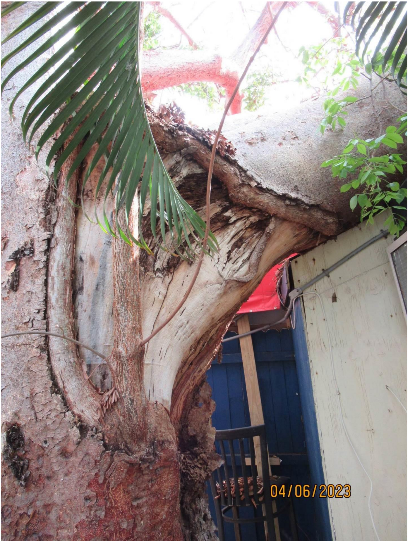
Close up view of old damaged/cut area in main trunk, view 1.