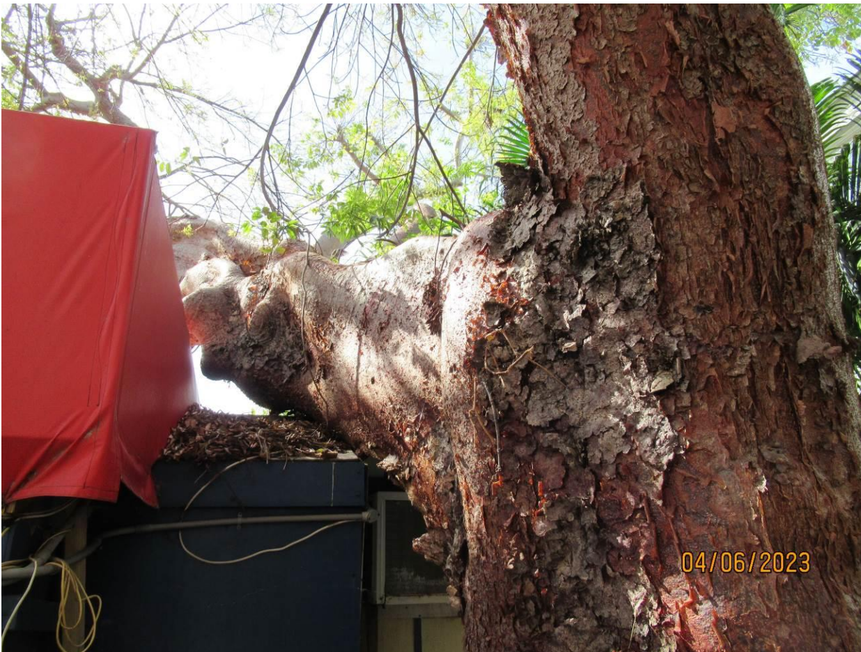
Two photos showing one main canopy trunk that is sitting on structure, views 3 & 4.