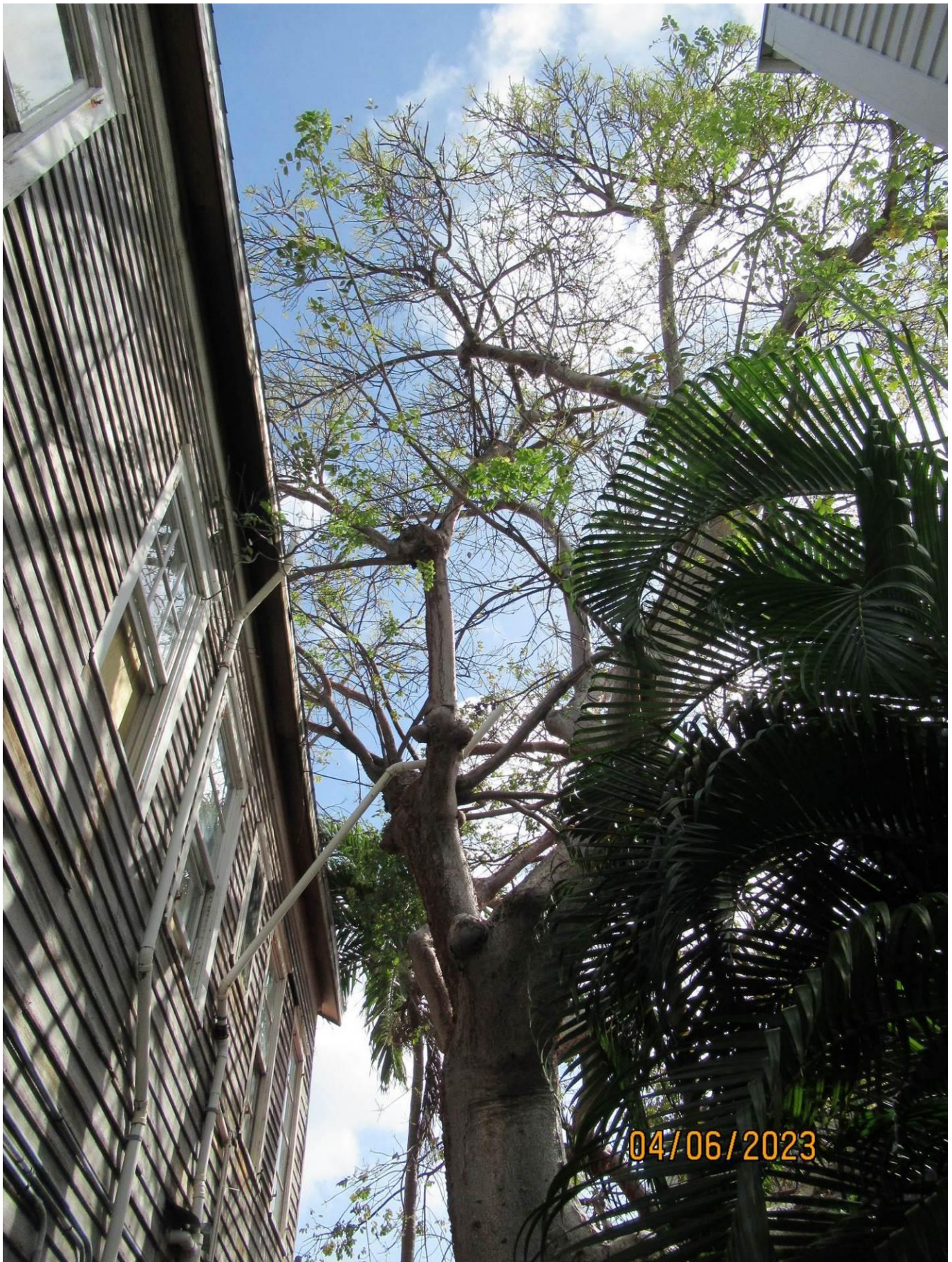
Photo of tree canopy, view 1.