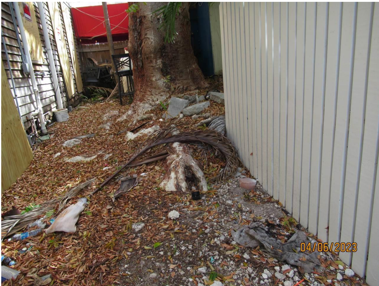
Photo of base of tree, view 1.