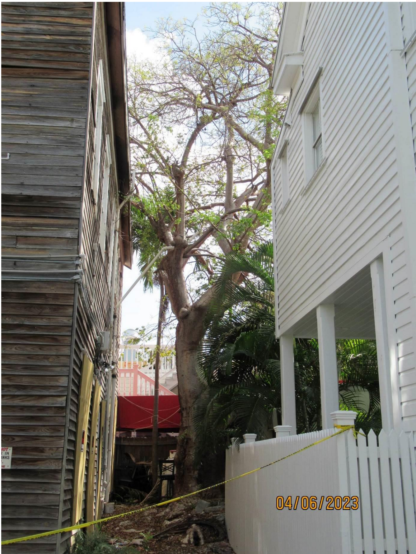
Photo of whole tree.