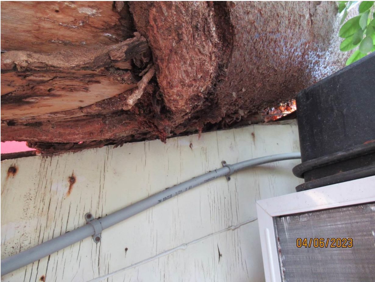
Close up photo of main trunk damaged area and trunk that is sitting on structure.