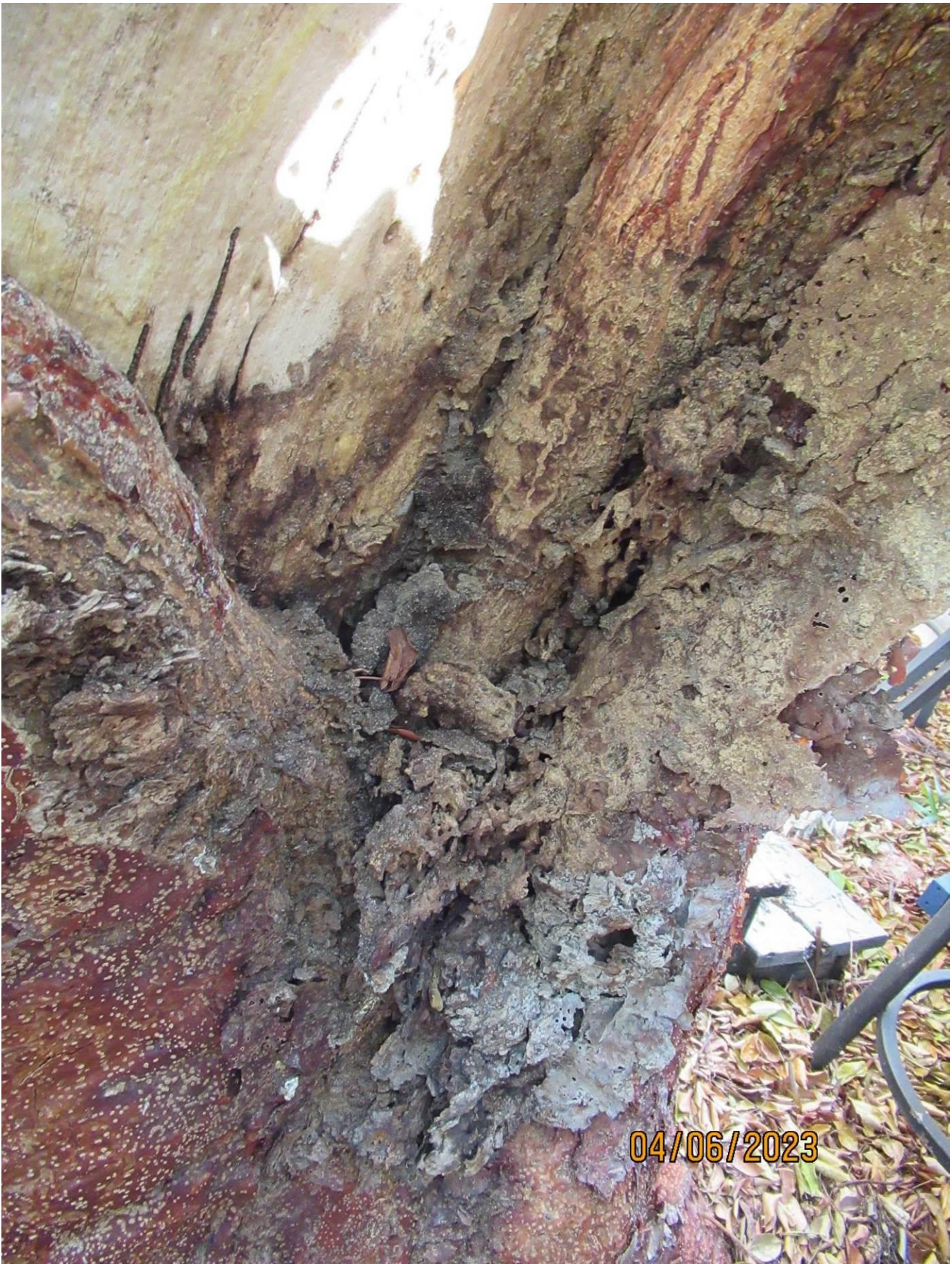
Close up photo of main trunk damaged area showing termite mud view 2.