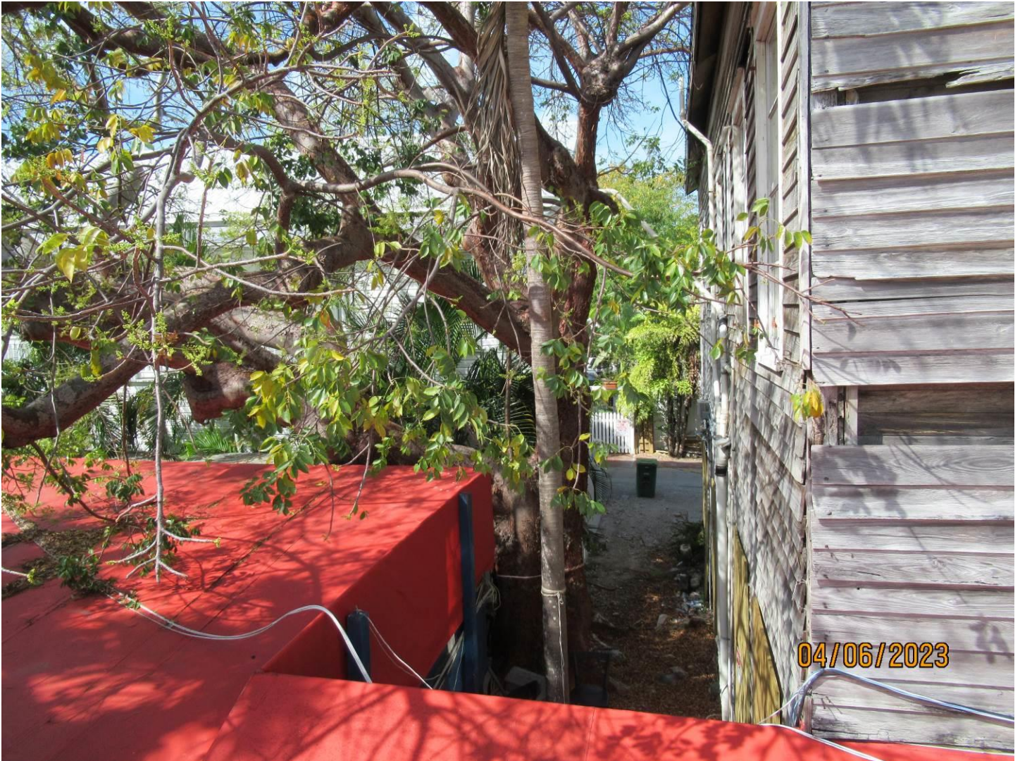
Photo of tree showing location, view 2.