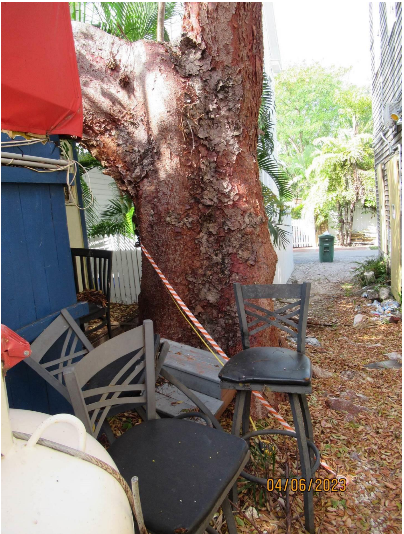
Photo of tree and canopy trunks, view 3.