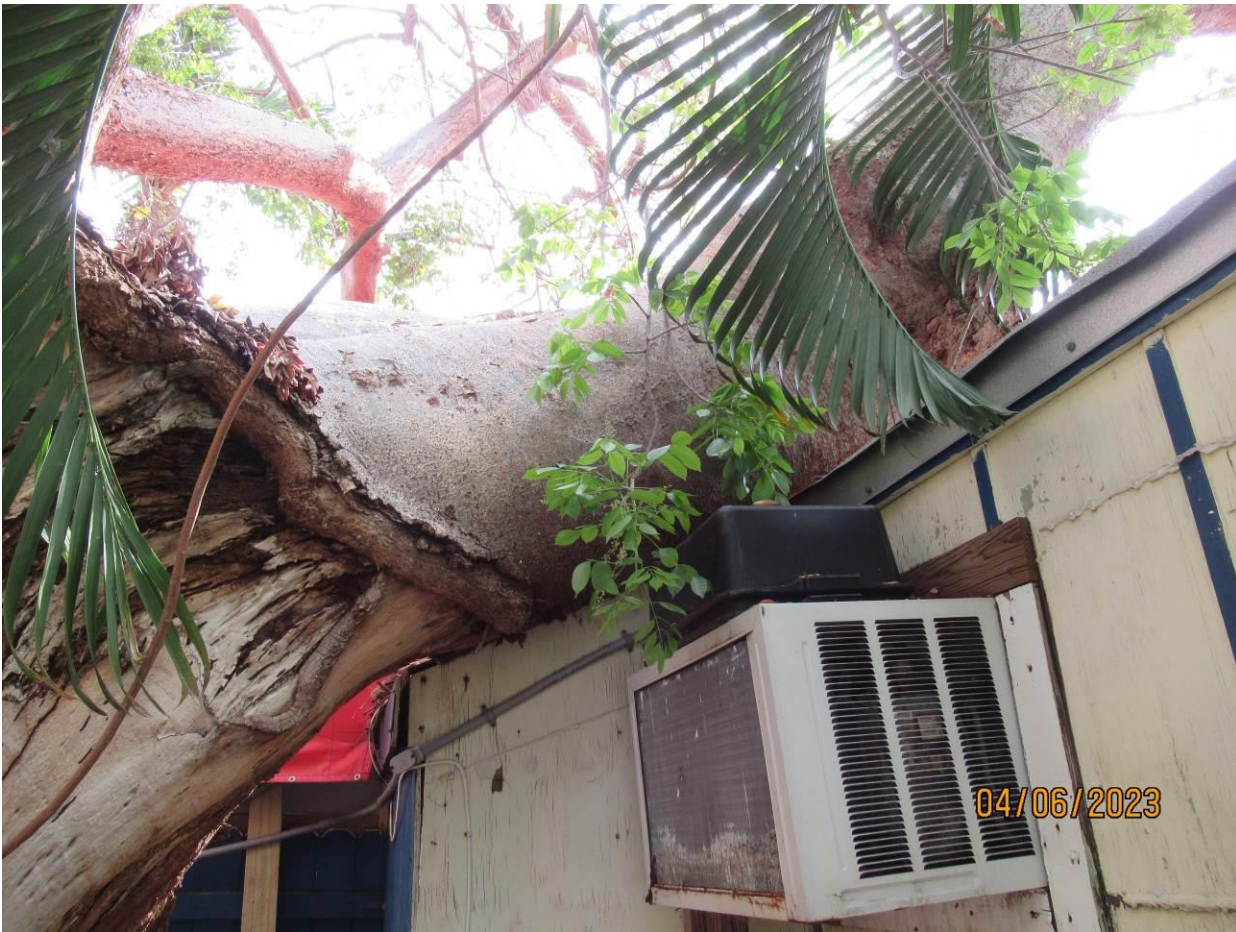
Two photos showing one main canopy trunk that is sitting on structure, views 1 & 2.