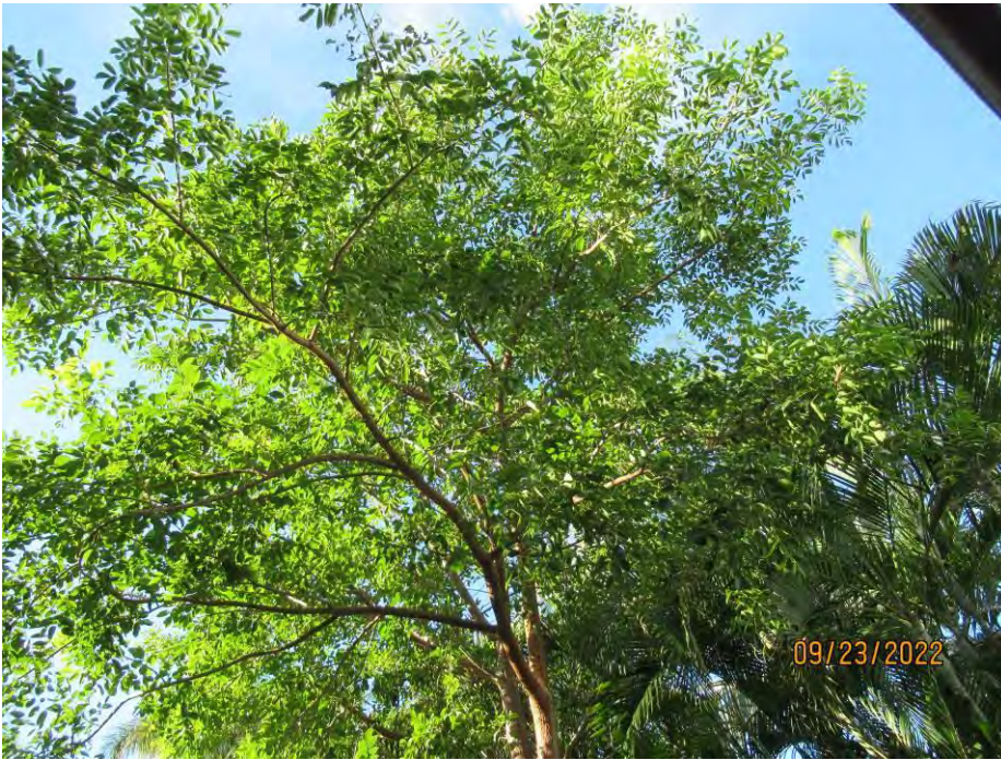
Photo of Gumbo Limbo tree prior to demolition of house.

The Gumbo Limbo tree was not measured at the time of initial inspection for the demolition permit. Based on the photos and personal experience measuring trees, it appears that the Gumbo Limbo tree was approximately 8 inches in diameter.