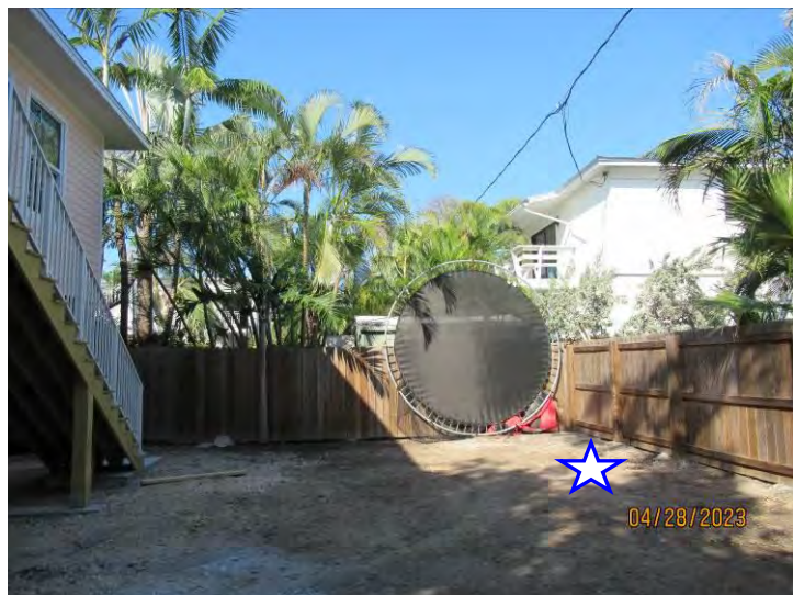
Location of missing Mango tree