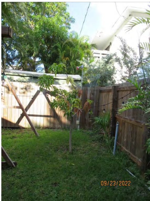
Photo of mango tree prior to demolition and Hurricane Ian.