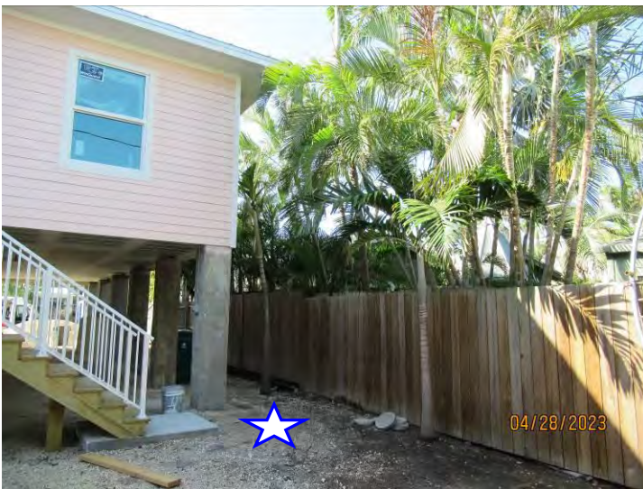
Location of missing Gumbo limbo tree.

A subsequent inspection of the property documented that a silver buttonwood tree (tree #2 on map) and a mango tree (tree #10 on map) were also missing. Information received from the property owner indicates that the mango tree died. A permit is not required to remove a dead tree.