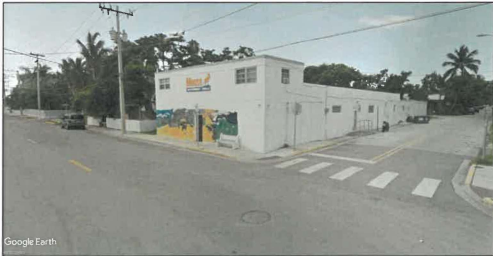
Photo depicts Google Street view of the northeastern portion of the property.