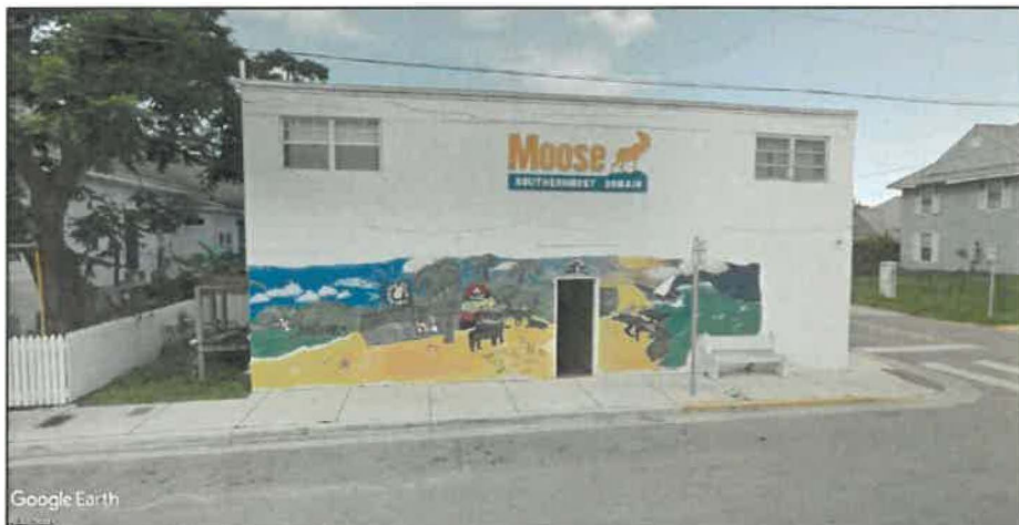
Photo depicts Google Street view of the façade of the historic structure.

Additionally, although the area is not included within the requested easement area, the Planning Department suggests that it be a condition of the easement agreement that the property owner upkeeps the side yard adjacent to the requested easement area, including mowing or weed whacking any overgrowth that could pose a threat to the health, safety, or general welfare of nearby residents.