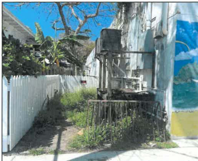
Photo depicts the eastern portion of the property, such area includes the aforementioned wooden deck, utility meters, AC units, and fenced-in side yard.