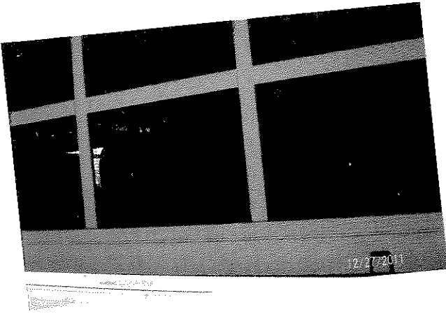
1101 Simonton Case # 11-1548