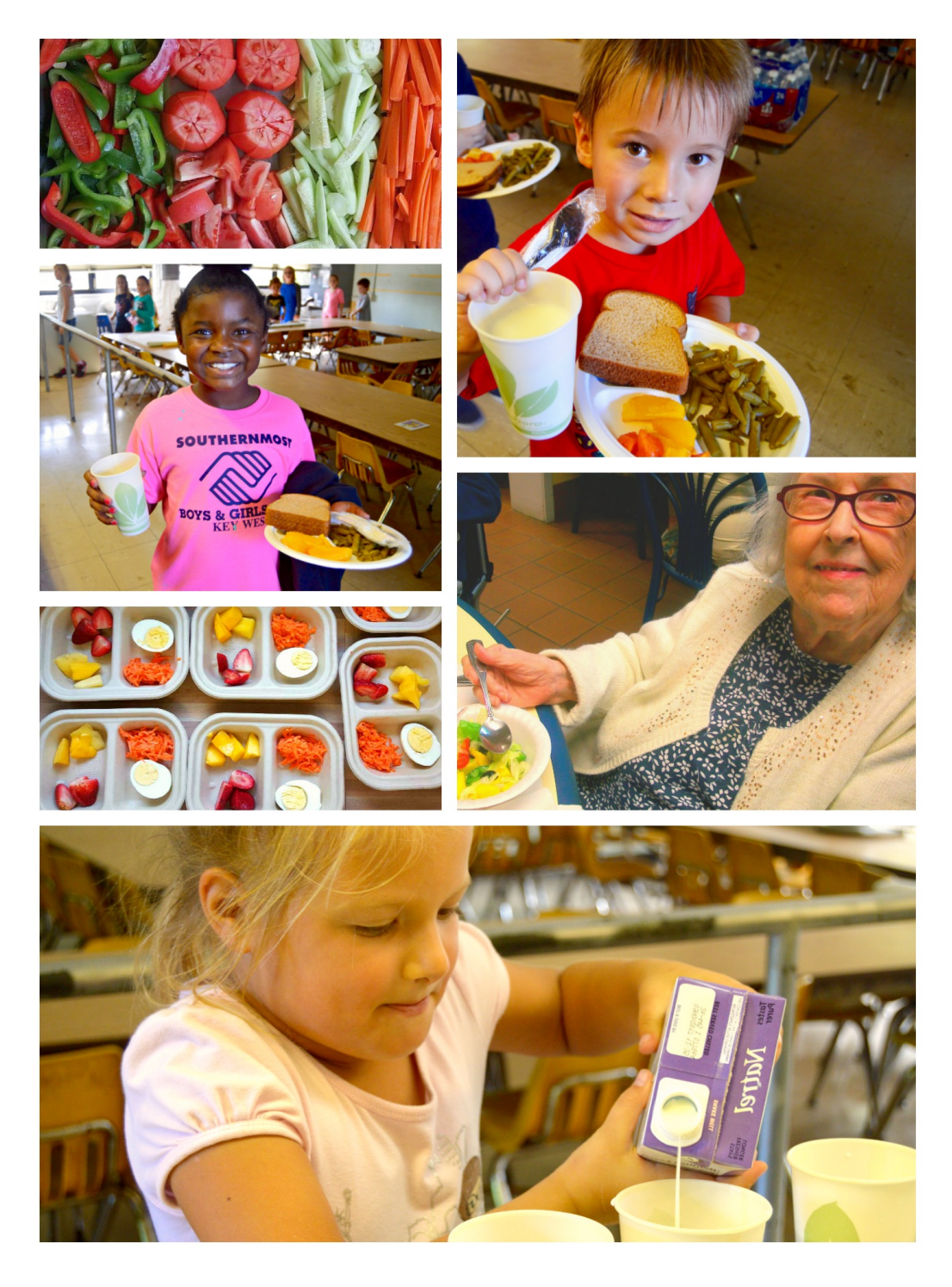
The Star of the Sea Foundation