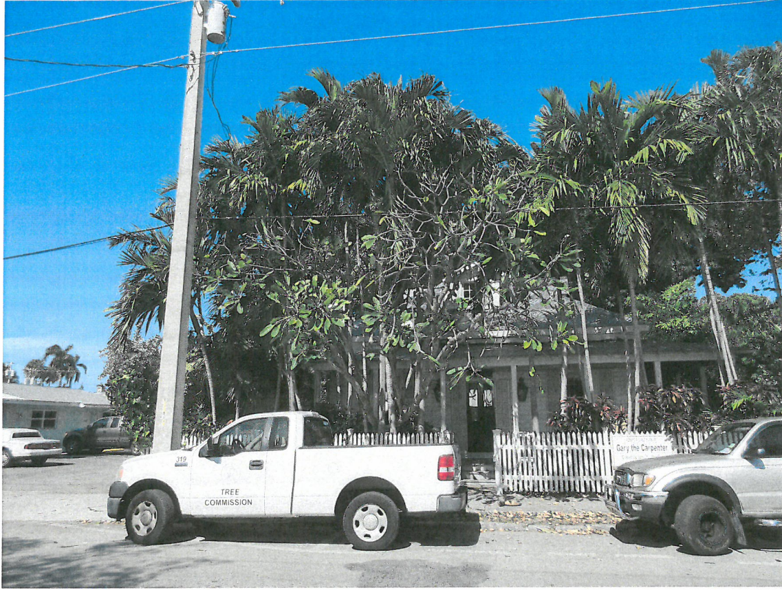
Above photo taken February 3, 2017.