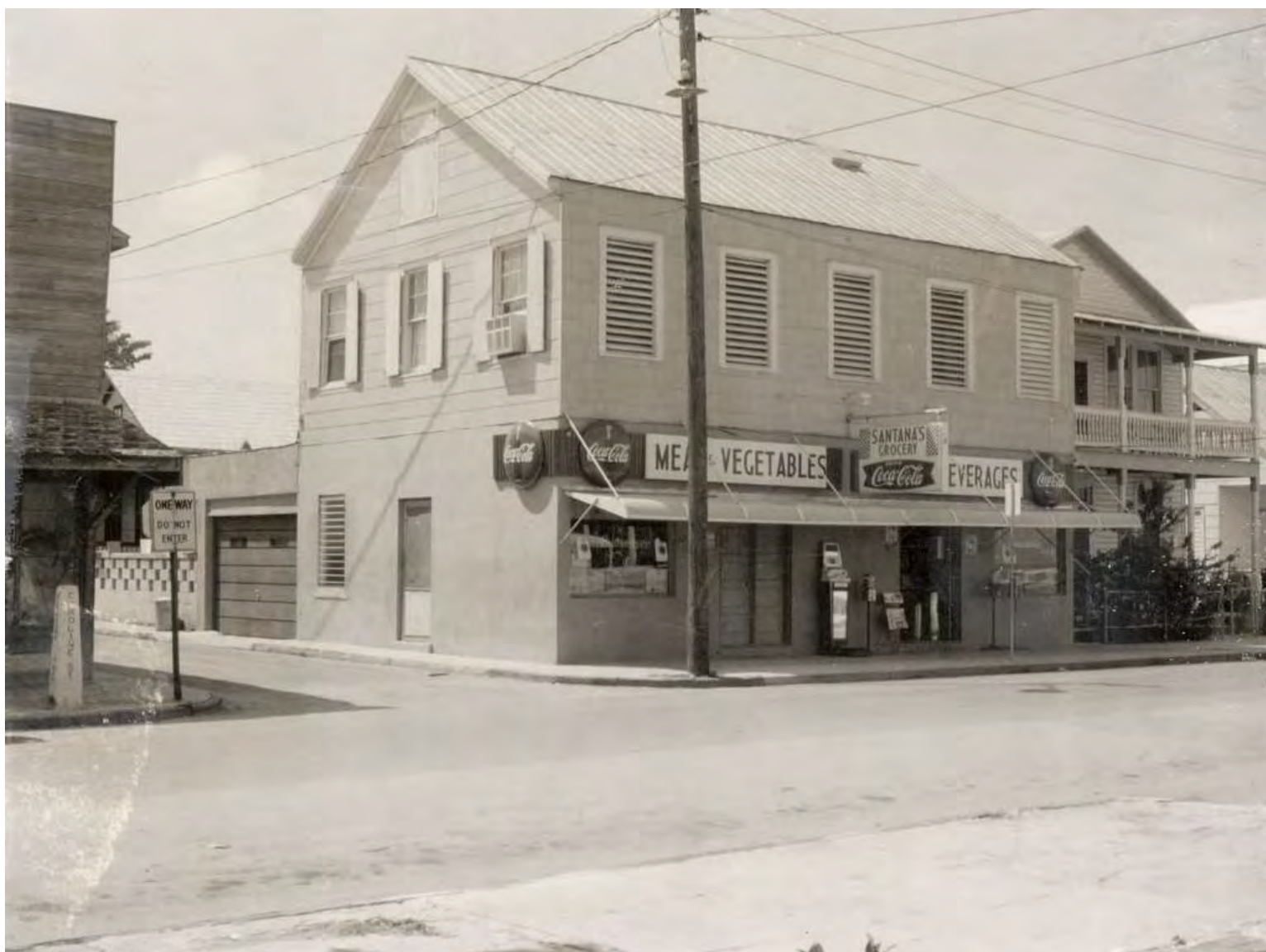
1965- 712 Caroline Street