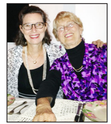
Arts Trip to Cuba 2014