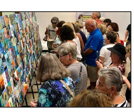
Opening night at Nelson Government Center in Key Largo

We are grateful to our Business Partner, Royal Furniture, for its continued support.