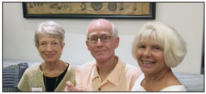
Holiday Membership Party 2015