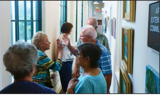
Exhibit in the Gato 2017