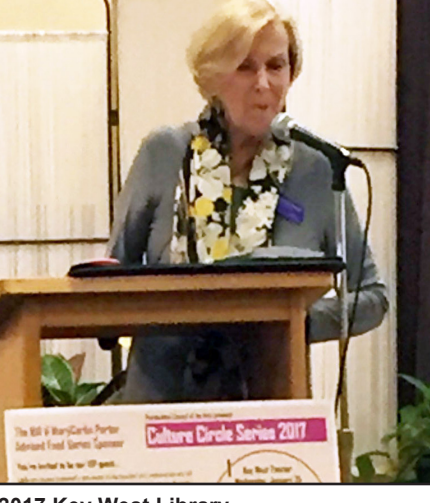
2017 Key West Library

Another wonderful afternoon in an unique setting sharing the creative process of talented artists. We learned so much about Crane Point and enjoyed the plein air paintings by the Watercolor Society members.