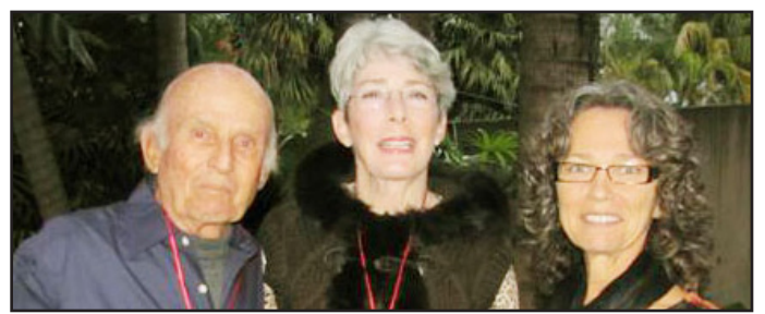
Cultural Umbrella Committee Members 2010