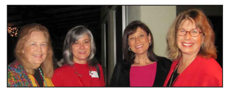
Holiday Membership Party 2010