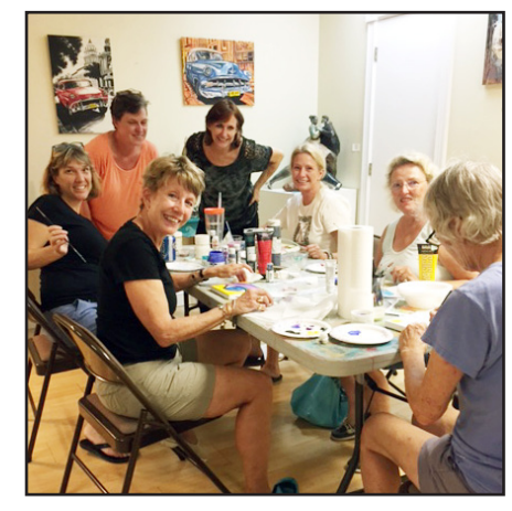
Workshop at Stone Soup Gallery

The project raises awareness for the Council. as it connects artists to one another. The work is outstanding and reflects the beauty and uniqueness of the Keys.