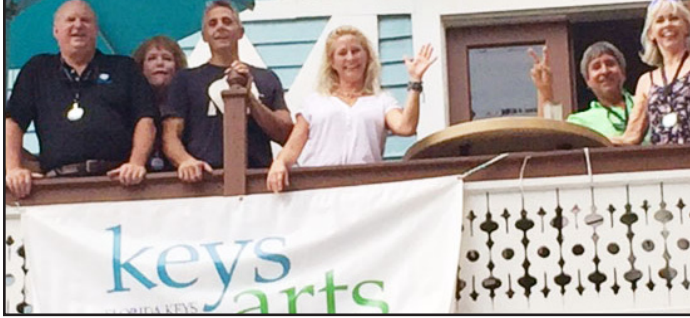
Culture Crawl 2015