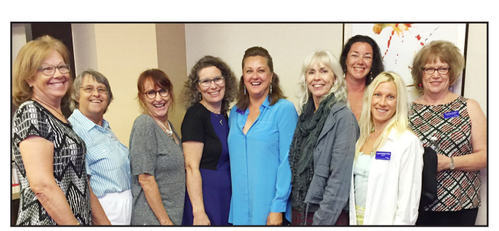
Board Retreat 2016