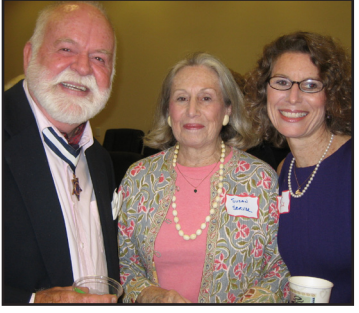
Art in Public Buildings Opening 2010 Connections Project 2016