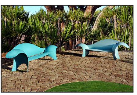
2016 Marathon Court House

Stock Island Fire Station 2014 Marathon Courthouse 2016