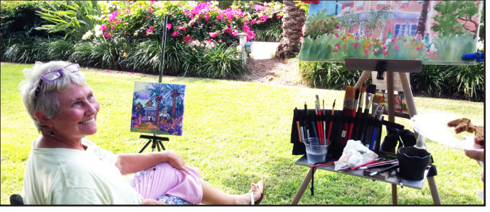
Membership Brunch 2016