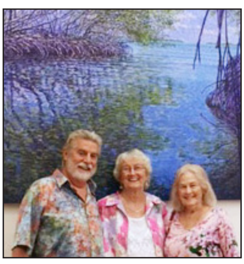
2009 Nelson Government Center in Key Largo