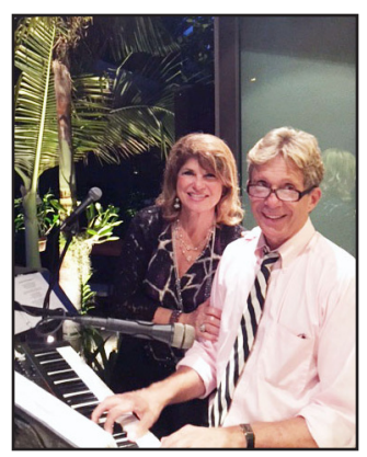
Holiday Party 2015