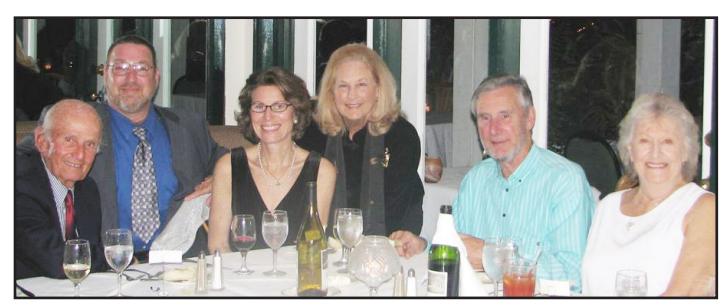
Membership Soiree 2009