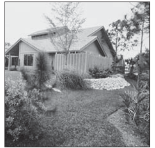
A Florida-friendly yard

Buccaneer or Sargent's palm ( Pseudophoenix sargentii ) Cabbage palm ( Sabal palmetto ) Coontie ( Zamia pumila ) Paurotis/Everglades palm ( Acroelorrhaphie wrightii ) Queen sago ( Cycas circinalis ) Royal palm ( Roystonea elata ) Saw palmetto ( Serenoa repens ) Thatch palm ( Thrinax spp.)