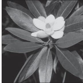
Sweet bay magnolia

Bald cypress ( Taxodium distichum ) Dahoon holly ( Ilex cassine ) Geiger tree ( Cordia sebestena ) Gumbo Limbo ( Bursera simaruba ) Ironwood ( Krugiodendron ferreum ) Live oak ( Quercus virginiana ) Magnolia, southern ( Magnolia grandiflora ) Magnolia, sweet bay ( Magnolia virginiana ) Myrsine ( Rapanea guianensis ) Paradise tree ( Simarouba glauca ) Pigeon plum ( Coccoloba diversifolia ) Red bay ( Persea borbonia ) Red maple ( Acer rubrum ) Sea grape ( Coccoloba uvifera ) Silver buttonwood ( Conocarpus erectus var. sericeus ) Simpson's stopper ( Myricanthes fragrans ) Slash pine ( Pinus elliotii ) Southern red cedar ( Juniperus silicicola ) Trumpet tree ( Tabebuia spp.)