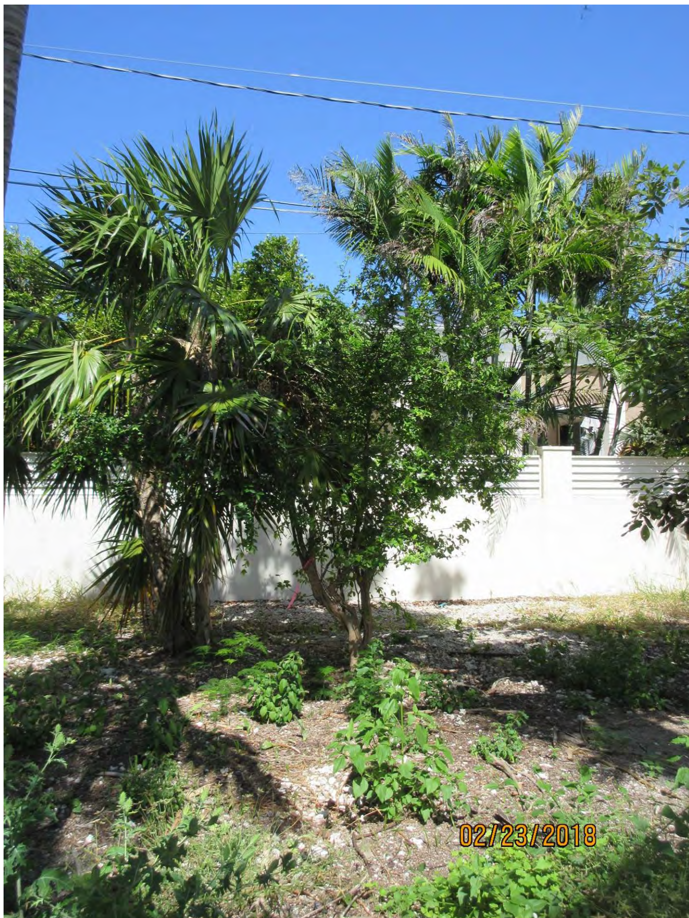
Tree Species: Surinam Cherry ( Eugenia uniflora )