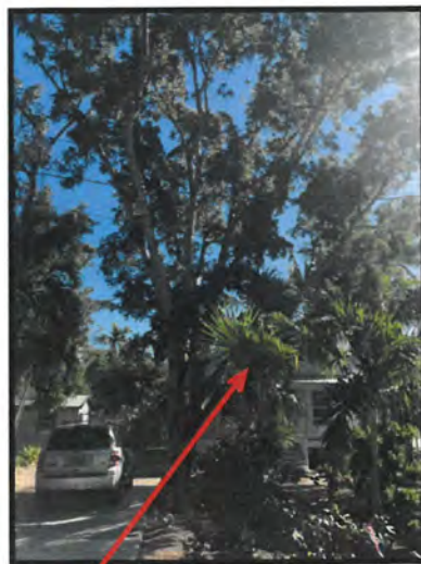
Fl. Thatch in Mahogany root mass