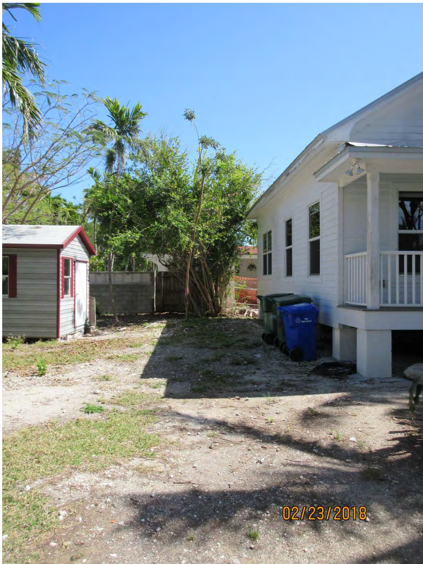
Tree Species: Gumbo Limbo ( Bursera simaruba )