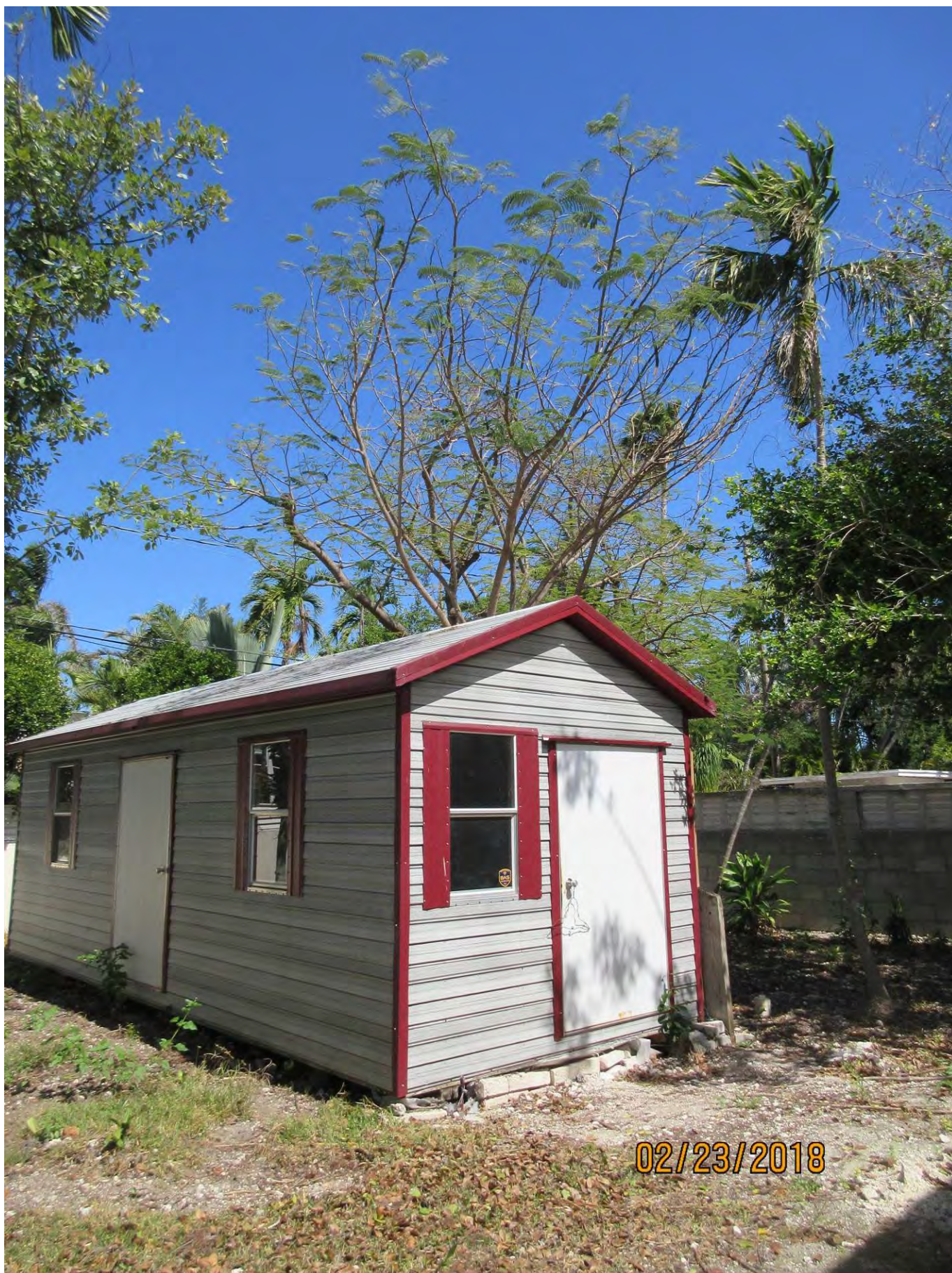
Tree Species: Royal Poinciana (Delonix regia)