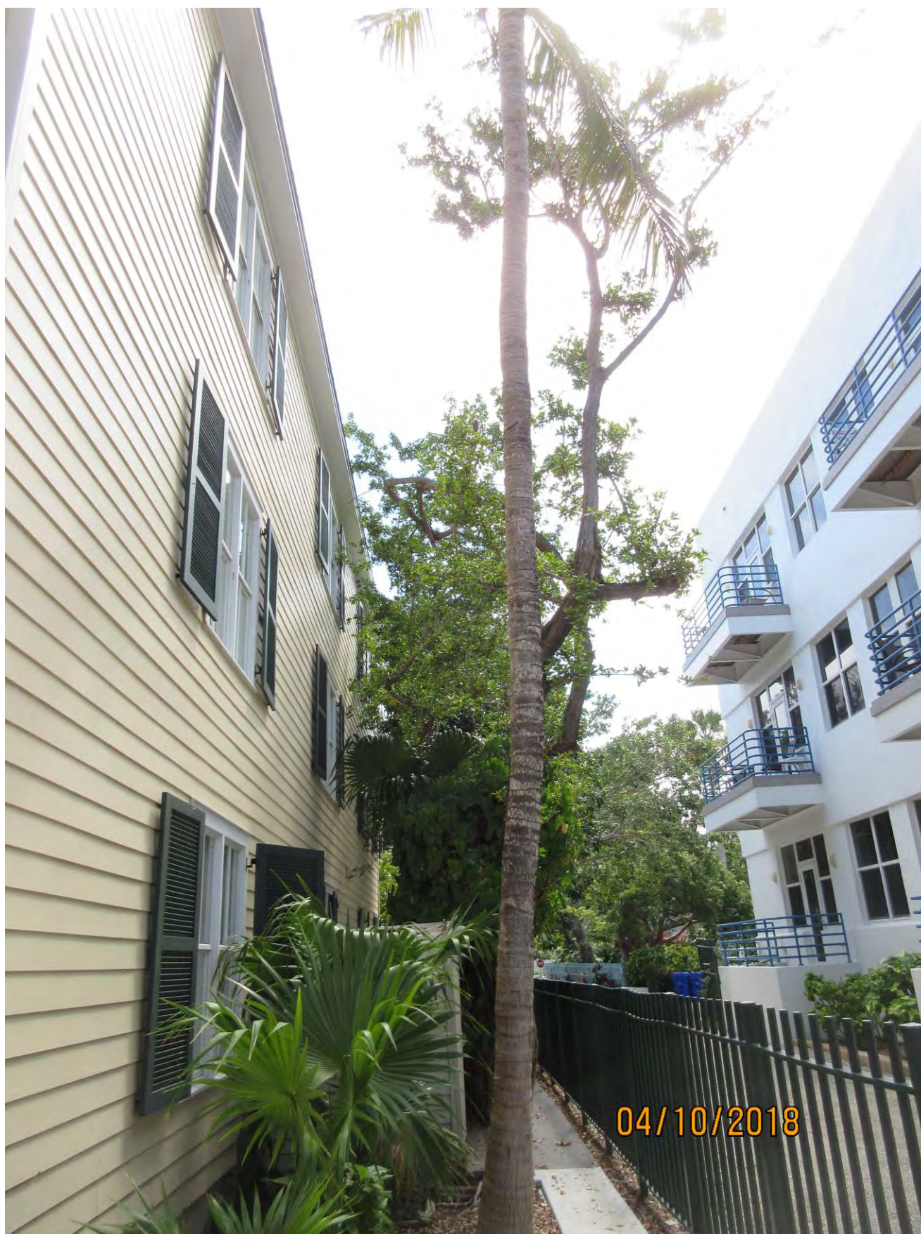
Tree Species: Green Buttonwood ( Coconcarpus erectus )