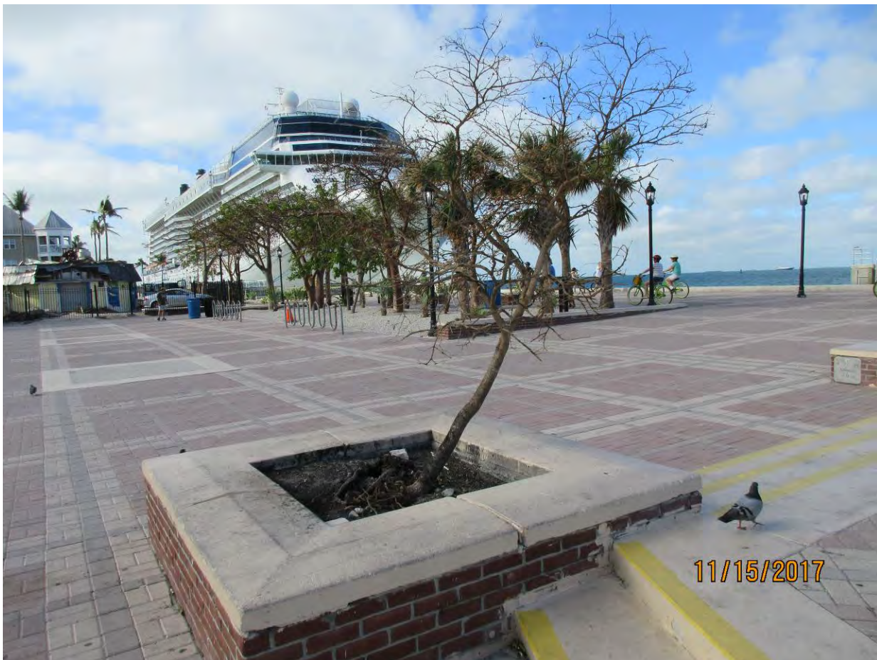
November 2017 photo showing dead tree.