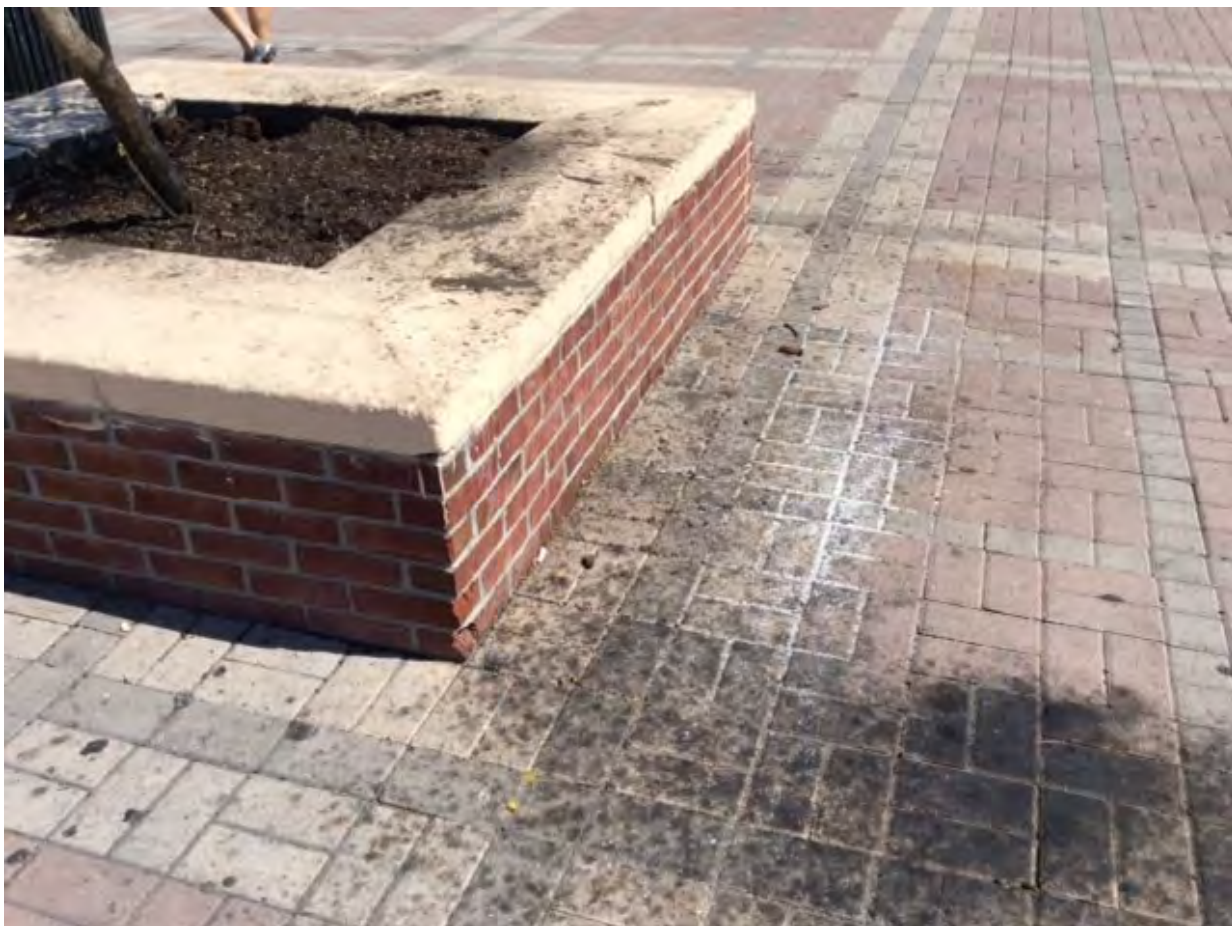
Undated photo showing grease.