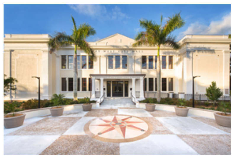
Figure 1# 1. Front Entrance - retaining wall