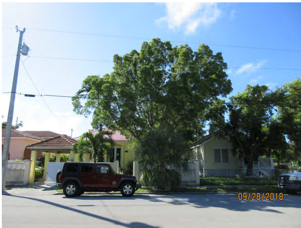
Tree Species: Mahogany (Swietenia mahagoni)