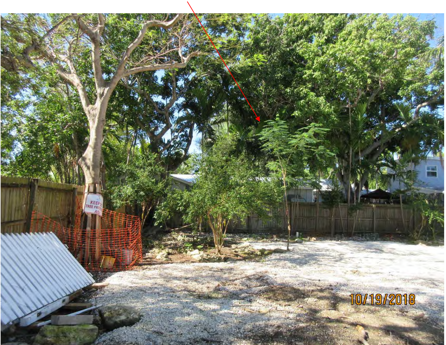
Tree #26X: Royal Poinciana (Delonix regia)

Value x Diameter = 2.6 replacement caliper inches