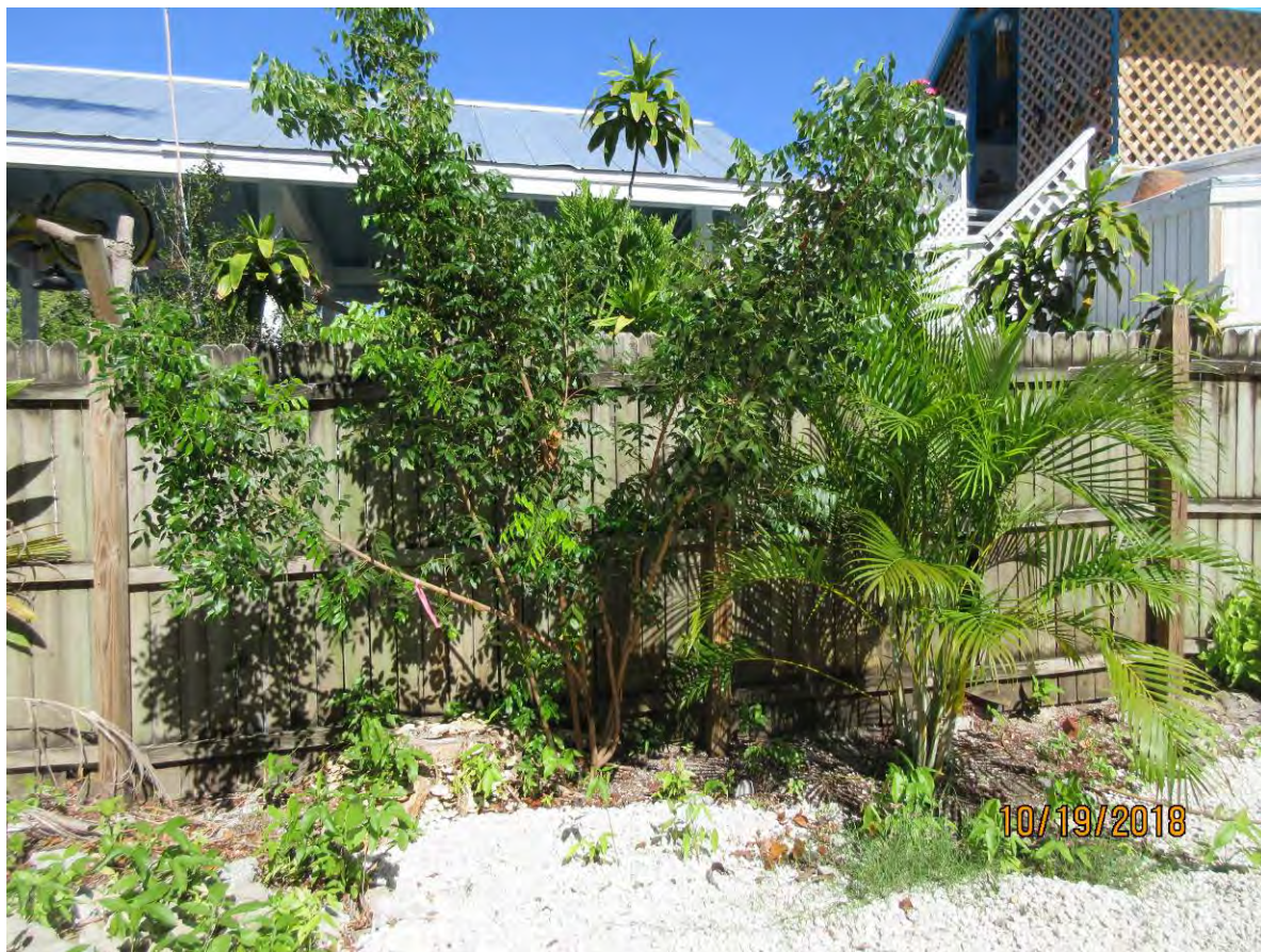
Tree #12X: Mahogany (Swietenia mahagoni)