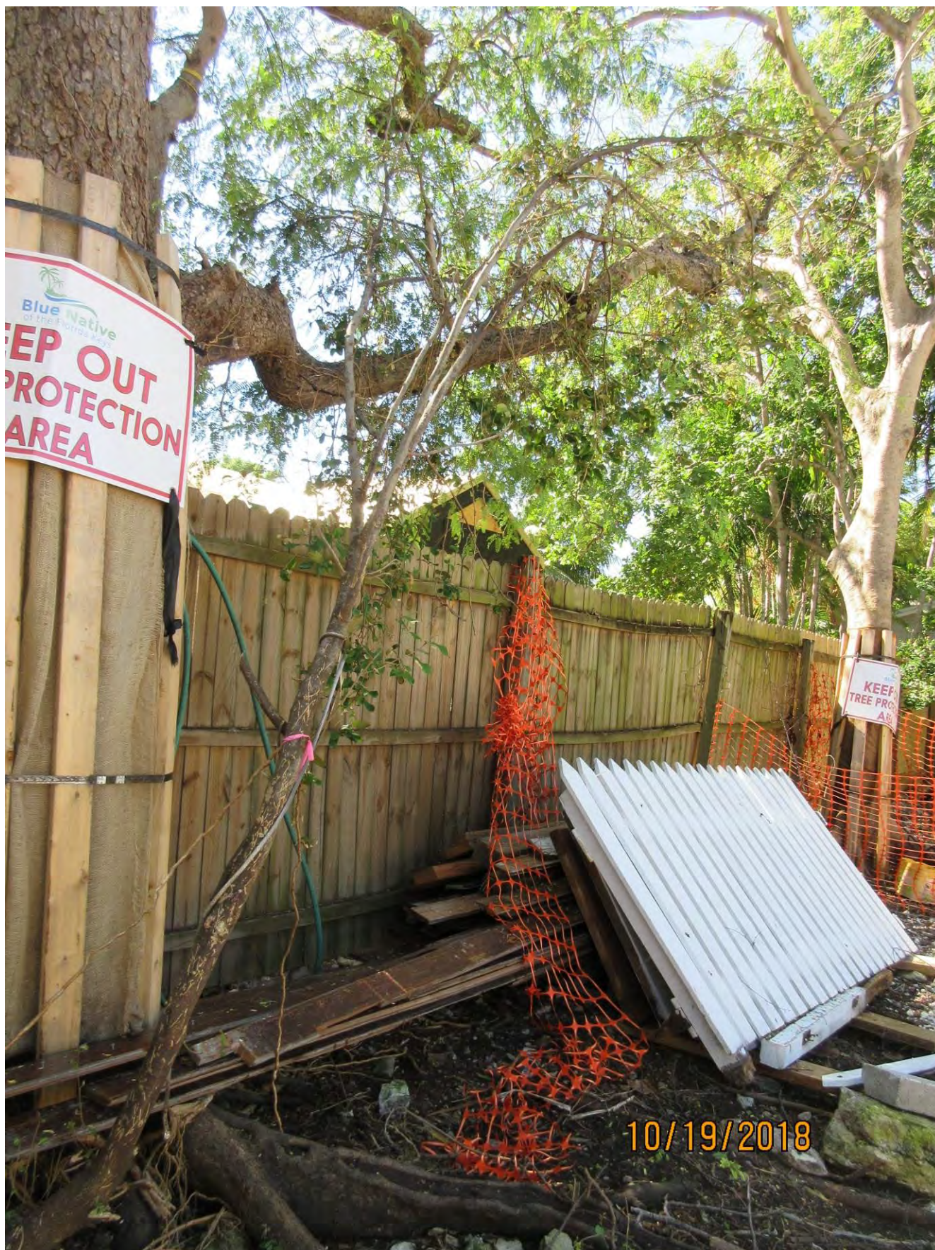
Tree #28X: Jamaican Caper ( Capparis cynophallophora )