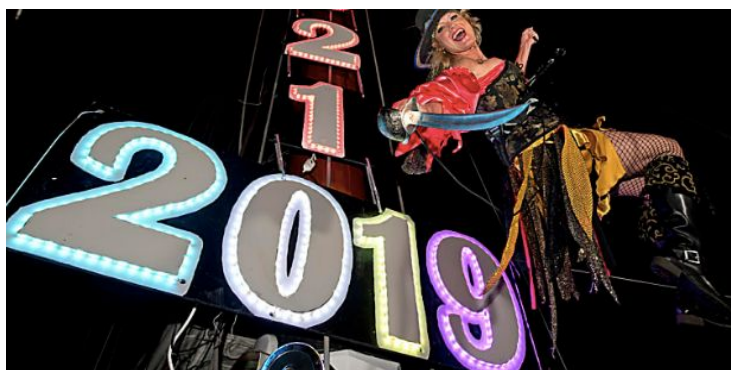
Unique "Drops" Highlight Key West New Year's Eve

The following media/press clippings were captured during the month of December: