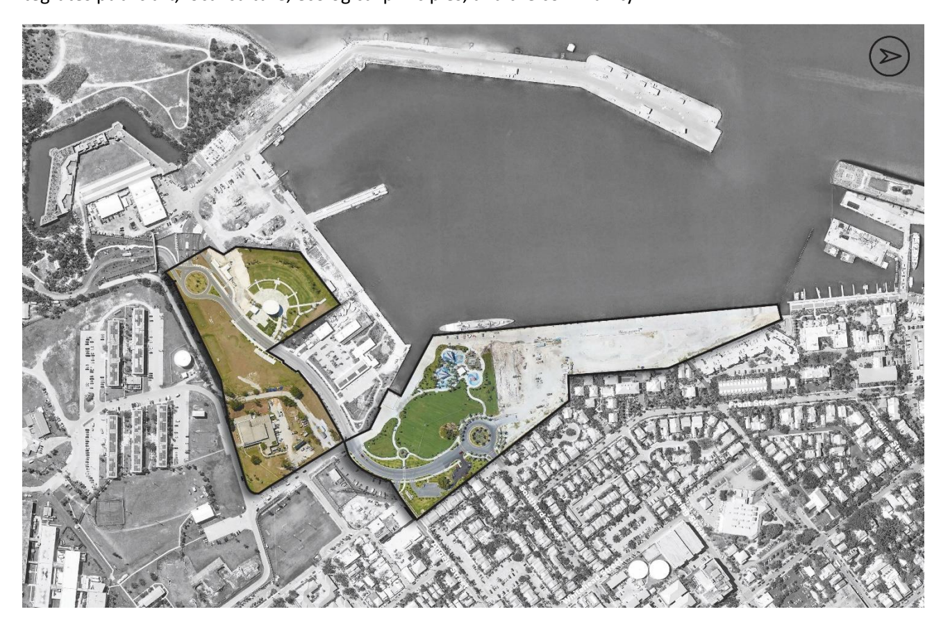
Map of Truman Waterfront Park showing surrounding context.

on the Arts, was awarded a National Endowment for the Arts "Our Town" grant to undertake an Arts & Cultural Master Plan for the Truman Waterfront Park. This RFP for Public Art is the first phase of a longer-term plan to transform the Park into a popular resident and visitor destination for art, play, music, and the enjoyment of the waterfront environment. The goal is to further develop the park as an exceptional community gathering place that integrates public art, local culture, ecological principles, and the community.