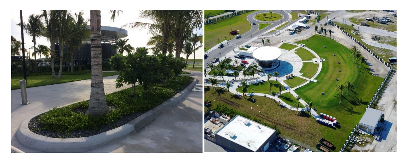
#6 Traffic circle at the entrance on Southard Street