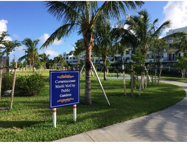
#3 Splash Pad and Playground Area and immediate surroundings