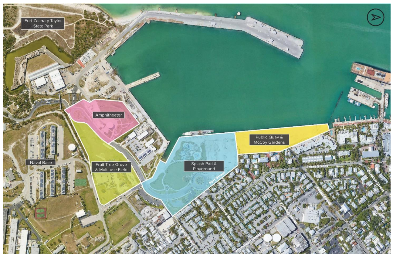
Map illustrating the sections of the park.