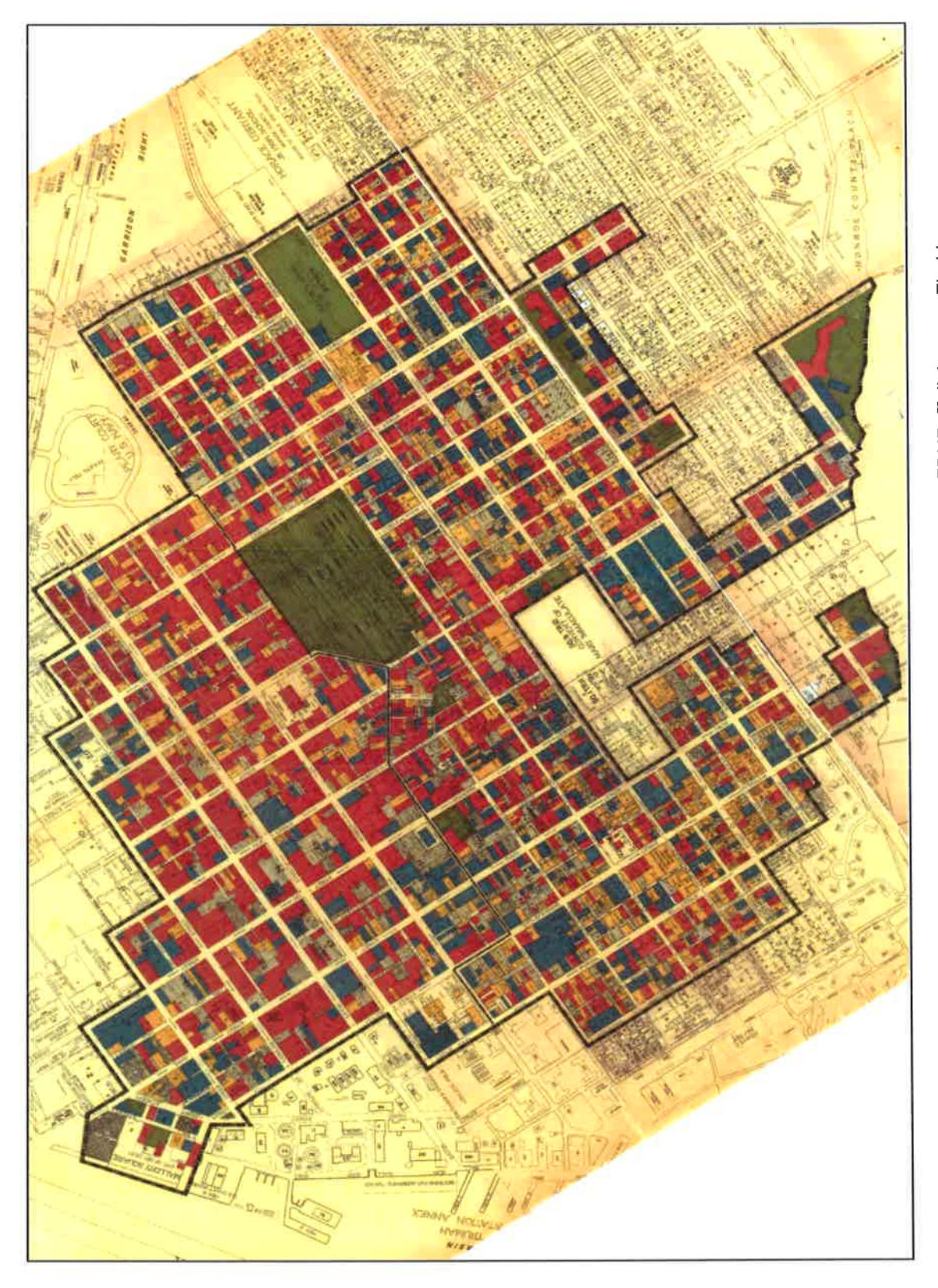
Figure 2.4. Key West Historic District, 1982 expansion (Zimny 1982). Map on file at the FDHR, Tallahassee, Florida.