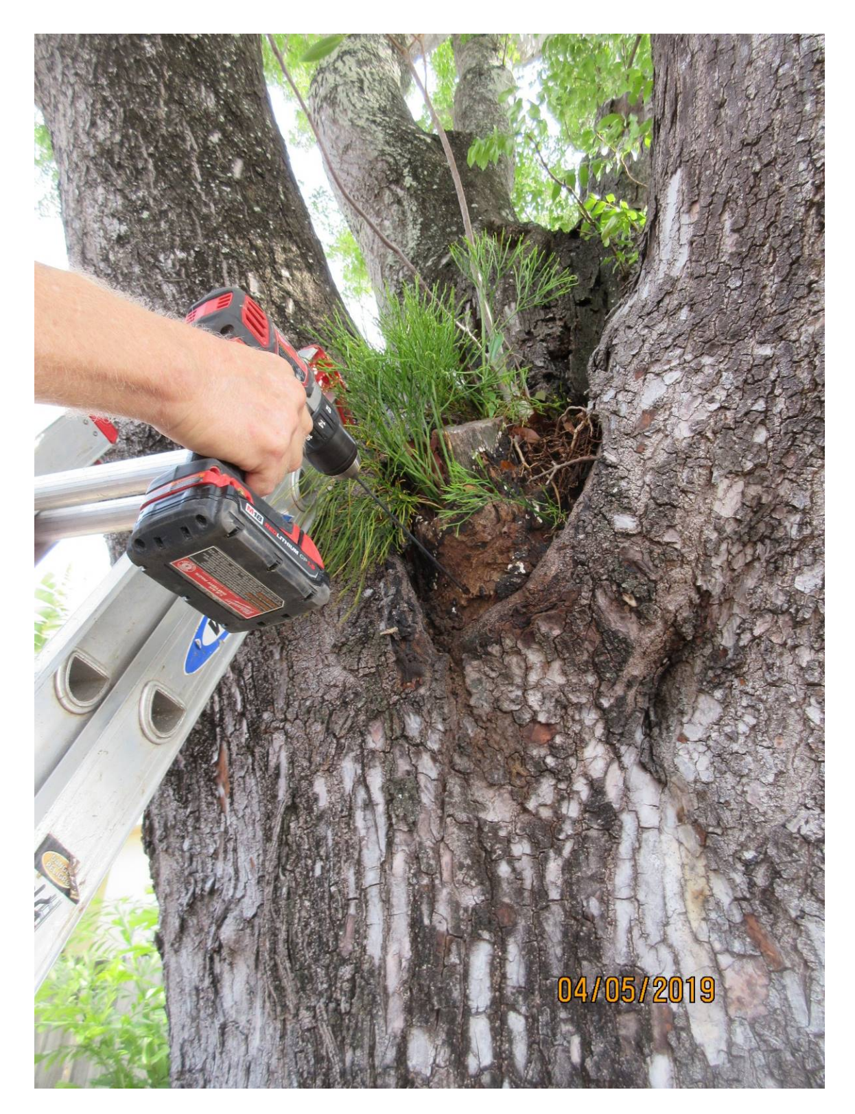
Drill location above- 2" soft then hard wood.