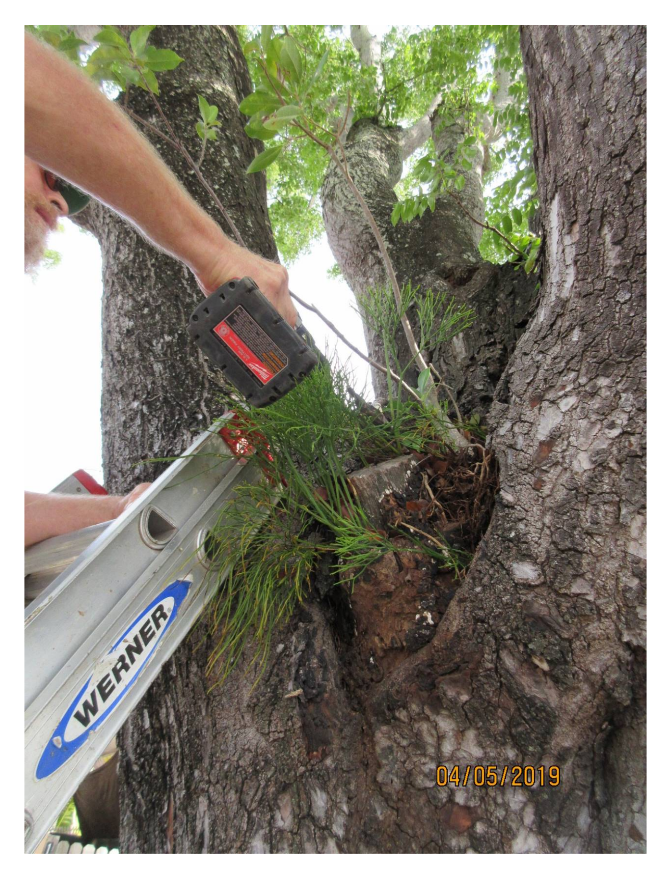
Drill location above: drill bit easily into the wood-10" soft wood