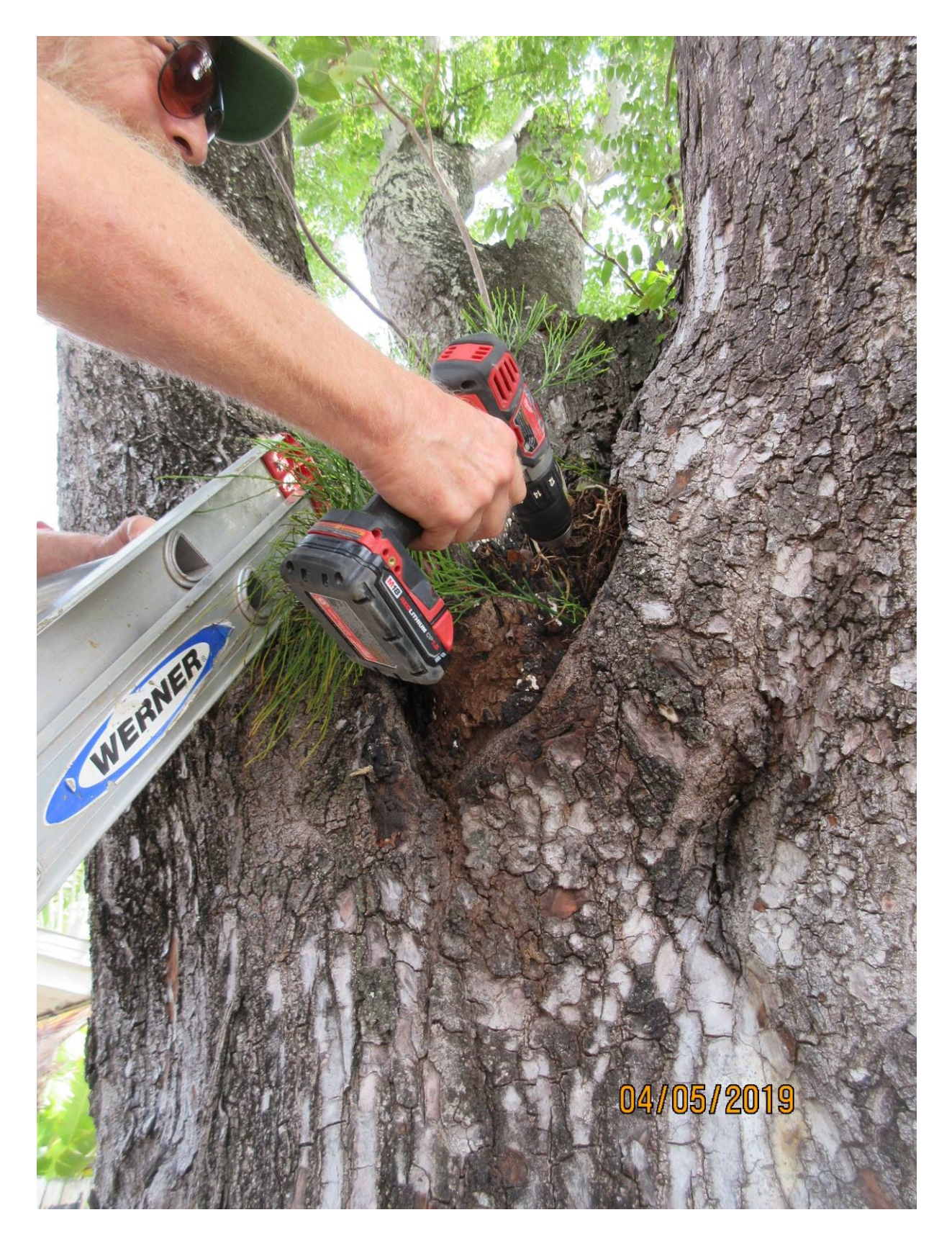
Drill location above-drill bit easily into trunk-10" soft wood.