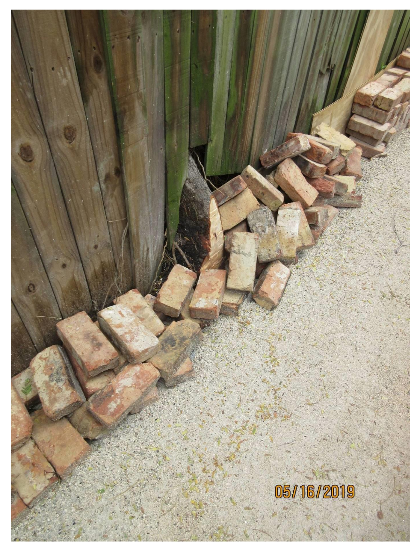
Close up photo of cut root view 1.