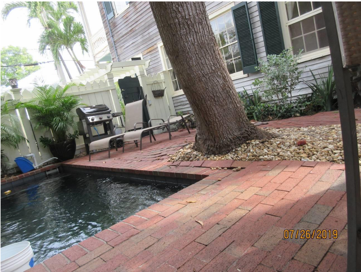
Photo of base of tree, view 4.