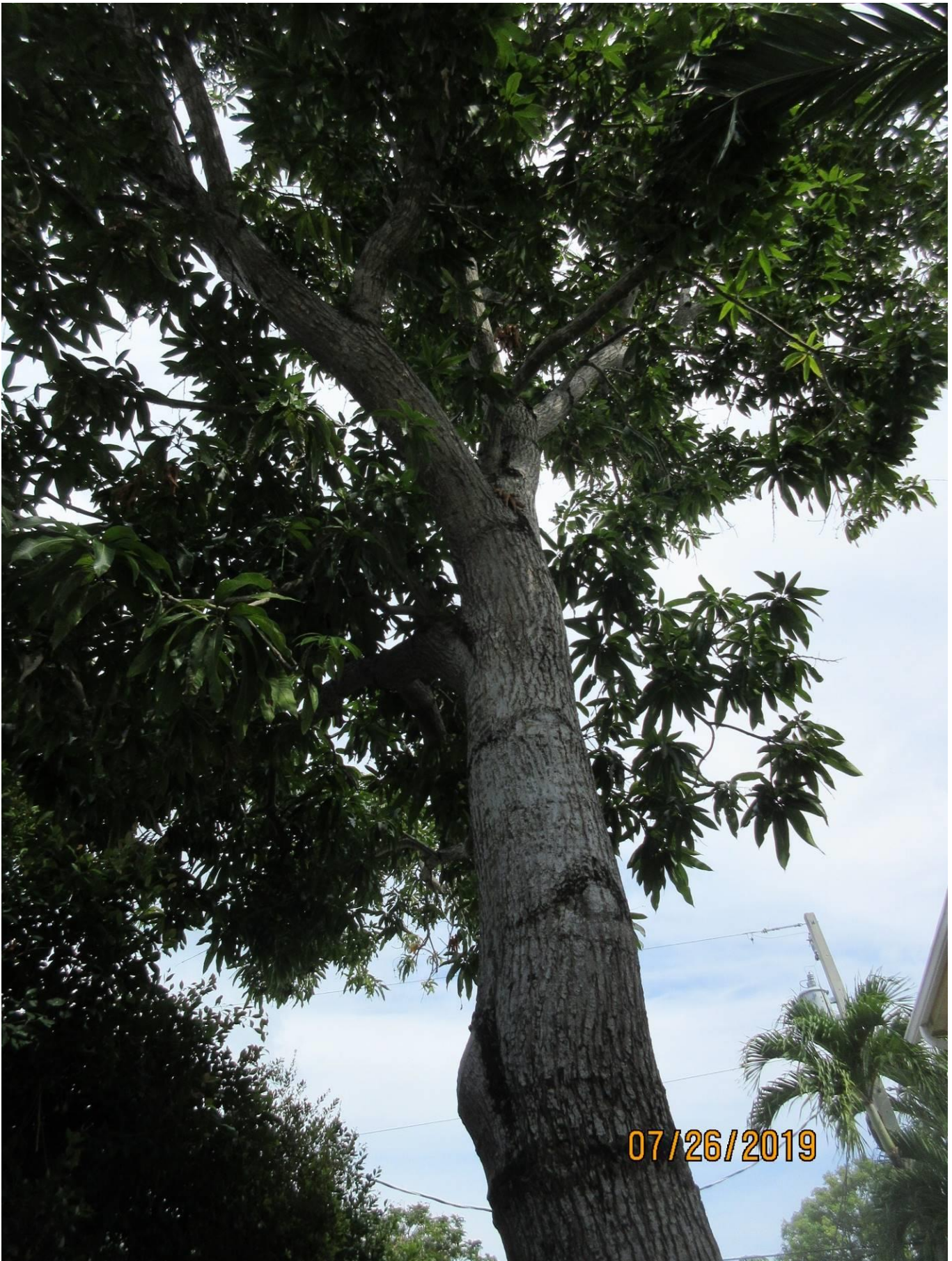
Photo of tree canopy, view 1.