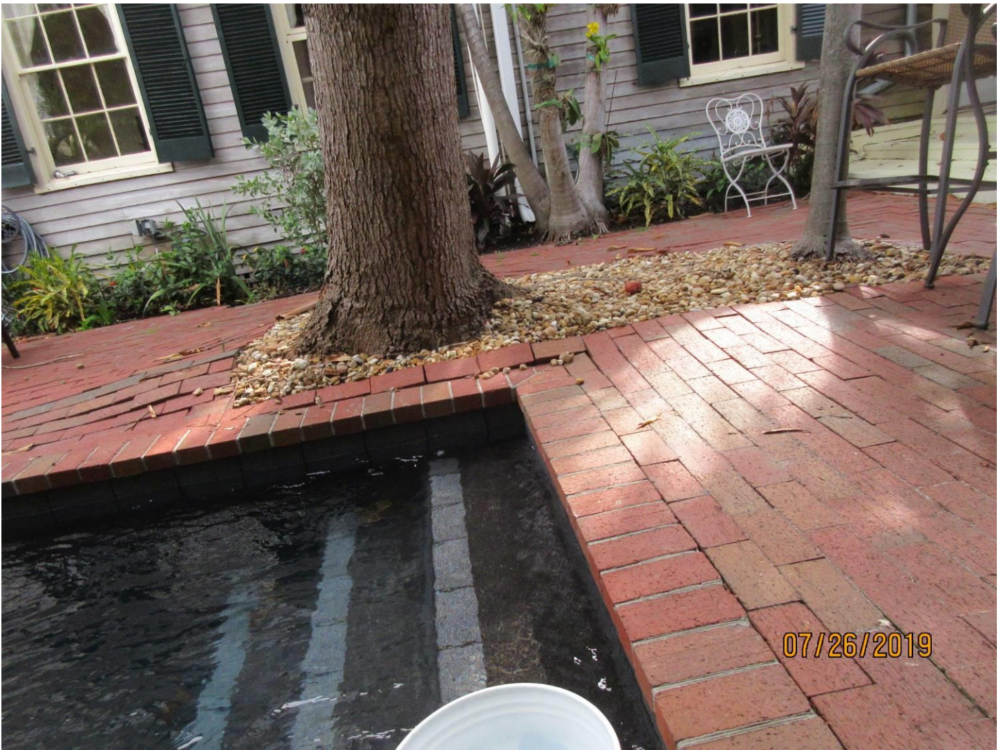
Photo of base of tree, view 5.