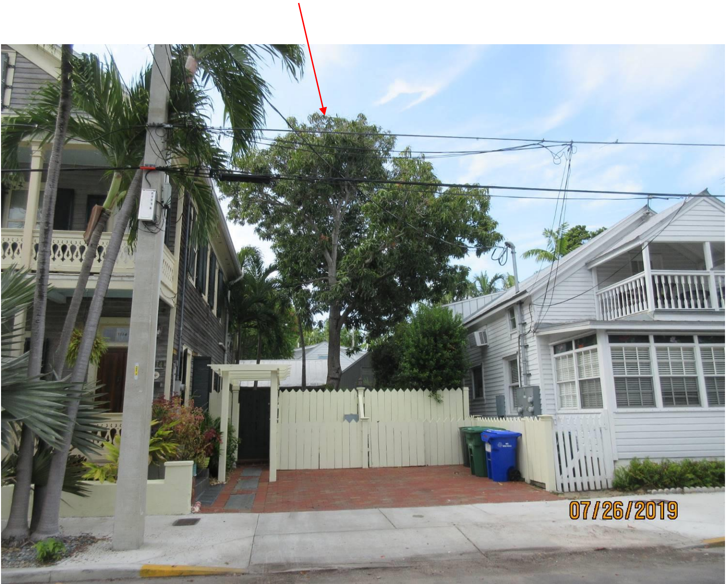
Streetview photo of tree.

Tree Species: Mango ( Mangifera indica )