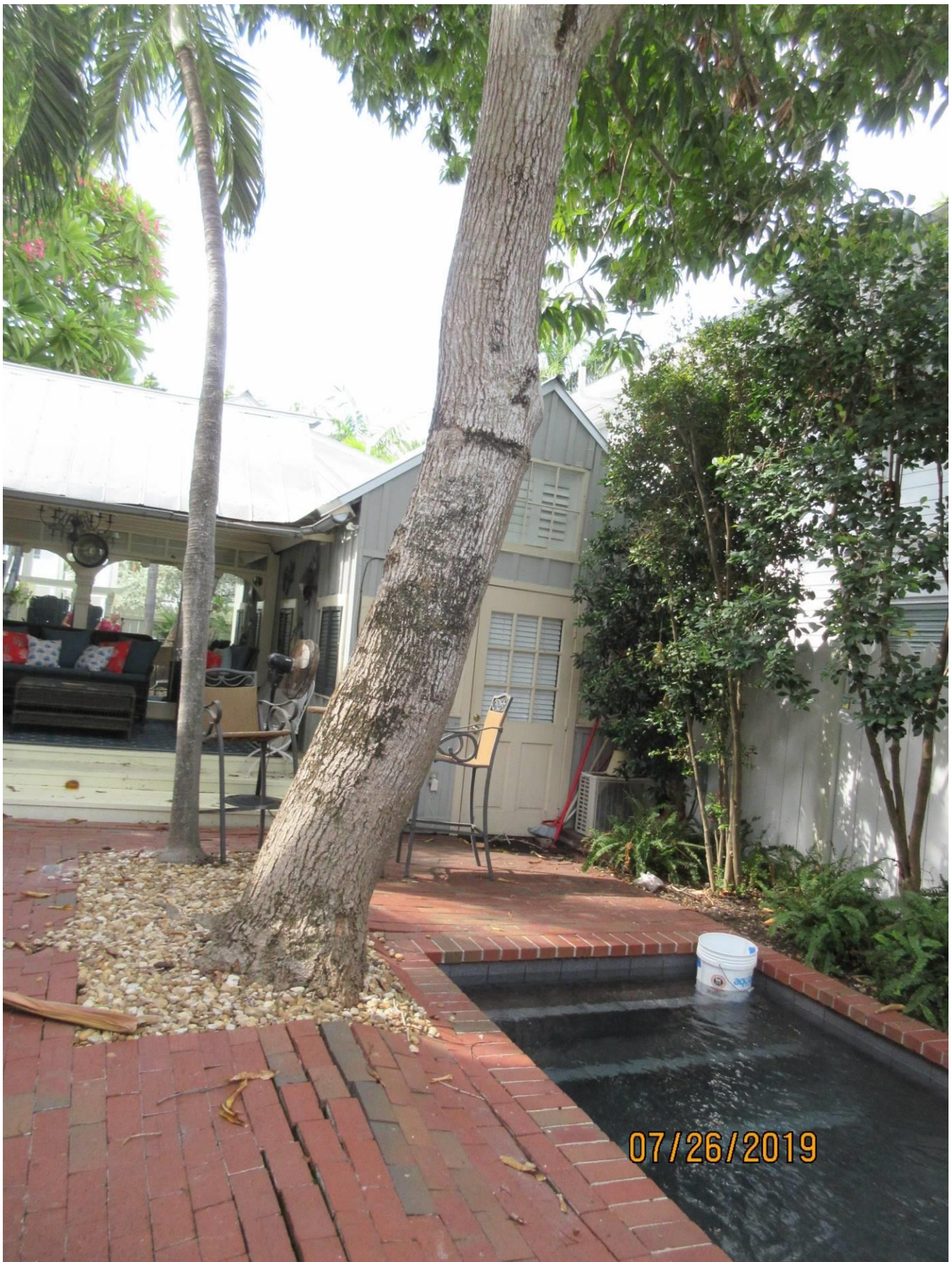
Photo of tree-base and trunk.