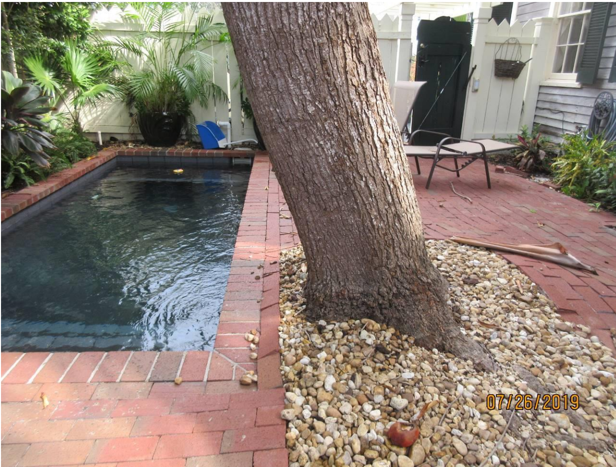
Photo of base of tree, view 3.