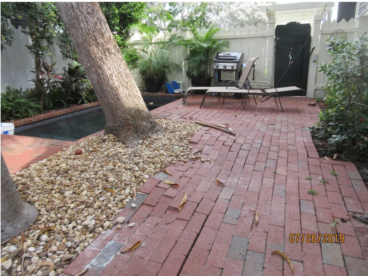
Photo of base of tree, view 2.