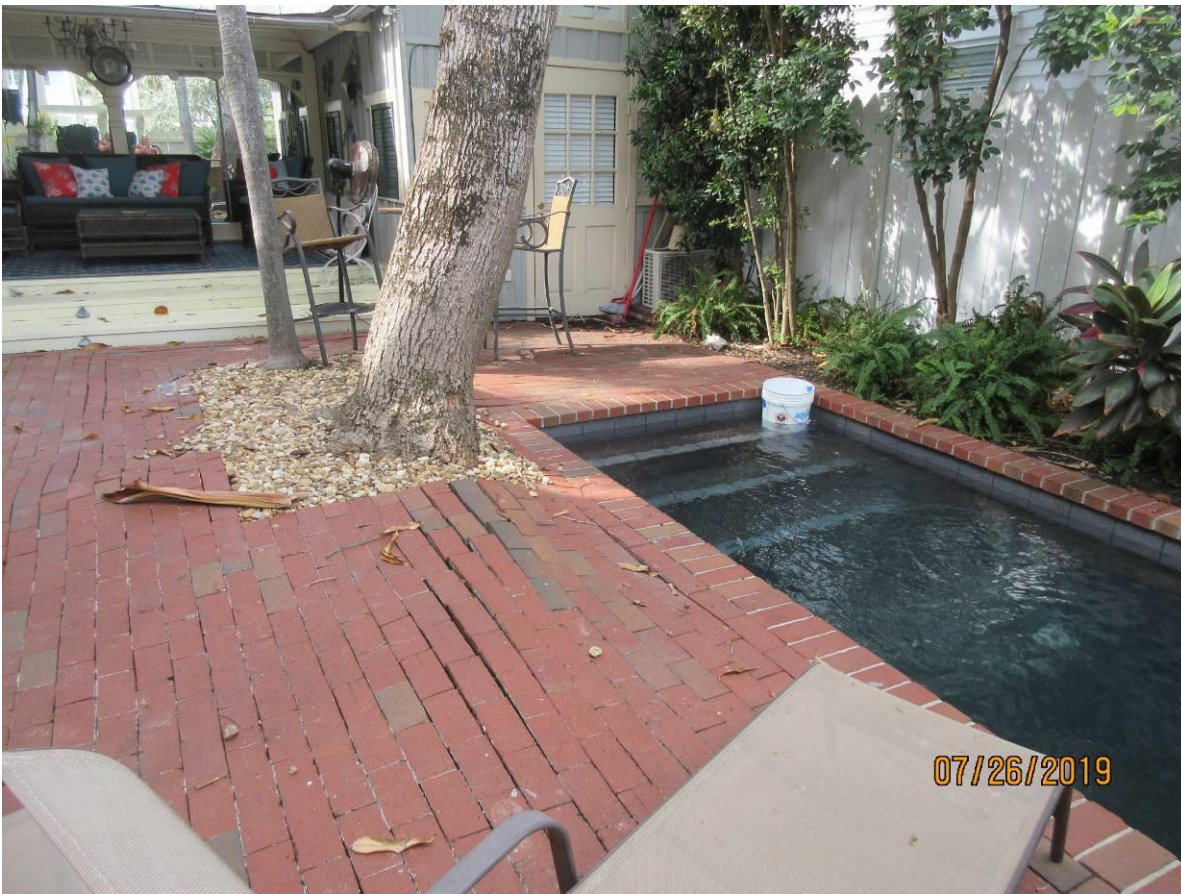
Photo of base of tree, view 1.