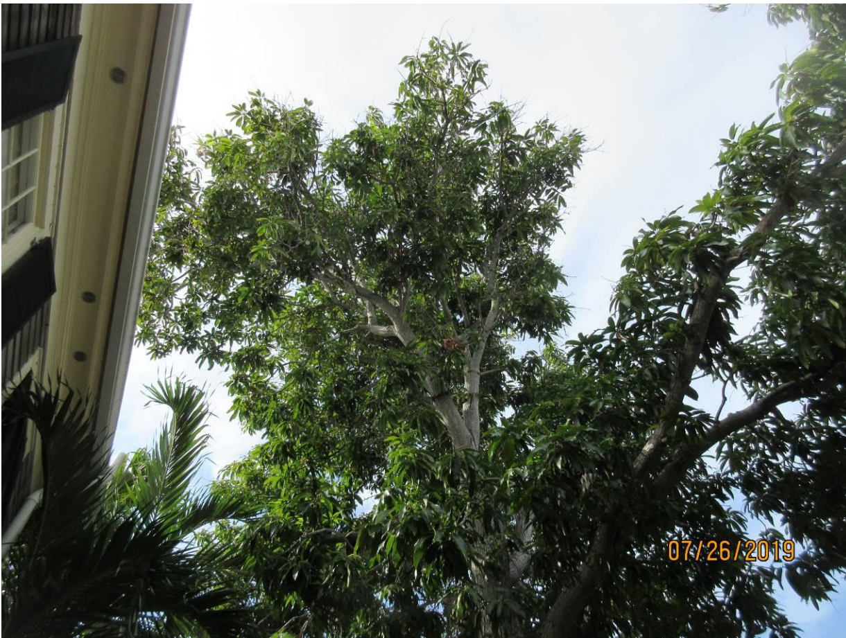
Photo of tree canopy, view 4.