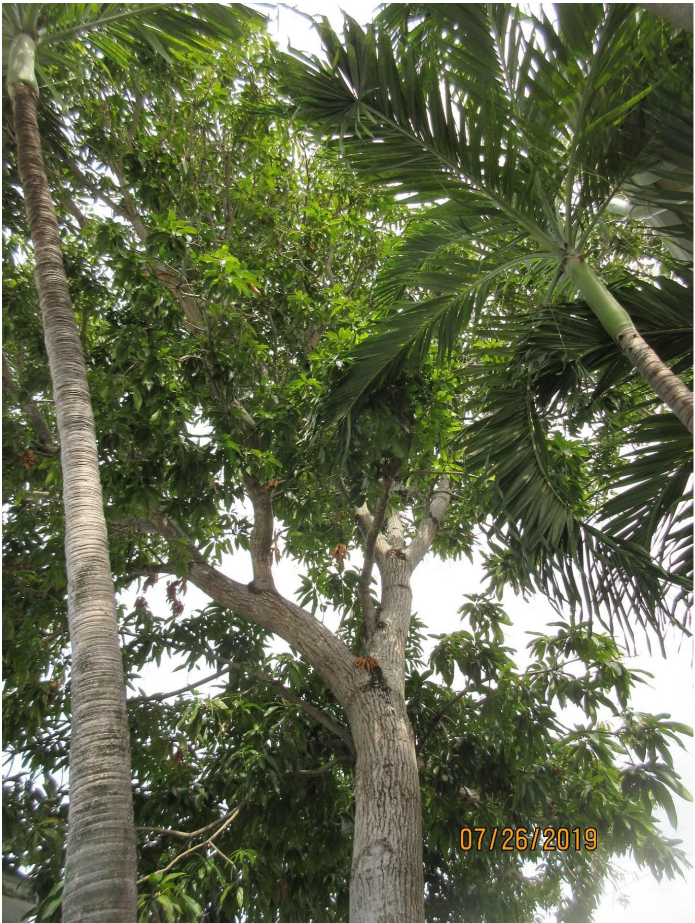
Photo of tree canopy, view 3.