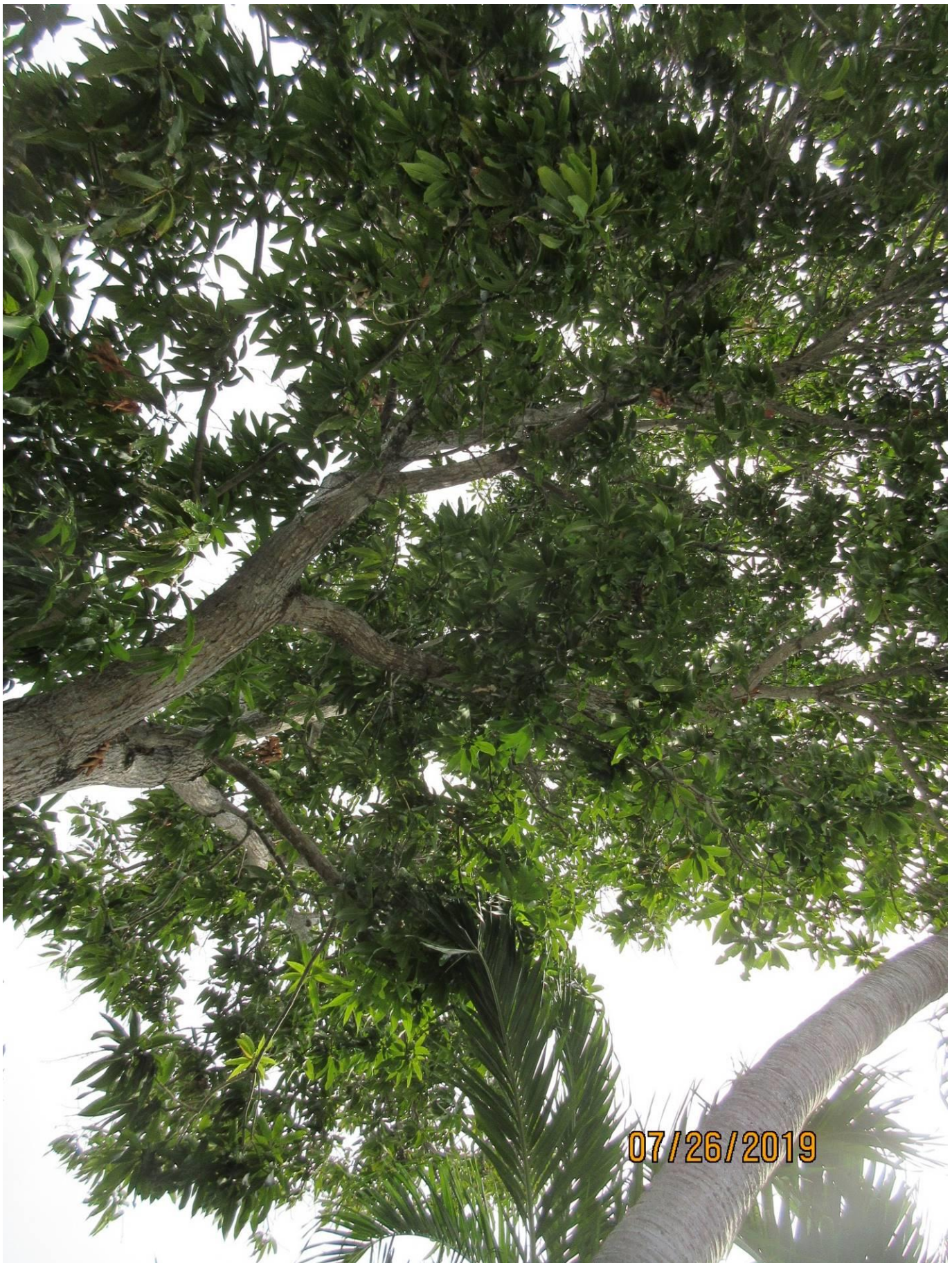
Photo of tree canopy, view 2.