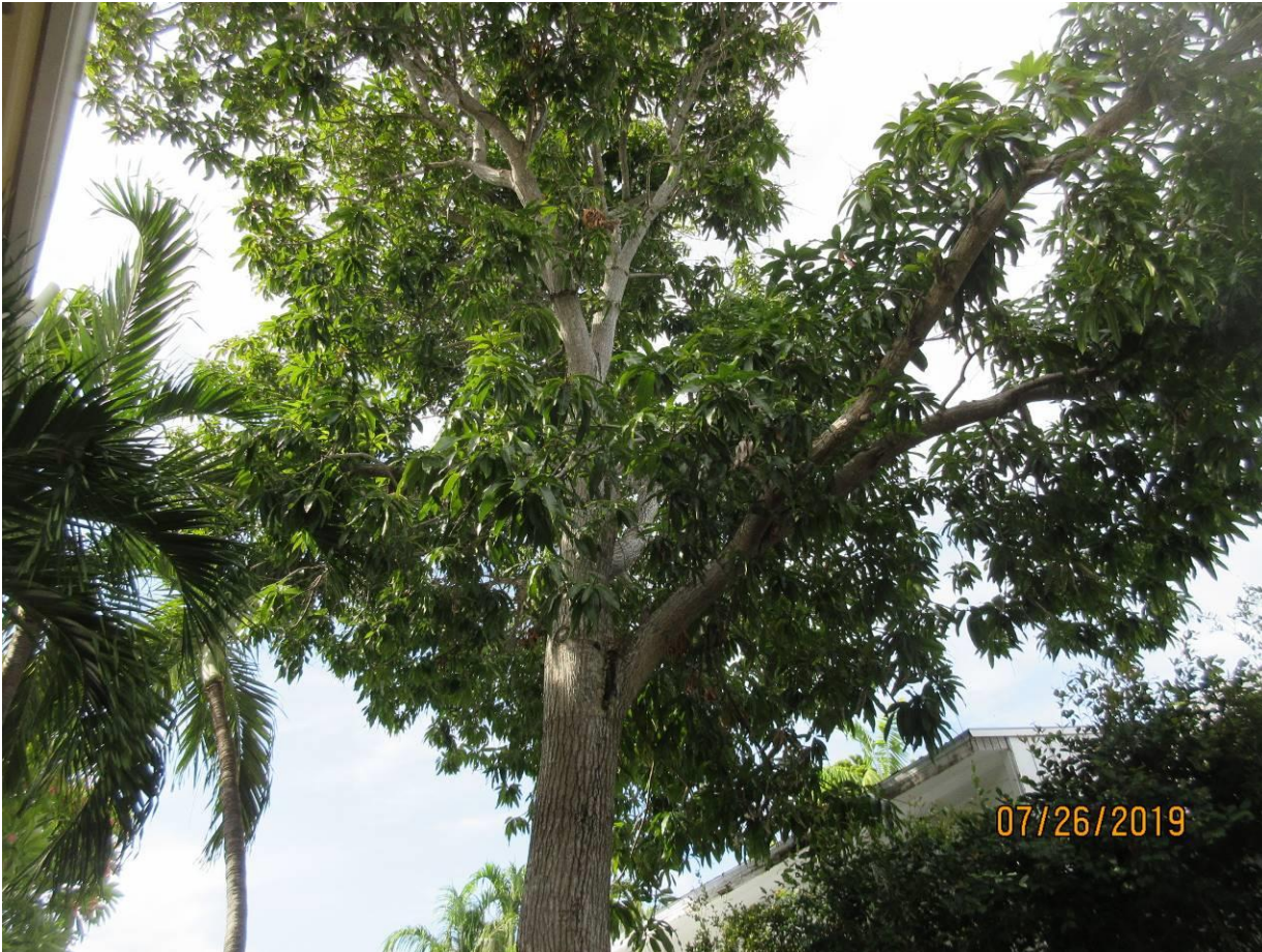
Photo of tree canopy, view 5.