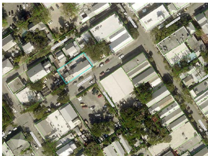
Image of an aerial view of the subject property.