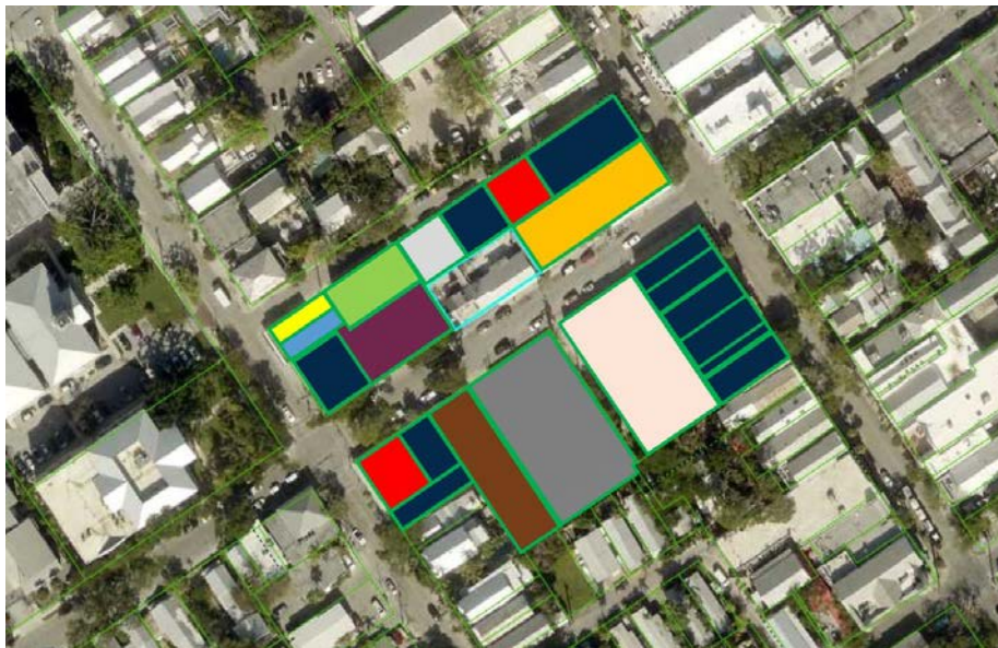
Image of an aerial view of the subject property with the surrounding uses identified.

North: HRCC – 1 and HRO South: HRCC – 1 and HRO West: HRO East: HRCC – 1