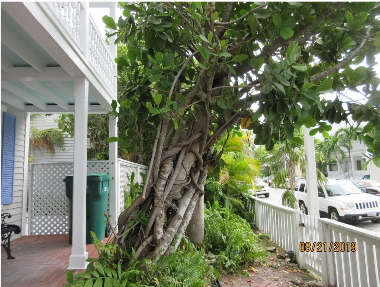
Photo of tree view 1.