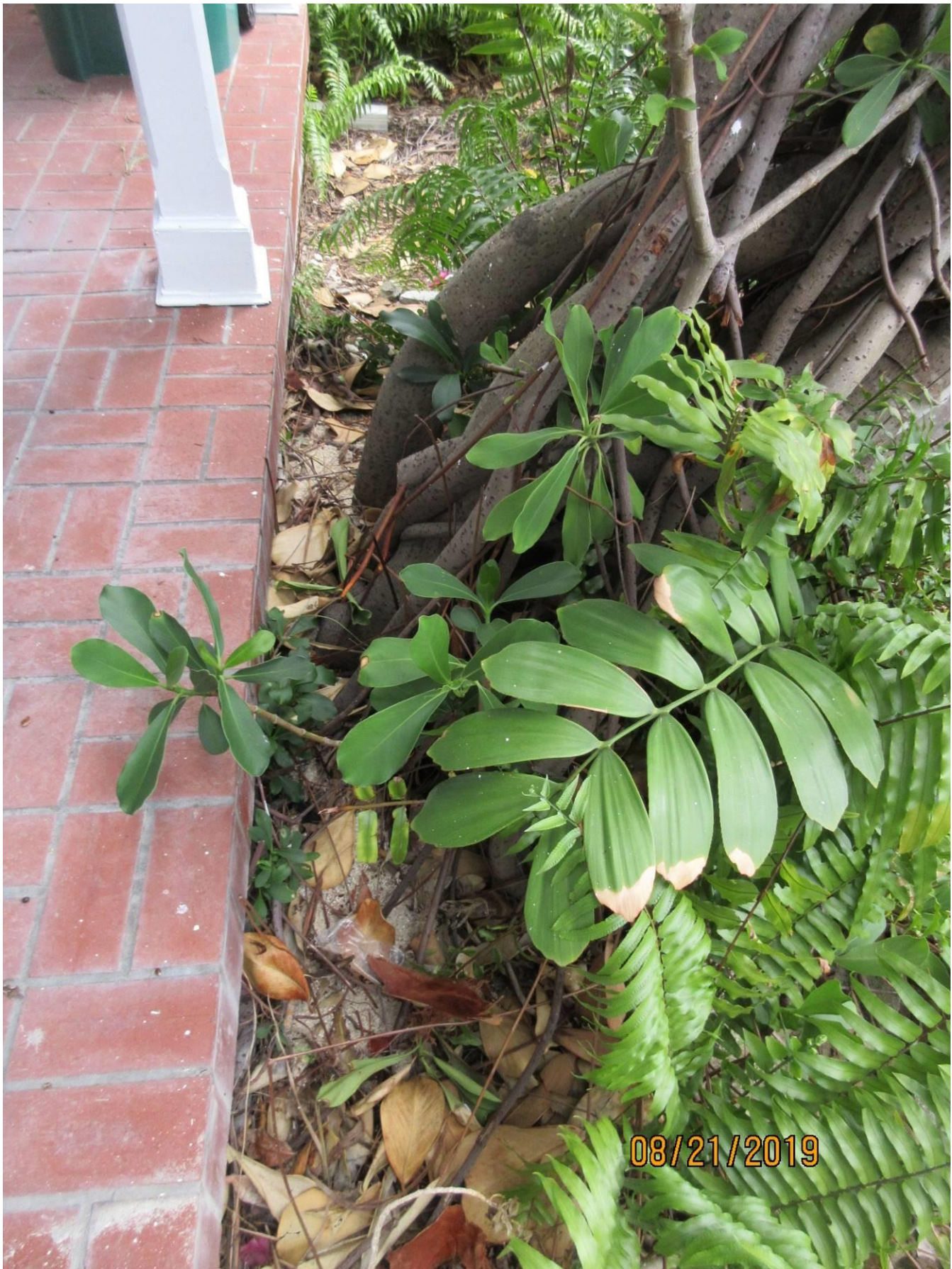
Close up photo of base of tree.