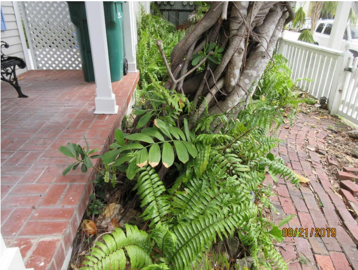
Photo of tree trunk next to structure.