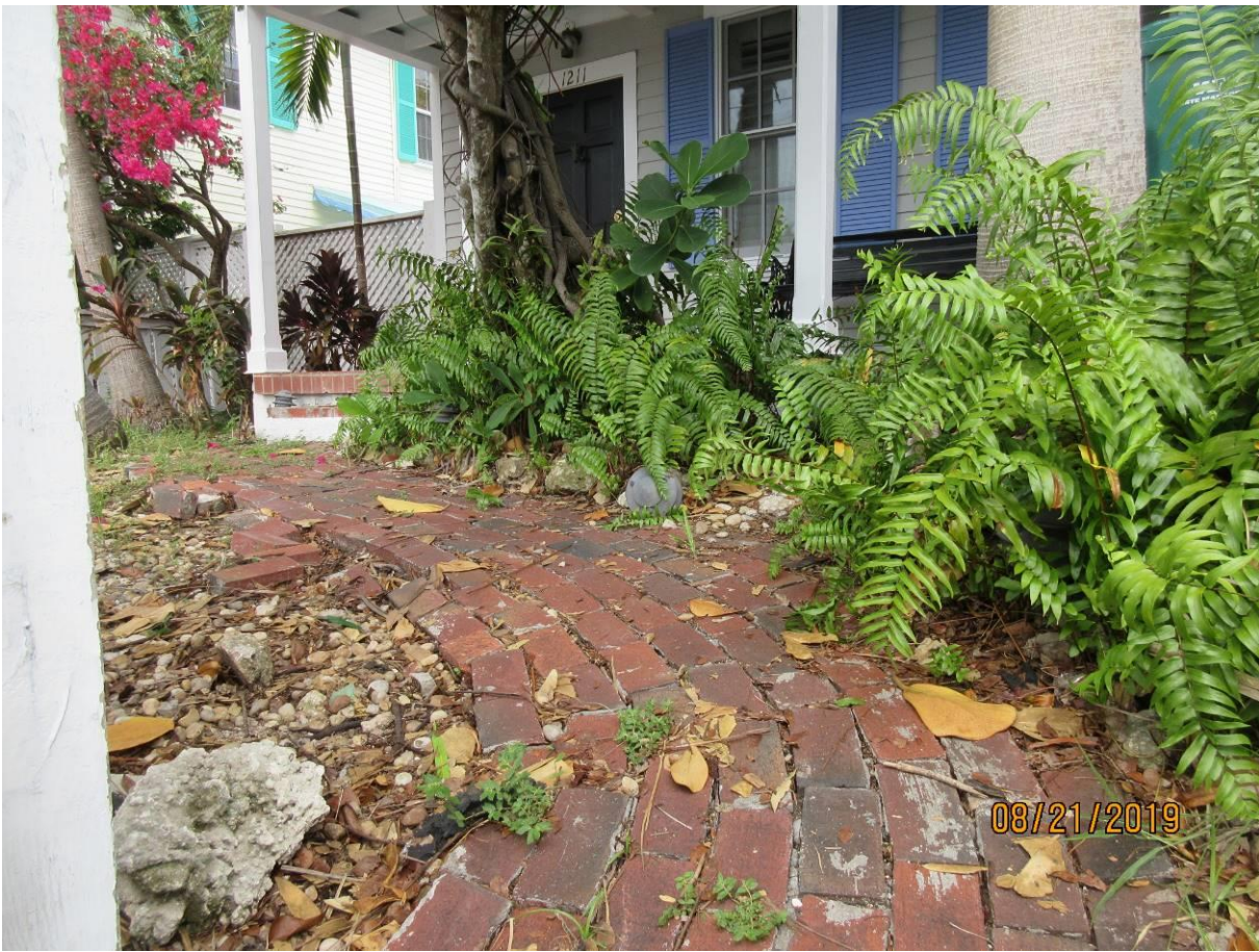
Photo of entrance to house and sidewalk pavers and base of tree.