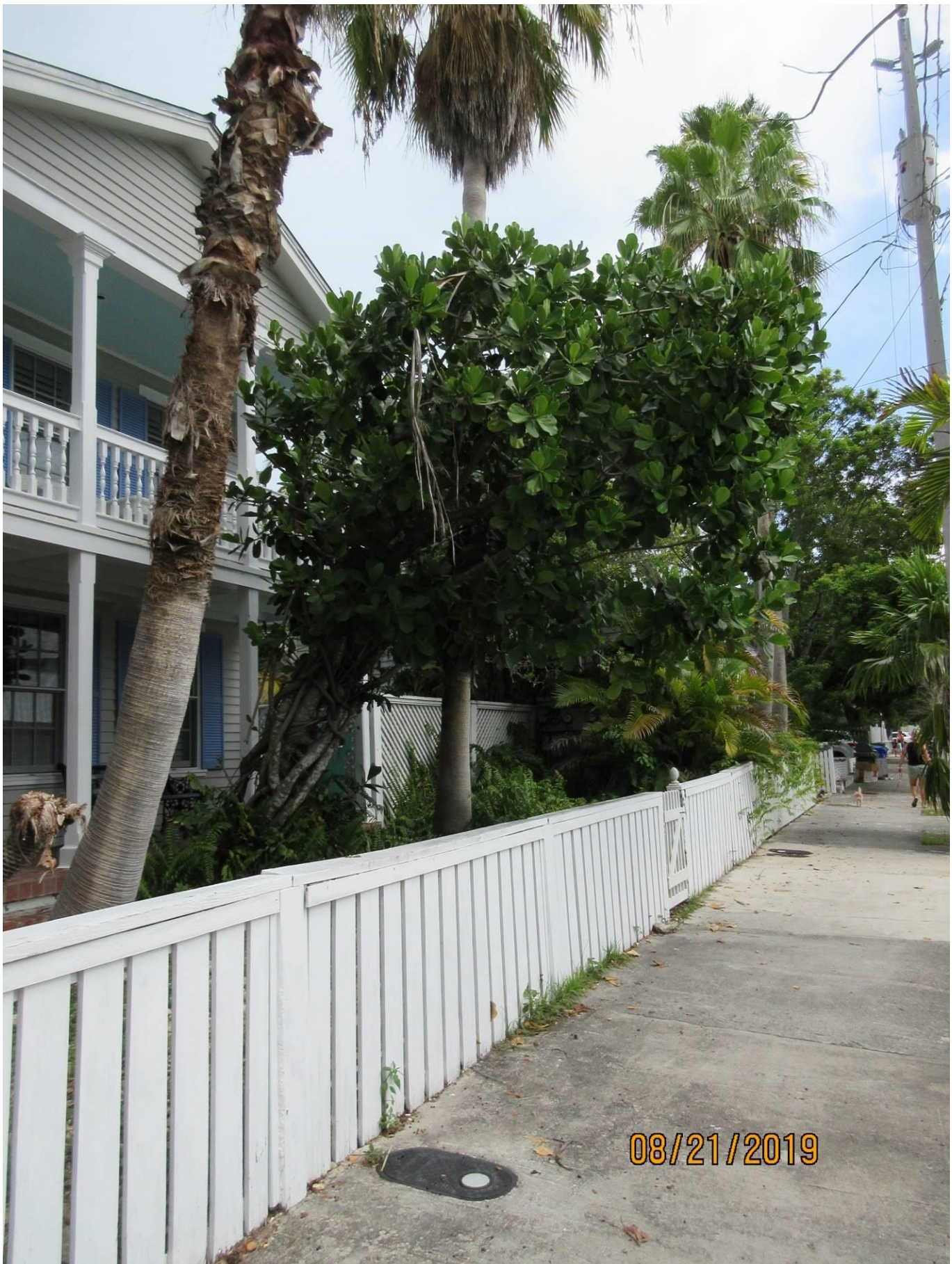
Street view photo of tree view 2.