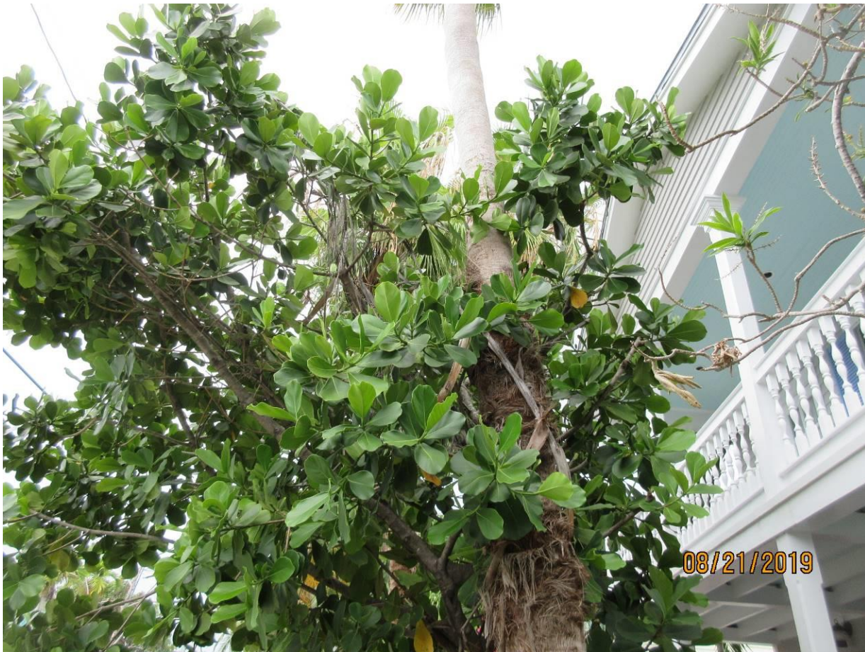
Canopy of tree view 2.