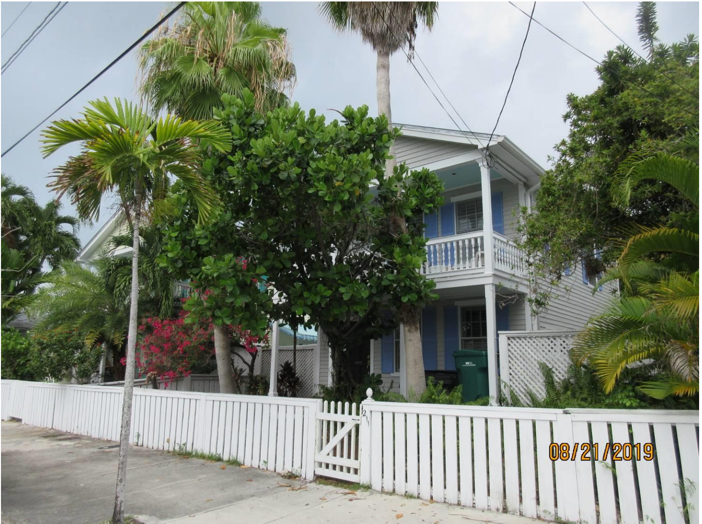
Street view photo of tree view 1.

Tree Species: Autograph tree (Clusia sp.)