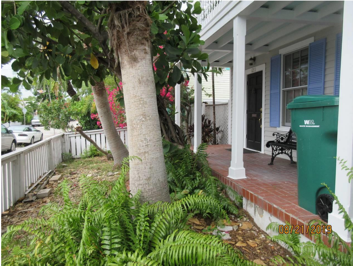
Photo of tree view 2.