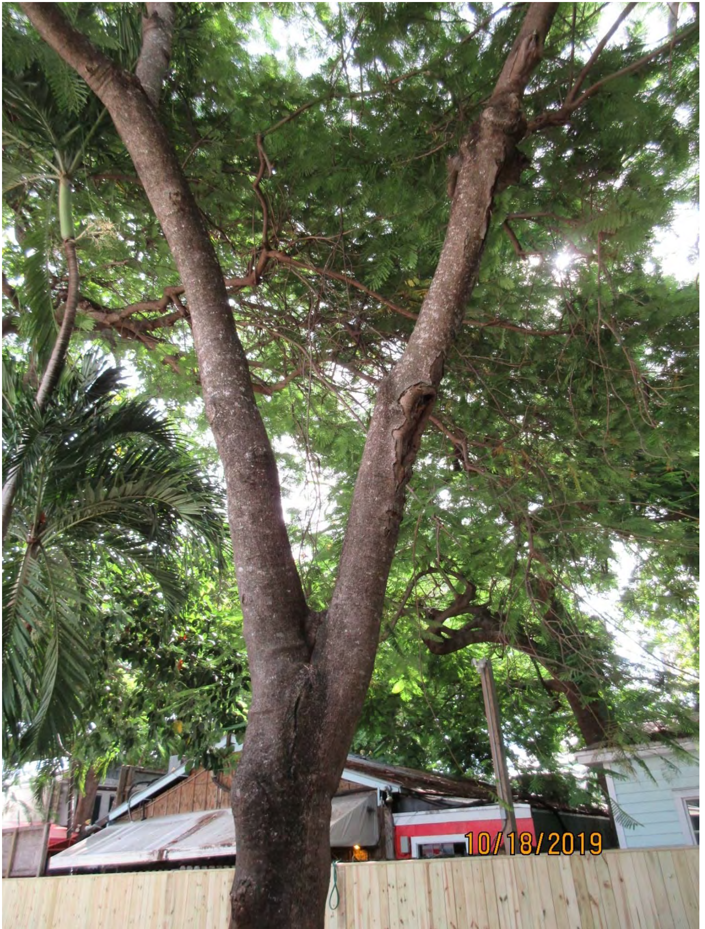
Photo of tree trunk, view 2.