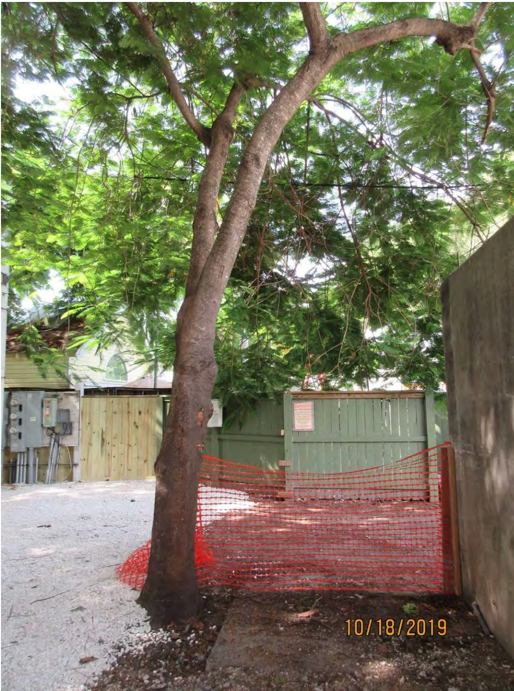
Photo of tree trunk and part of canopy, view 2.

Diameter: 14.6" Location: 60% (canopy impacts by larger Royal Poinciana tree and close to utility lines) Species: 100% (on protected tree list) Condition: 50% (fair to poor, main trunk splits to codominant trunks in canopy, one trunk with lots of decay, main trunk damaged) Total Average Value = 66% Value x Diameter = 9.6 replacement caliper inches Total replacement value if both trees approved for removal = 20.9"