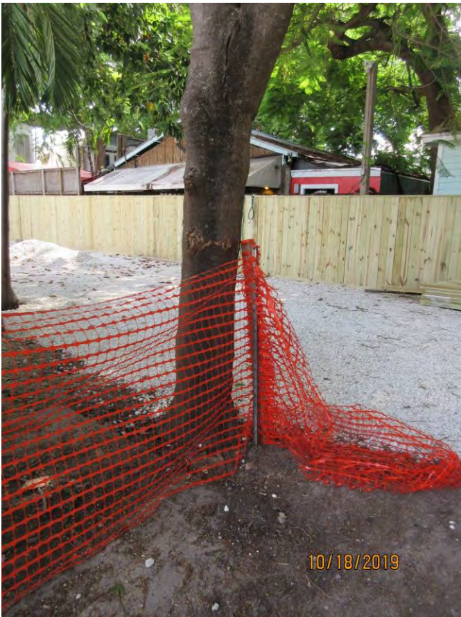
Photo above shows old fence previously attached to tree and dumpster previously located next to tree.

Photo to the left shows trunk of tree, view 1.