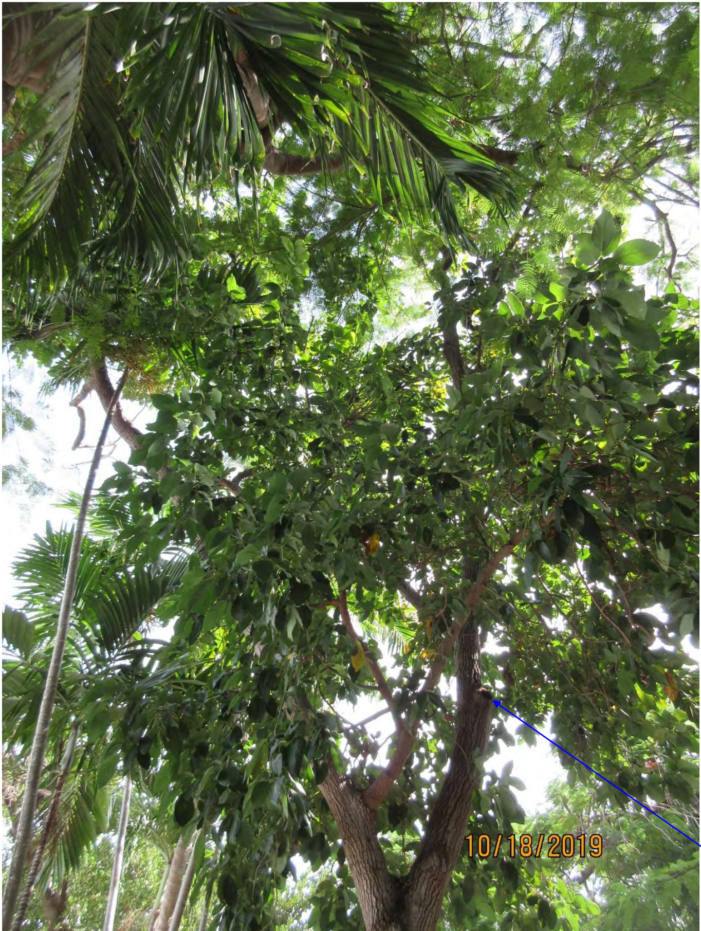
Photo of tree canopy showing location of termite frass.