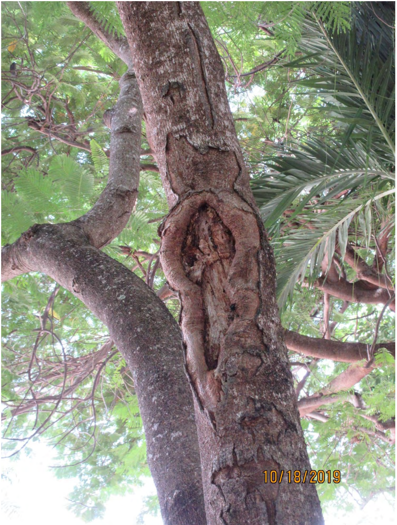
Close up photo of old wound-decay area in one of trunks.