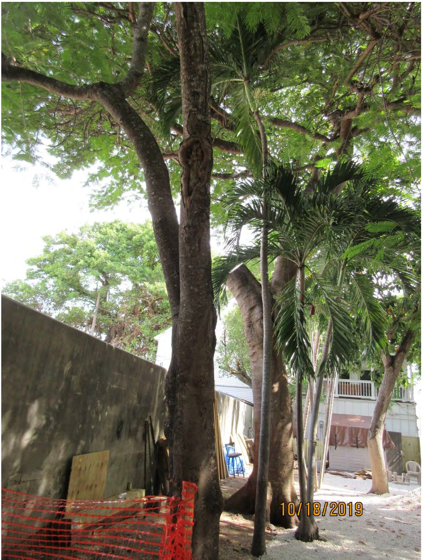
Photo of tree trunk and part of canopy, view 1.