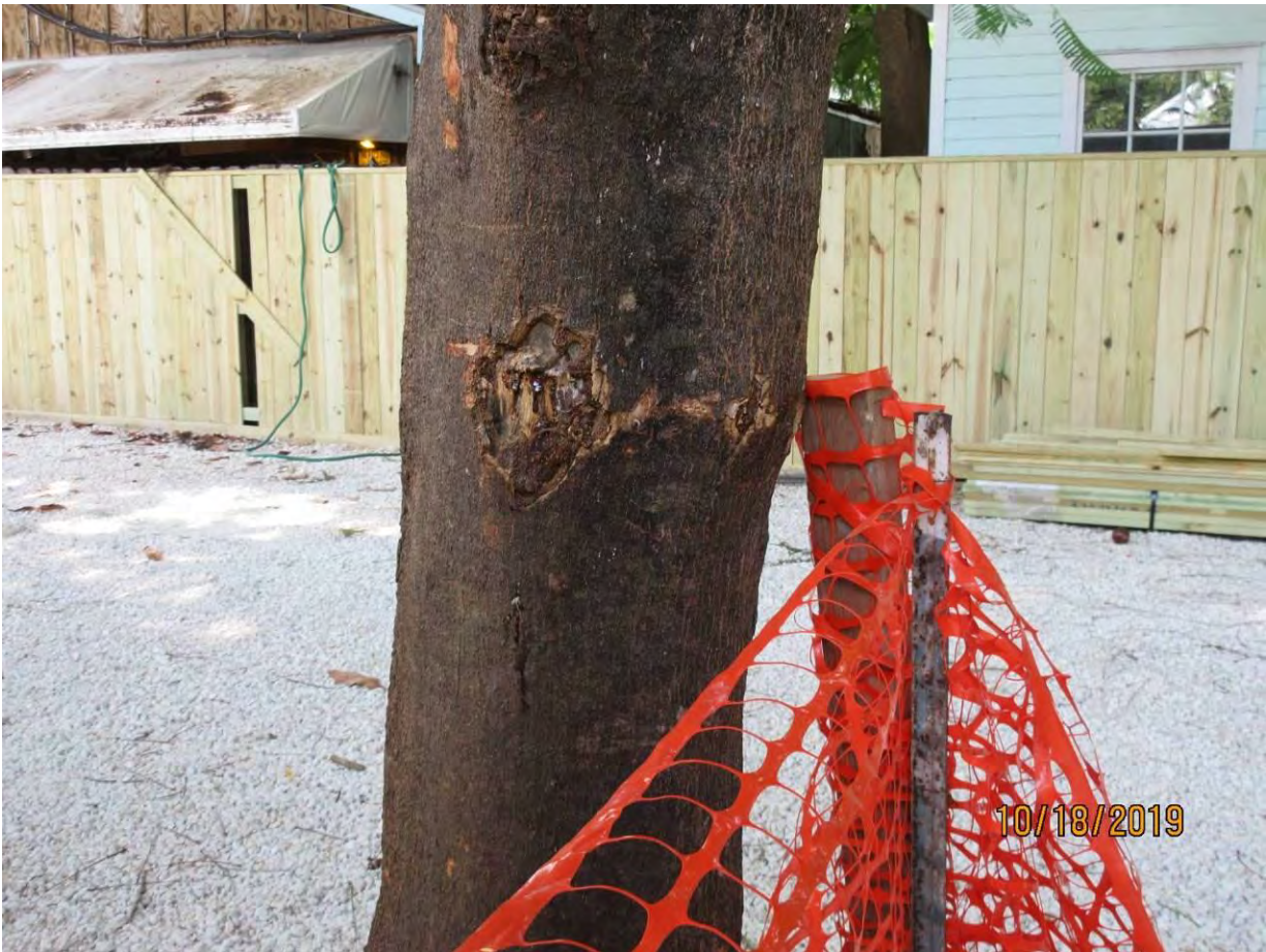
Photo showing trunk damage.