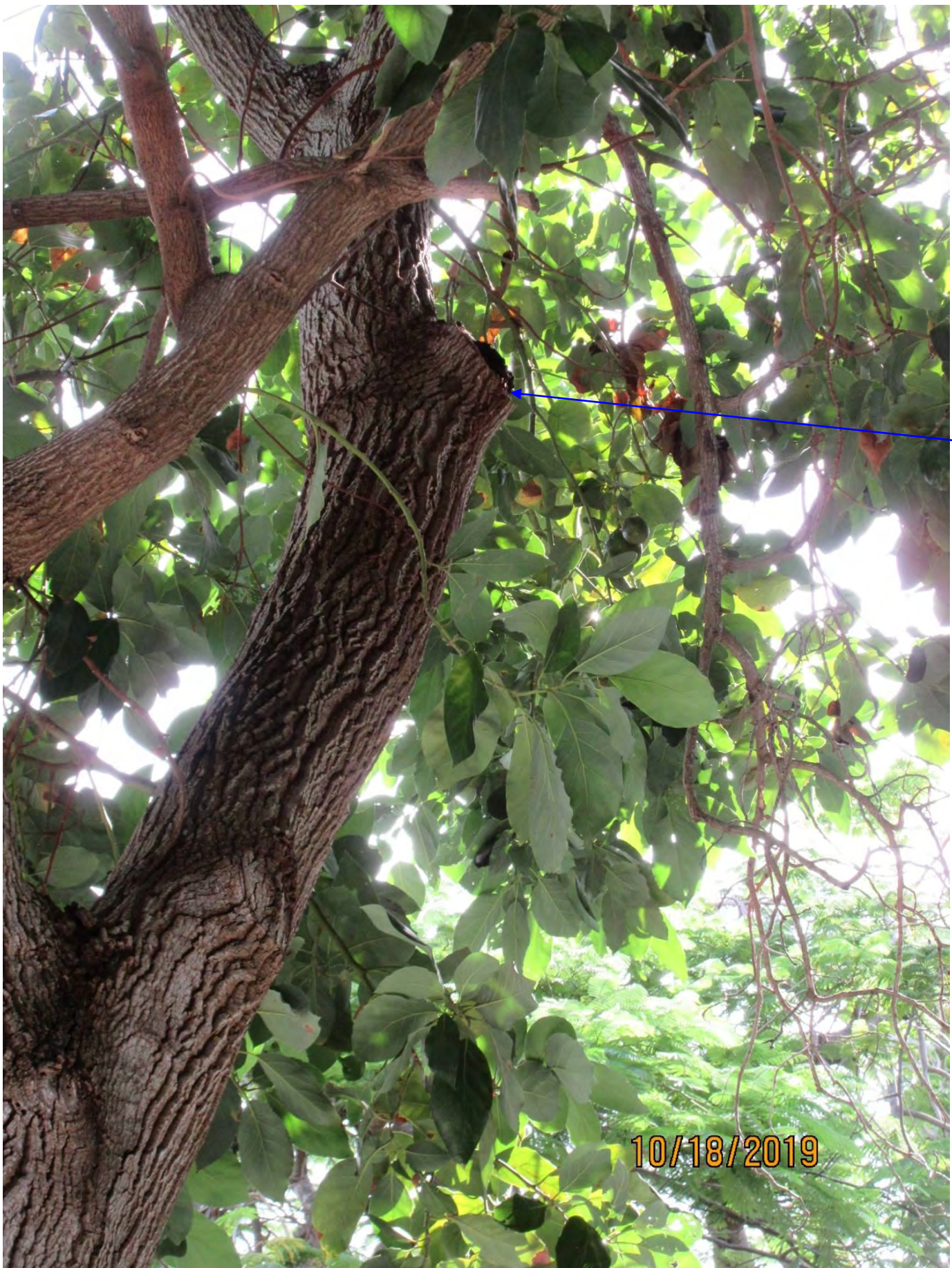
Close up photo of old cut area in canopy with termite frass.