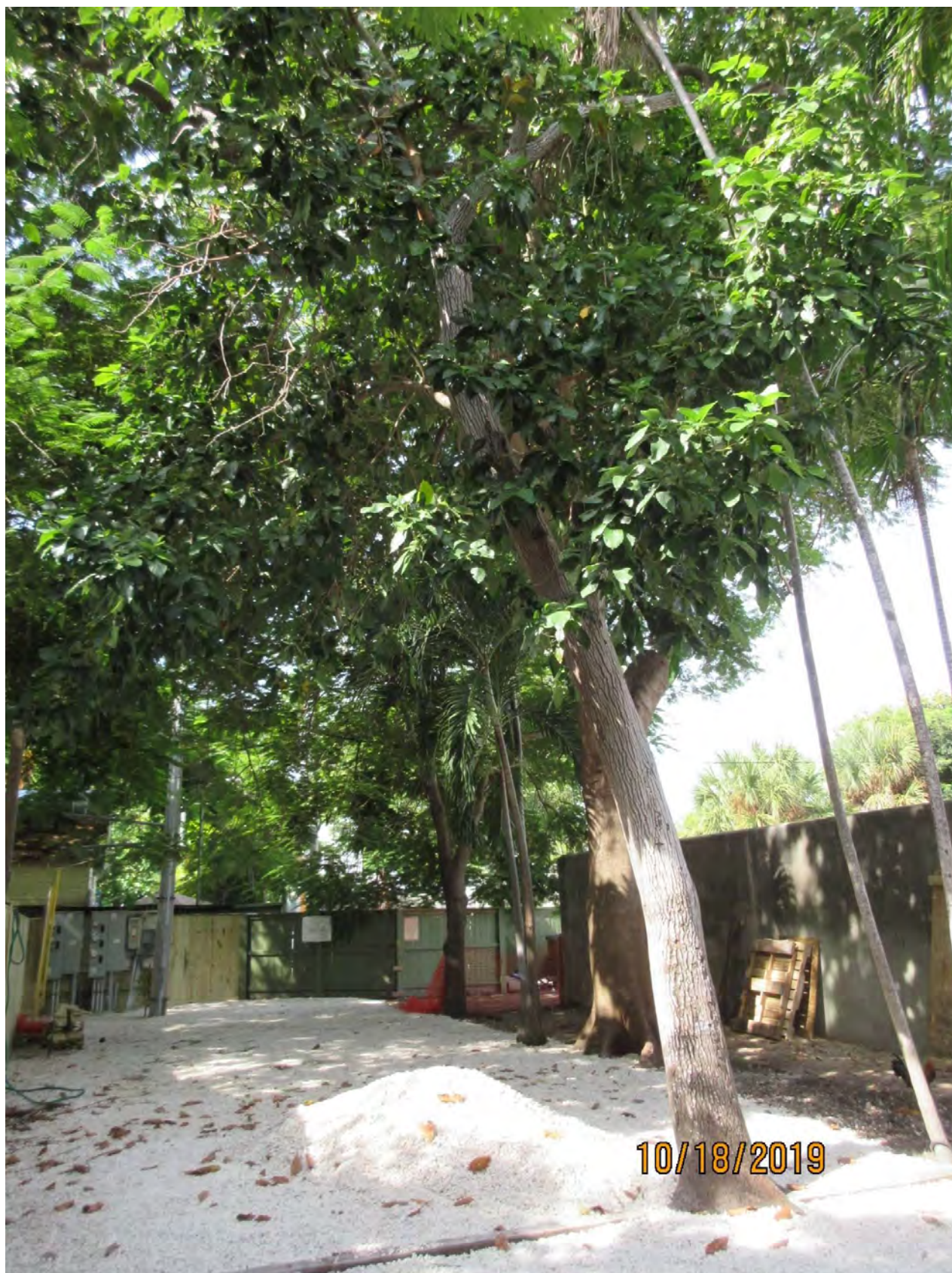
Full photo of avocado tree.