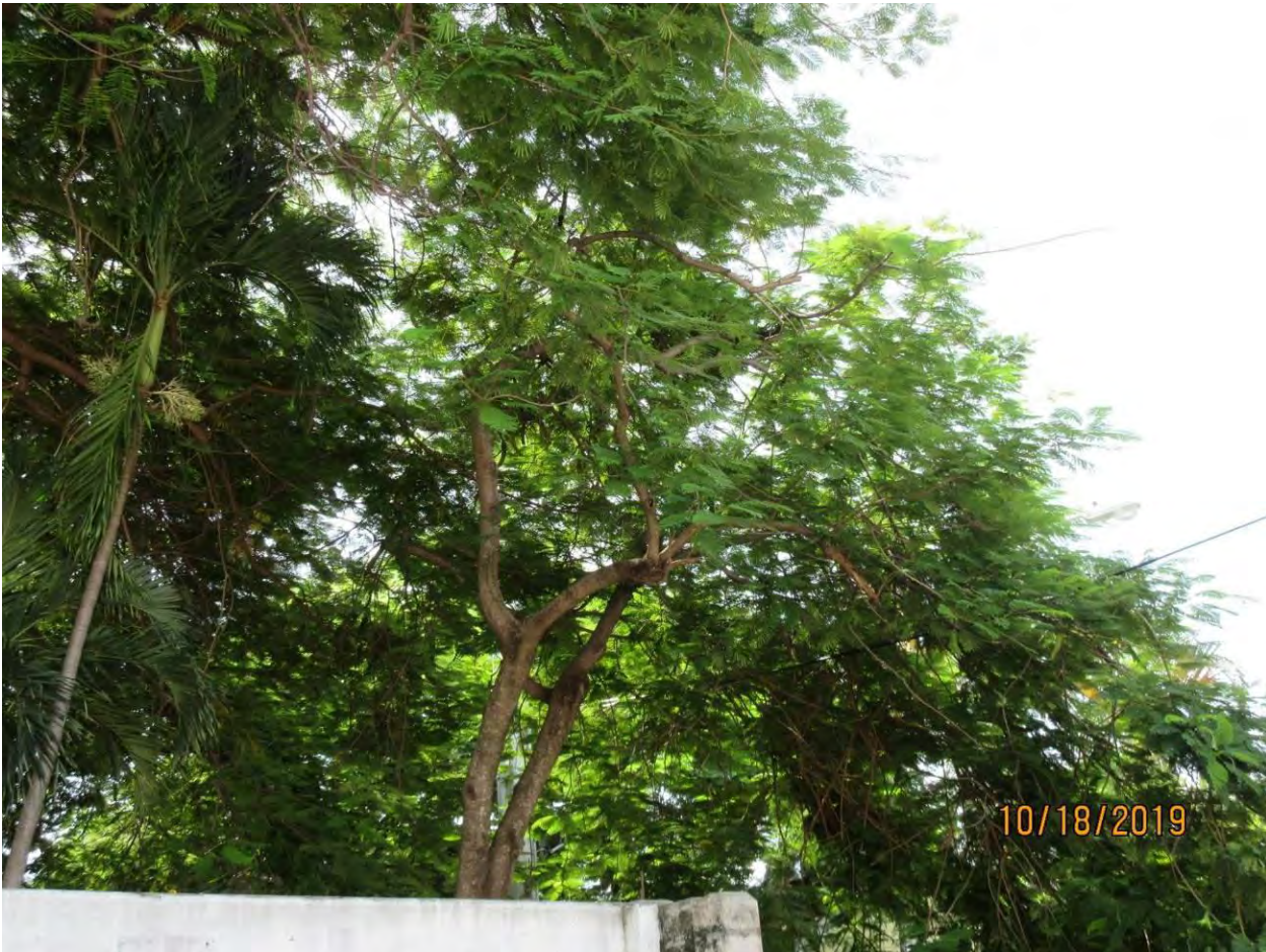
Photo of tree canopy, view 1.