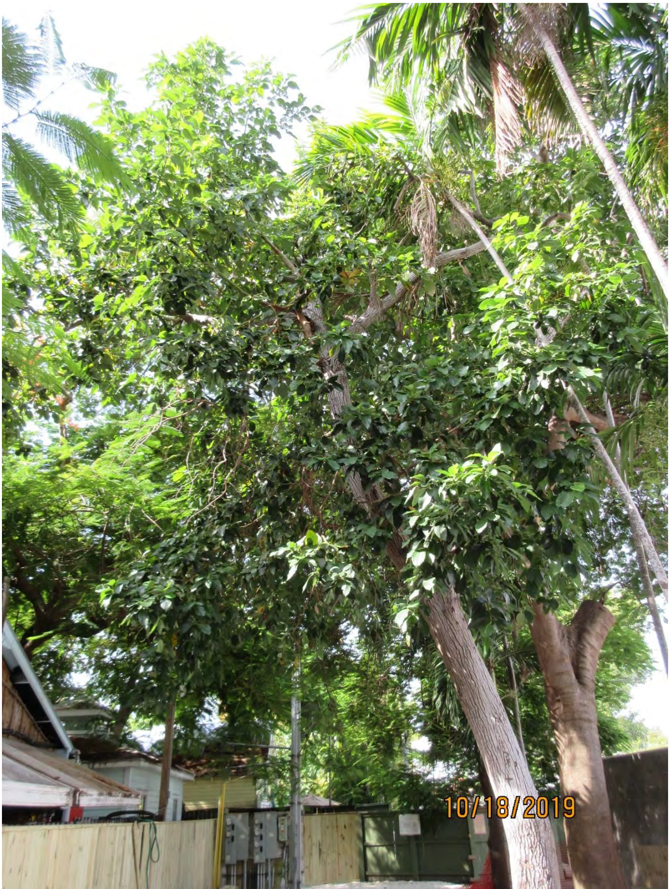
Photo of tree canopy, view 1.