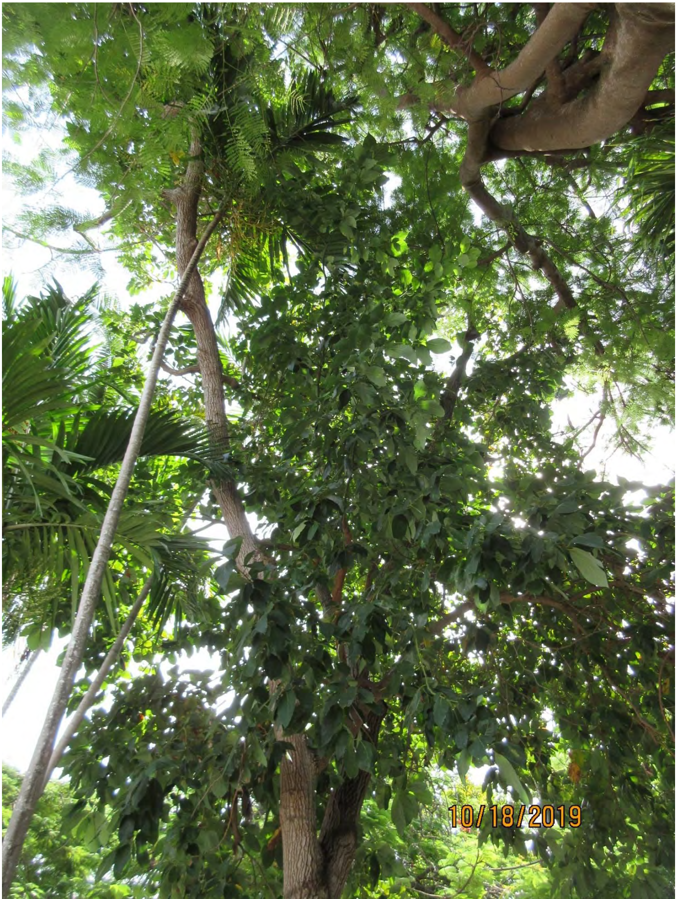
Photo of tree canopy view 3.