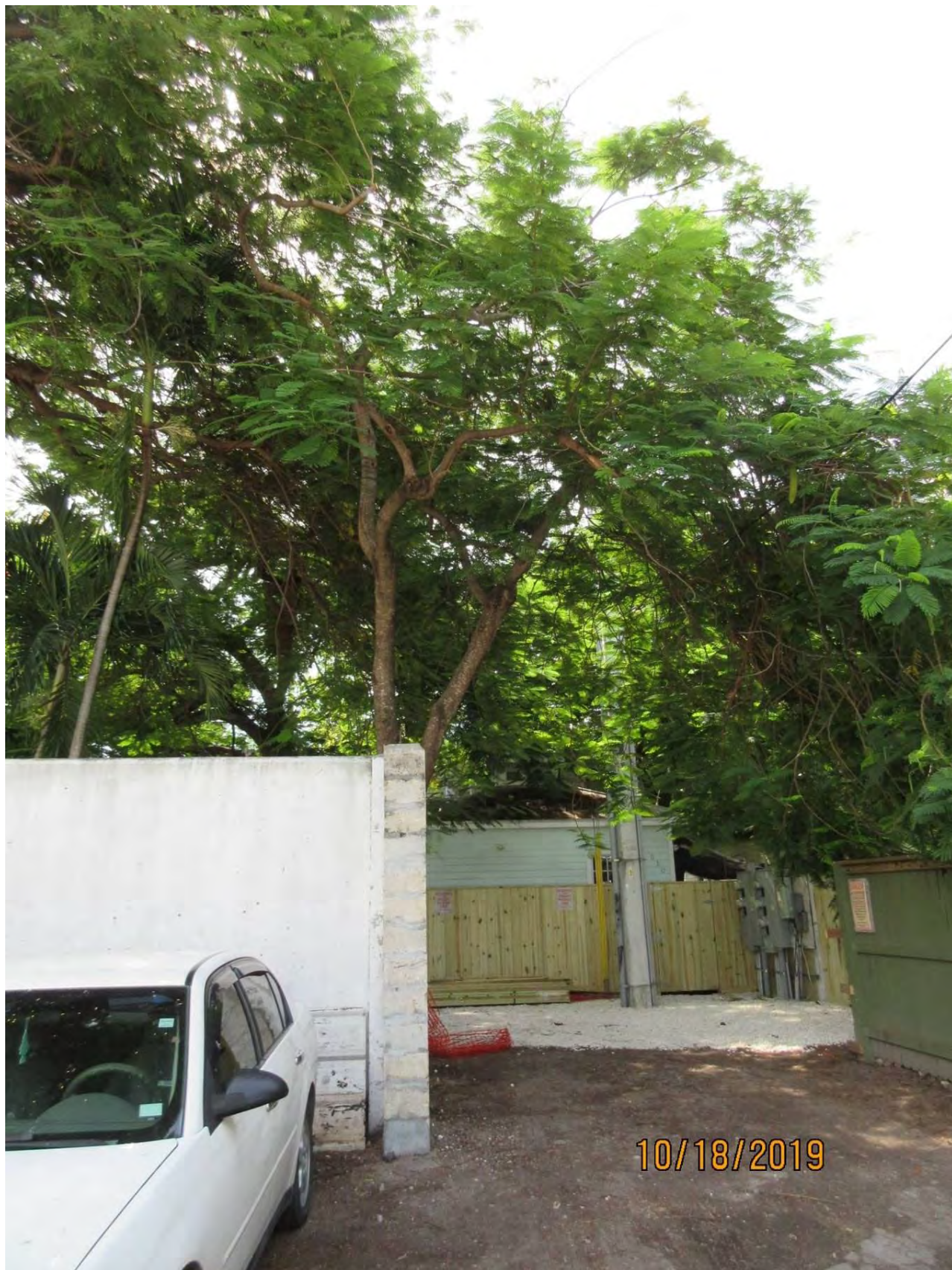
Photo of whole Royal Poinciana tree, view 1.

Tree Species: Royal Poinciana (Delonix regia)