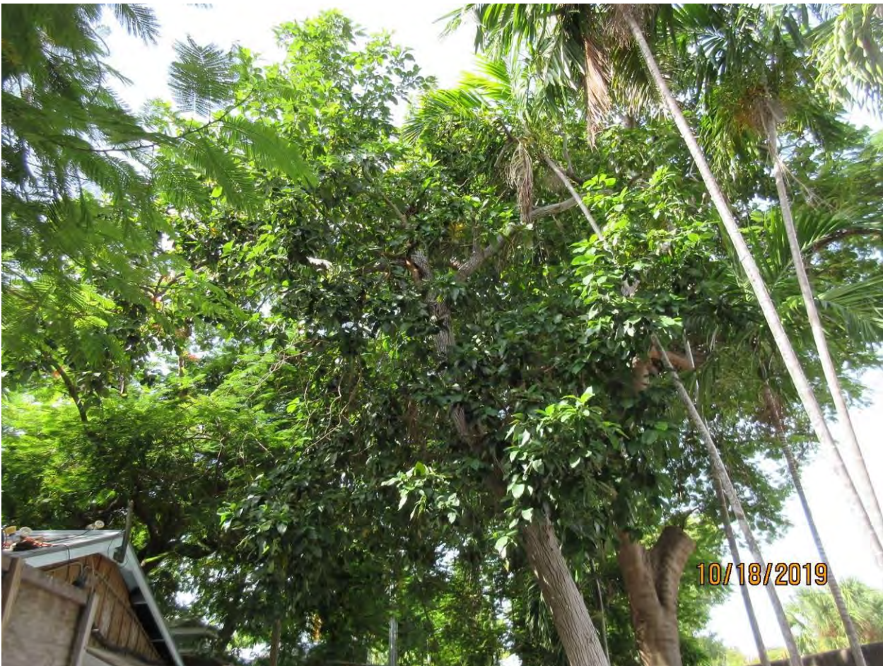
Photo of tree canopy view 2