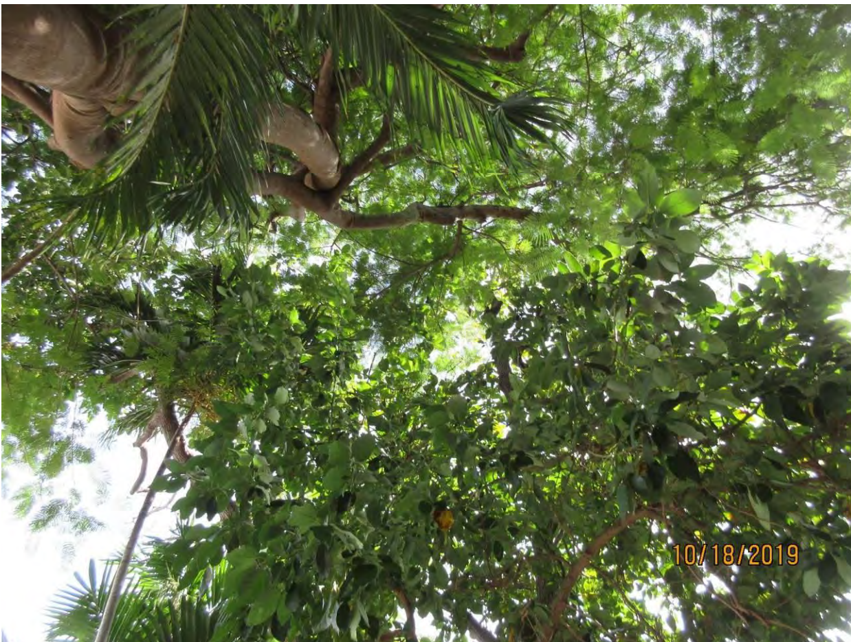
Photo of avocado canopy in relation to large Royal Poinciana tree canopy.