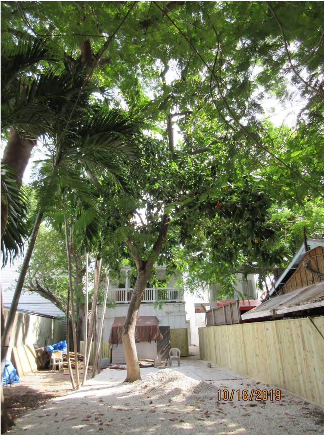
Photo of entire tree, view 2.