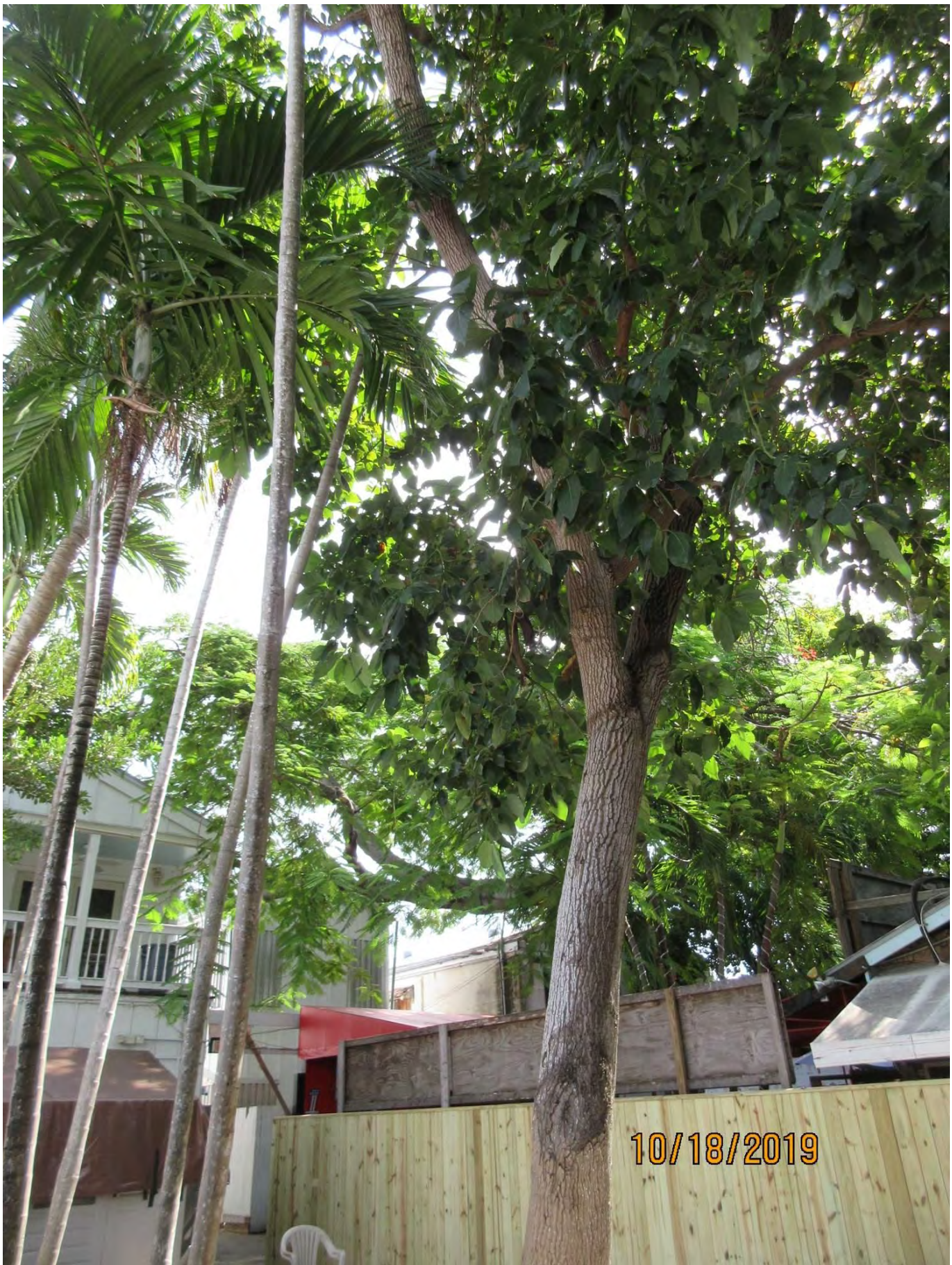
Photo of tree trunk.