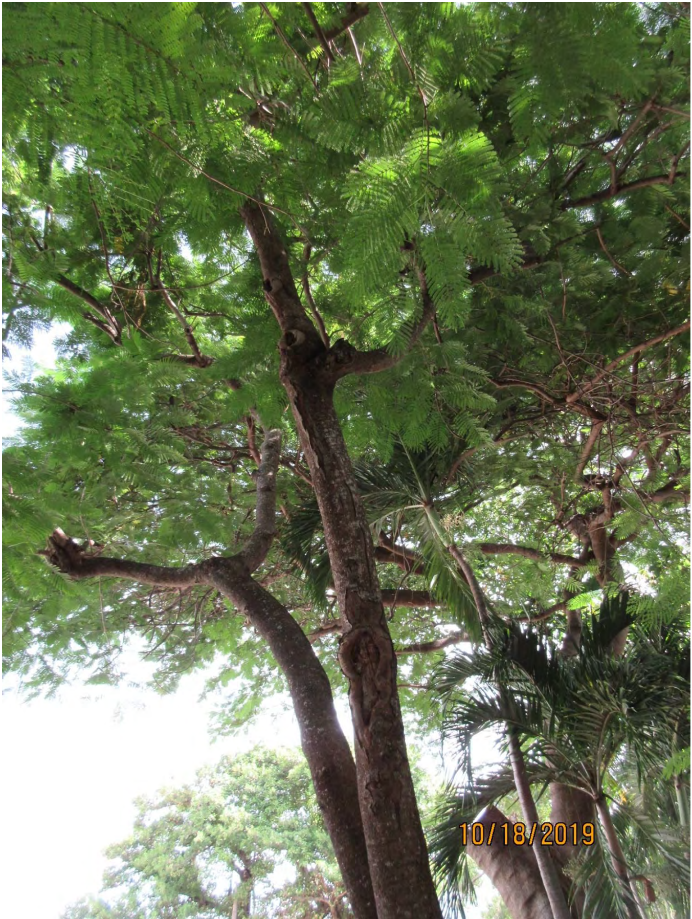
Photo of tree canopy, view 2.