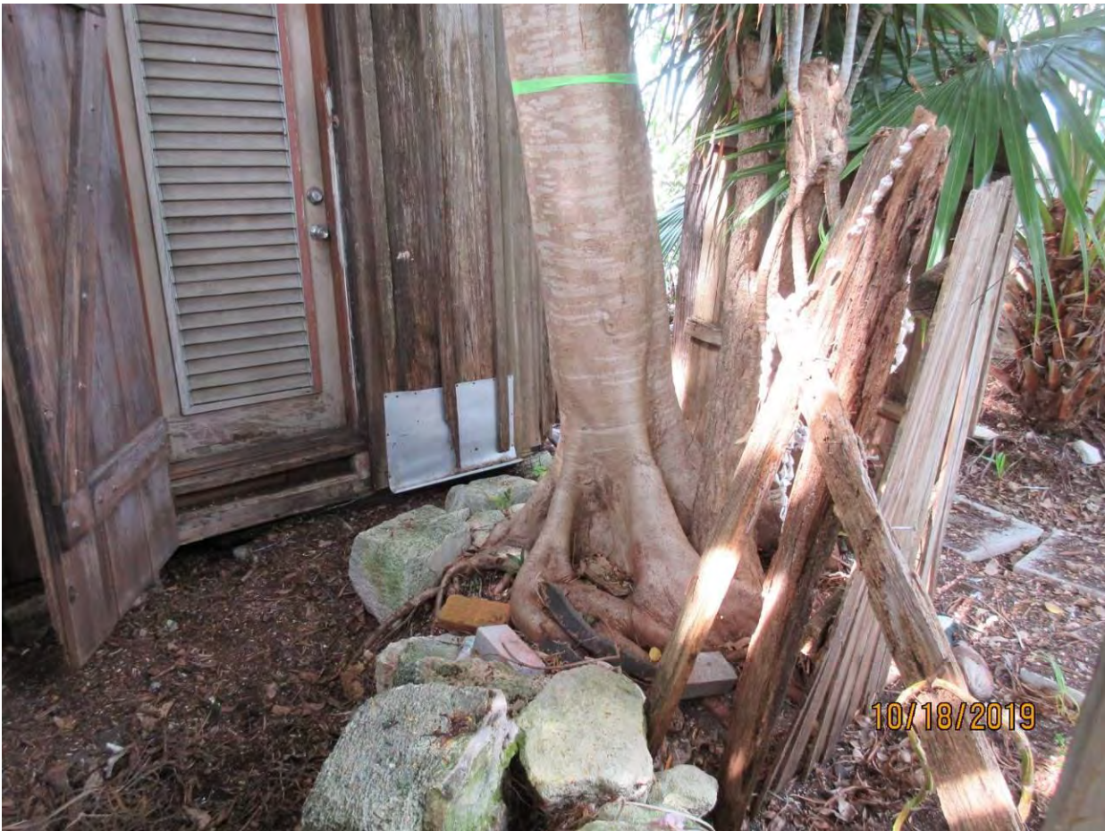
Photo of tree trunk, view 8.