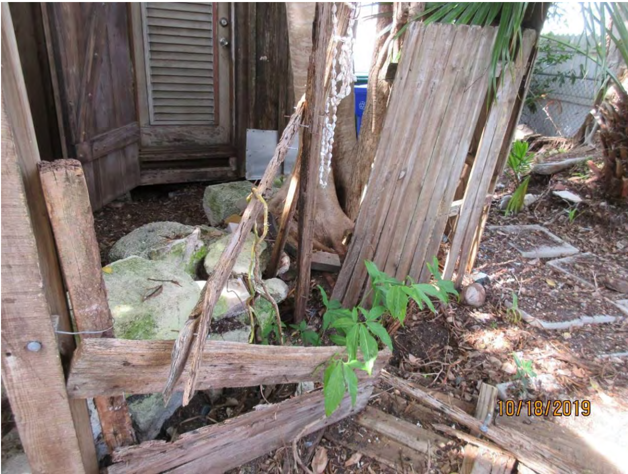
Photo of tree trunk view 7.