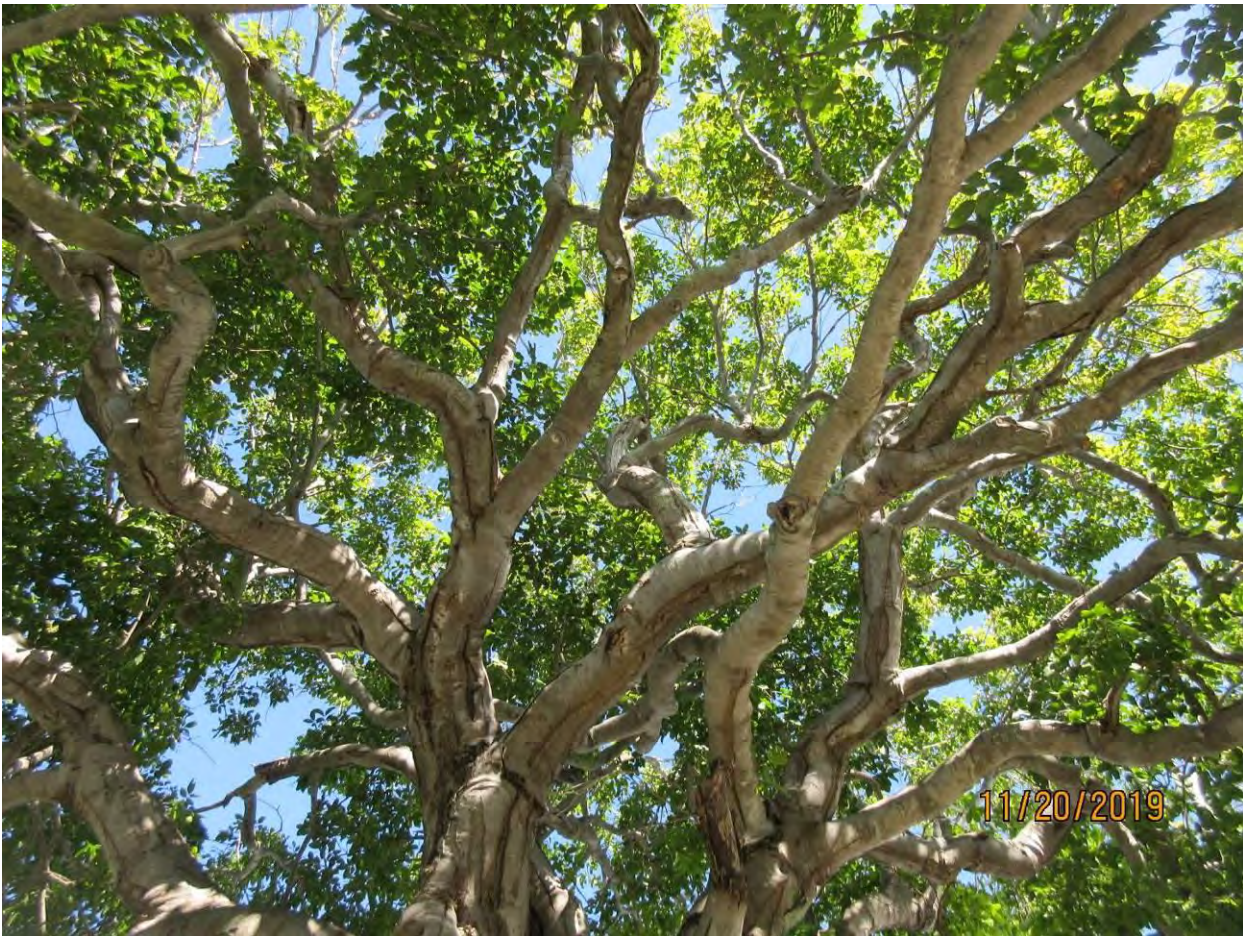
Photo of tree canopy, view 2 and 3.