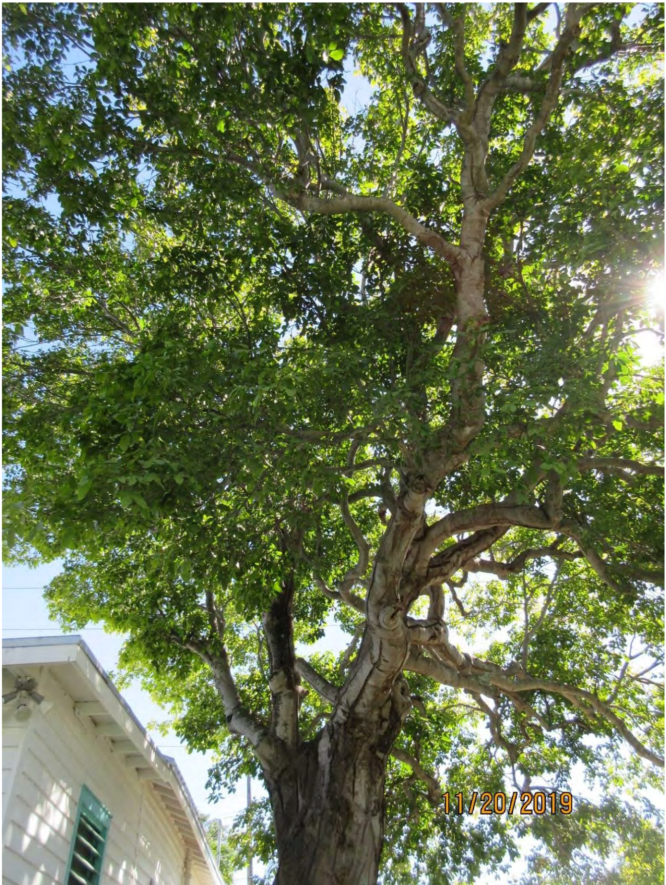
Photo of tree trunk and canopy, view 1.