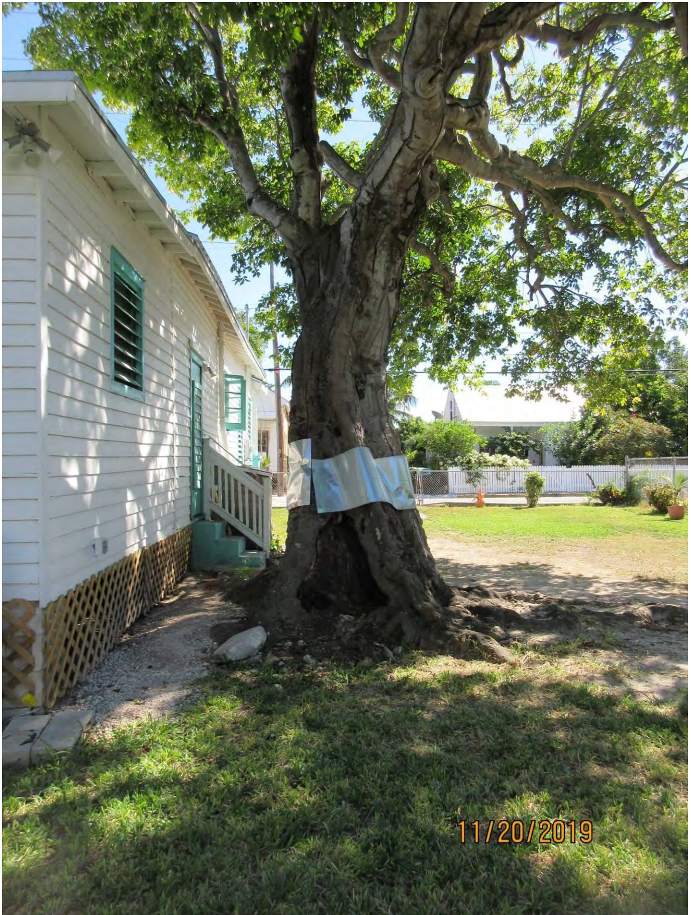
Photo of tree trunk, view 1.