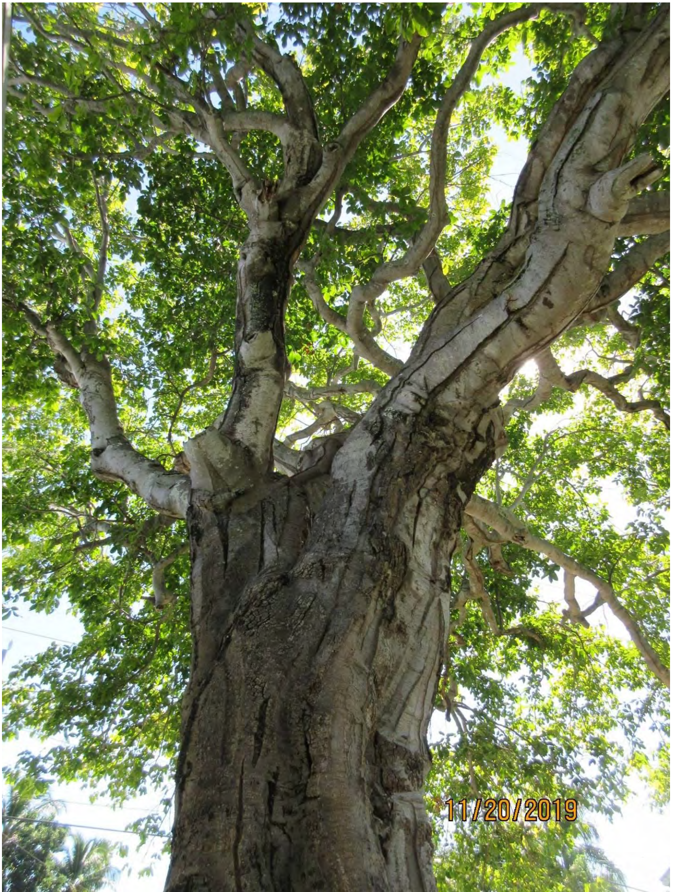
Photo of tree trunk and canopy, view 2.