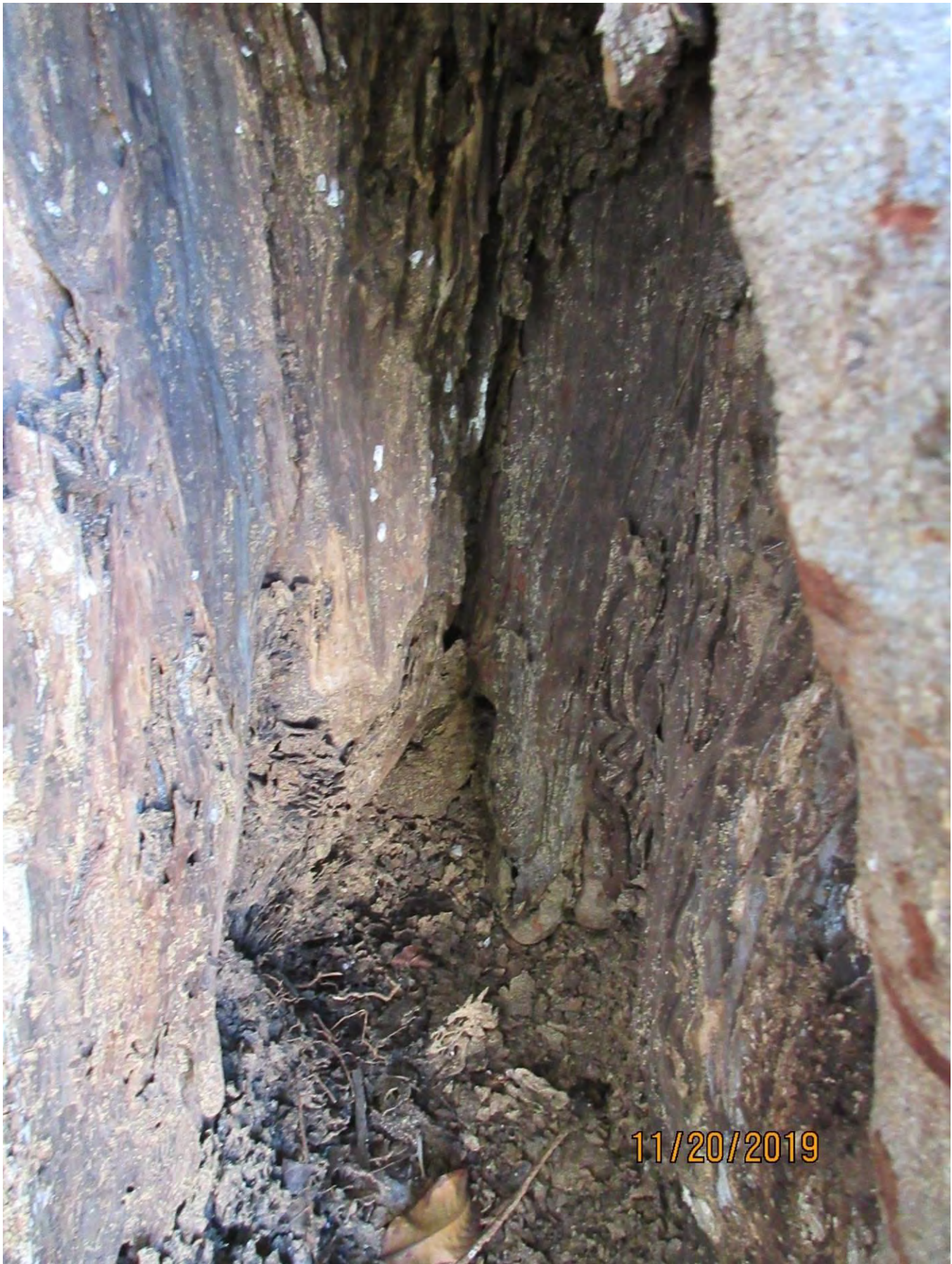
Close up photo of cavity at bae of tree, view 1.