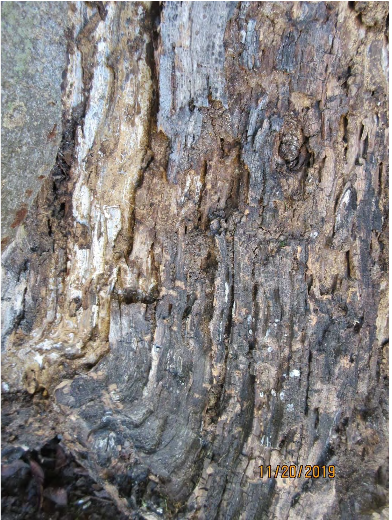
Close up photo of cavity interior wall.