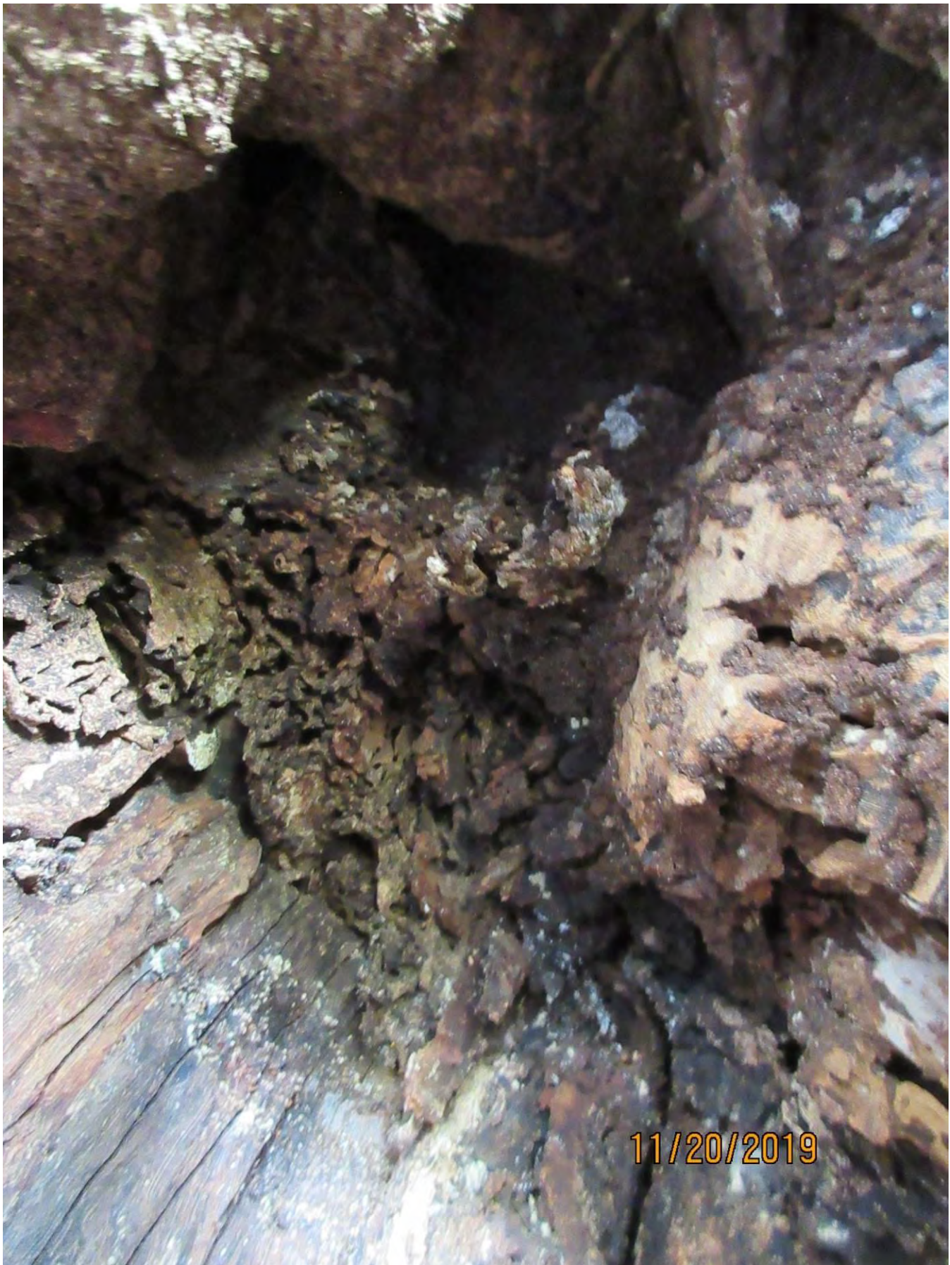
Photo of inside the cavity of tree looking up.