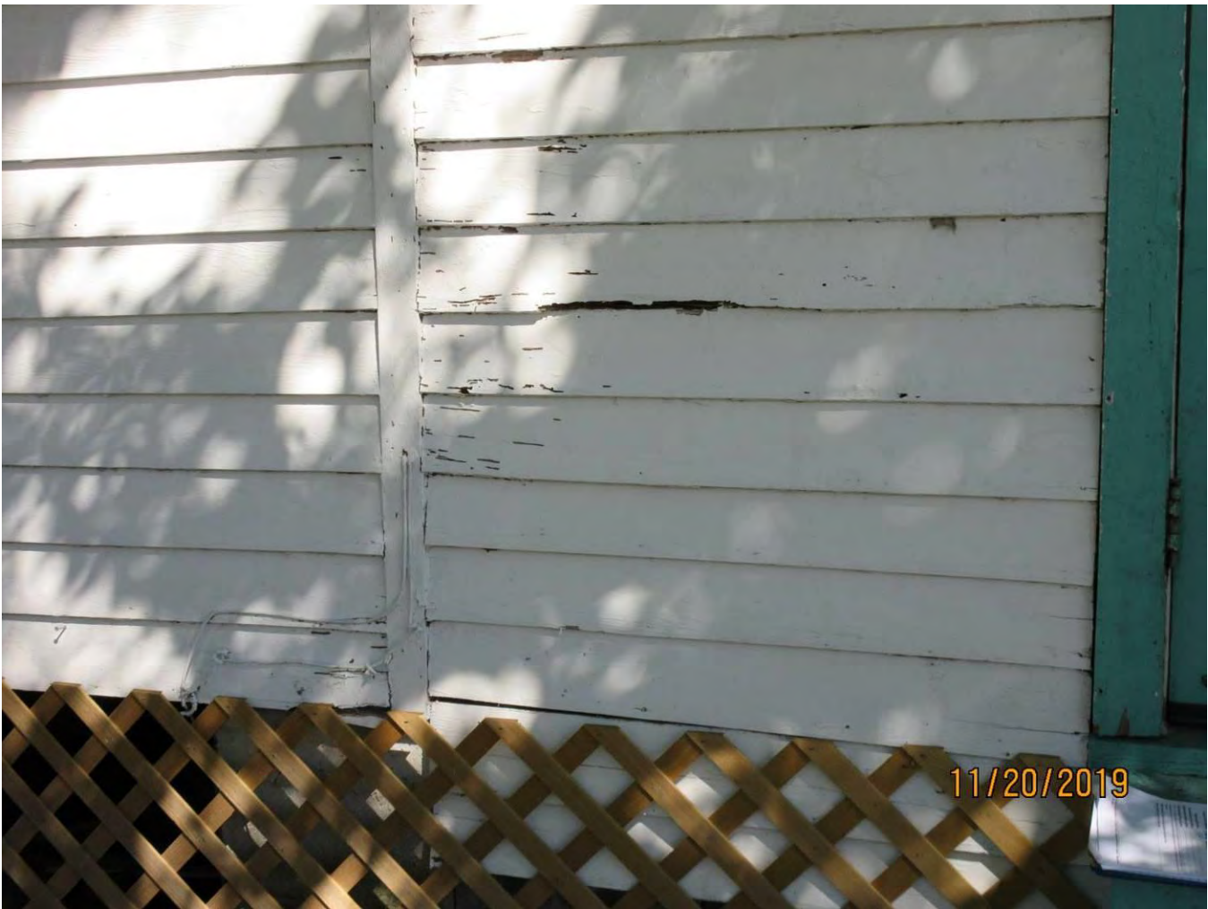
Photo showing termite damage to siding on house closest to tree.