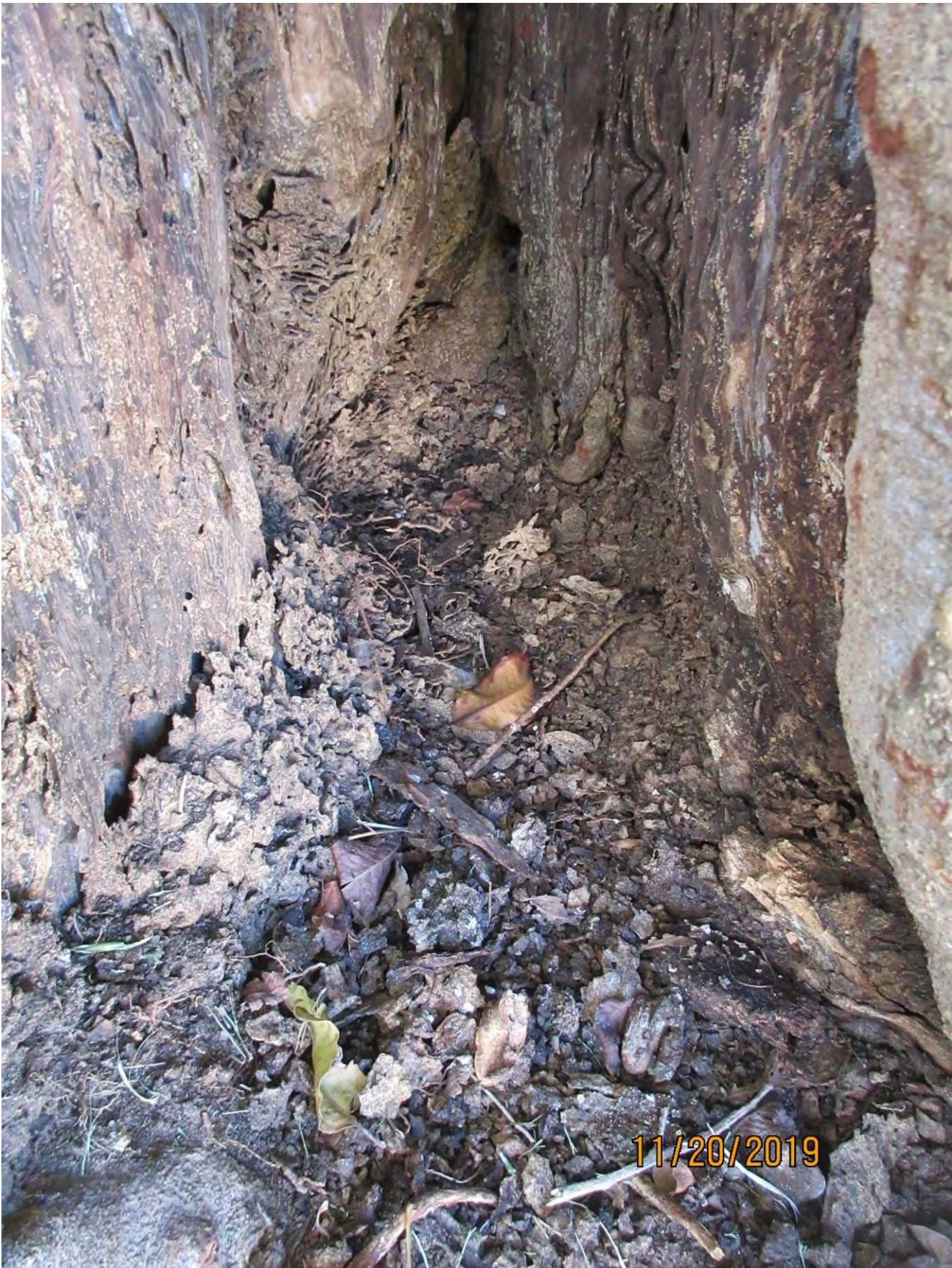
Closeup photo of cavity at base of tree, view 2.