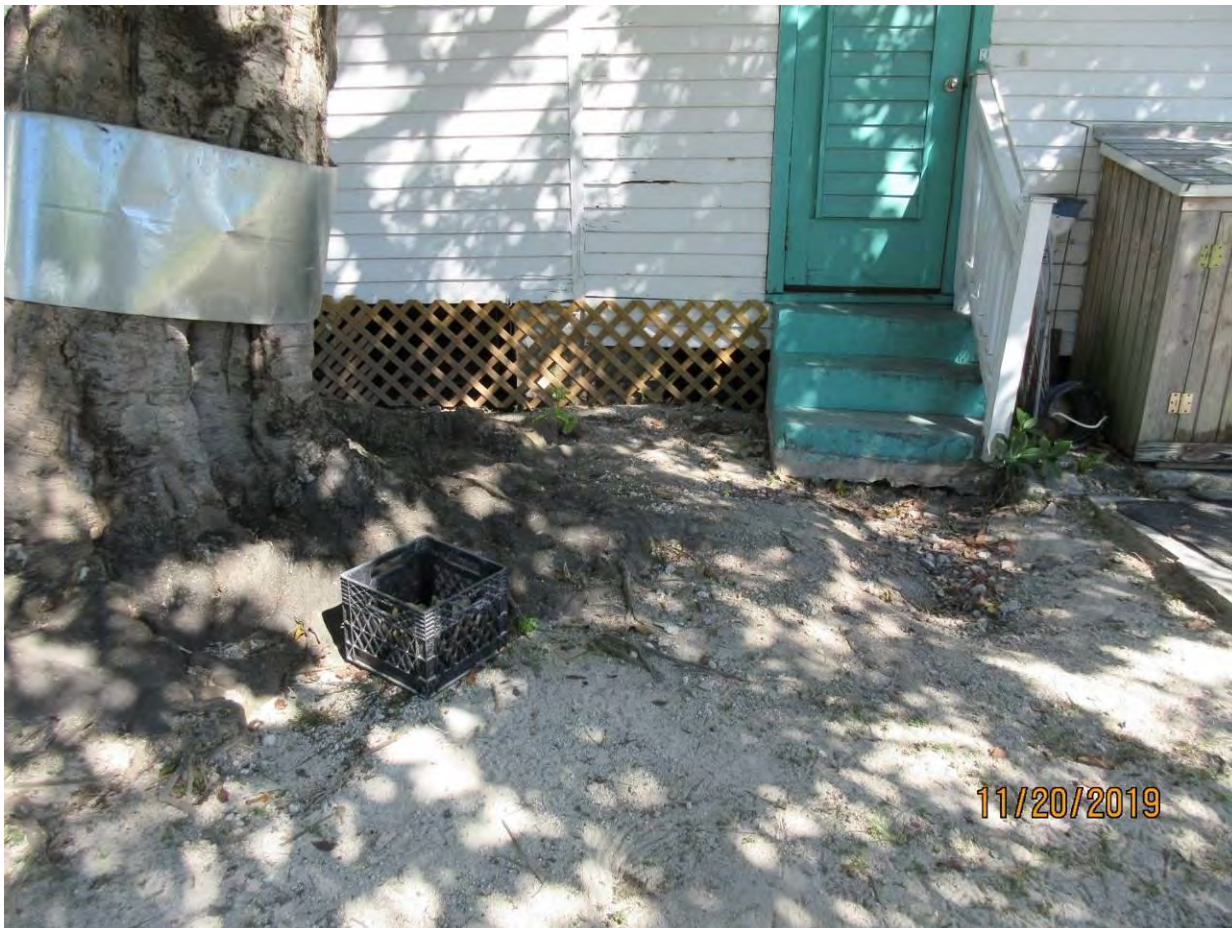
Two photos showing base of tree, view 3 and 4.