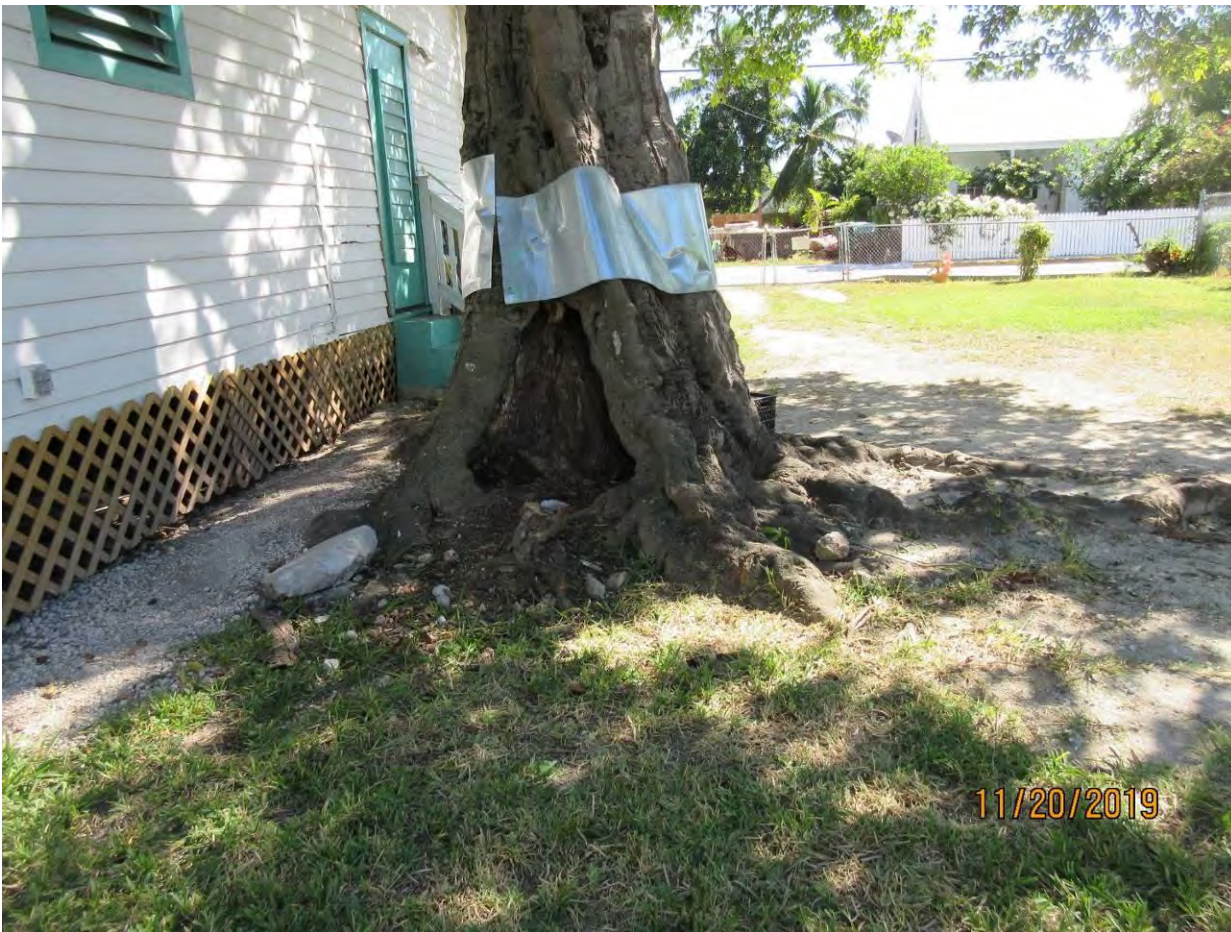
Two photos showing base of tree, view 1 and 2.