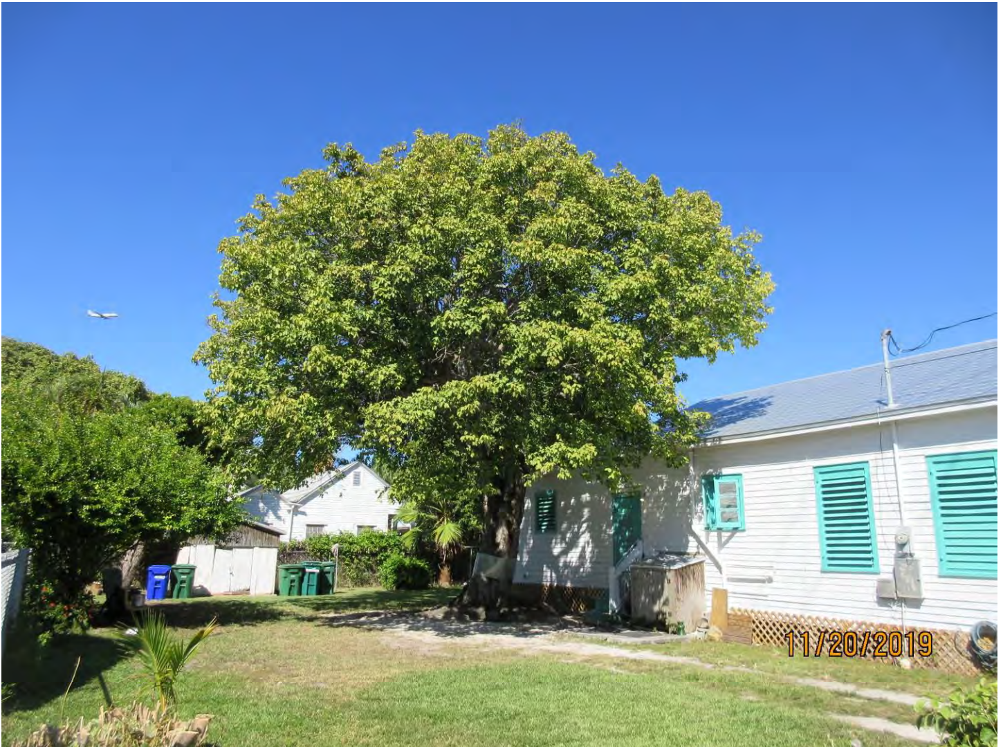
Photo showing location of tree.

Tree Species: Spanish Lime ( Melicoccus bijugatus )