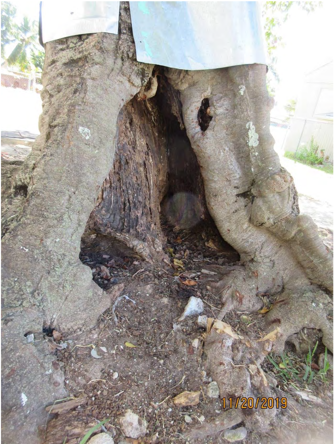
Close up photo of base of tree showing cavity.