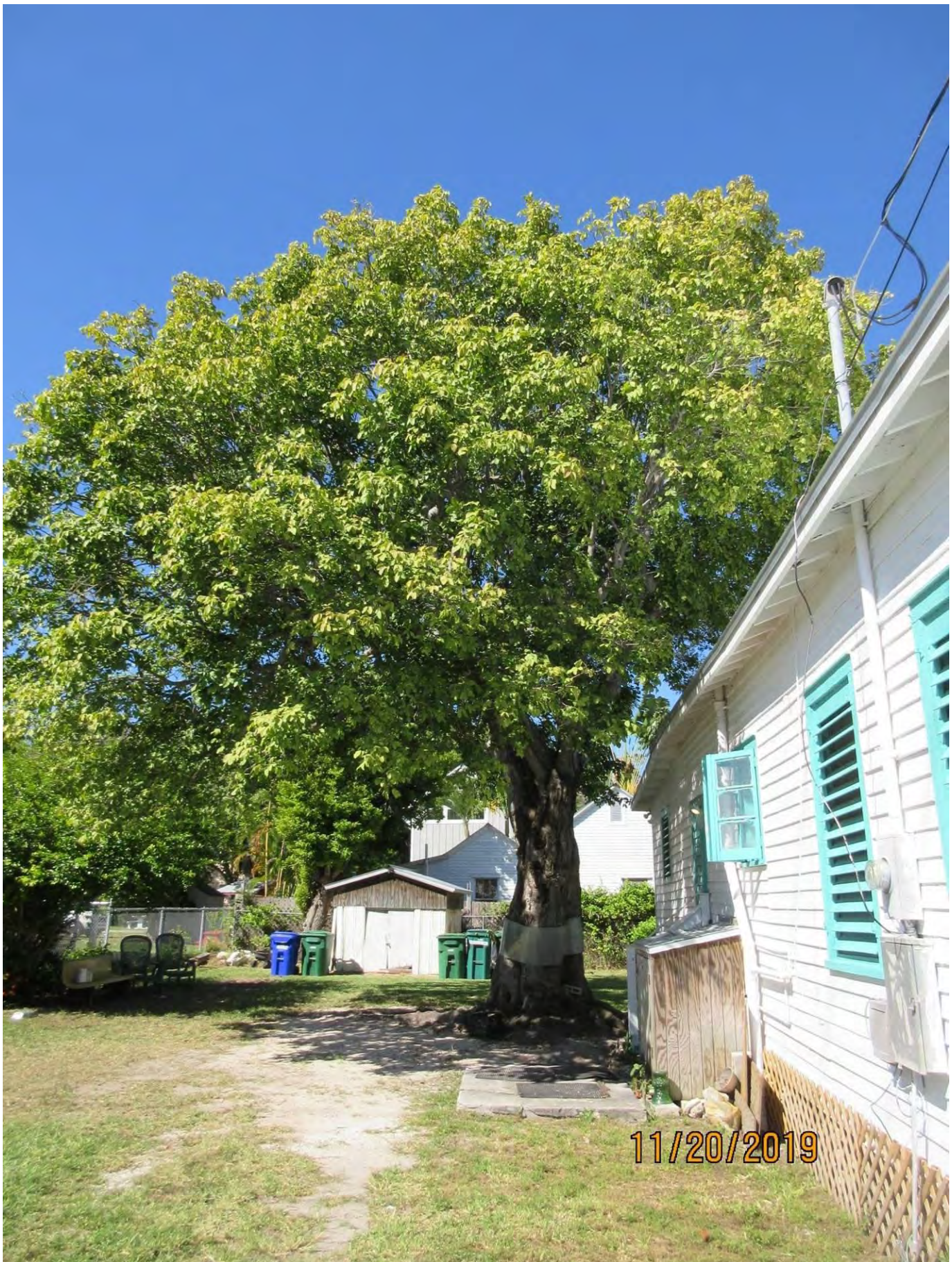
Photo showing entire tree.