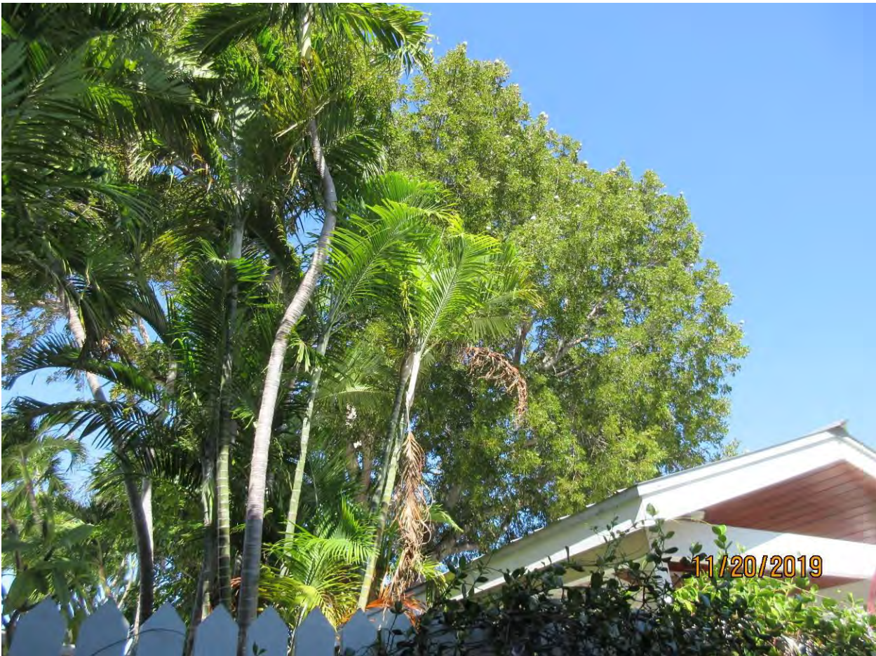
Standing in front of the house, two photos showing canopy of tree, view 1.