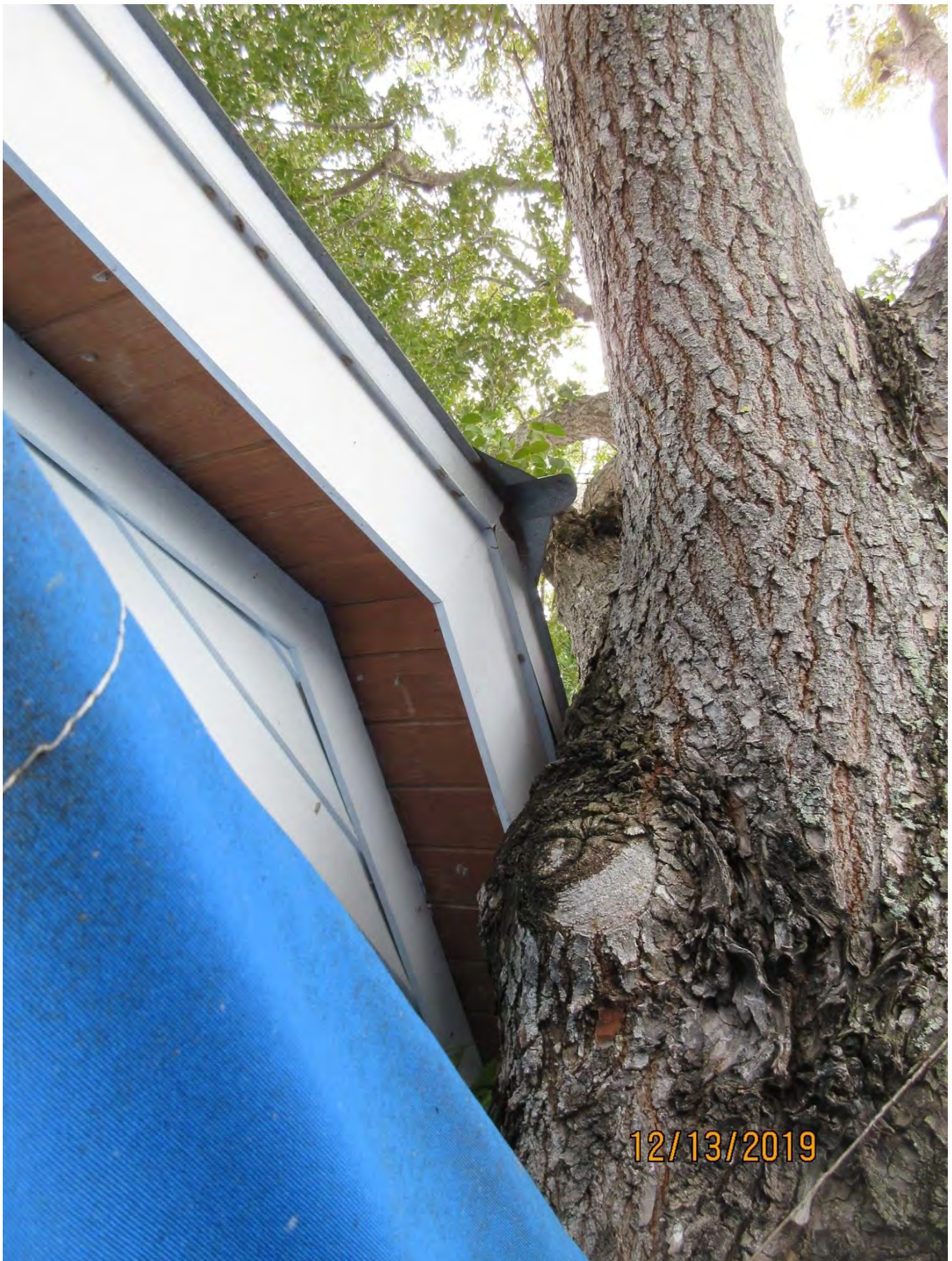
Photo of tree trunk and roof eve damage area, view 2.