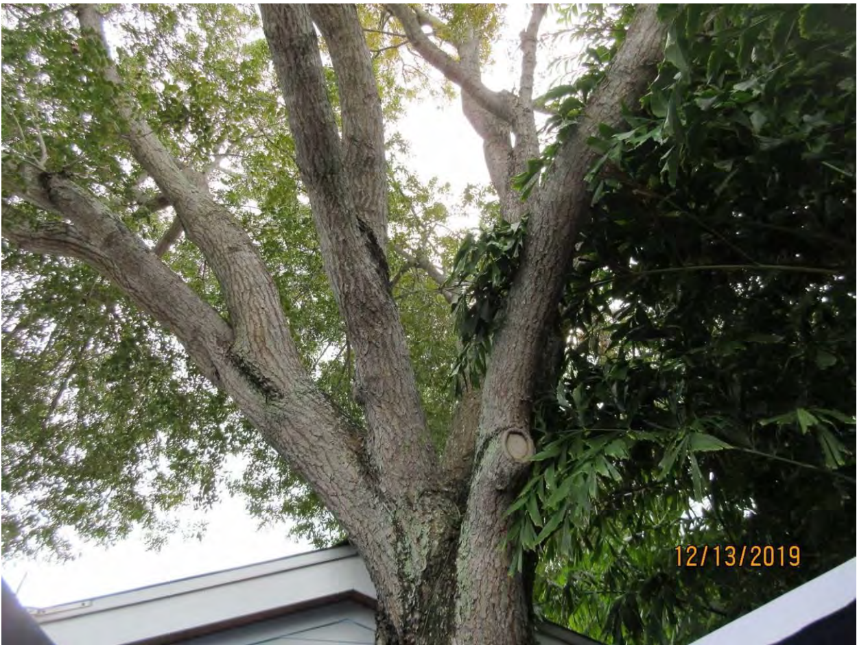
Photos of tree canopy from rear deck area.