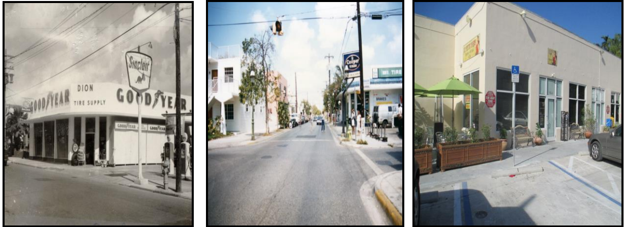
Monroe County Public Library - 1965 photo

The subject property is located at 825 Duval Street within the Historic Residential Commercial Core– Duval Street Oceanside (HRCC-3) zoning district. The principal structure was built circa 1953 and is considered historic and contributing to the Key West Historic District. The property has hosted several businesses through the years, such as automotive repair (see images provided), a museum featuring artwork made from recycled material, retail clothing, grocery stores, professional offices and restaurants with indoor and outdoor consumption.