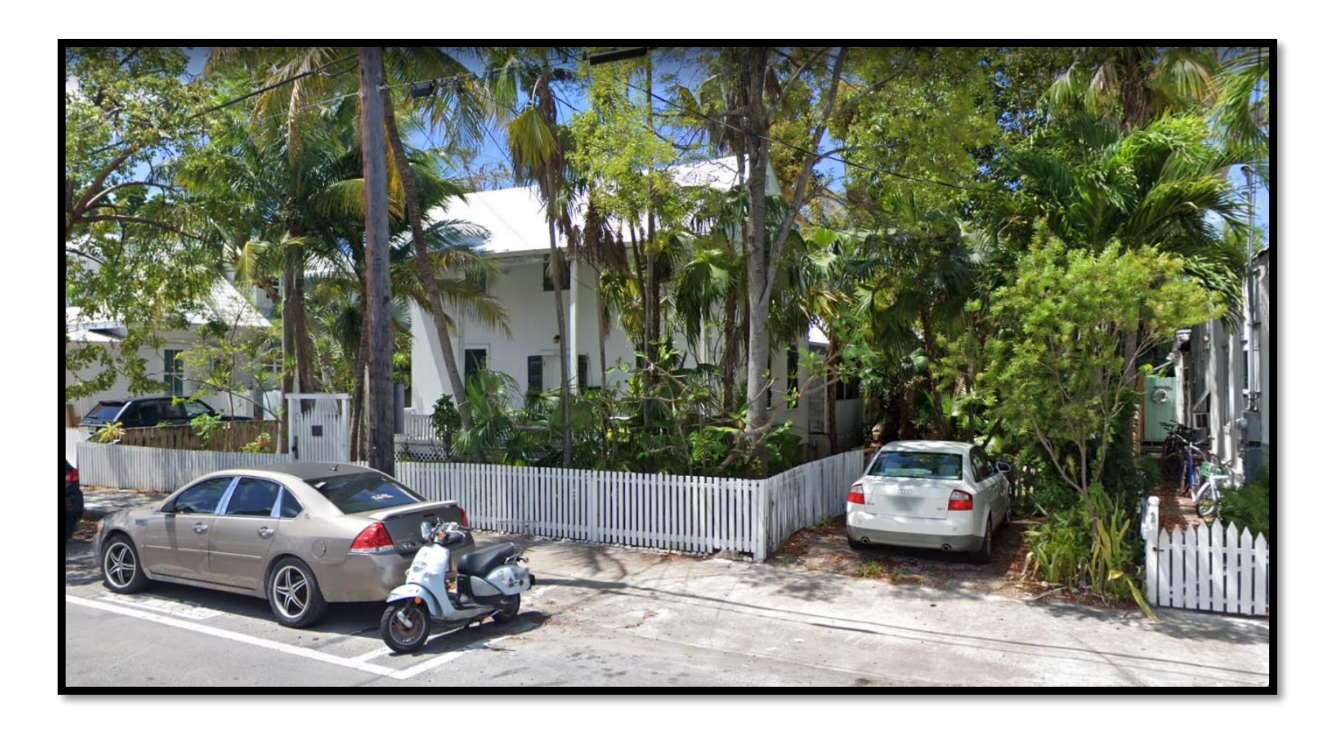
825 Duval Street, 2019