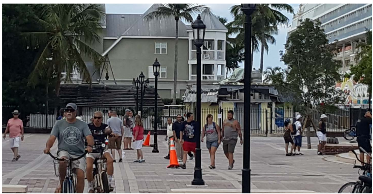
Photograph of the property