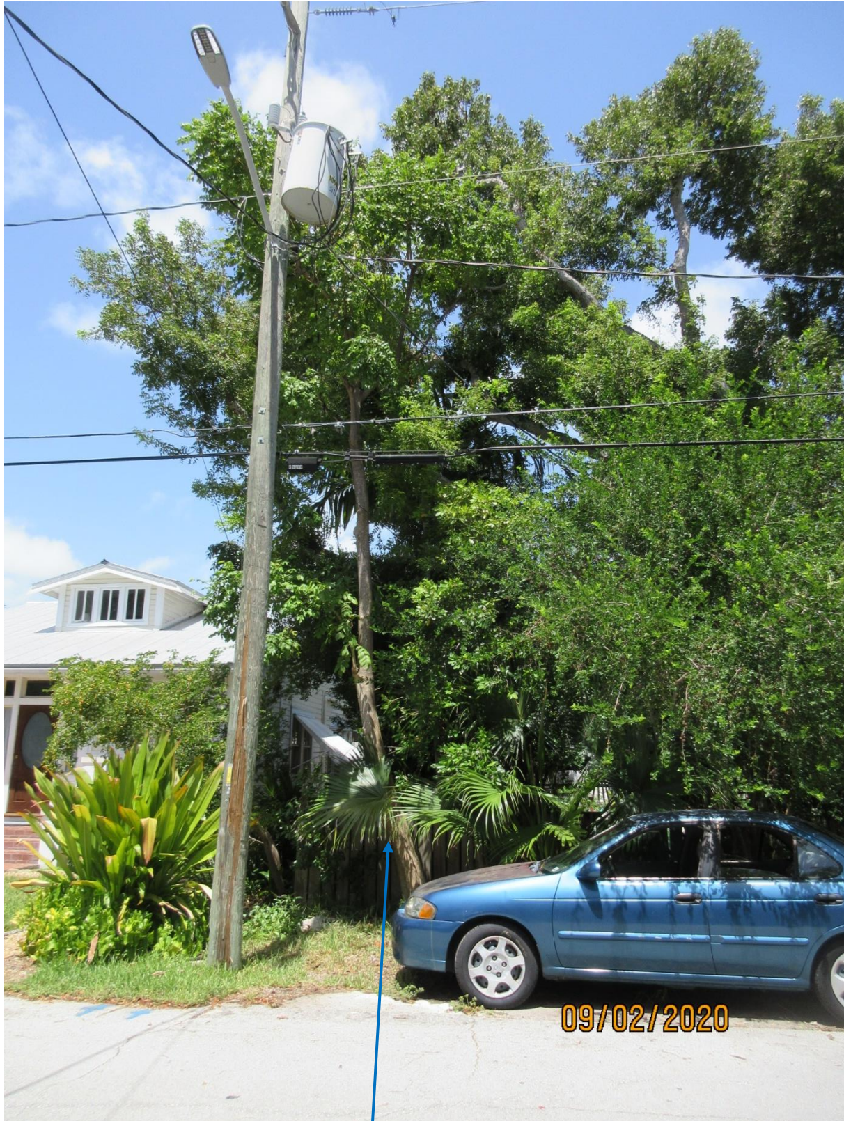
Photo showing tree location.