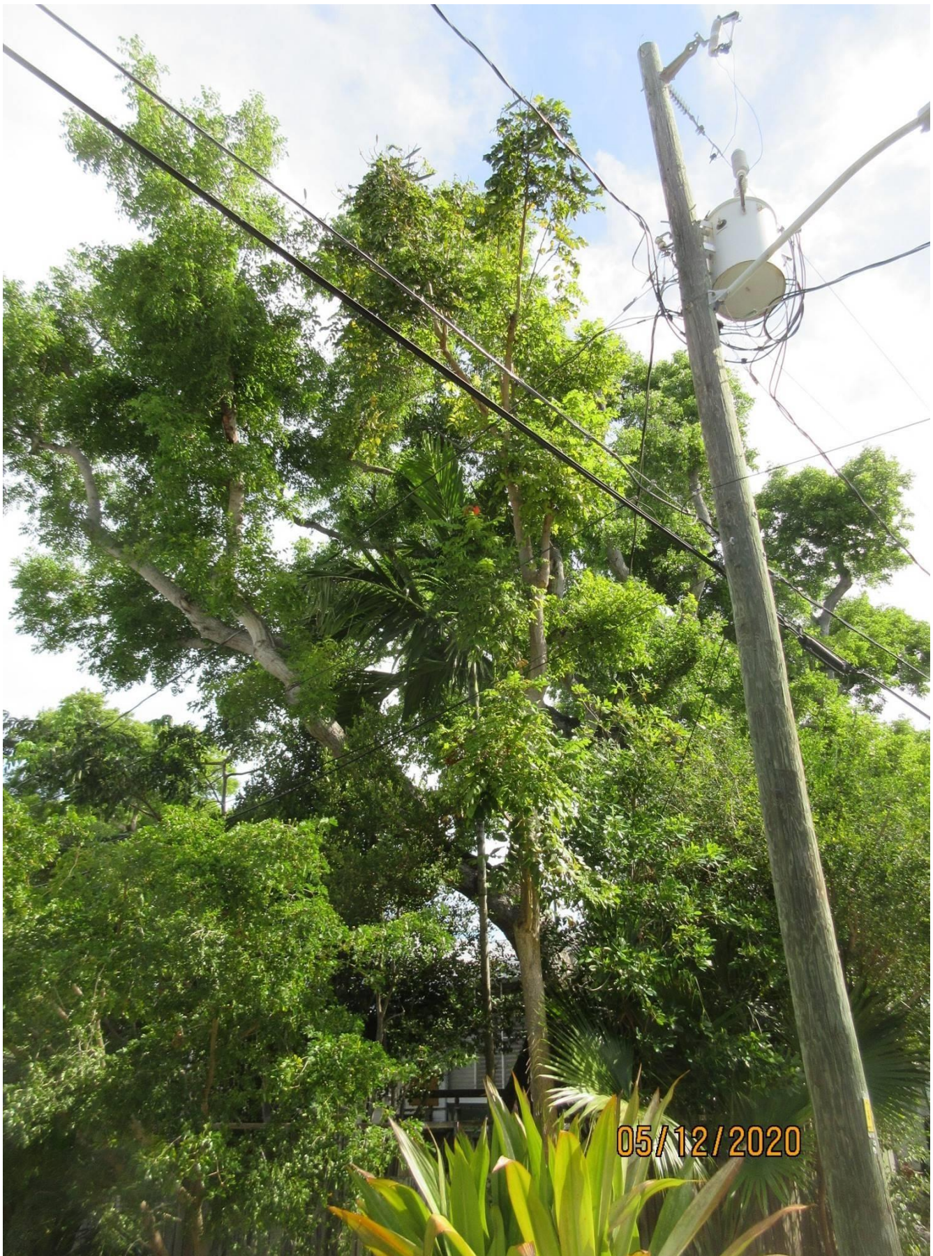
Photo showing trunk and canopy of tree, view 2.