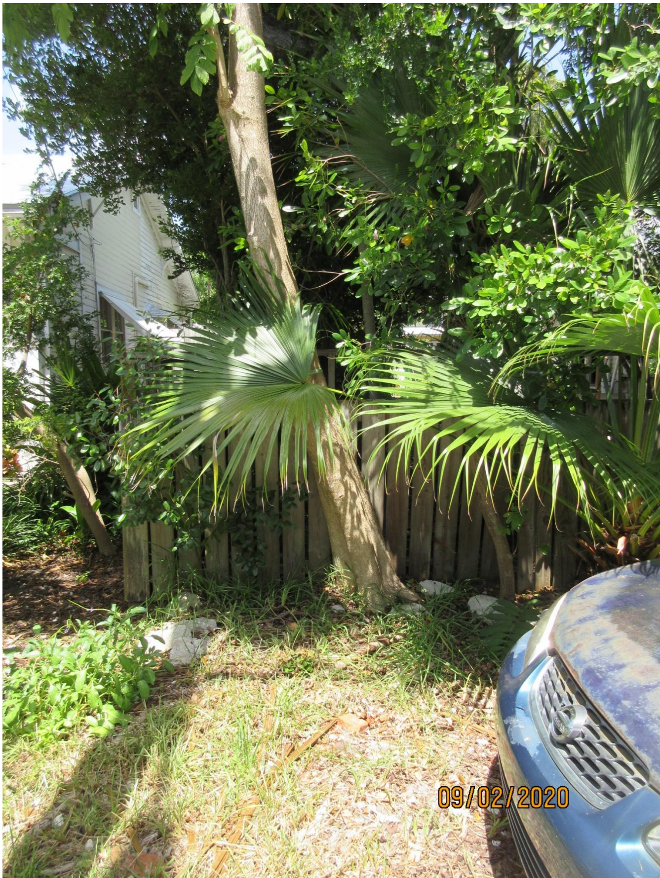
Photo showing base and trunk of tree.