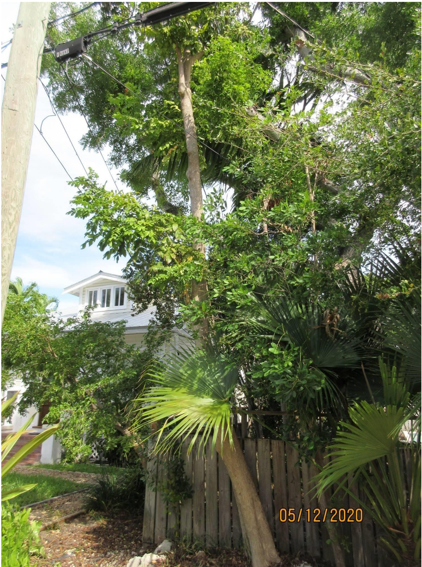
Photo showing trunk of tree, view 1.