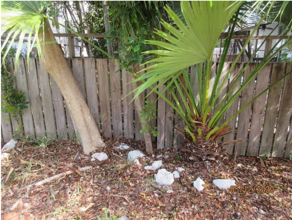
Two photos showing base of tree.