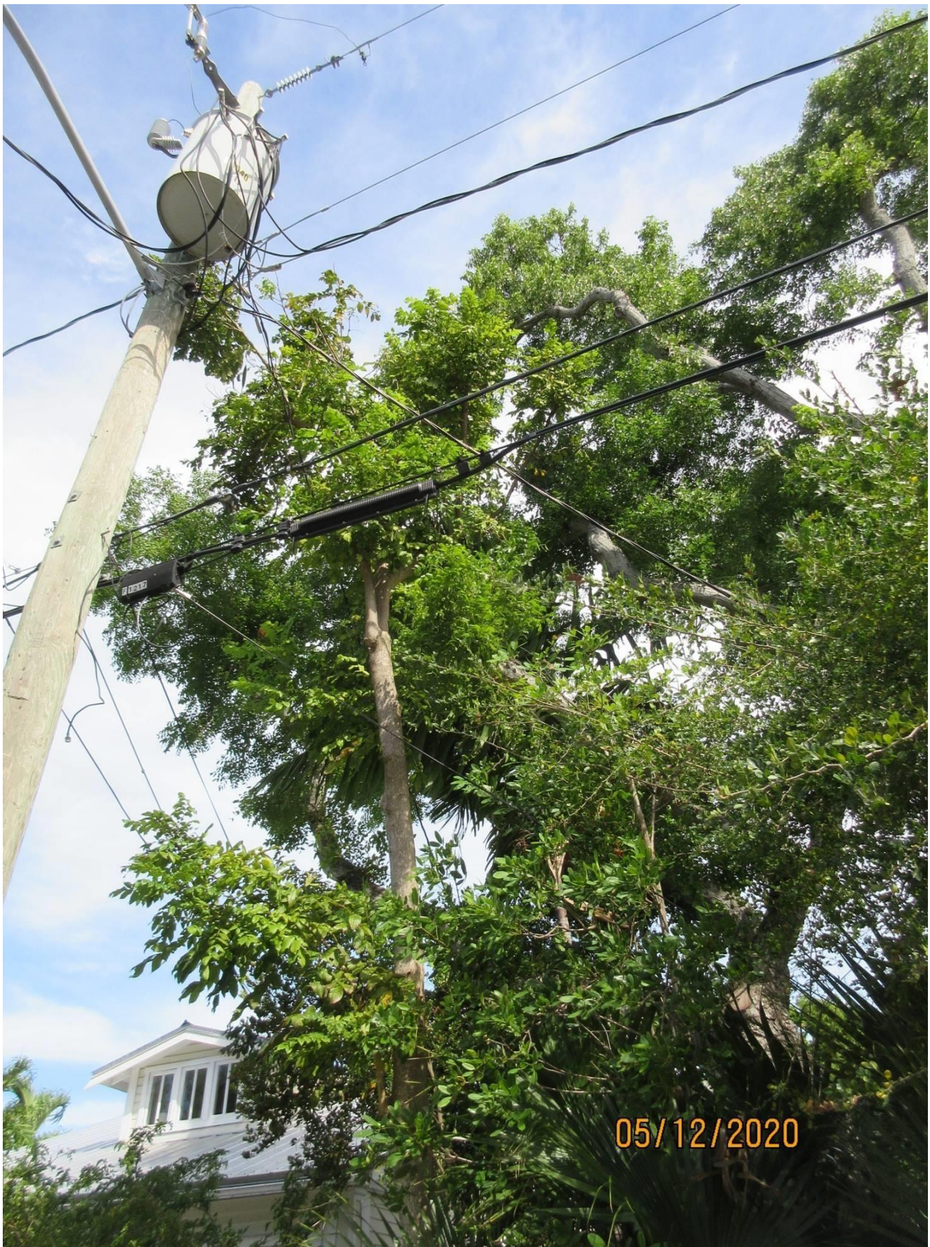
Photo showing trunk and canopy of tree, view 1.