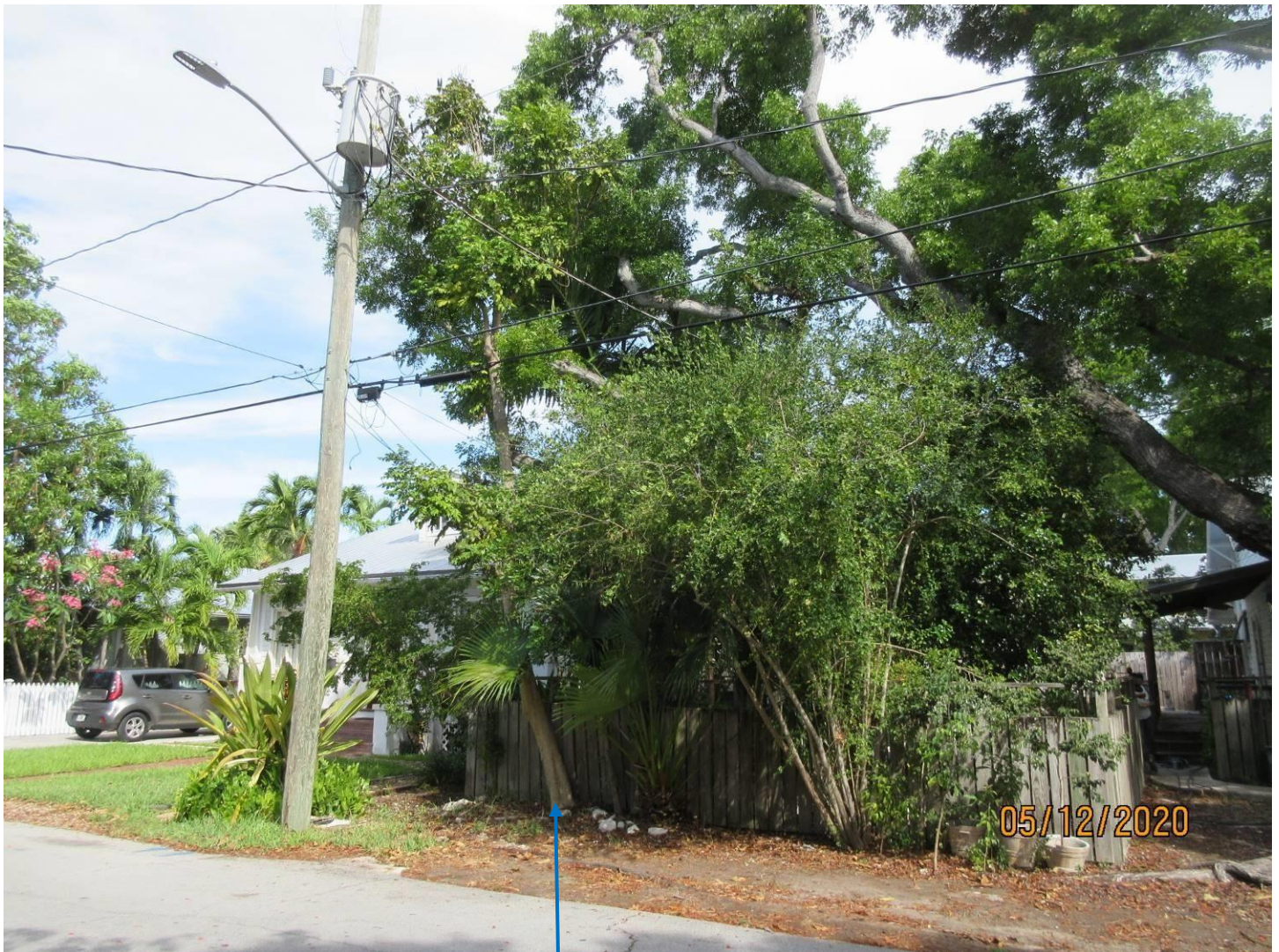
Photo showing location of tree.

Tree Species: African Tulip ( Spathodea campanulate )