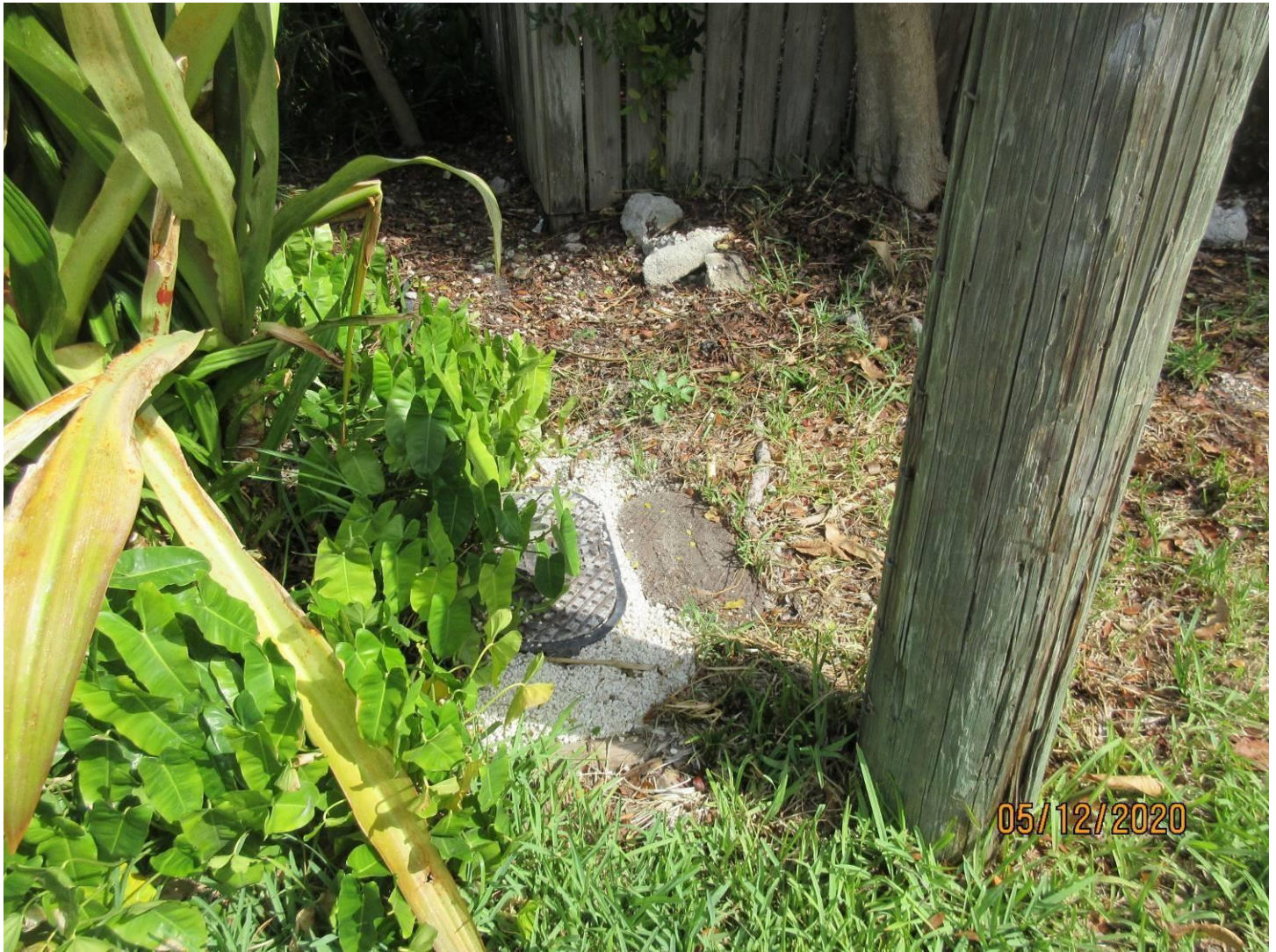
Photo showing location of utilities in relation to base of tree.