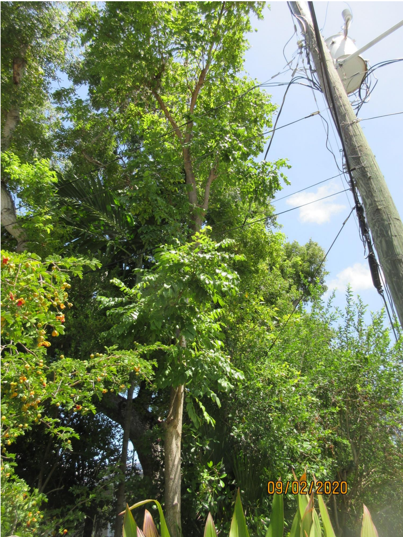
Photo showing tree canopy. Note there is a large Mahogany tree growing behind the African Tulip tree.