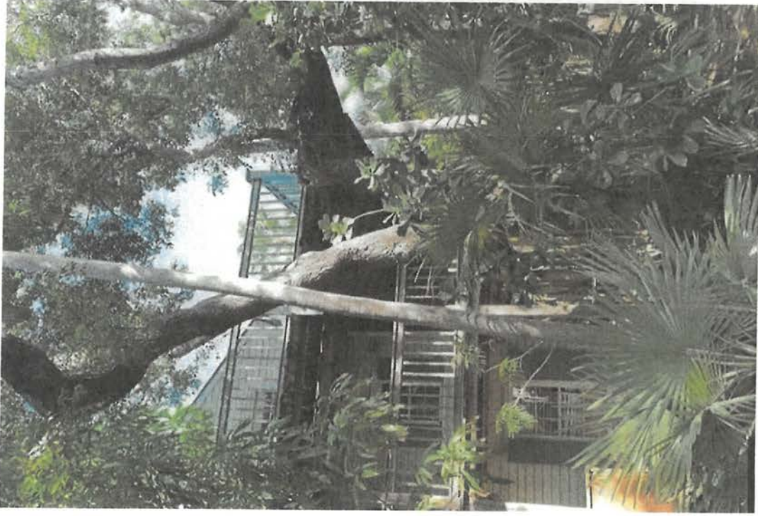
#8 & #9 Chinese Fan Palm