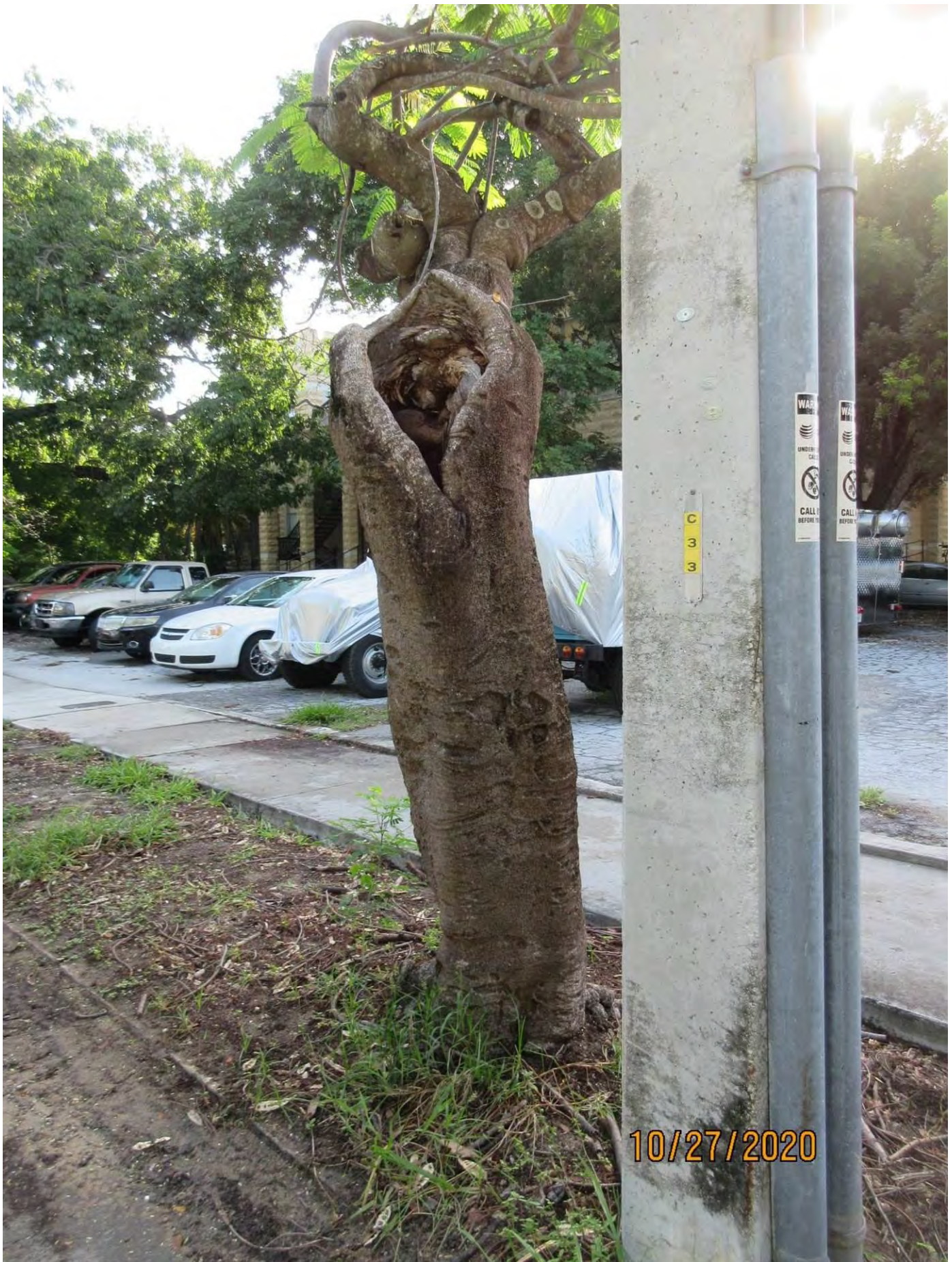
Photo showing base and trunk of tree, view 2.