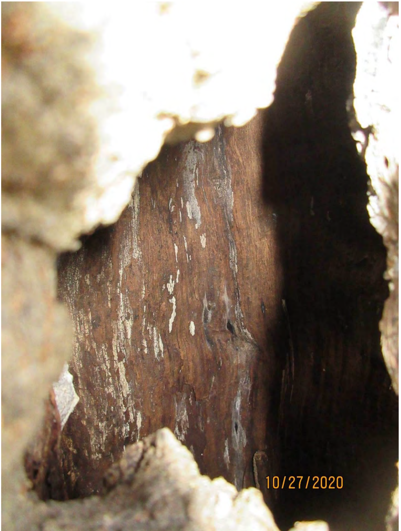
Close up of open area in tree trunk looking inside trunk.