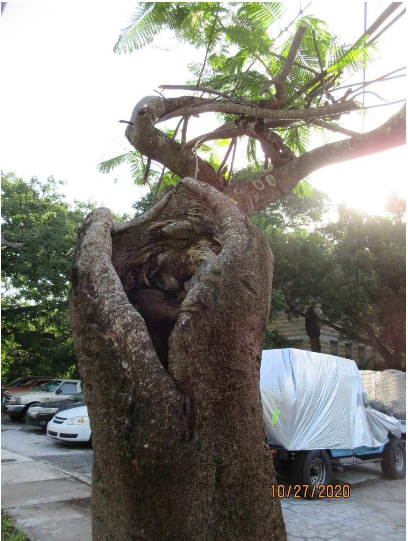
Close up photo showing injury-tear area of tree trunk at canopy juncture, view 1.