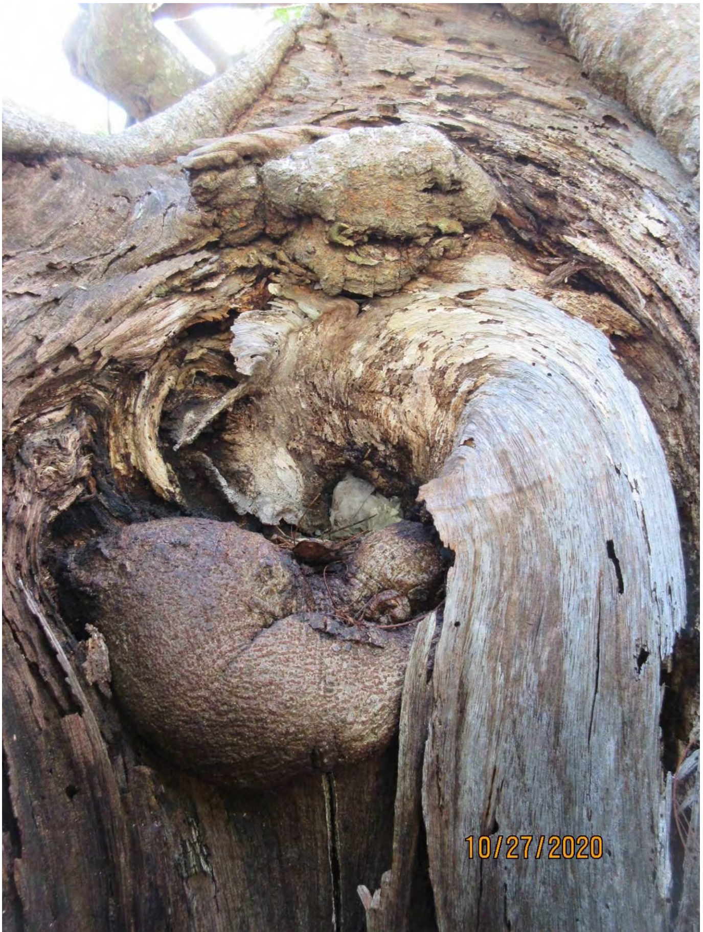
Close up photo showing injury-tear area of tree trunk at canopy juncture, view 2.