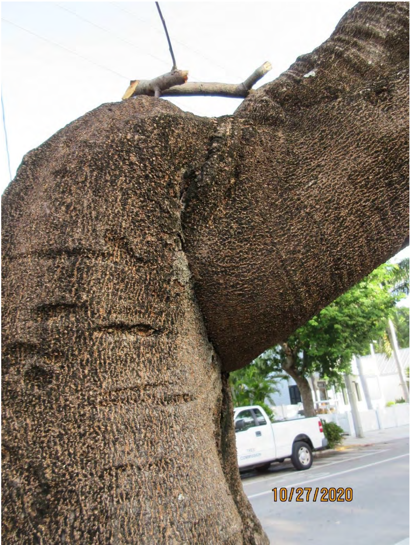
Photo showing trunk and main canopy branch juncture-included bark area, view 2.