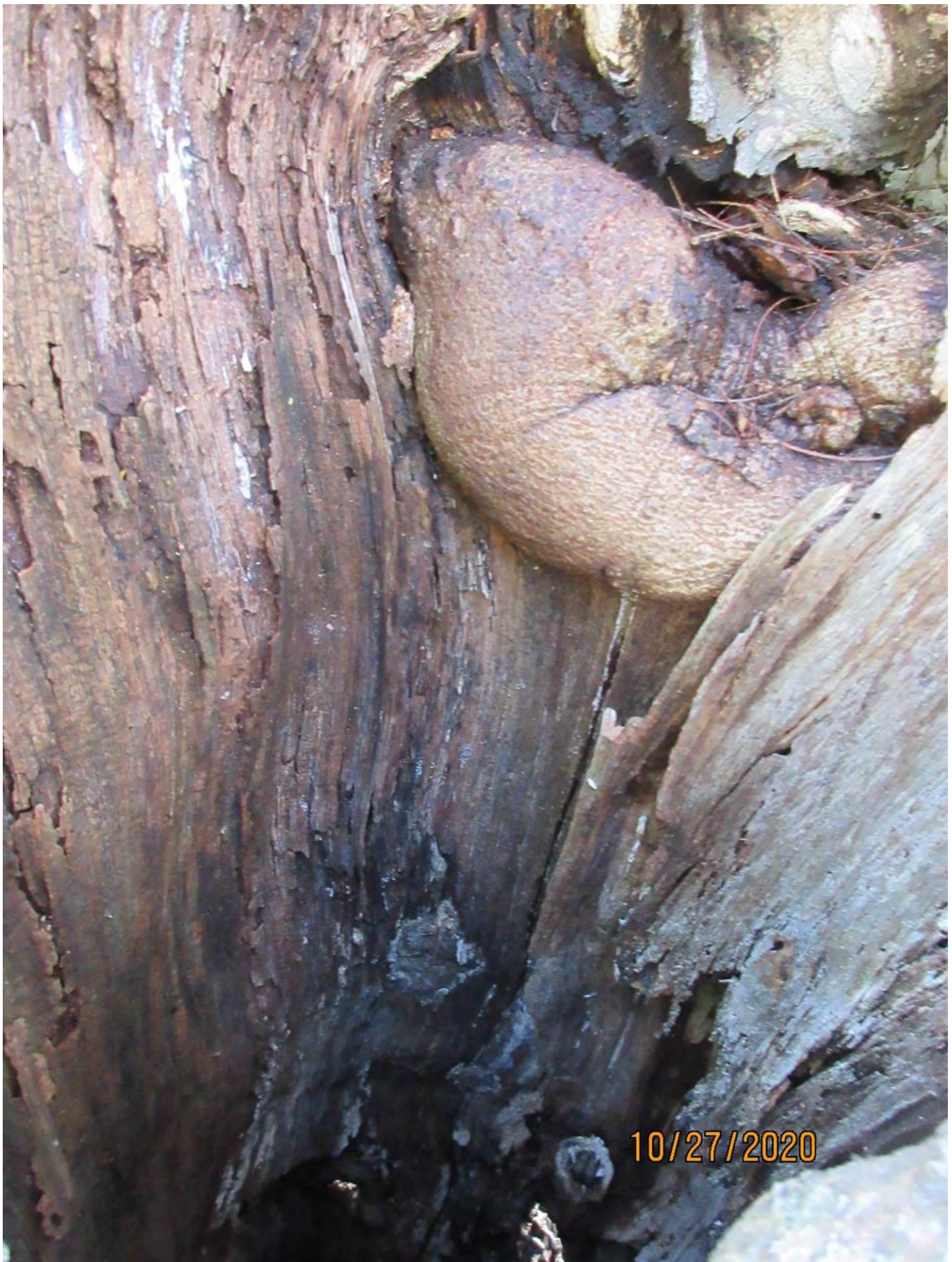
Close up photo showing injury-tear area of tree trunk looking down into trunk..