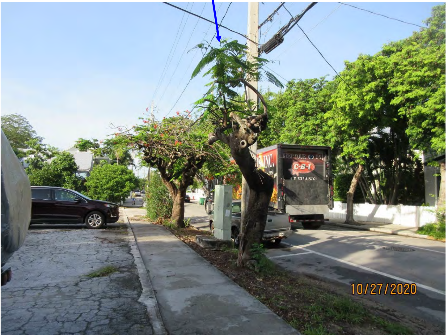
Photo of tree location.

Tree Species: Royal Poinciana ( Delonix regia )