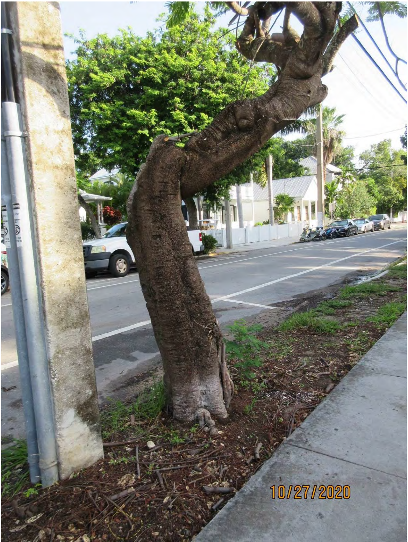
Photo showing base and trunk of tree, view 1.