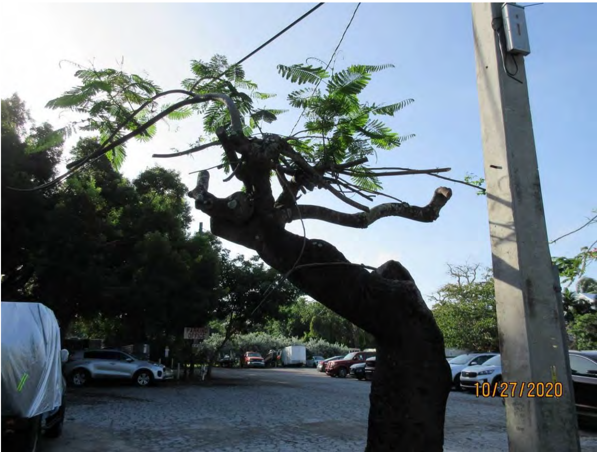
Photo showing tree canopy.