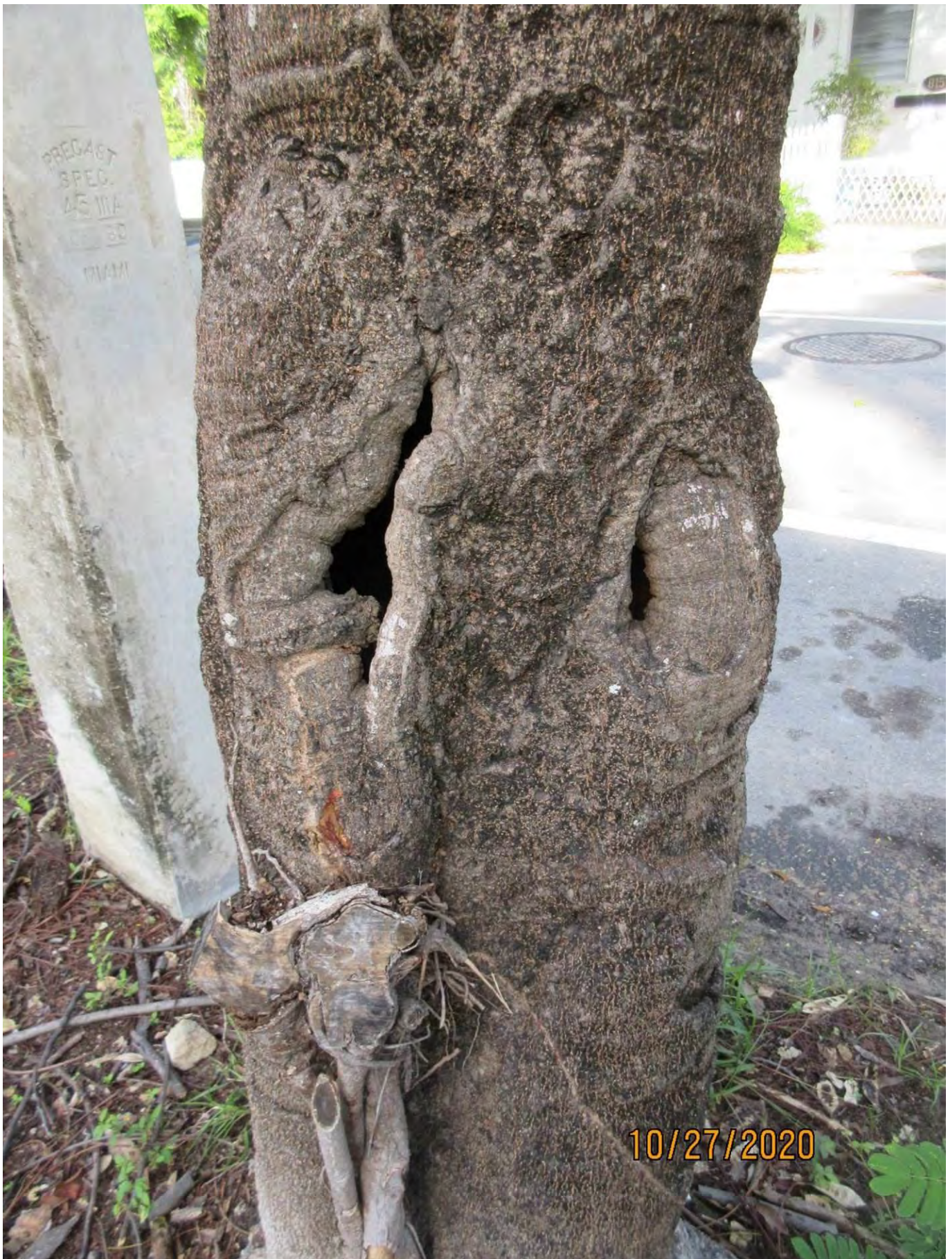
Photo showing trunk of tree with open areas.