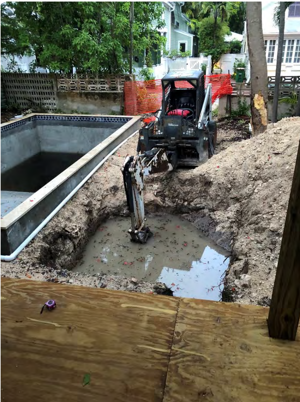
Photo showing backhoe next to damaged tree, view 1.

On July 31, 2020, during a site visit regarding a building permit application to install an underground propane tank, it was documented that the hole for the tank had been dug and the contractor had damaged the trunk of a nearby Royal Poinciana tree. Contractor stated (Como Keys Propane) that a subcontractor had done the work. They agreed to shift the tank location and to hire an arborist to do future tree repair work.