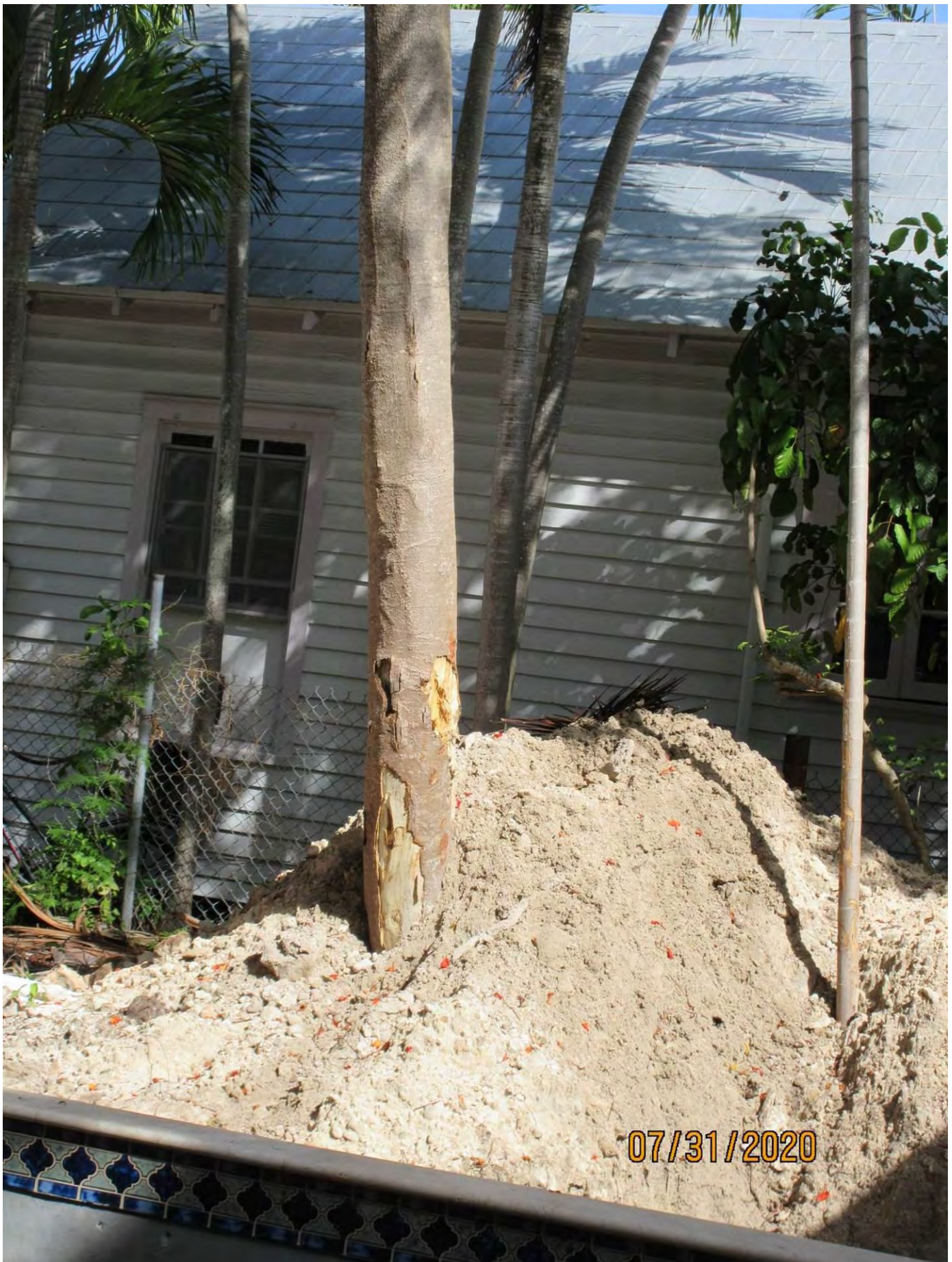
Closeup photo of damaged tree trunk, view 1.