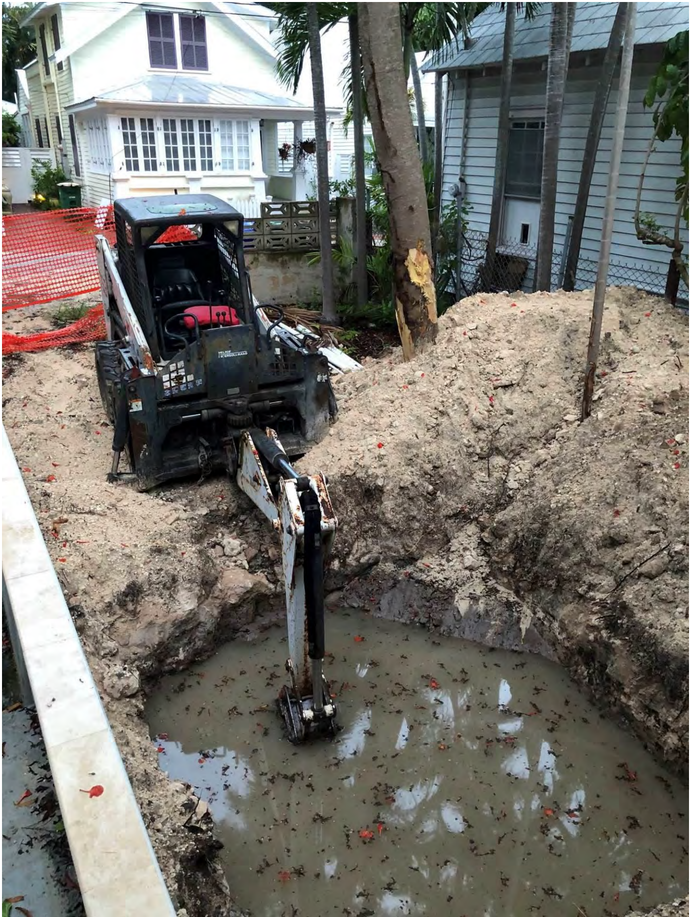
Photo showing backhoe next to damaged tree, view 2.