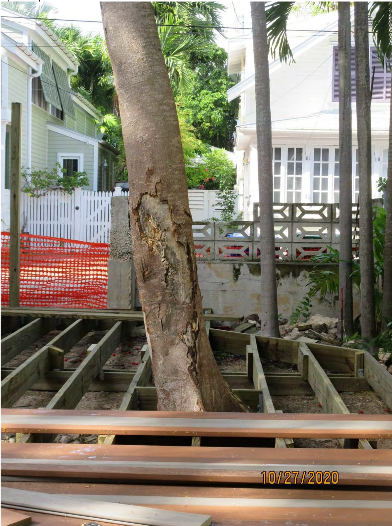
Updated closeup photo of damaged tree trunk, view 1.