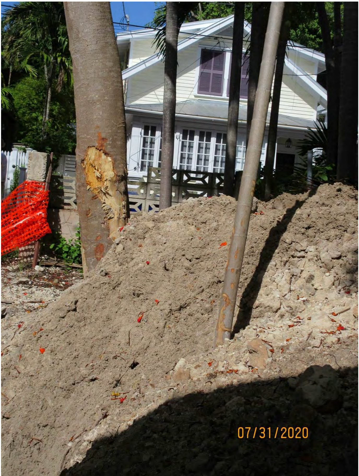
Closeup photo of damaged tree trunk, view 2.