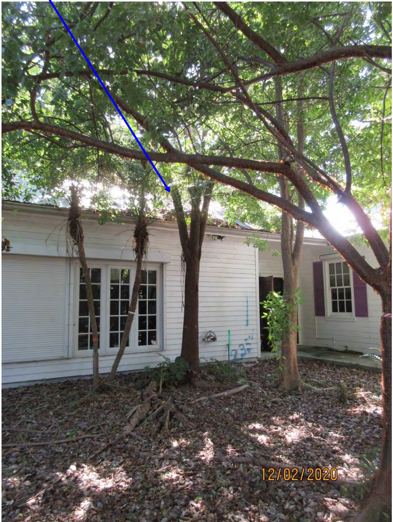
Tree Species: Mahogany (Swietenia mahogany) Tree #172