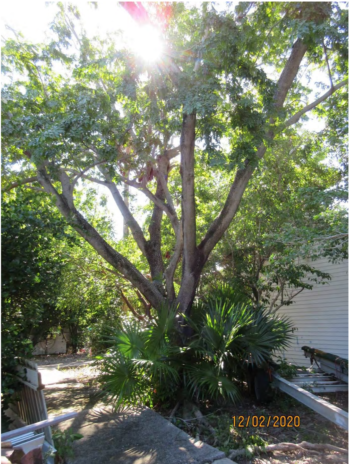
Tree Species: Raintree ( Samanea saman ) Tree #163