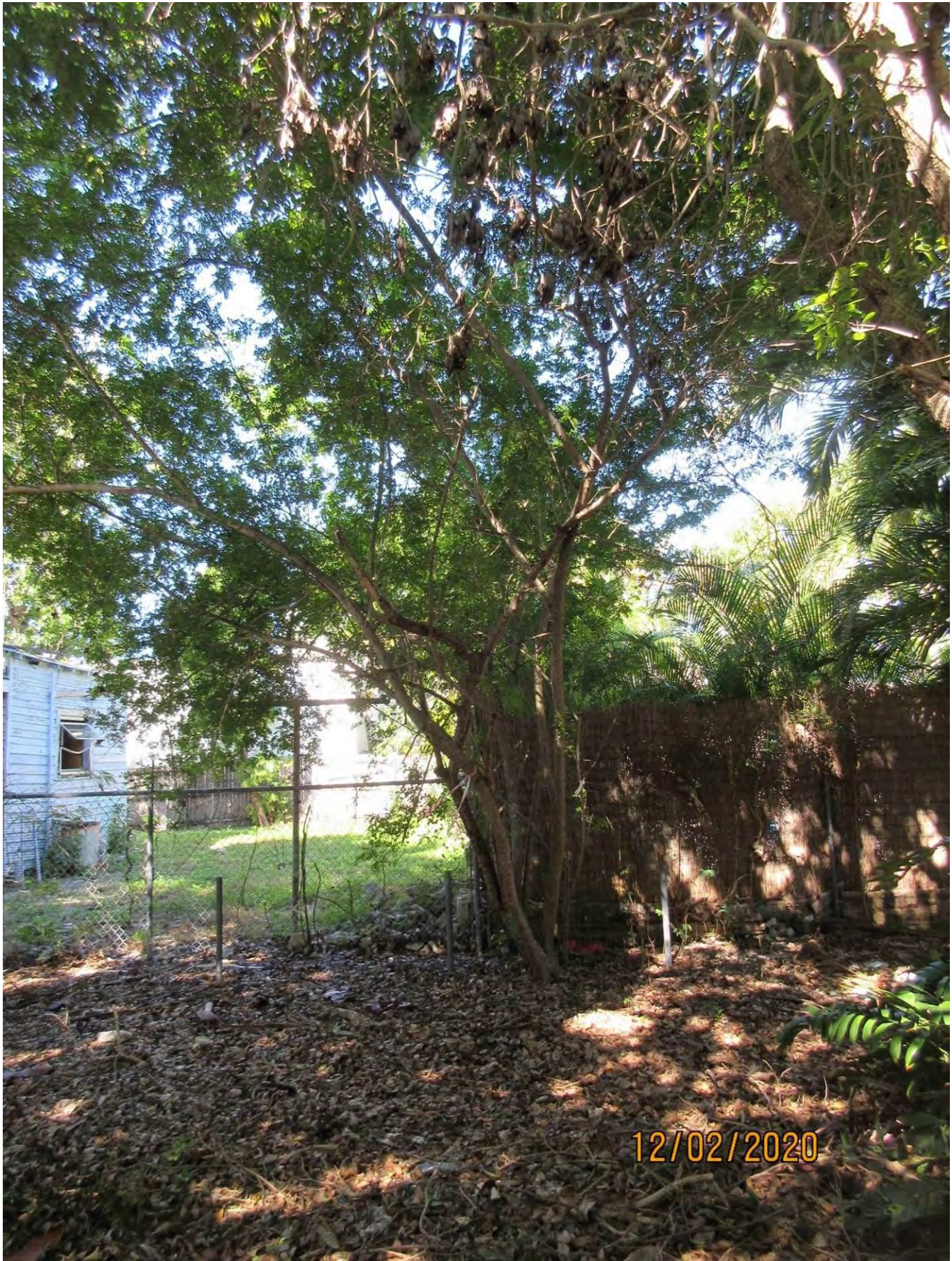
Tree Species: Sweet Acacia ( Acacia farnesiana ) Tree #68