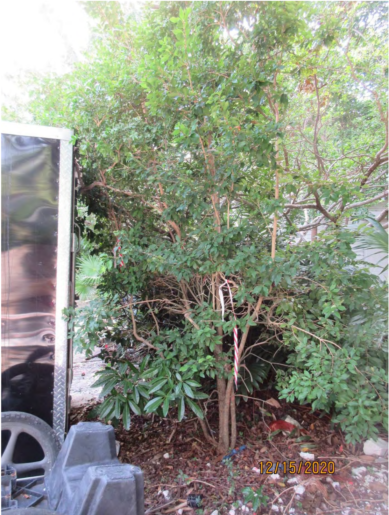
Tree Species: White Stopper ( Eugenia axillarius ) Tree #184