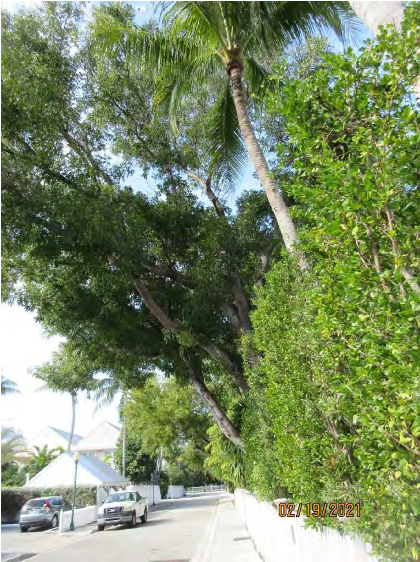
Photo showing growth of tree over sidewalk and street.