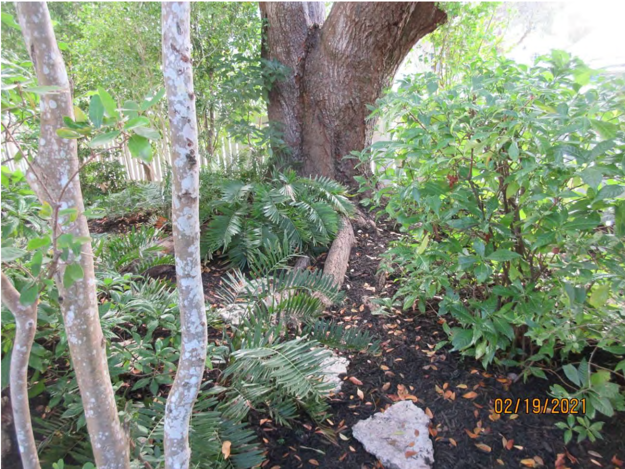
Standing near structure looking toward base.