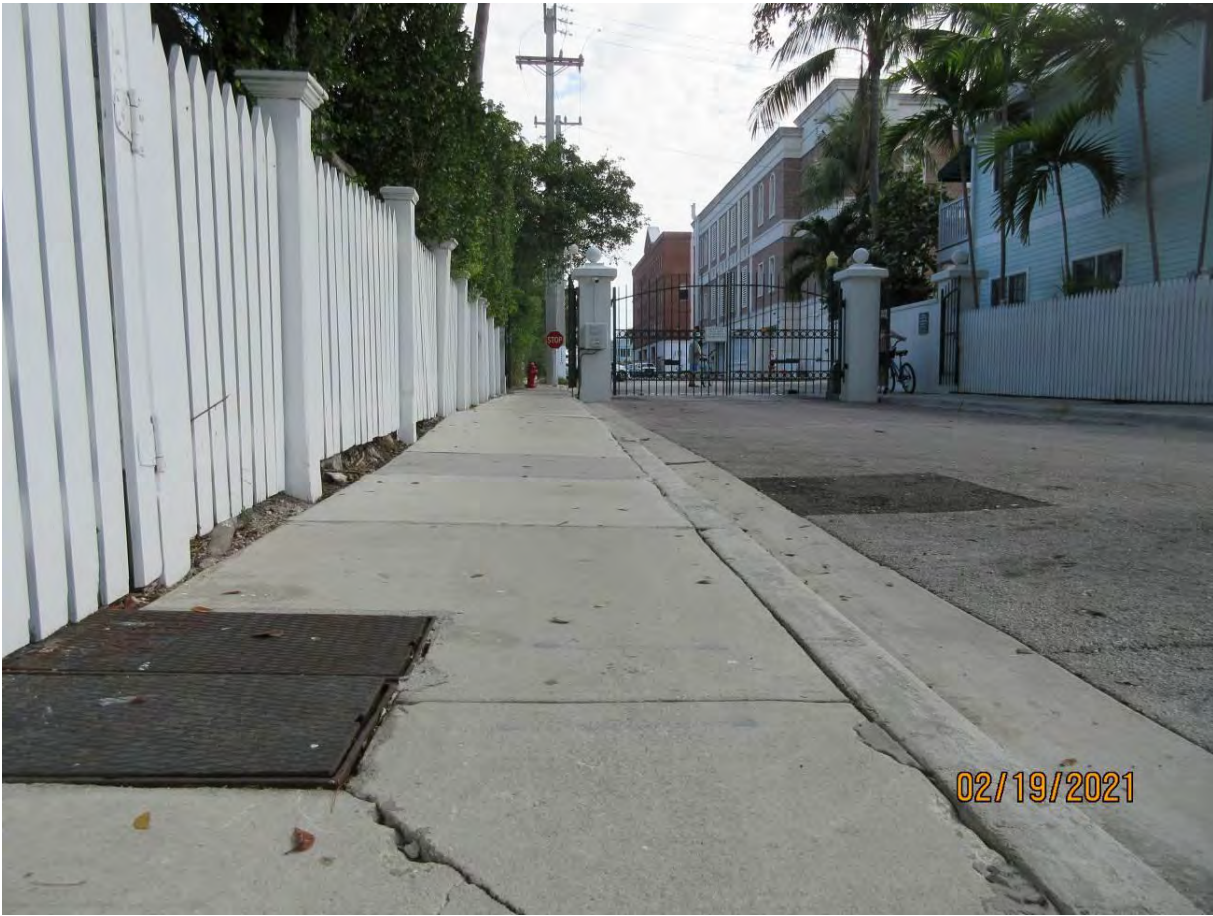
Photo showing view of sidewalk next to base of tree.