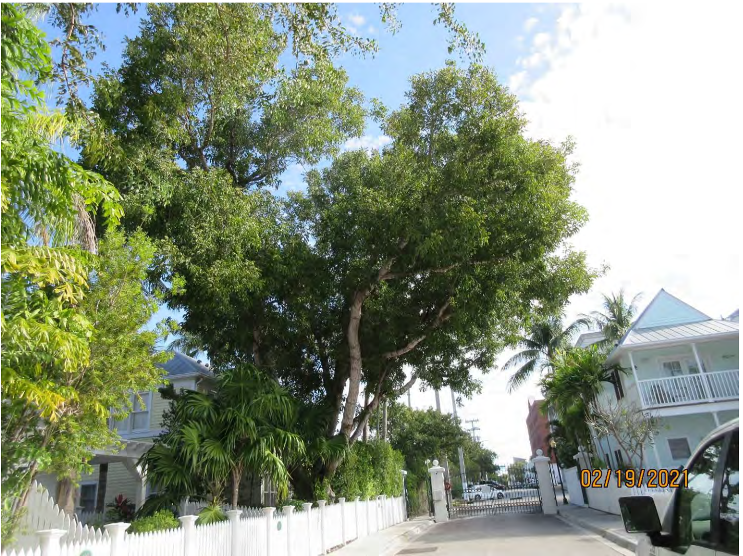
Photo showing location of tree, view 1 (standing on Fleming Street in Truman Annex looking toward courthouse).

Tree Species: Mahogany (Swietenia mahagoni)