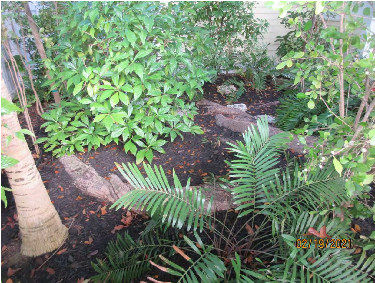
Standing near base of tree, photo showing large structural surface roots growing from base of tree toward structure, view 1.