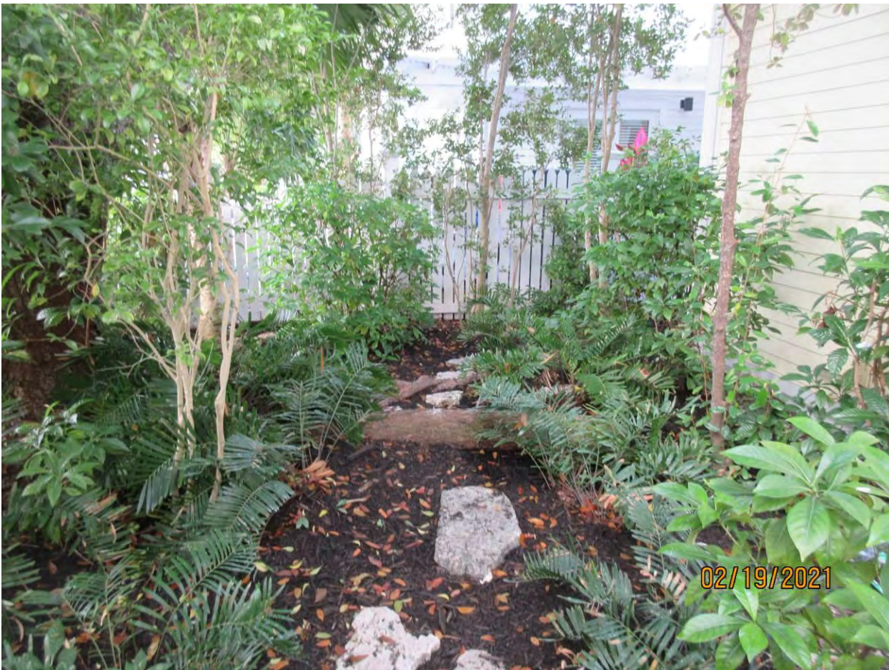
Photo showing large, structural surface root that runs from base of tree toward structure, view 1.