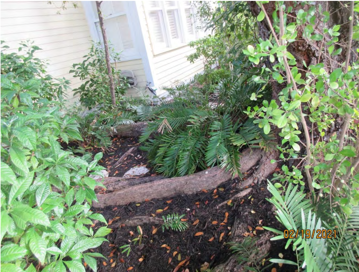
Standing near base of tree, photo showing large structural surface roots growing from base of tree toward structure, view 1.