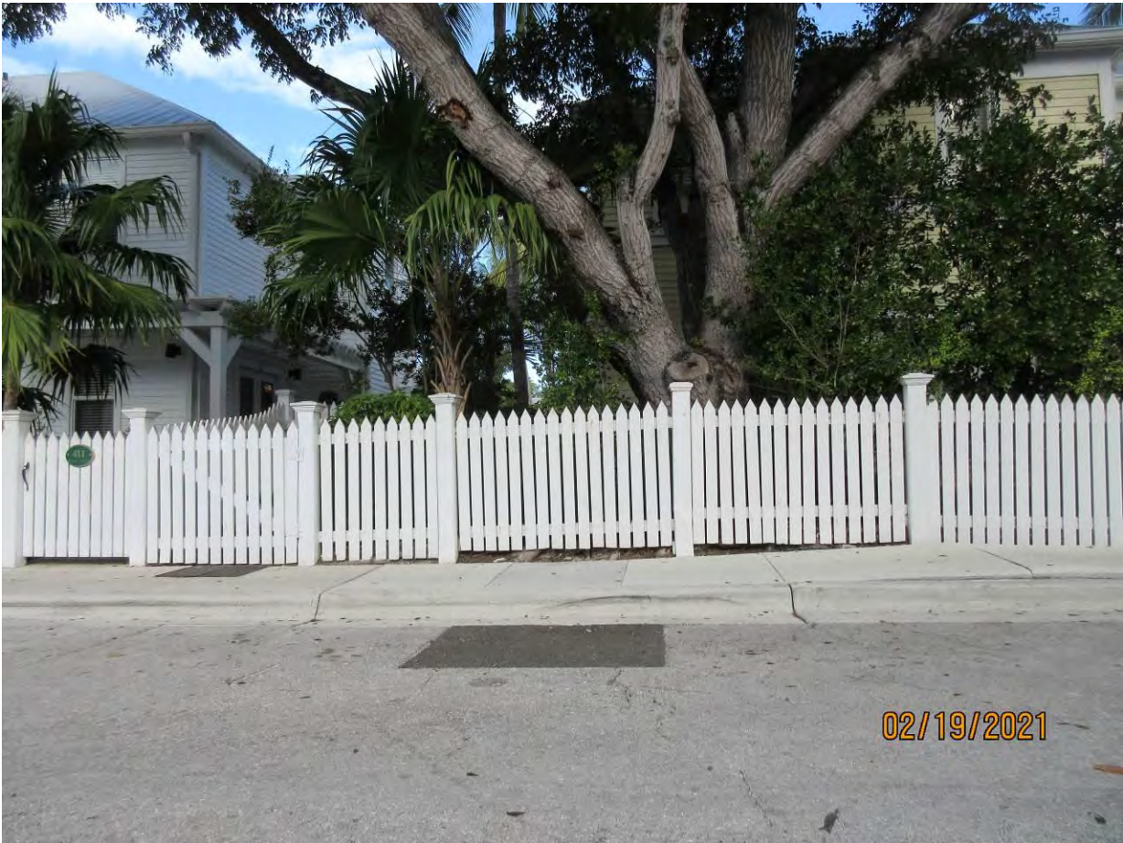
Photo showing base of tree and sidewalk impacts, view 1.