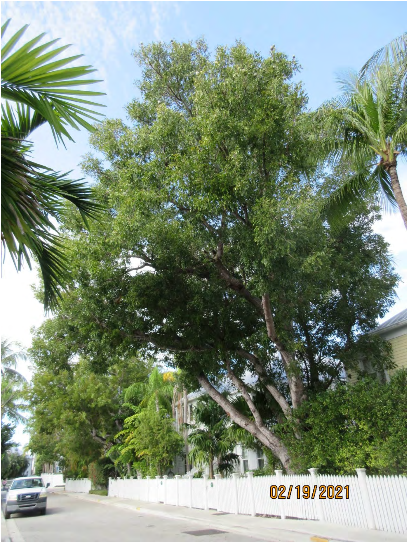
Photo showing whole tree, view 2.