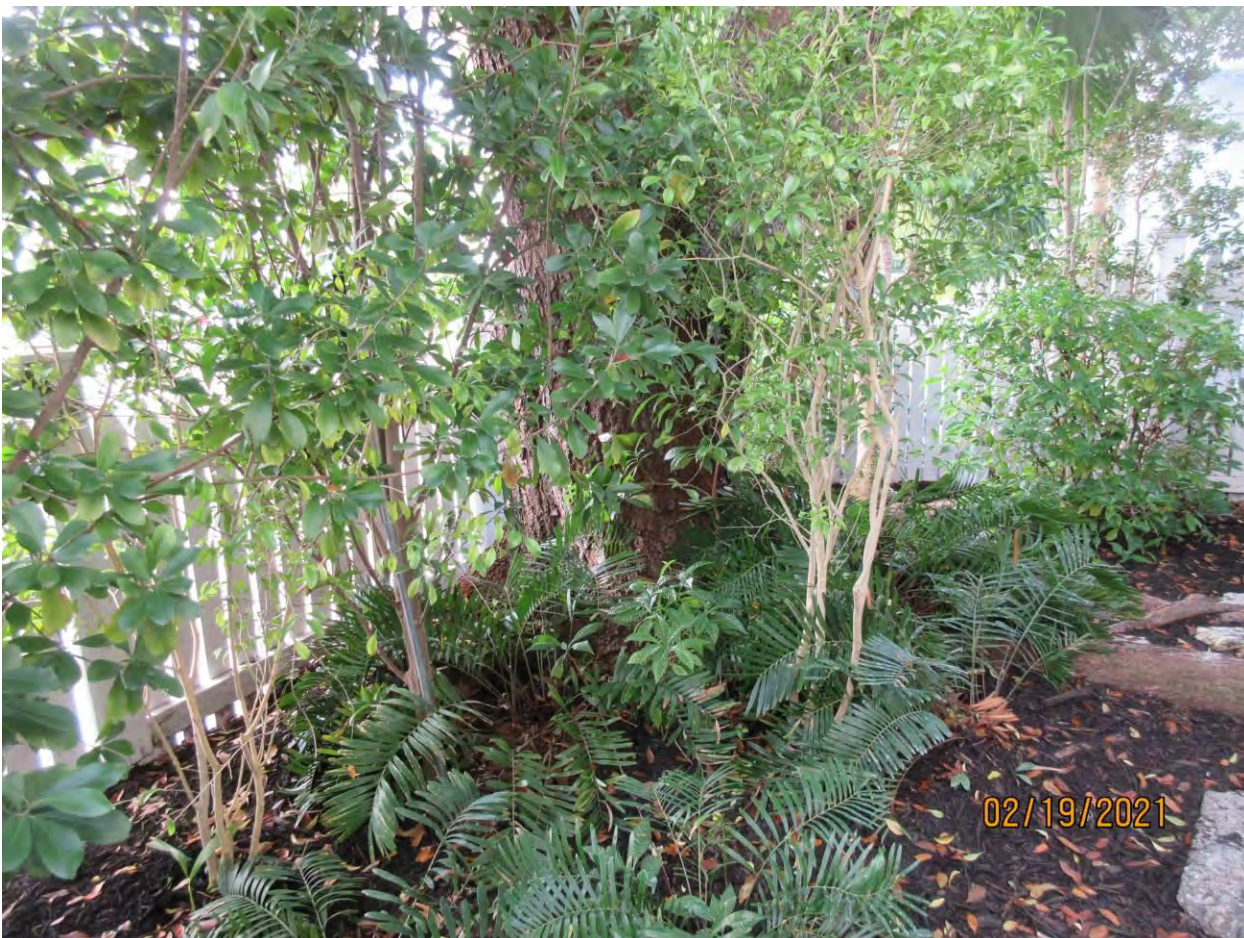
Photo showing large, structural surface root that runs from base of tree toward structure, view 2.