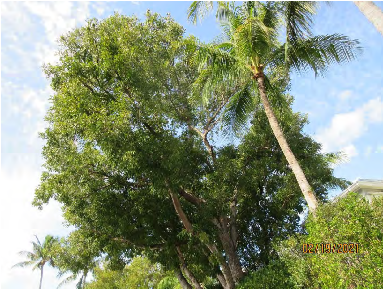
Photo looking at tree canopy, view 2.