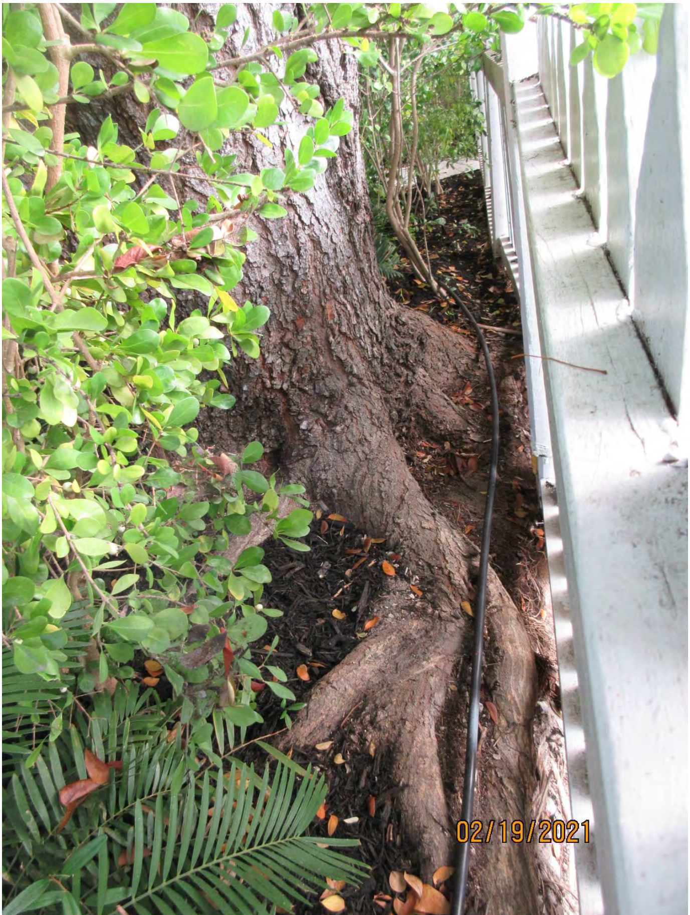
Standing near base of tree along sidewalk/fenceline area looking at base of tree, view 2.