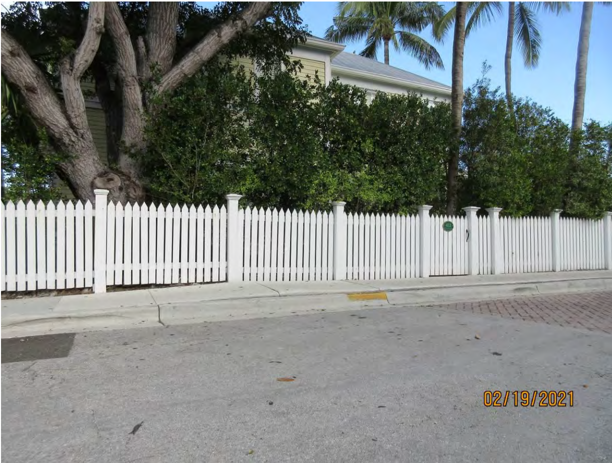
Photo showing base of tree and sidewalk impacts, view 2.