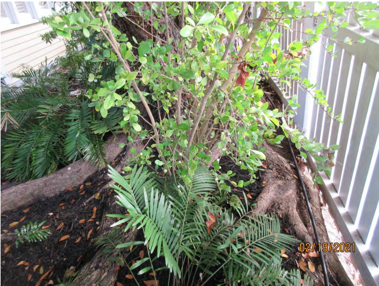
Standing near base of tree along sidewalk/fence line area looking at base of tree, view 1.