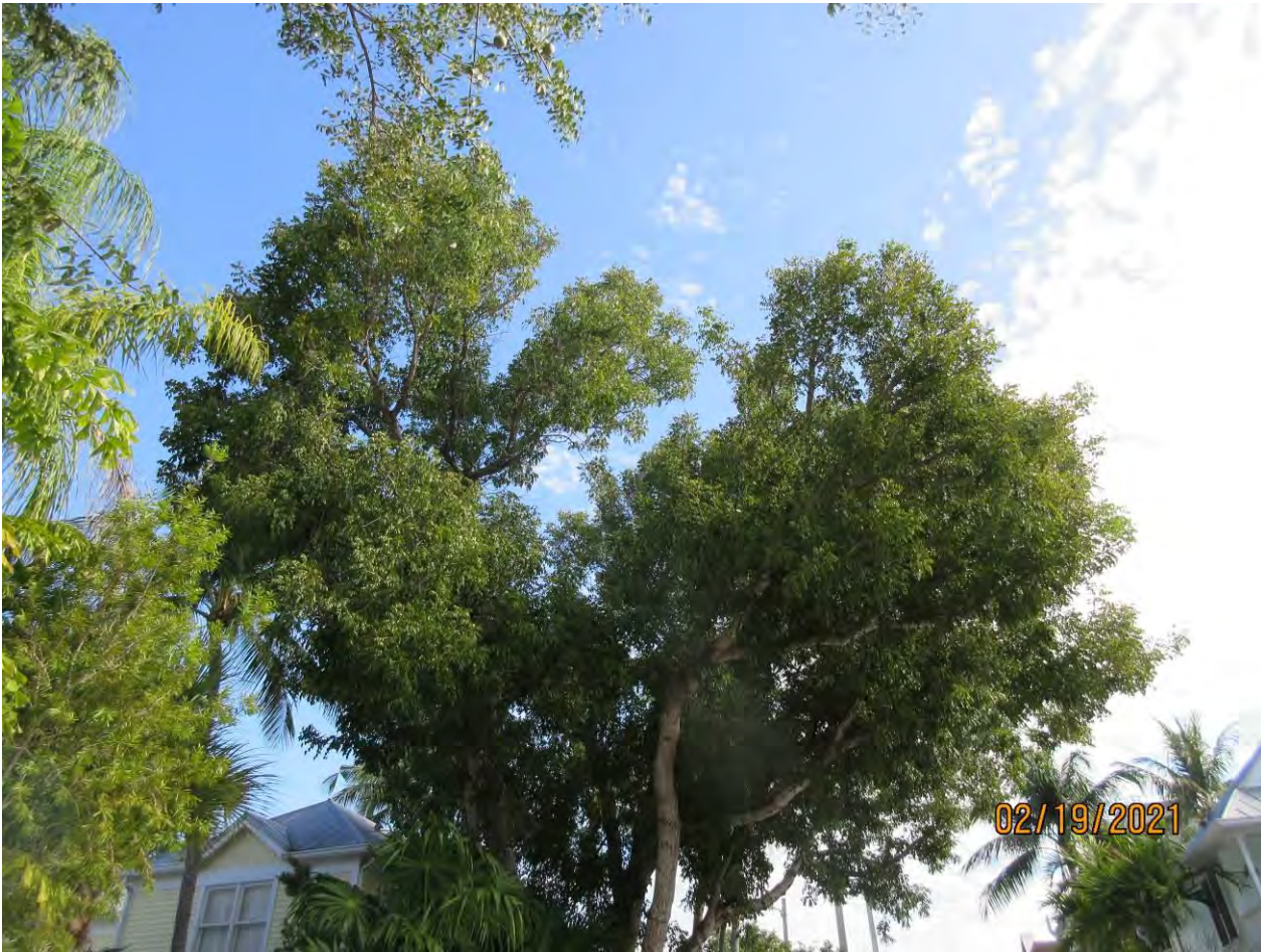
Photo looking at tree canopy, view 1.