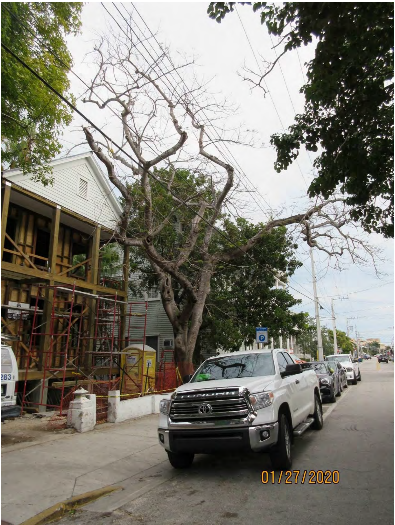
Photo showing entire tree prior to trimming of canopy in January 2020. Large branch over street dropped a section onto the road a few months earlier (September 2019).