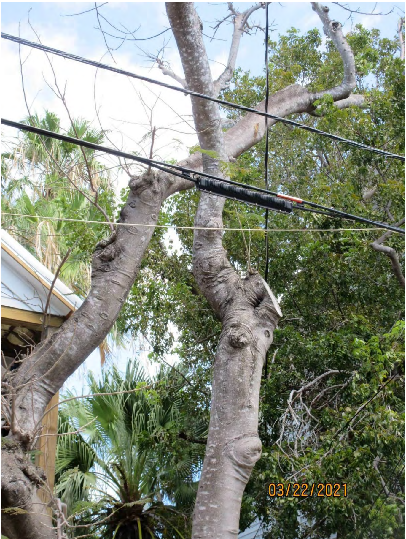
Photo of main canopy trunks/branches, view 1.