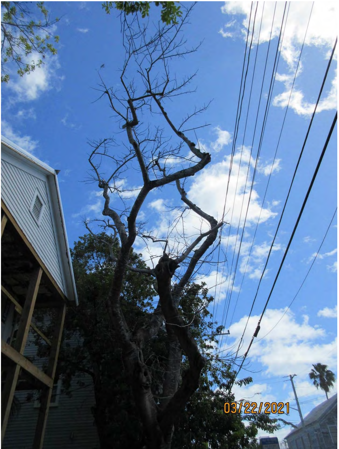
Photo showing tree canopy and utility lines.