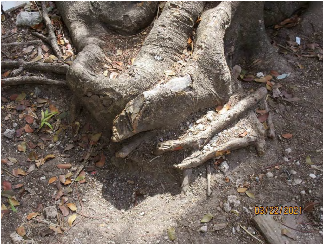
Two photos showing base of tree, view 1 and 2.