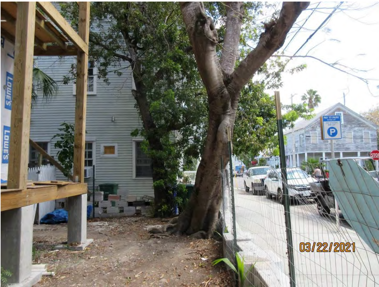
Photo showing base and main trunk of tree, view 1.