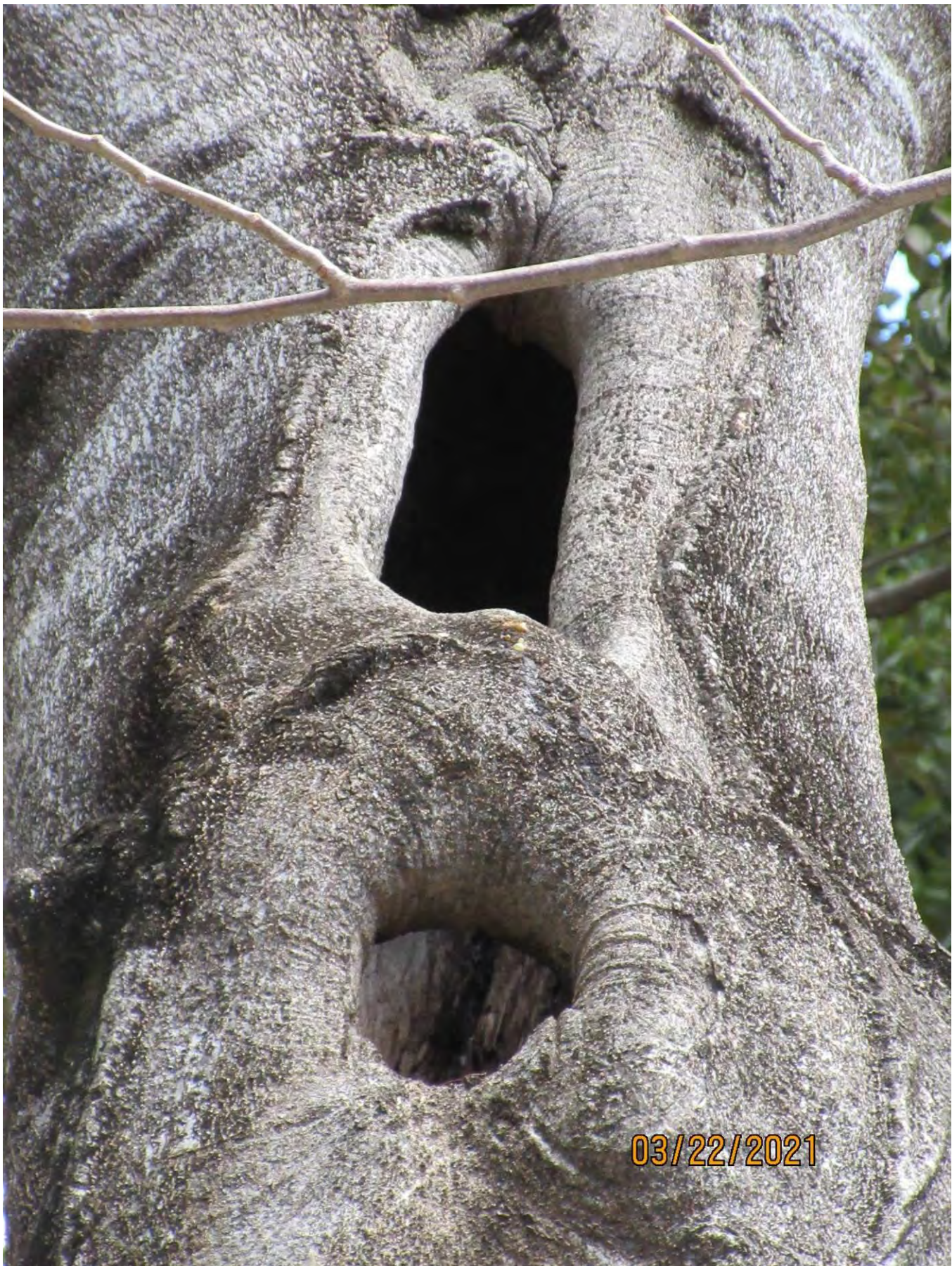
Photo showing a closer look at the main trunks and decay areas in view 1.