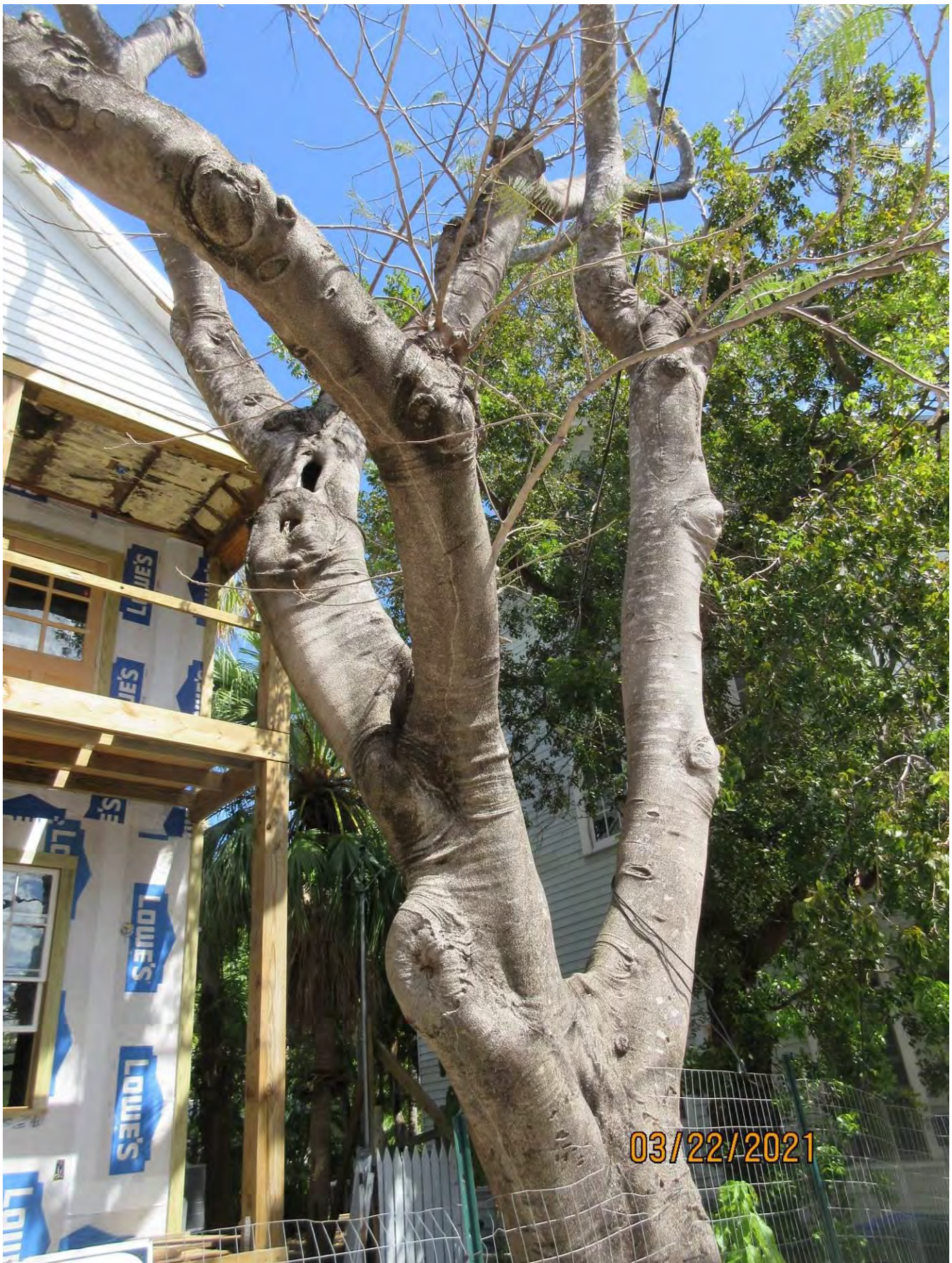
Photos of main trunk and canopy branches, view 1.