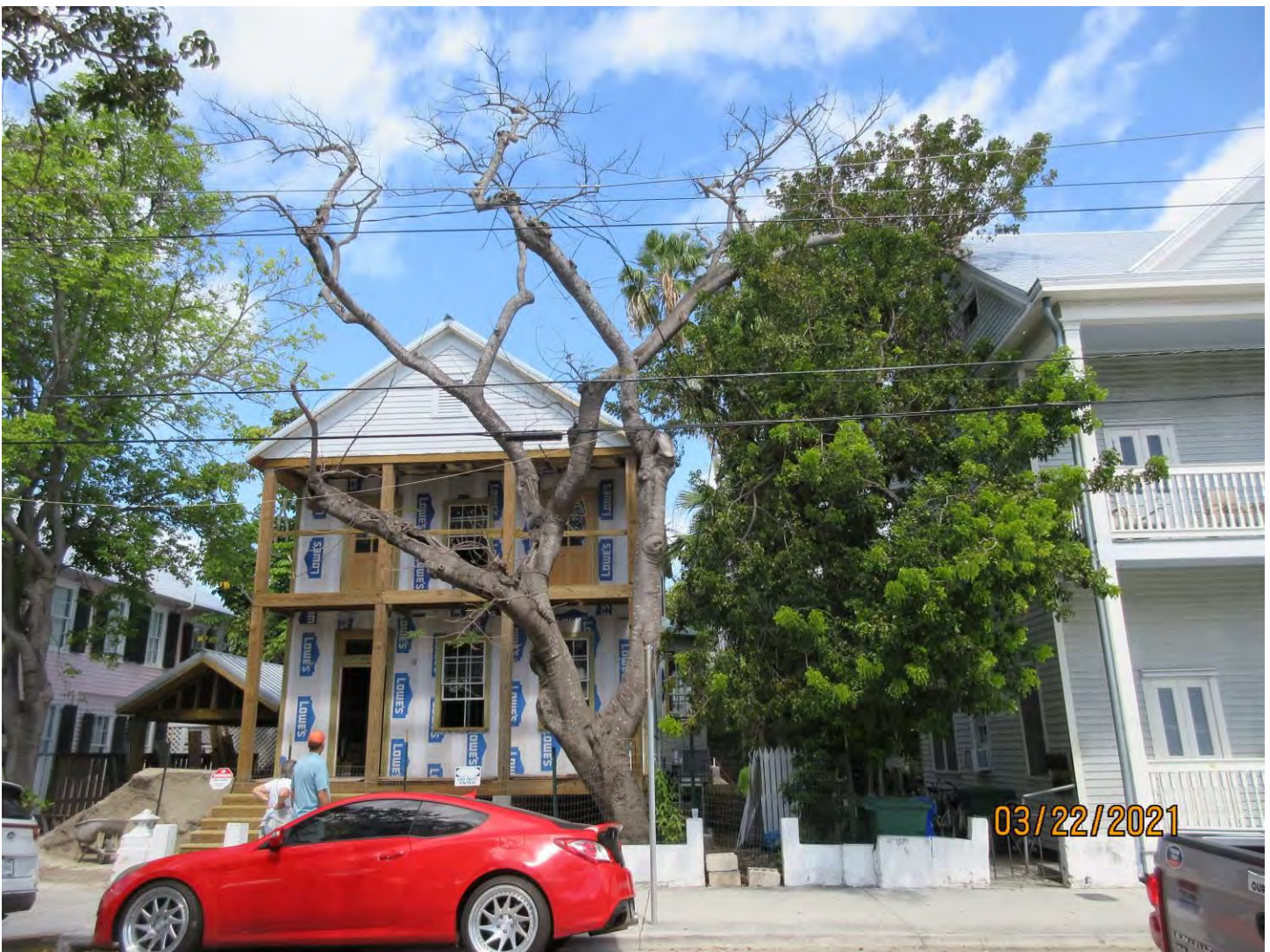
Photo showing location of tree.

Tree Species: Royal Poinciana ( Delonix regia )