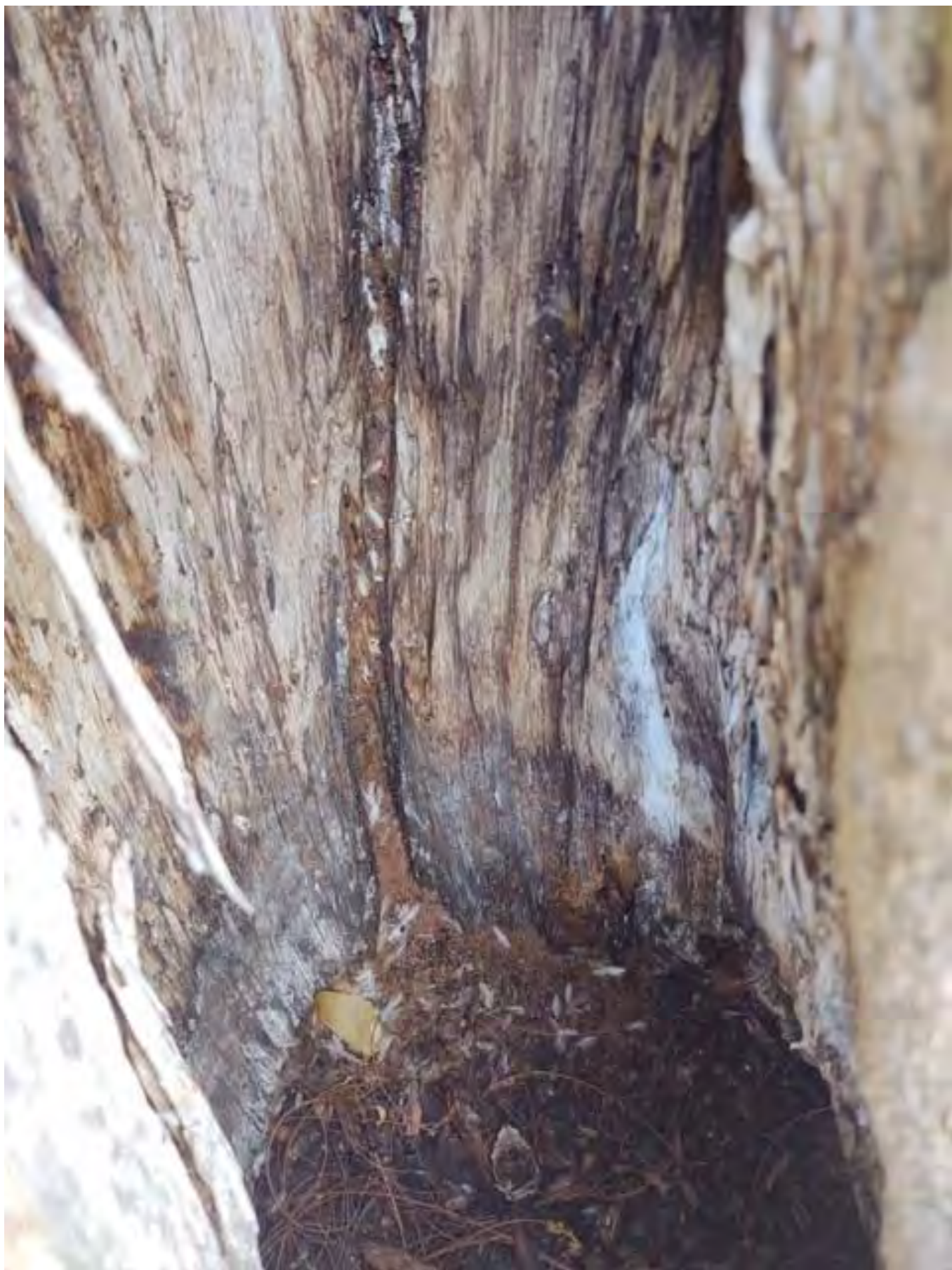
Photo from Shade Tree showing a close up of the interior of the decay hole in tree branch with termites.