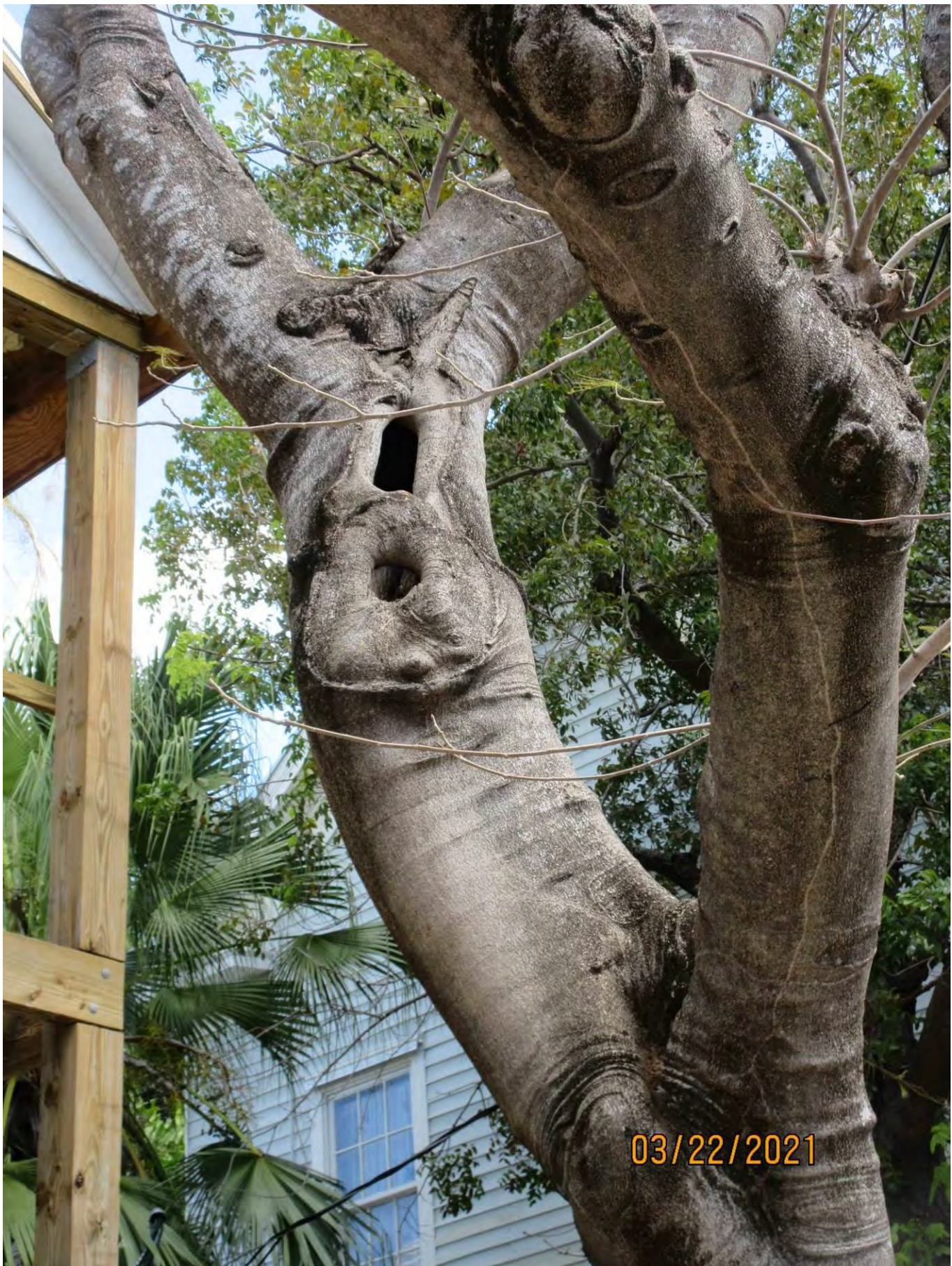
Photo showing main trunks and decay areas, view 1.