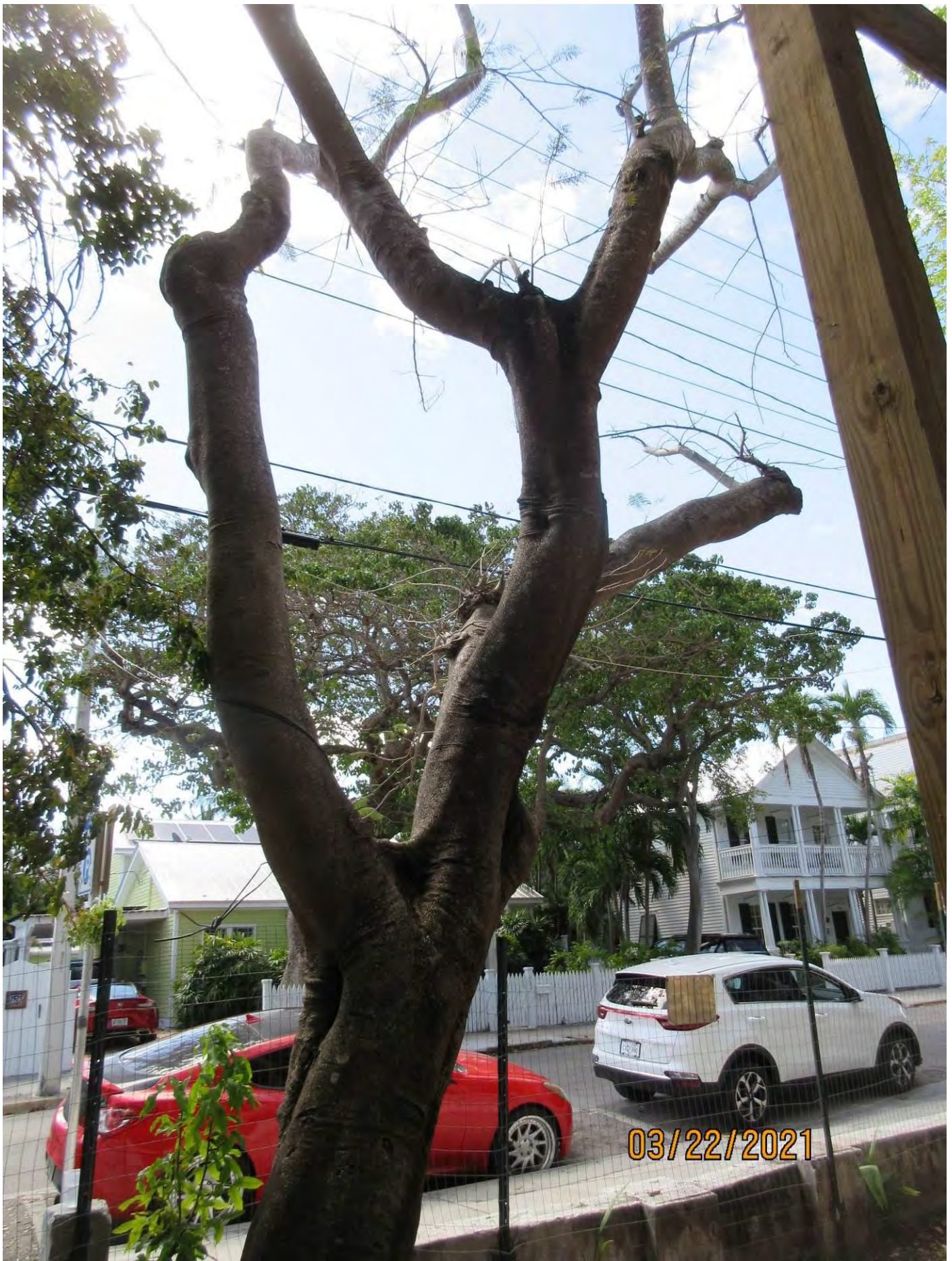
Photos of main trunk and canopy branches, view 2.