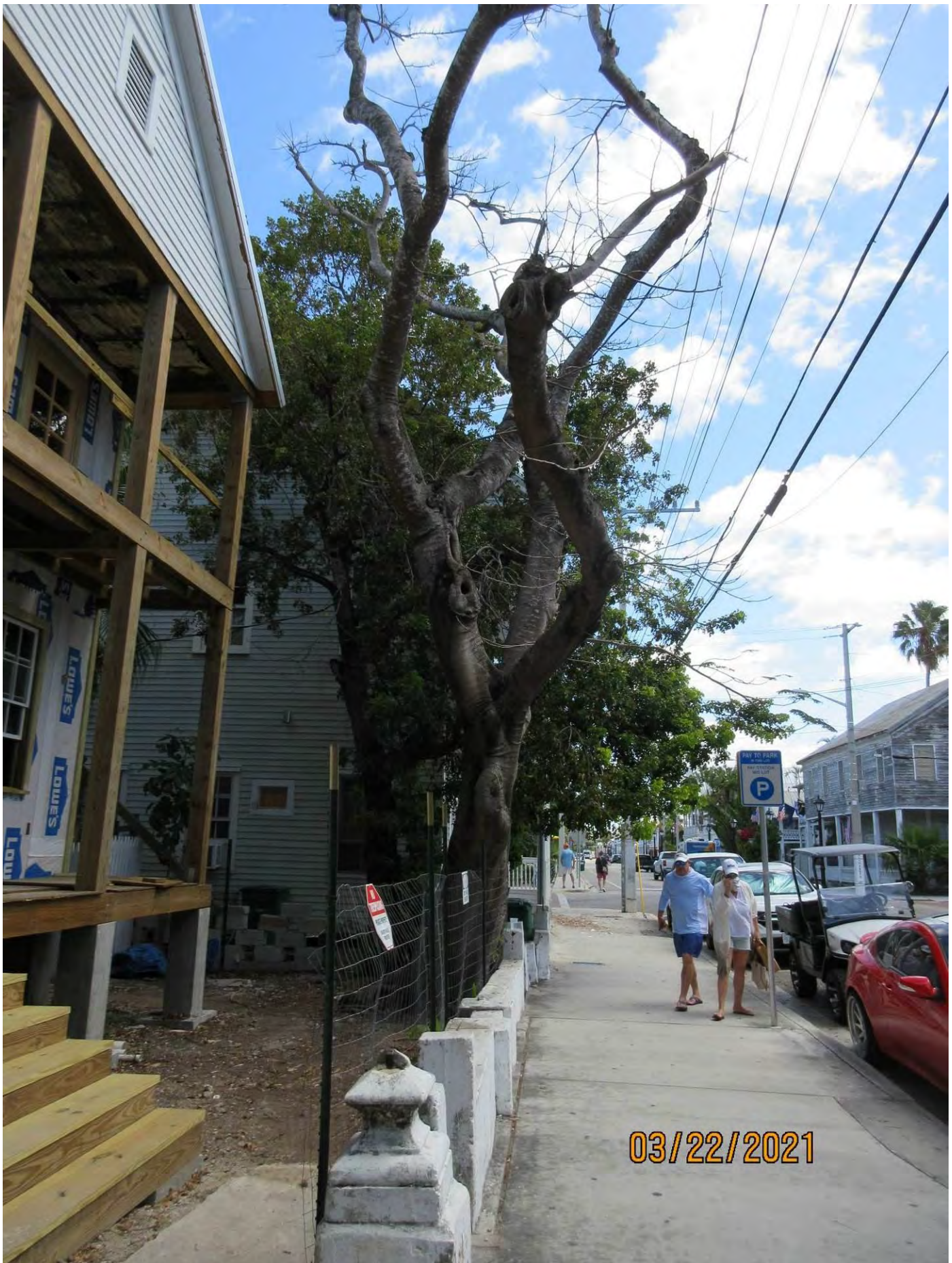
Photo showing entire tree in relation to sidewalk, house, and utility lines.