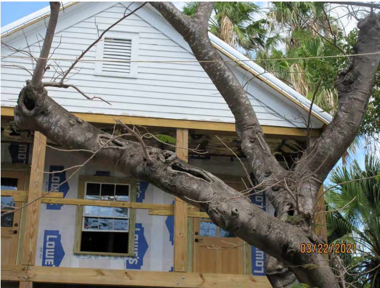
Photo of main canopy trunks/branches, view 2.