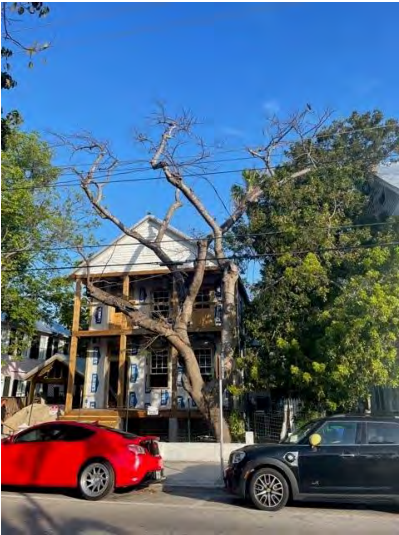
showing tree location.