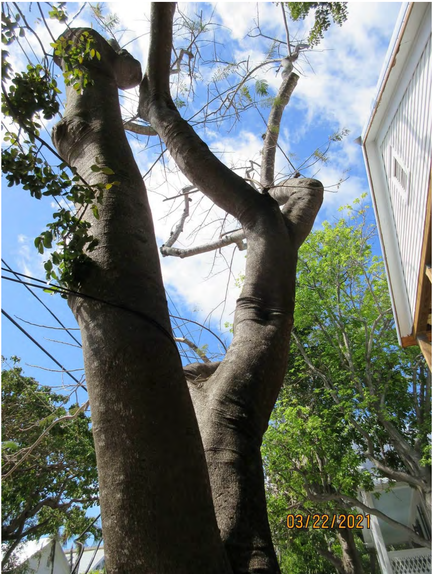
Photo looking up at main trunks and canopy.