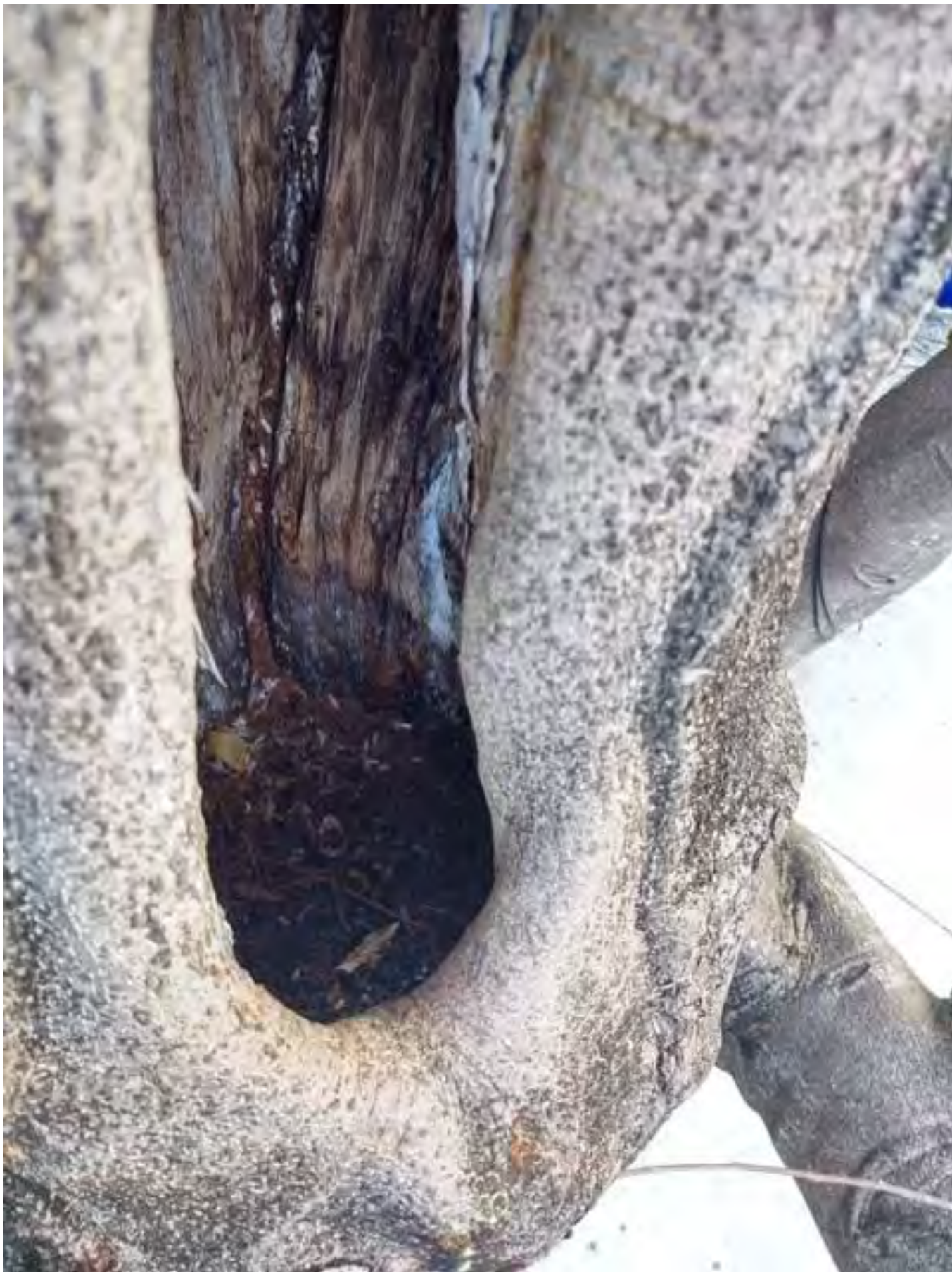
Photo from Shade Tree showing termites in branch hole.