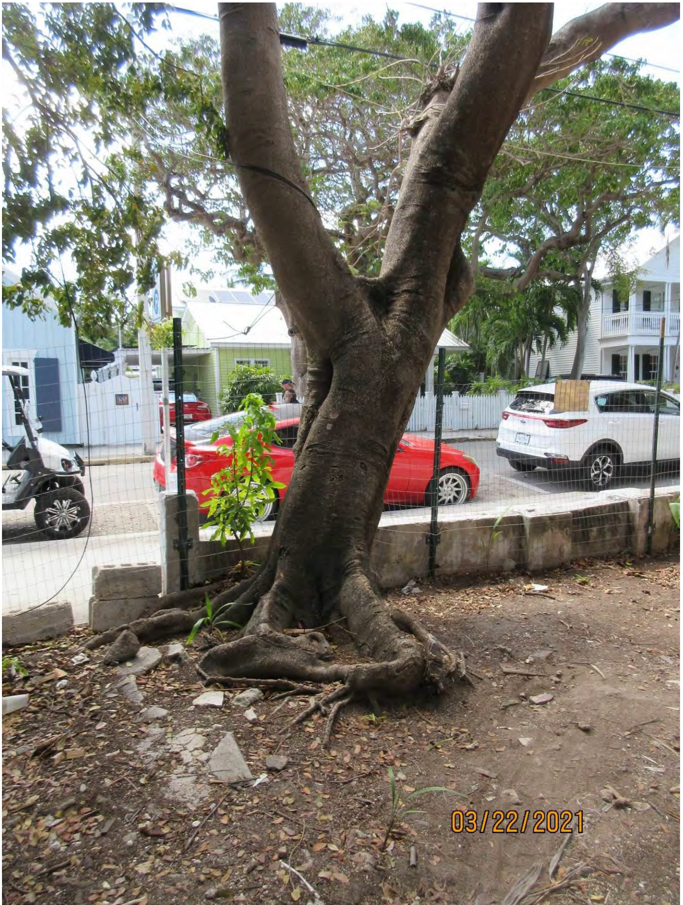
Photo showing base and main trunk of tree, view 2.