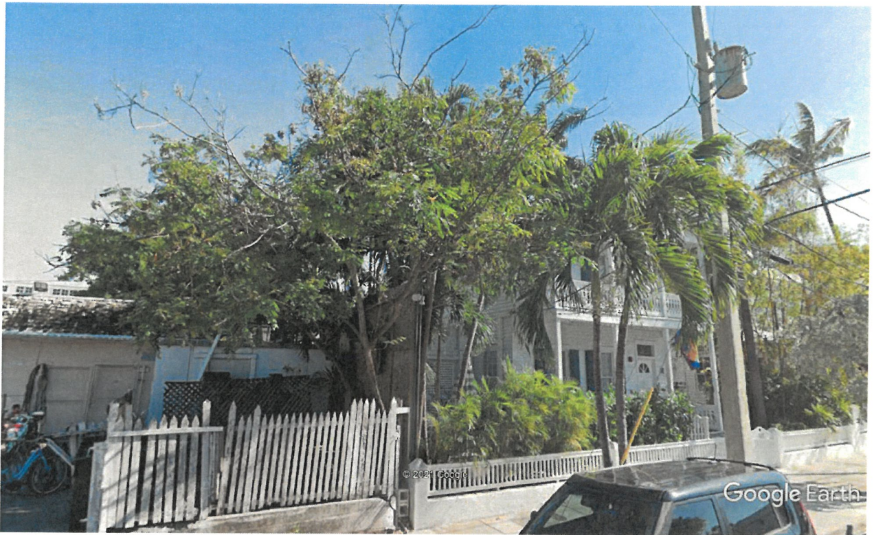
Photo dated March 2019

Factual allegation: Two (2) Sandlewood trees have been removed without benefit of a tree removal permit and one (1) Royal Poinciana tree has been improperly trimmed. All three trees are located on the property line with 1118 Fleming Street.