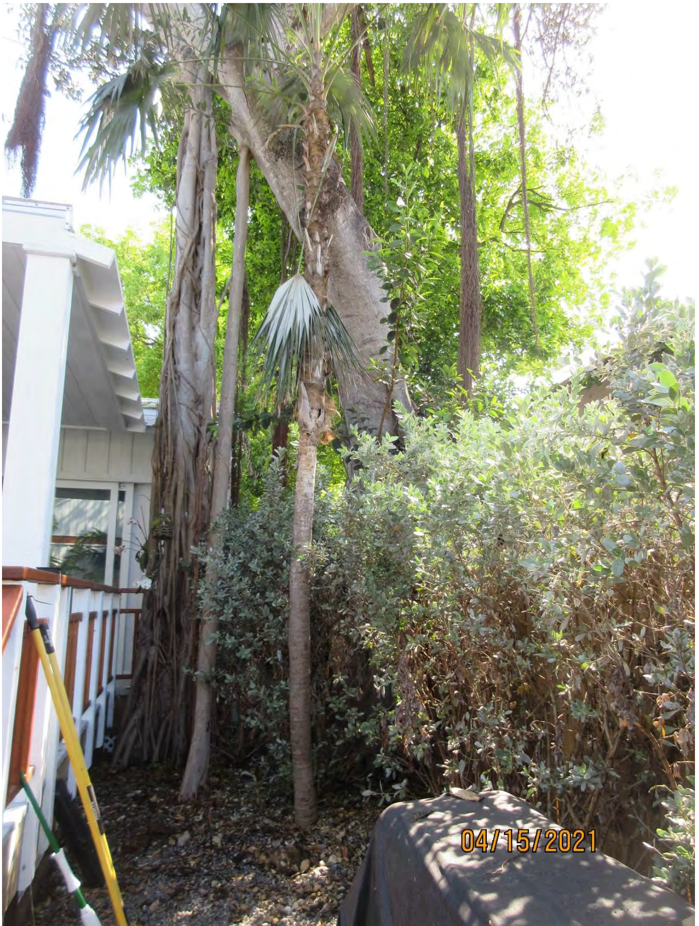
Photo showing tree trunks, view 2.