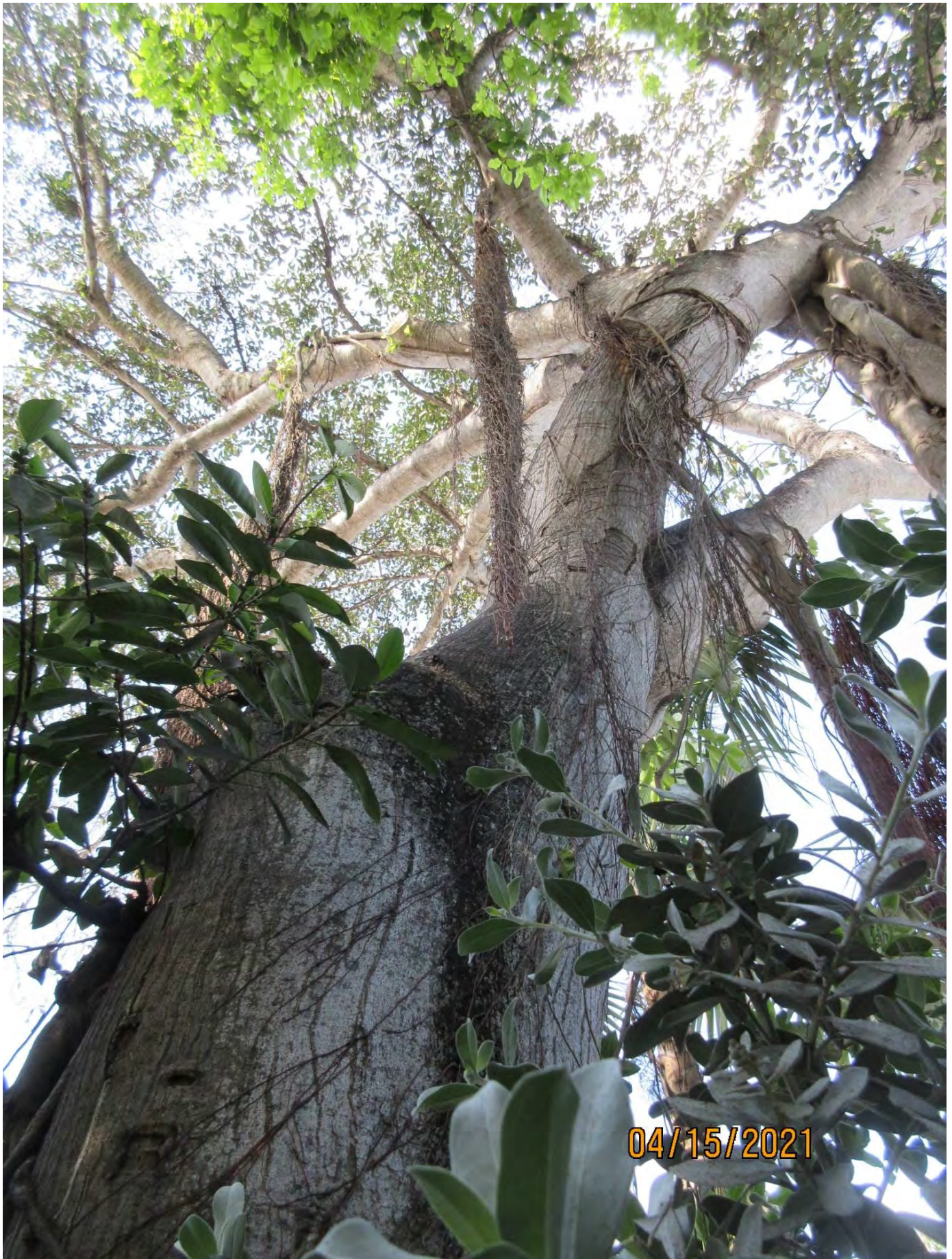
Photo standing at base of main trunk looking up at main trunk and canopy.