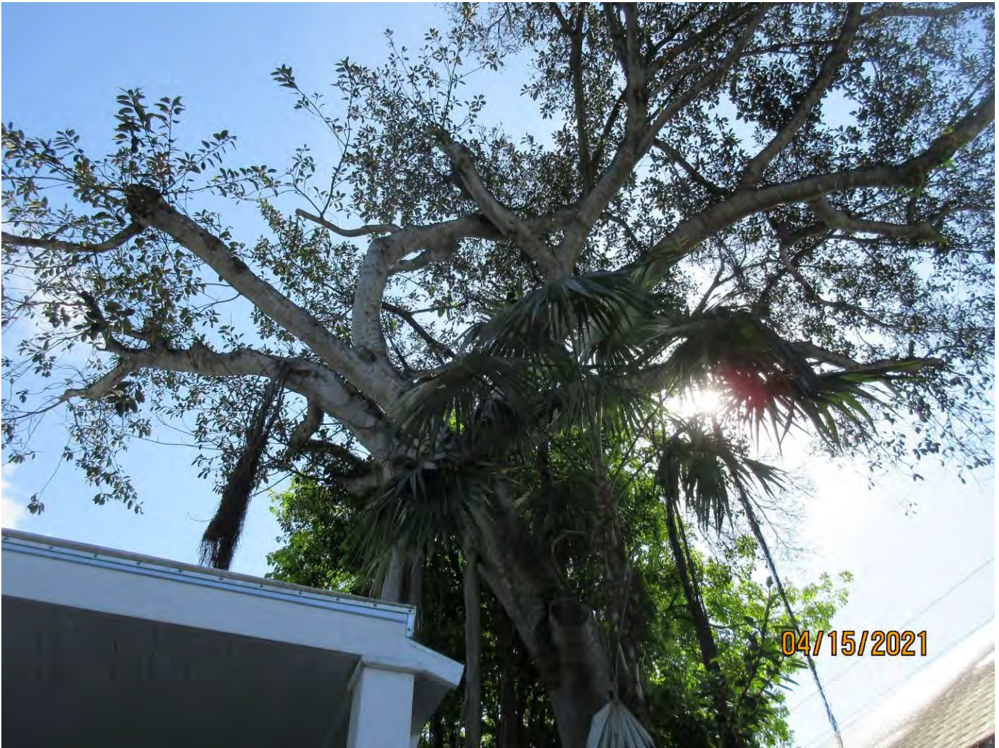
Photo of tree canopy, view 4.