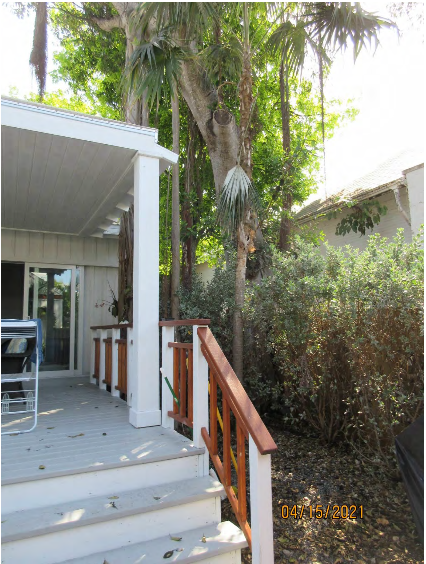
Photo showing location of tree in side yard.