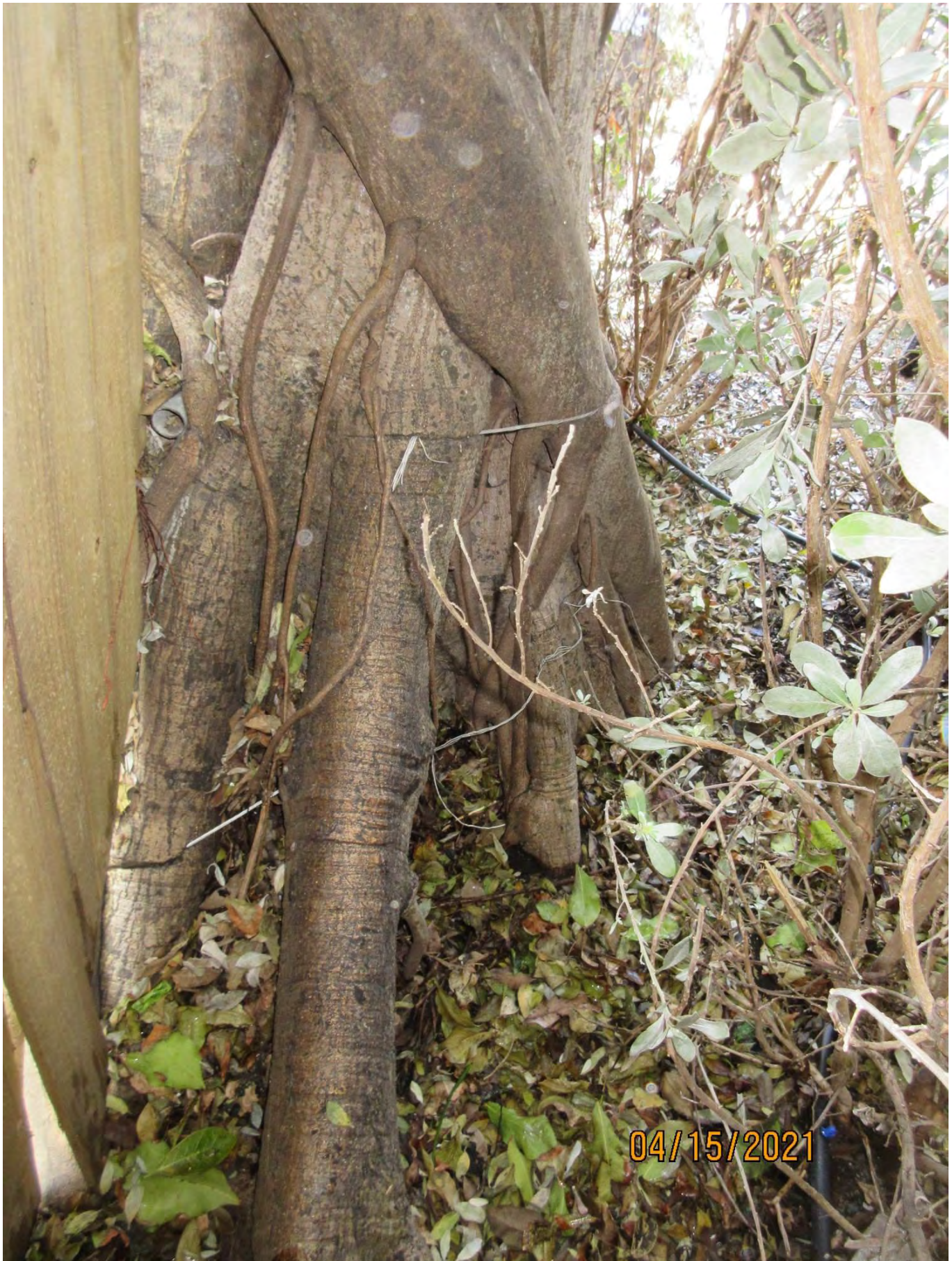
Photo showing base of main trunk, view 1.