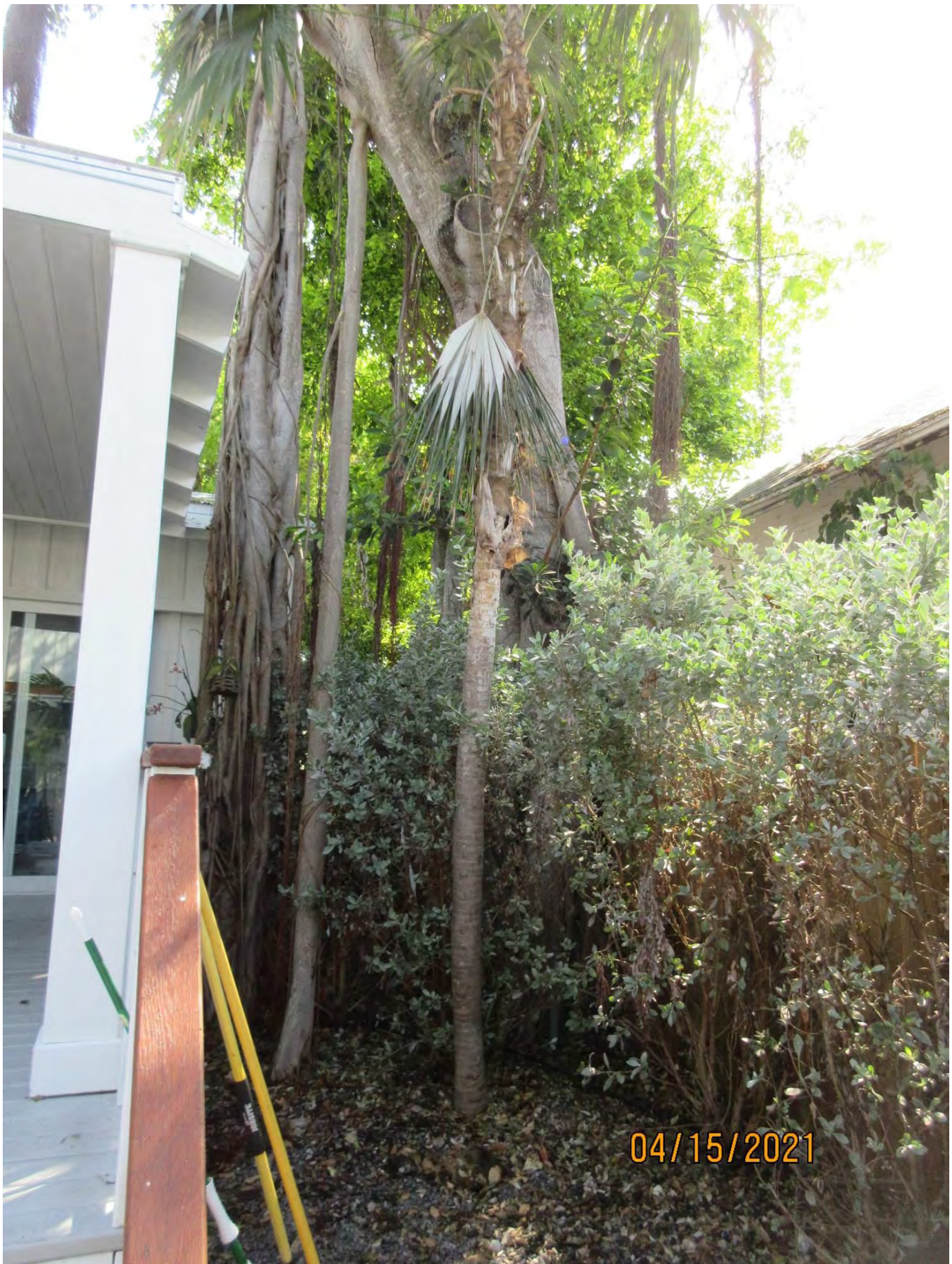
Photo showing tree trunks, view 1. Tree has a main trunk, one big aerial root, and several smaller aerial roots.