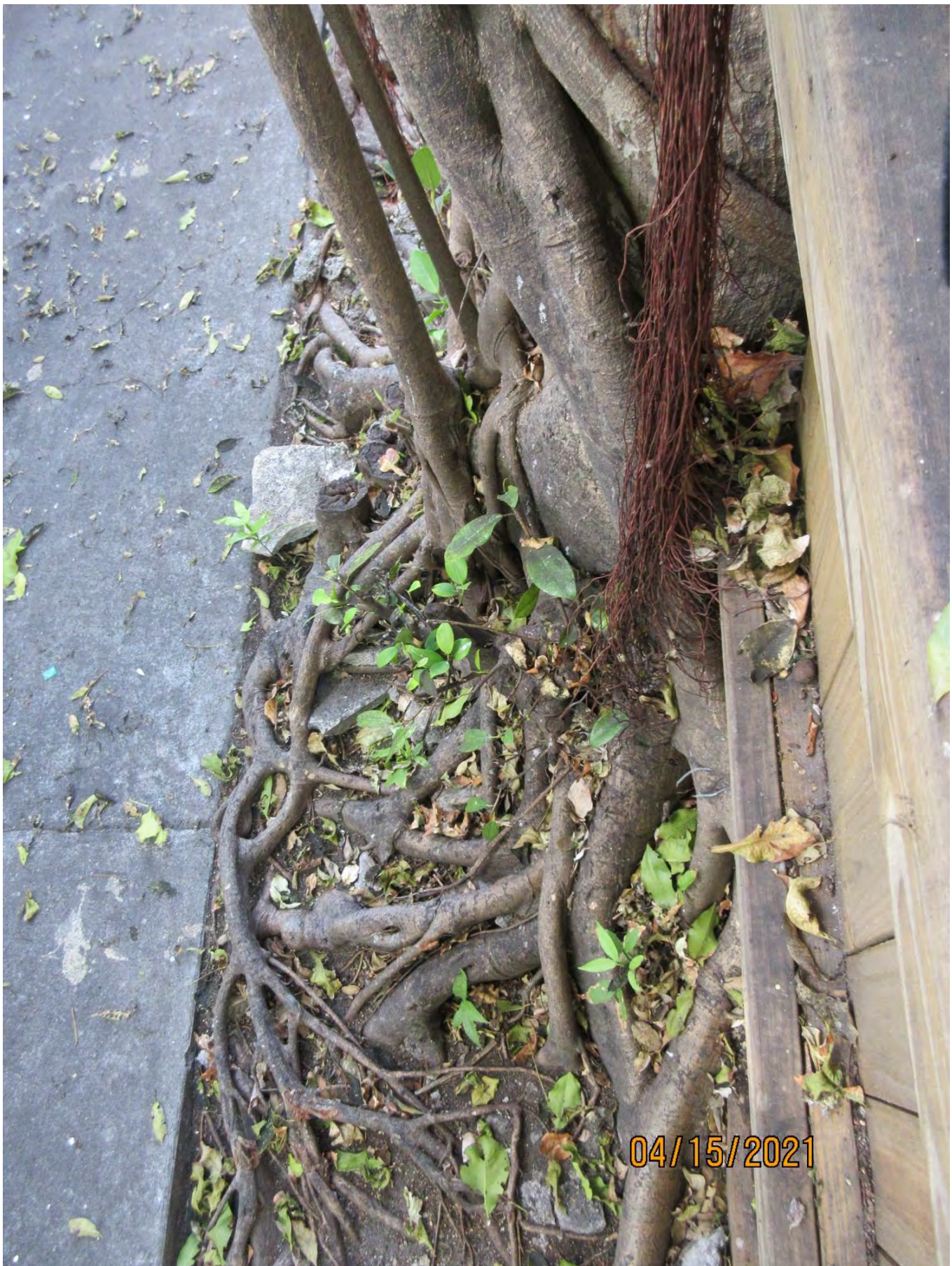
Photo showing base of main trunk on the neighbor's property. Fence is the approximate property line.