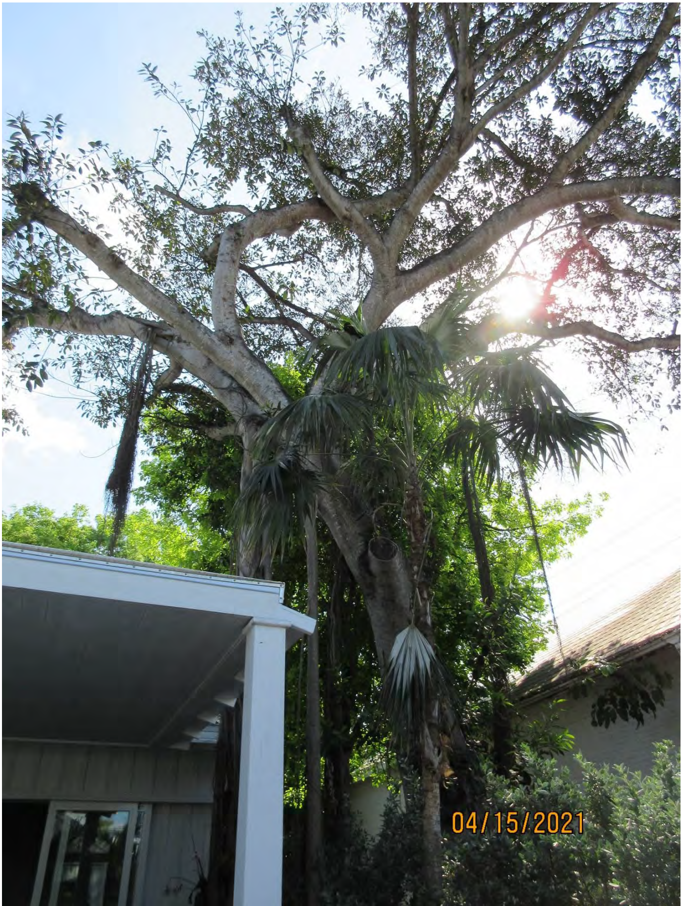
Photo showing tree canopy, view 1.