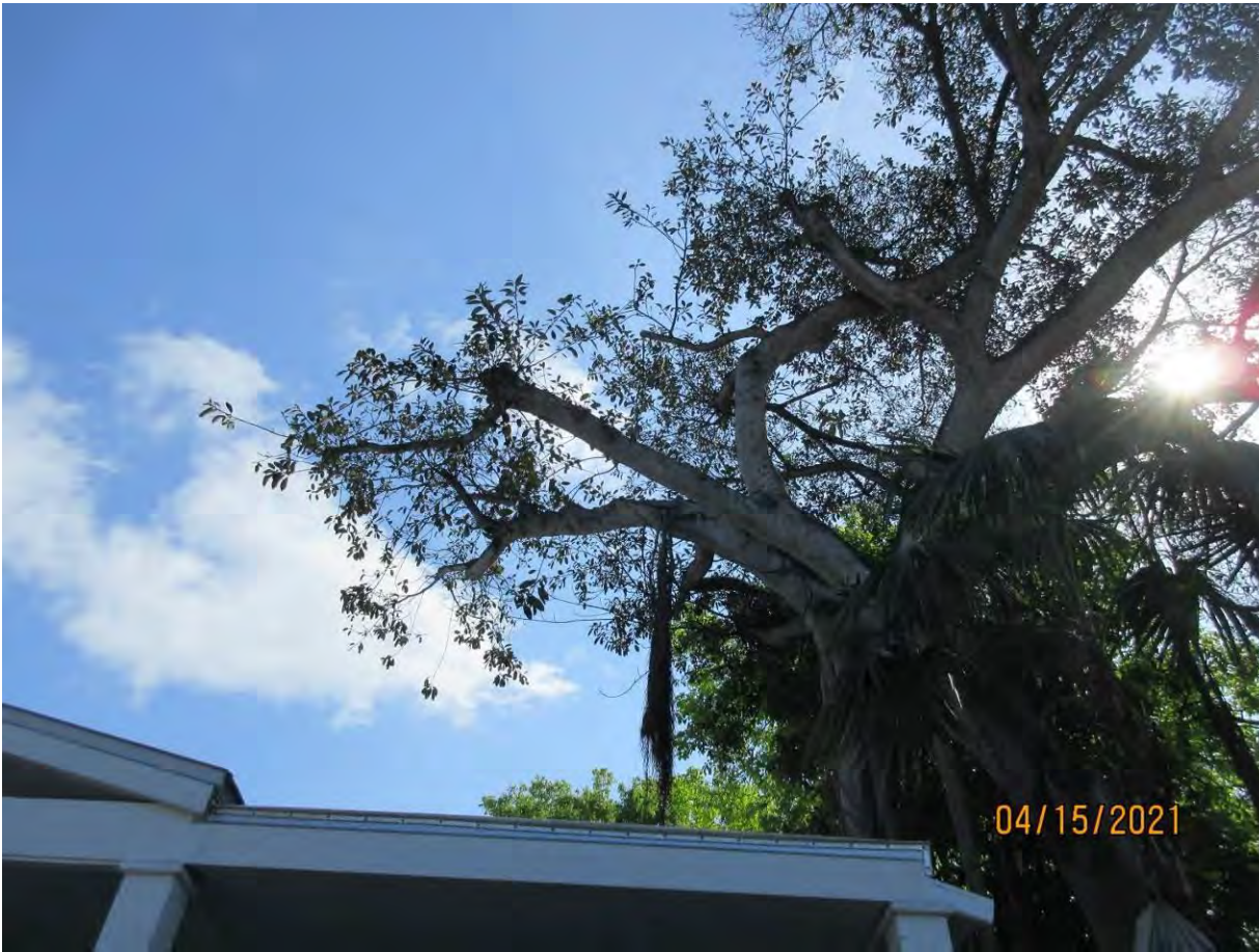
Two photos of the tree canopy, view 2 and 3.