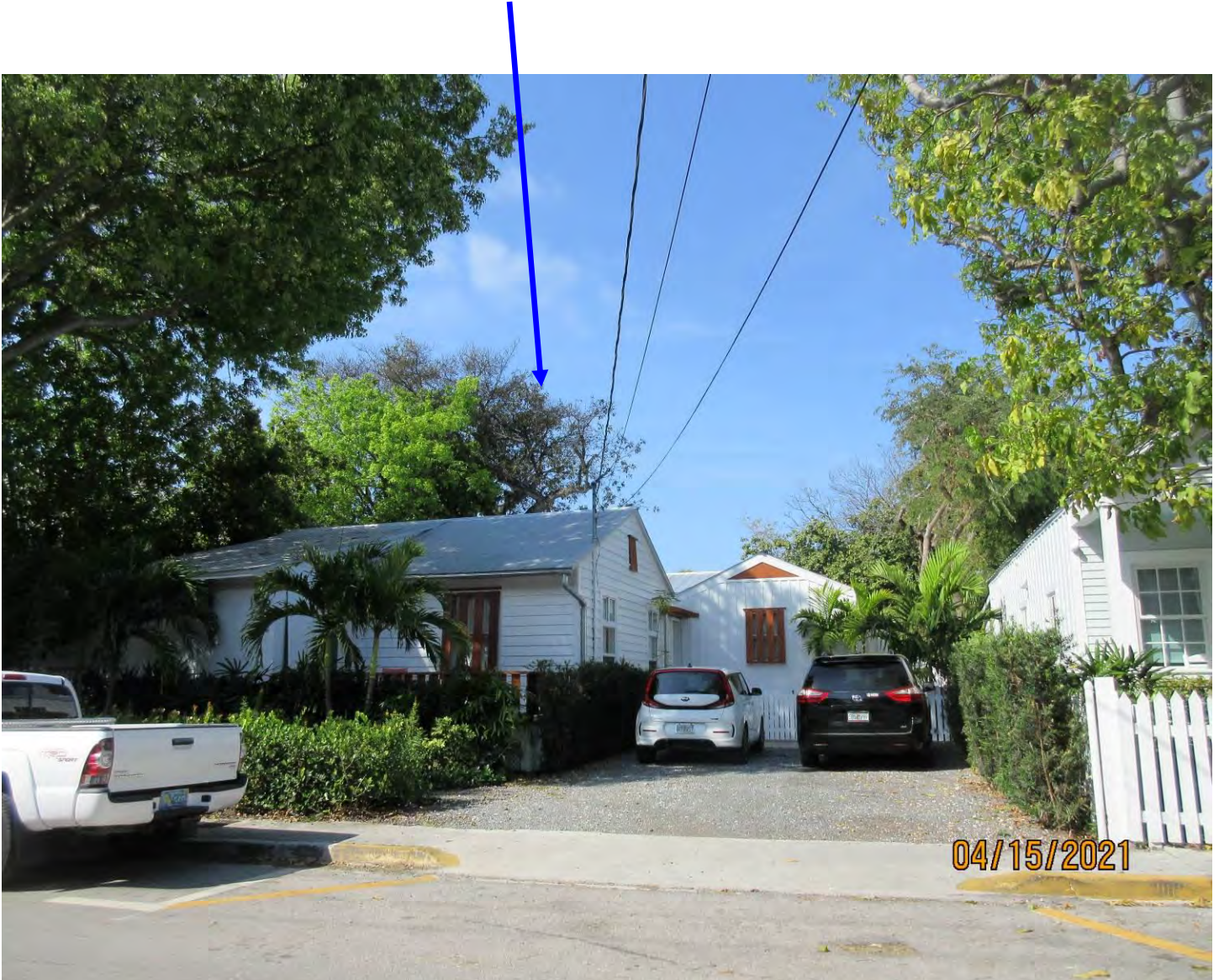
Photo showing location of tree, street view.

Tree Species: Strangler Fig ( Ficus aurea )