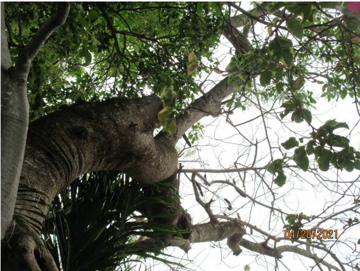
Close up view of tree canopy.