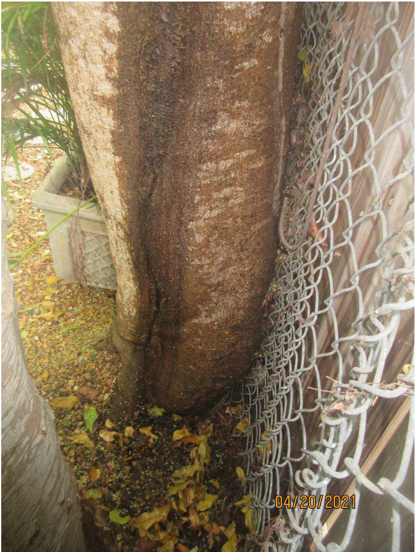
View of damage/decay area along length of trunk, view 4.