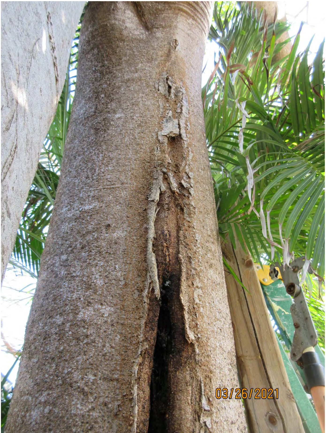
View of damage/decay area along length of trunk, view 2.