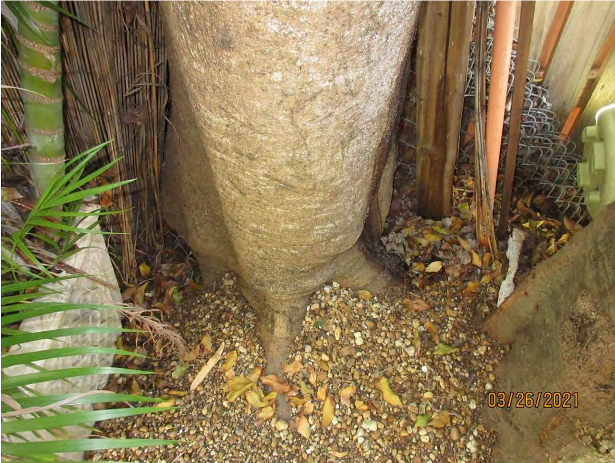
Photo of base of tree.