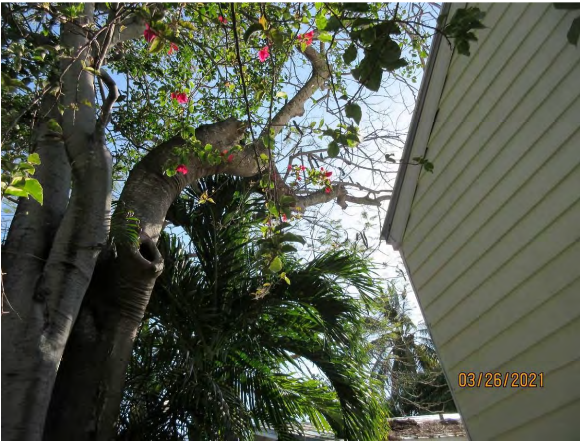
Photo showing upper trunk area and canopy. Note large decay hole at upper canopy area. Entire canopy growth is to the neighbor's house.