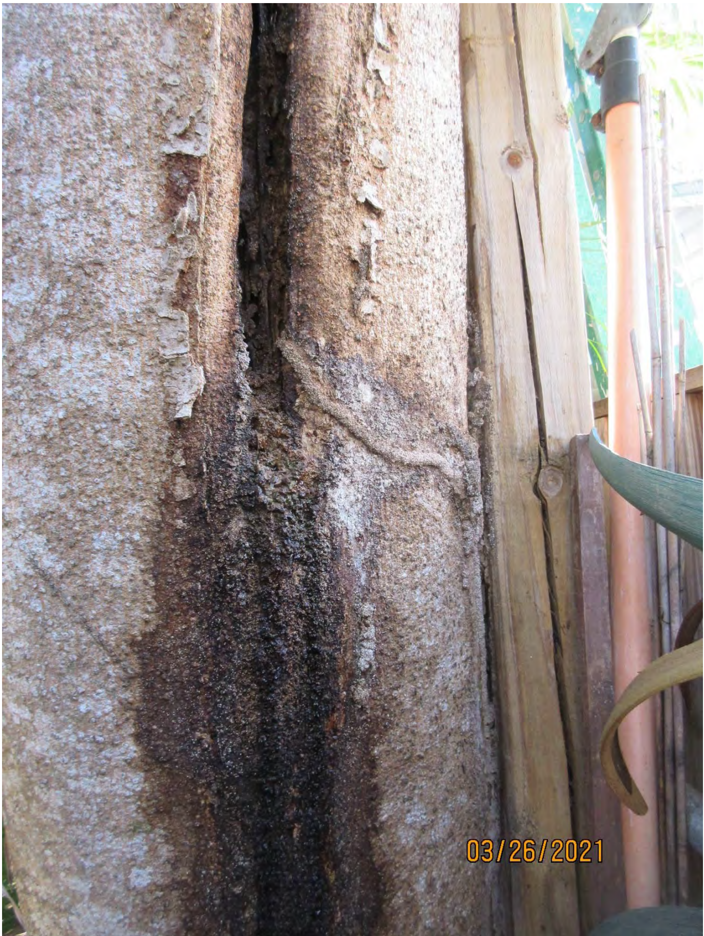
View of damage/decay area along length of trunk, view 3.