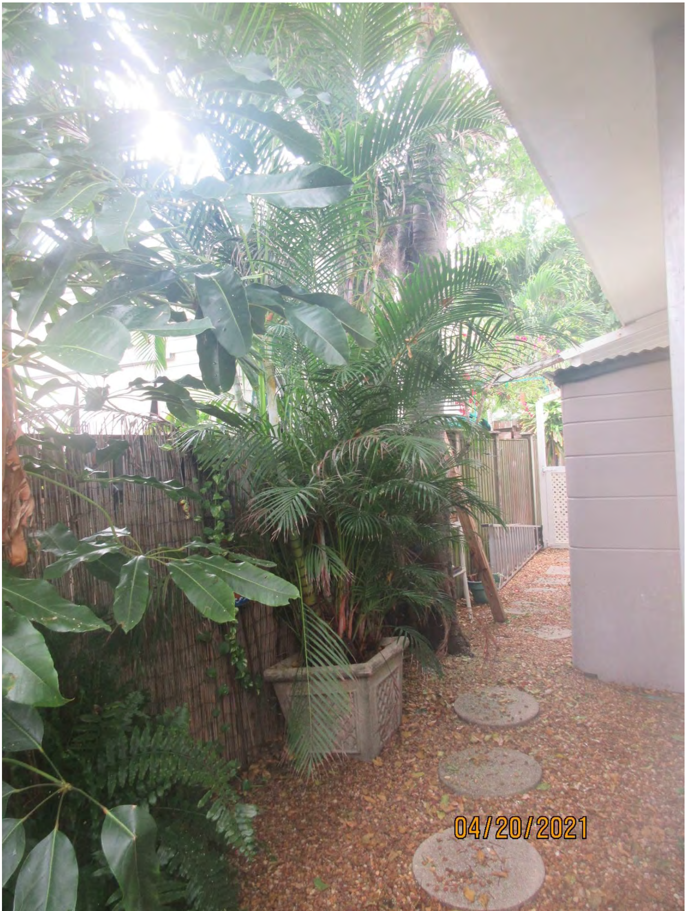
Photo of side yard where tree is located.