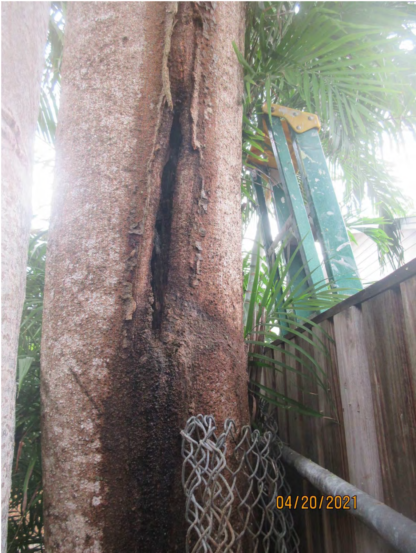
View of damage/decay area along length of trunk, view 1.