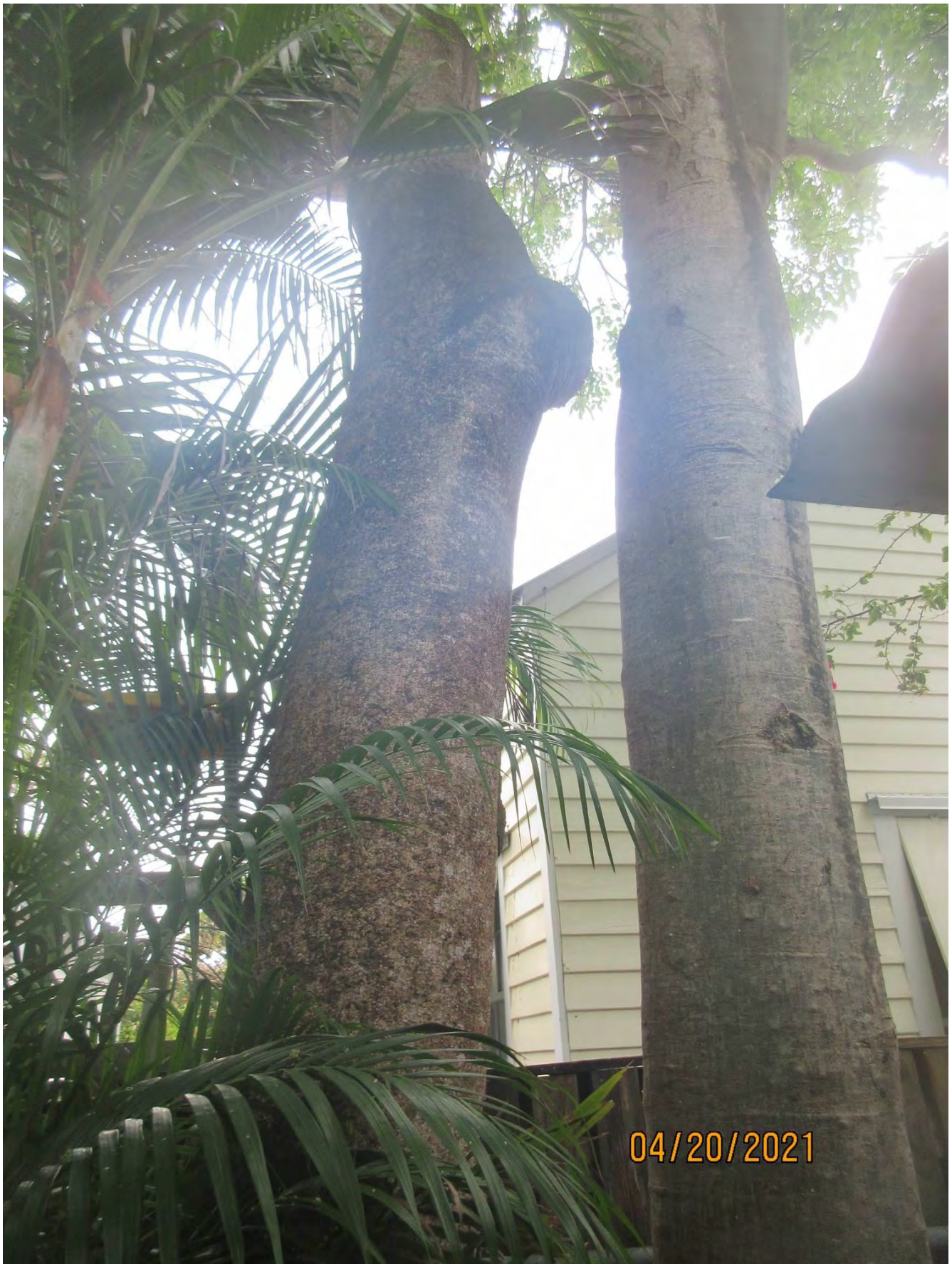
Royal Poinciana tree trunk, to be removed, view 1.