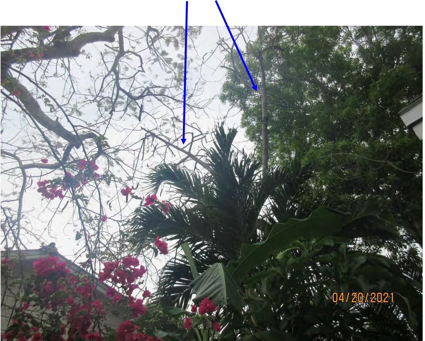
Photo of tree canopy trying to show location of tree along side yard.

Tree Species: Royal Poinciana ( Delonix regia )