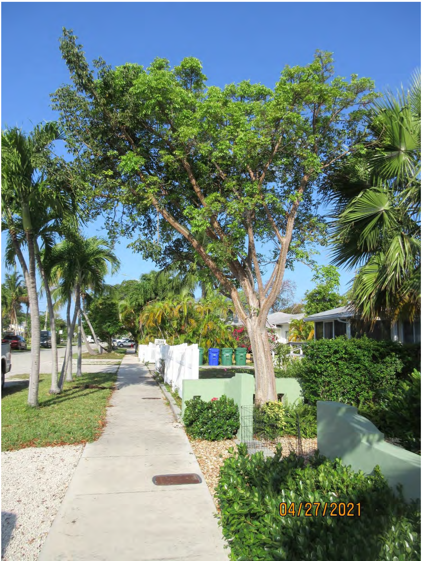
Photo of entire tree and location of tree.