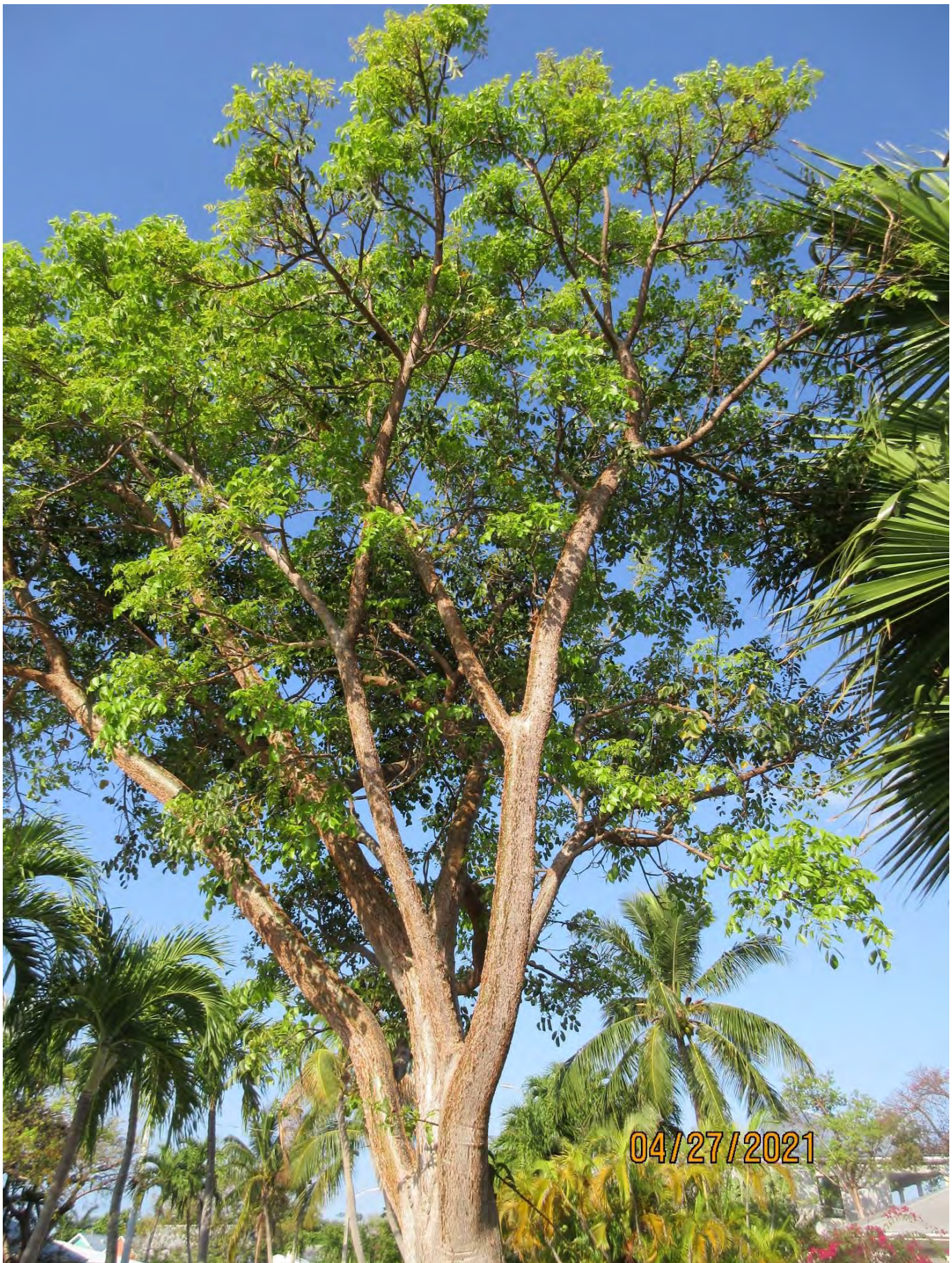
Photo of tree canopy.