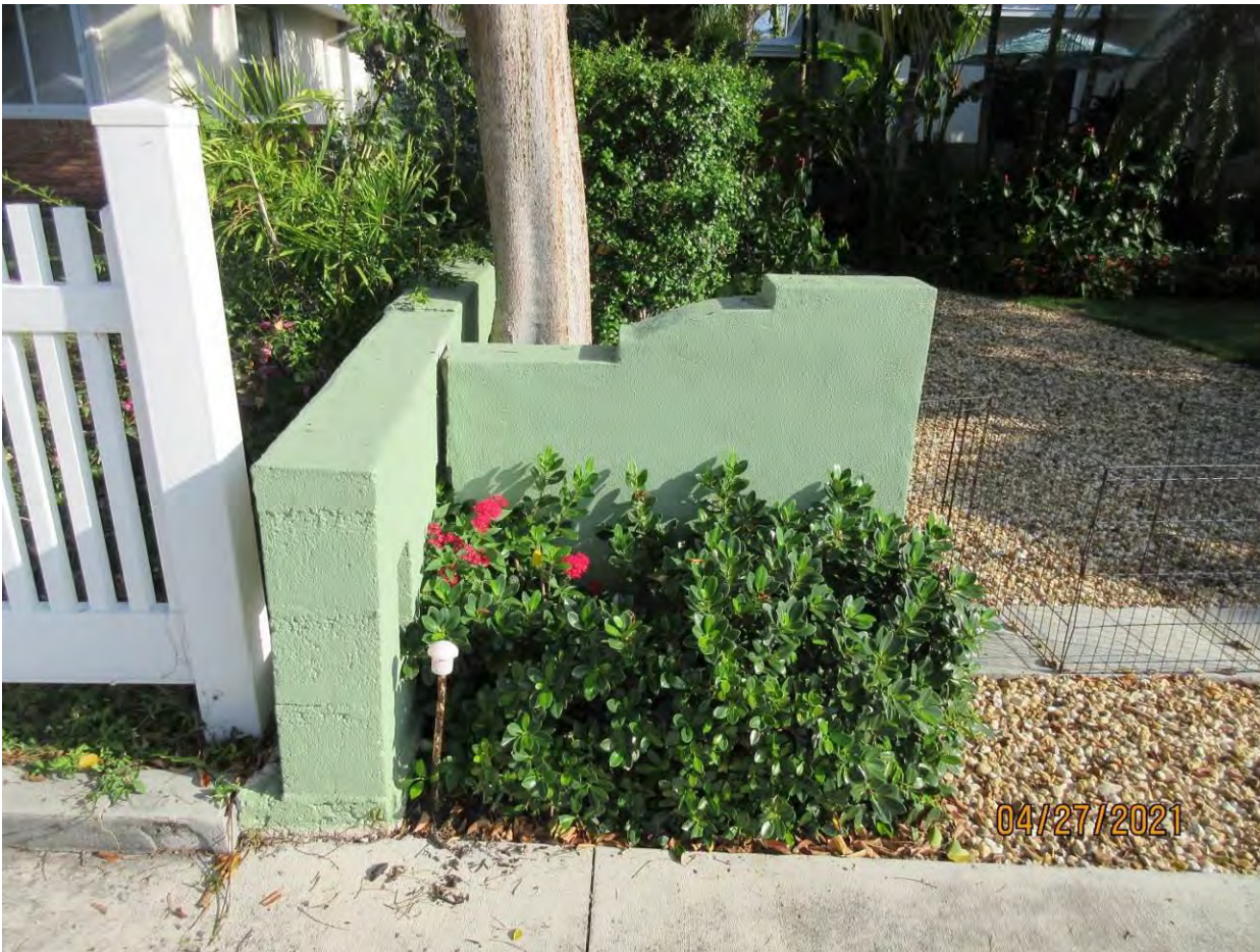
Two photos showing tree trunk and concrete property line wall, views 2 and 3.