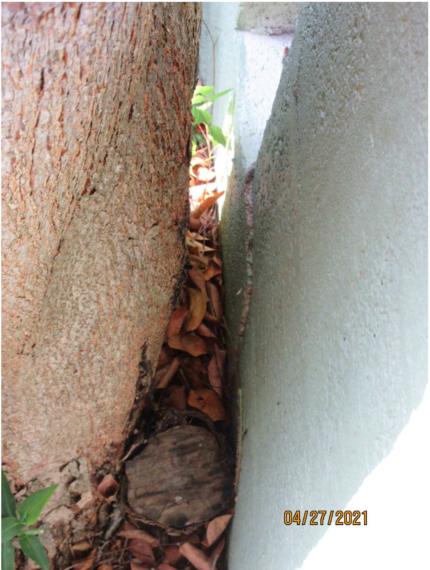
Close up photo of trunk location and concrete property line wall, view 2.