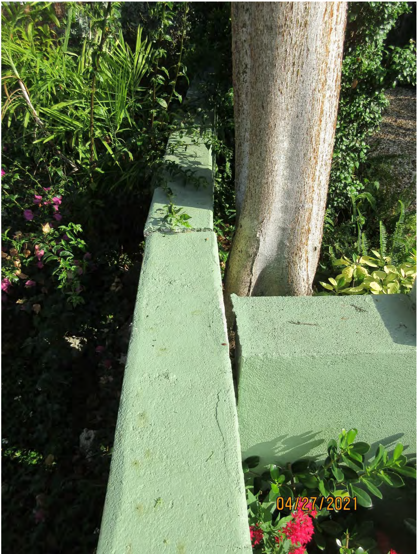
Photo showing tree trunk location in relation to concrete property line wall, view 1.