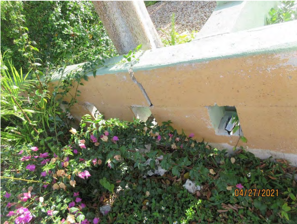
Photo of concrete property line wall damage from neighbor property.