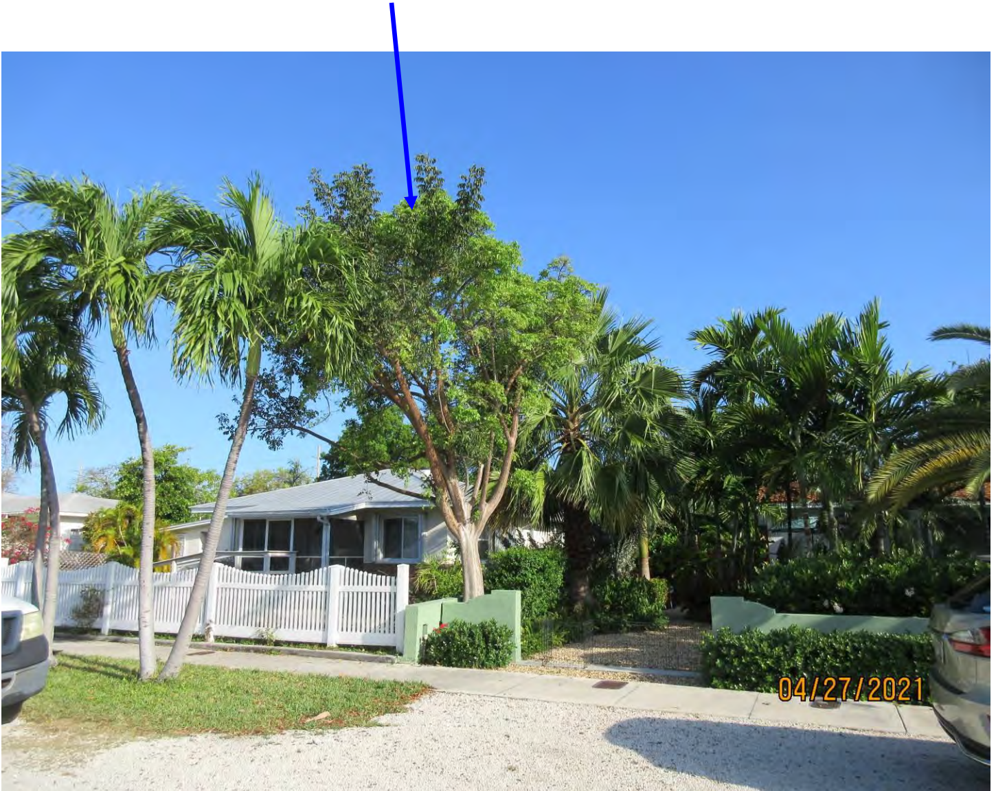
Photo showing location of tree.

Tree Species: Gumbo Limbo ( Bursera simaruba )