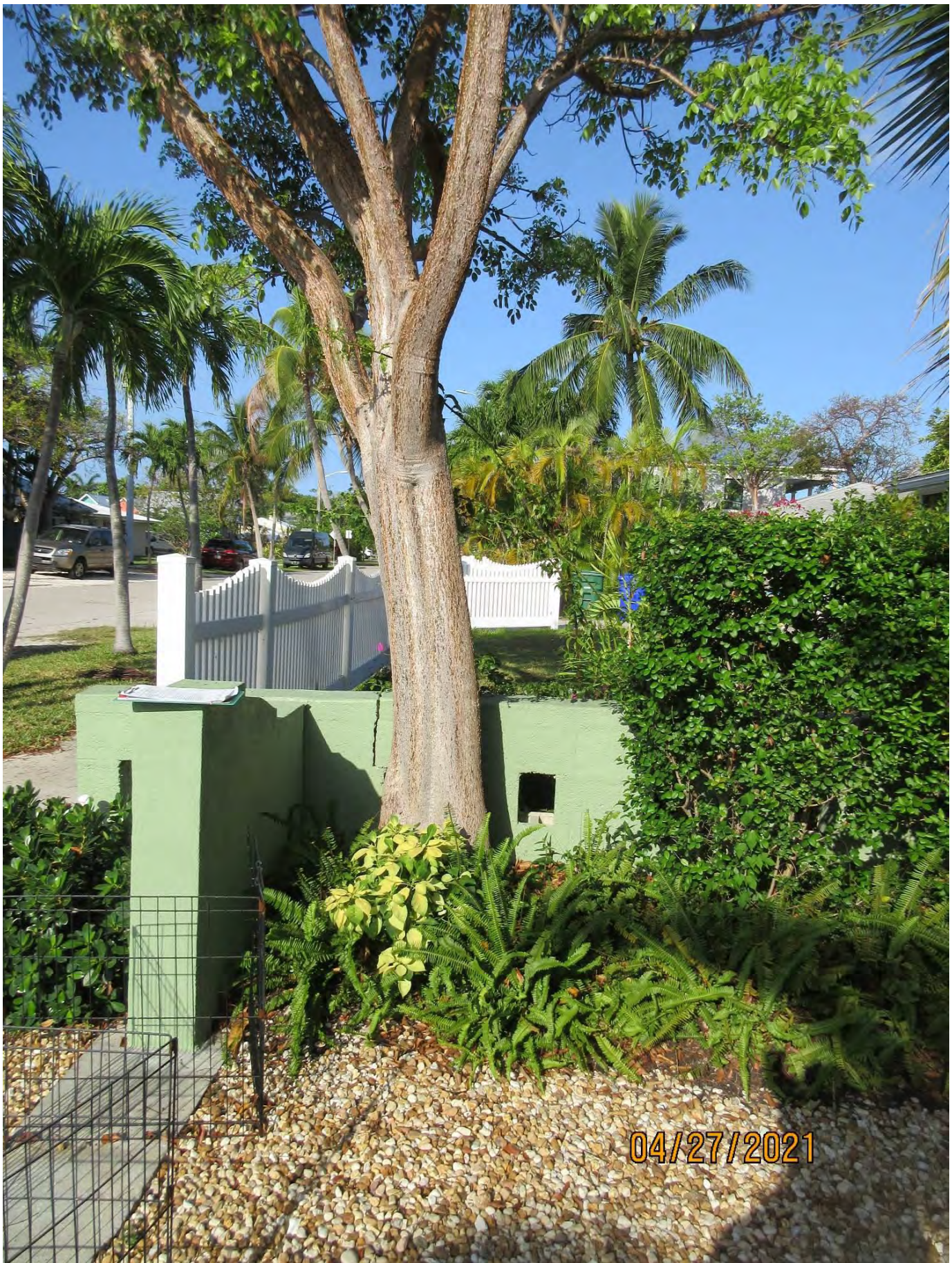
Photo of tree trunk and canopy, view 2.