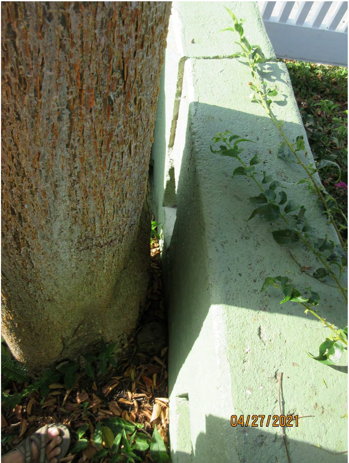
Close up photo of trunk location and concrete property line wall, view 1.