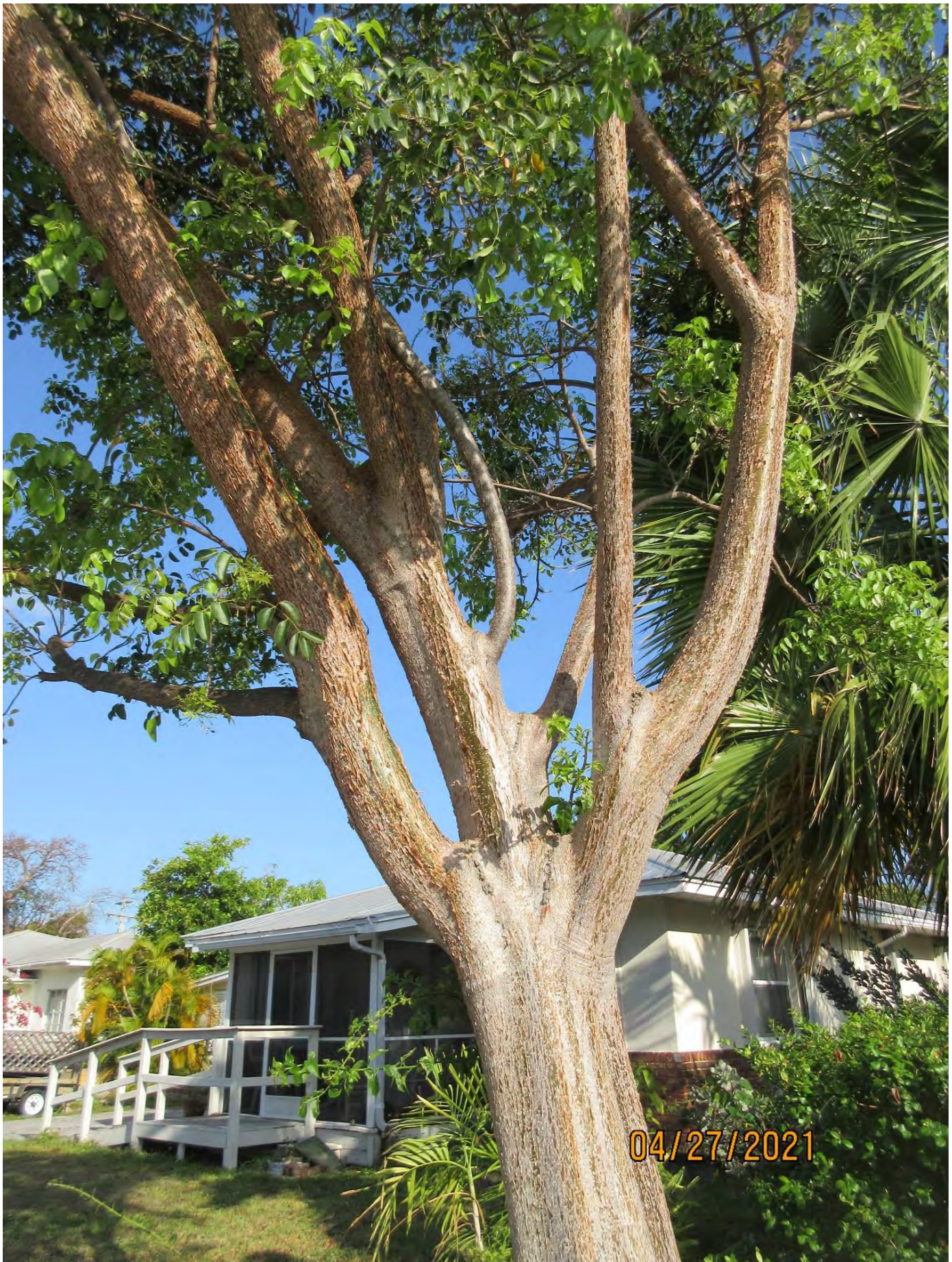
Photo of tree trunk and canopy, view 1.