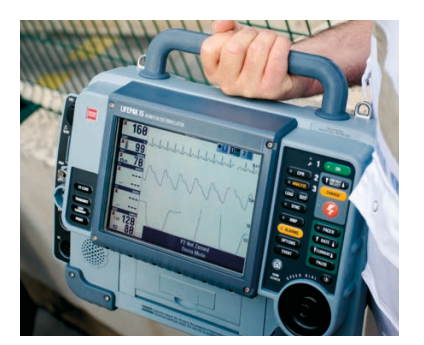
Dual-mode LCD screen with SunVue display