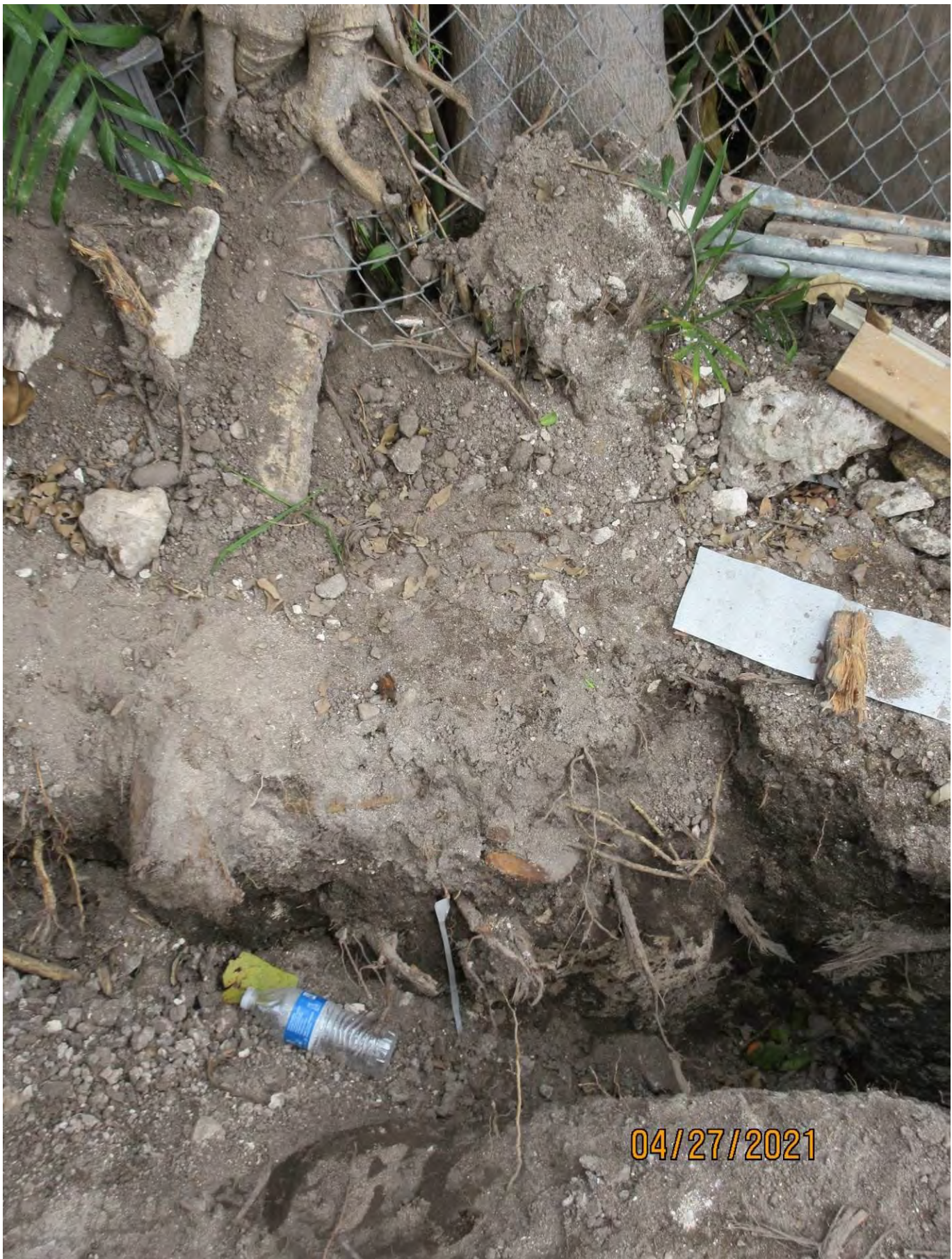
Closer view of trench and cut roots.