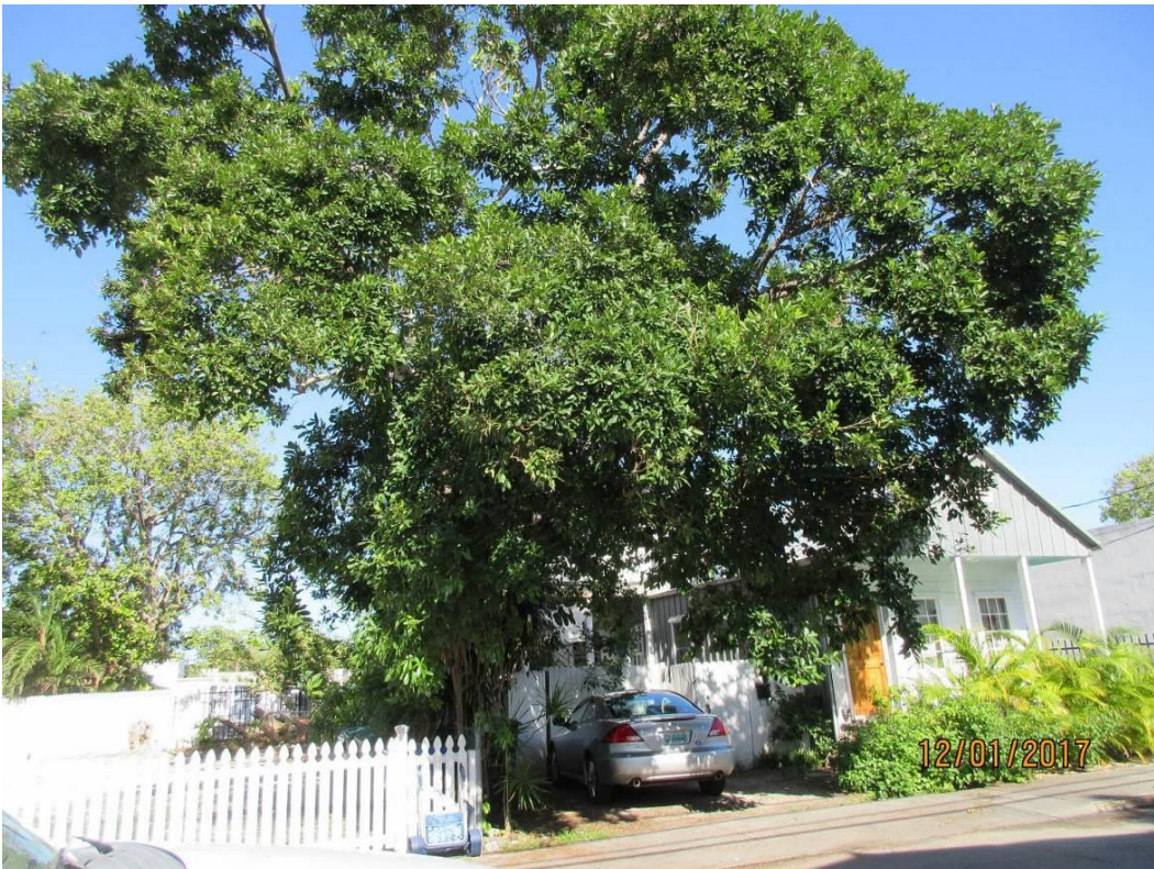
Photo of tree prior to construction.

The owner of the tree and the person residing in 811 Olivia Street want the tree to remain. It is recommended that the tree root area receive regular watering to help reestablish root growth and the canopy be trimmed primarily on the 811 Olivia Street side to help balance and stabilize the tree.