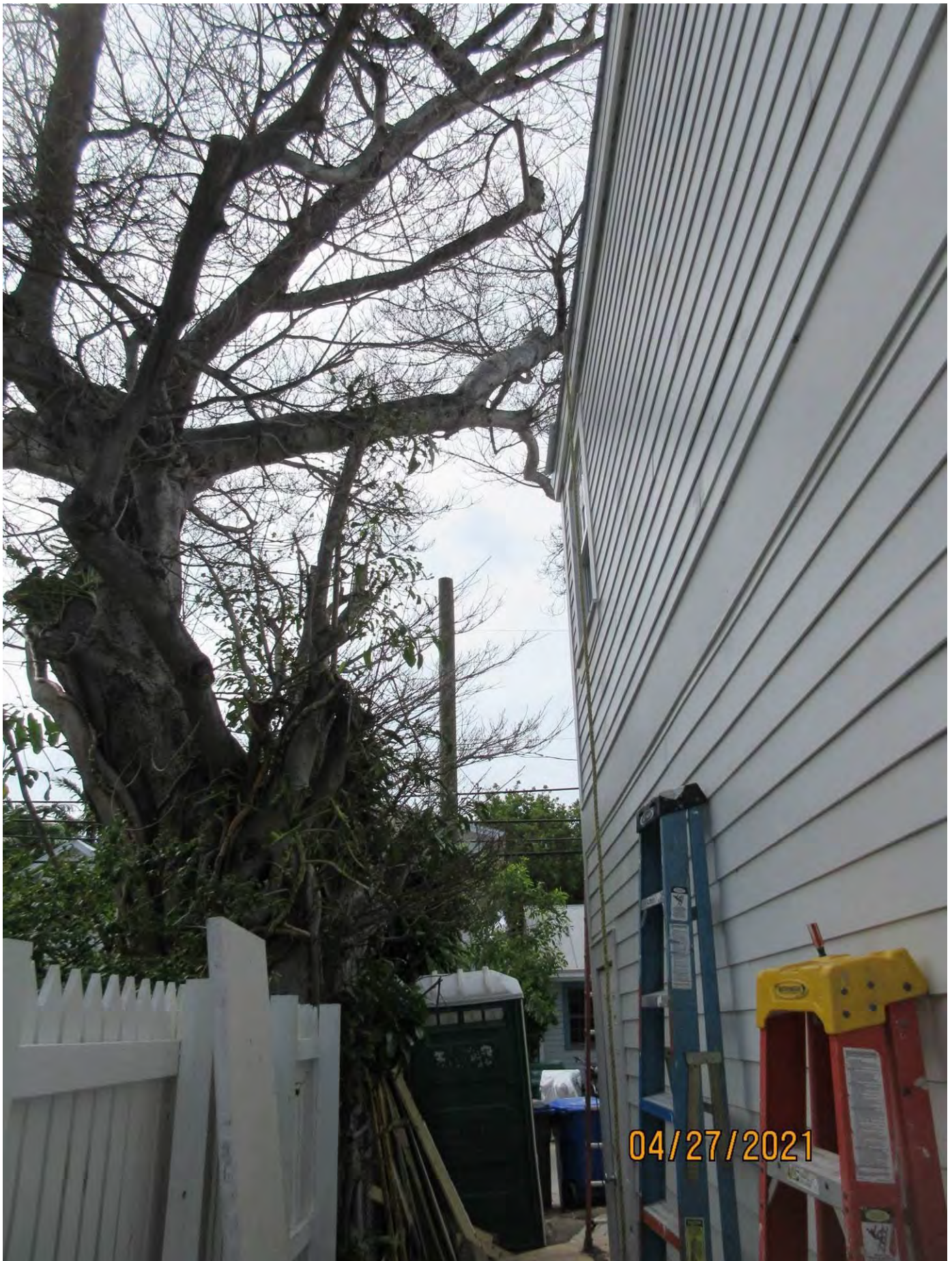
Photo of tree from 805 Olivia side yard looking toward Olivia Street.