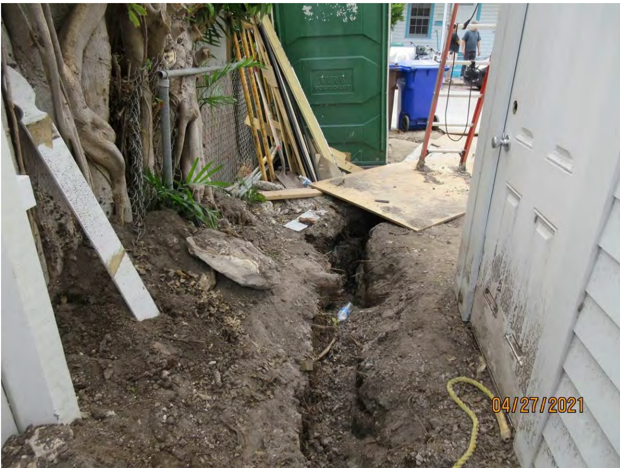
Two photos showing trench and tree roots, views 2 and 3.