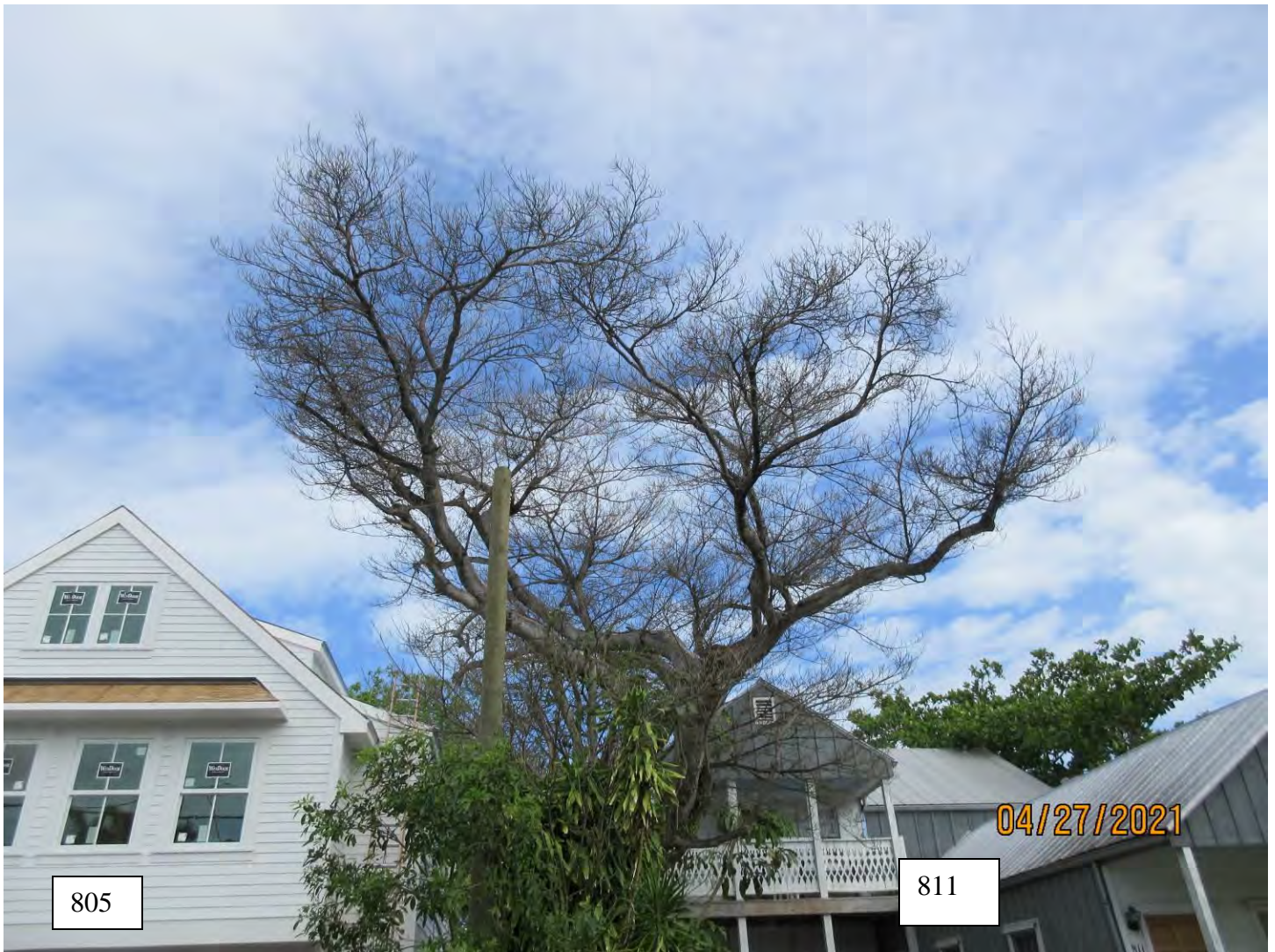
Photo of tree canopy-standing on Olivia Street looking at tree.