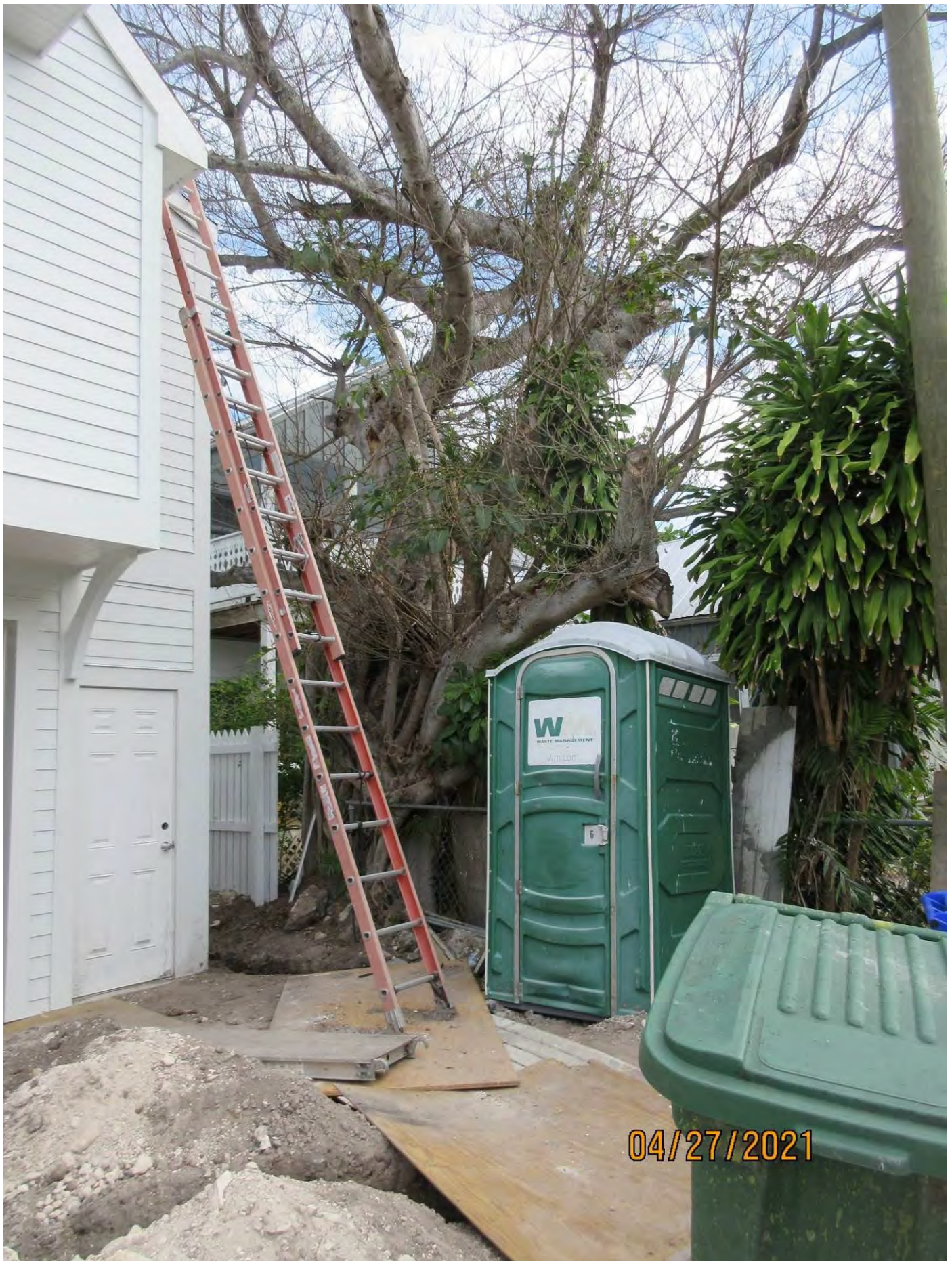
Photo showing location of tree and trenching work.