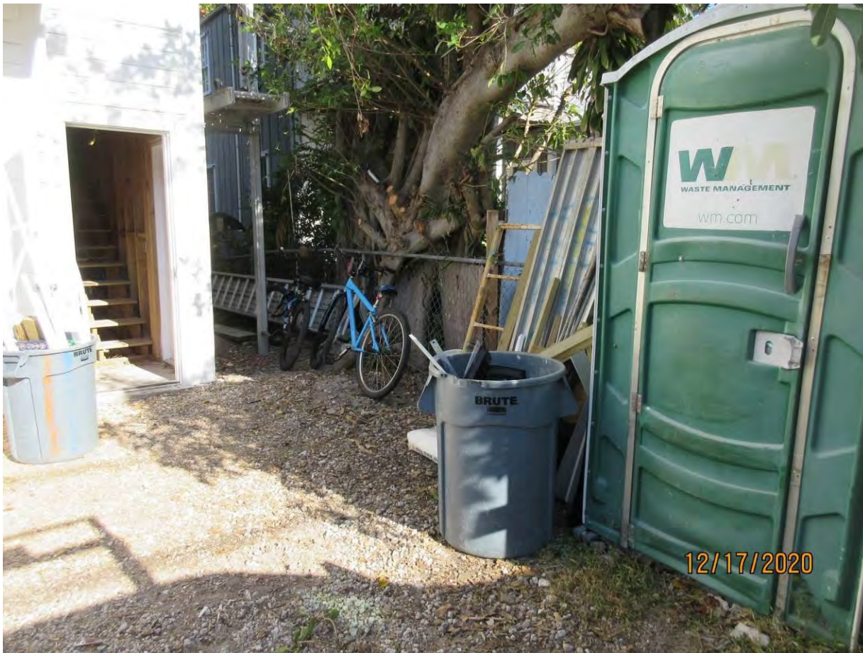
Two photos showing location of tree along property line prior to roots being cut.