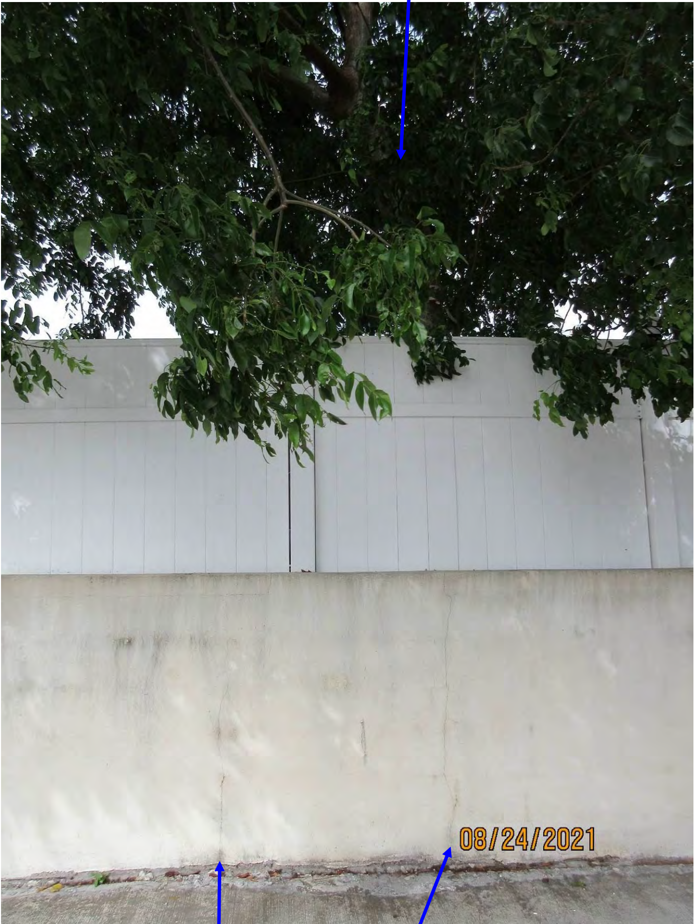
Photo showing cracks in concrete wall.