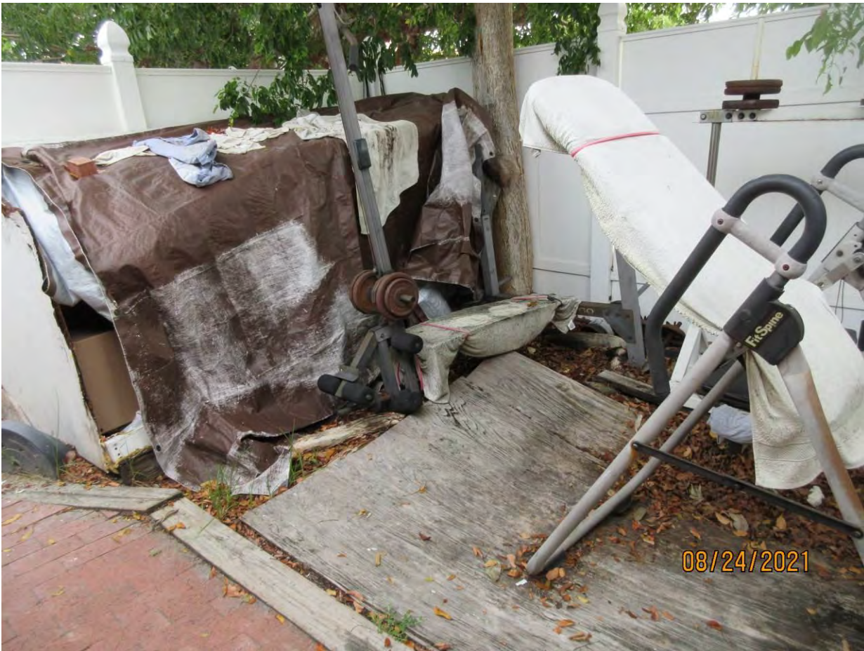
Two photos showing base and trunk of tree and its location at base of fence.