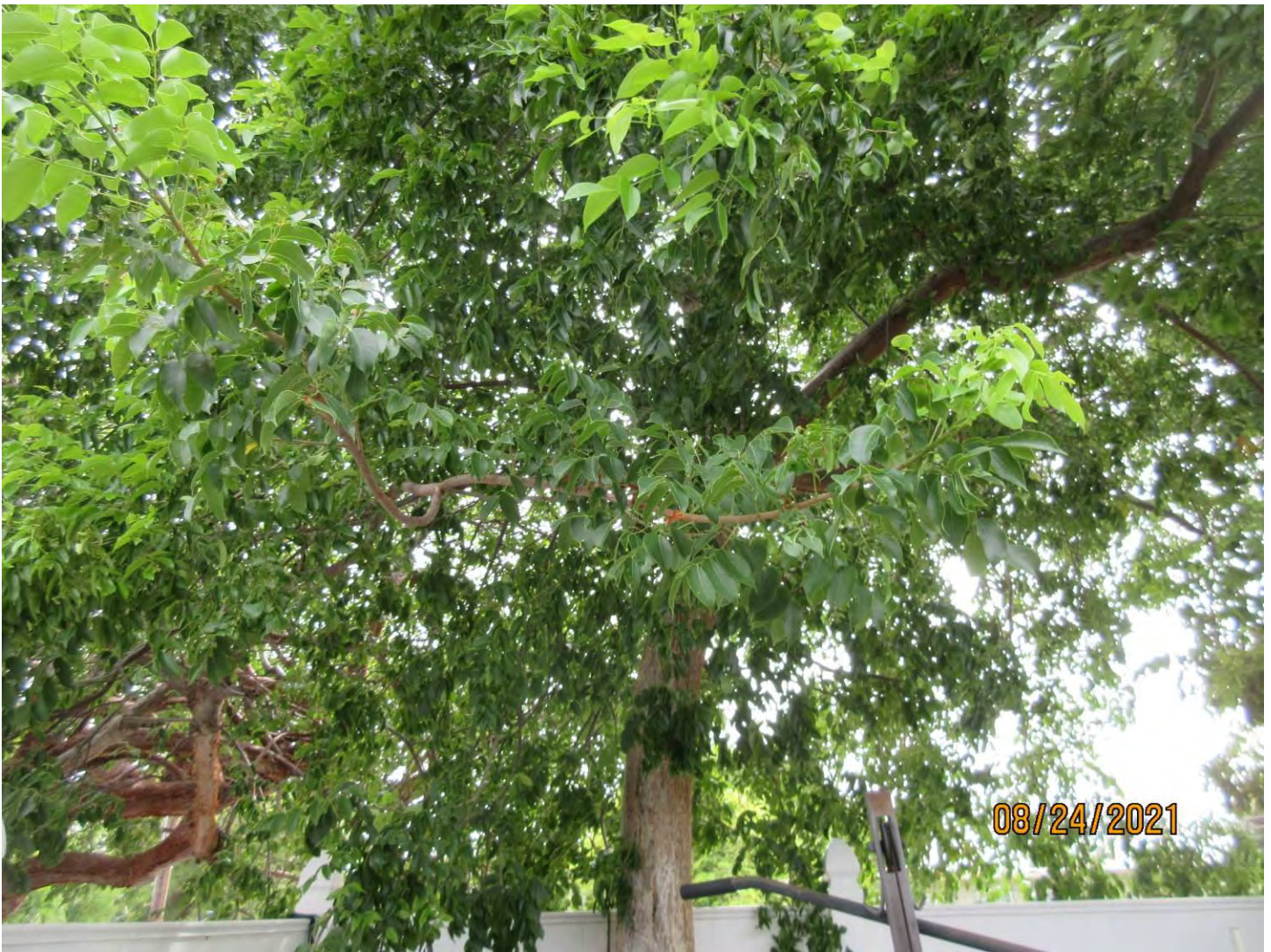
Photo of tree canopy, view 2.