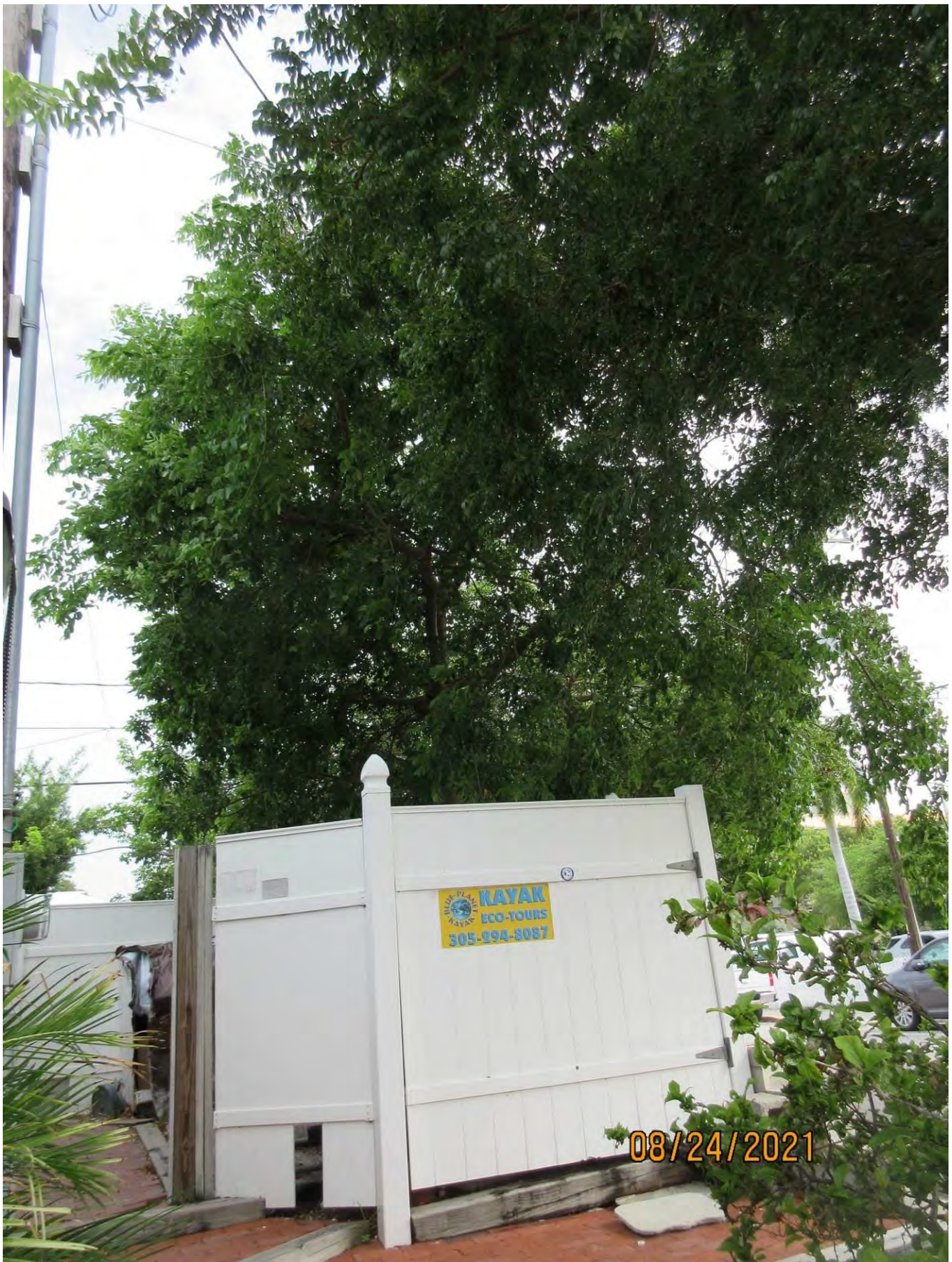
Photo showing whole tree.