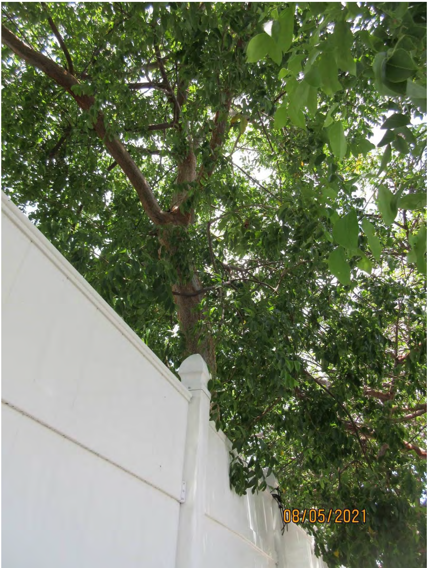
Photo showing tree trunk against fence. On right side of photo is the City Gumbo Limb tree canopy.