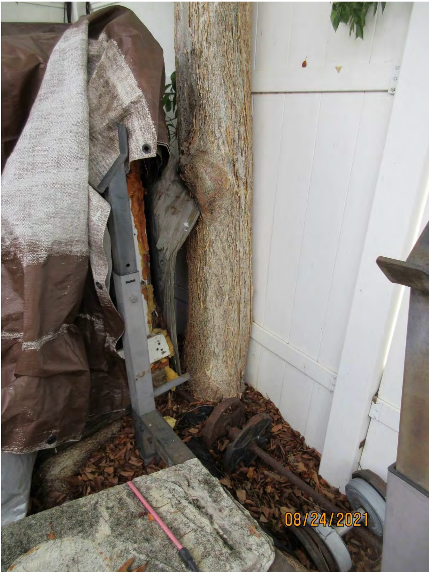
Photo showing base and trunk of tree. Note damage to trunk from plywood that is now lodged in tree trunk.