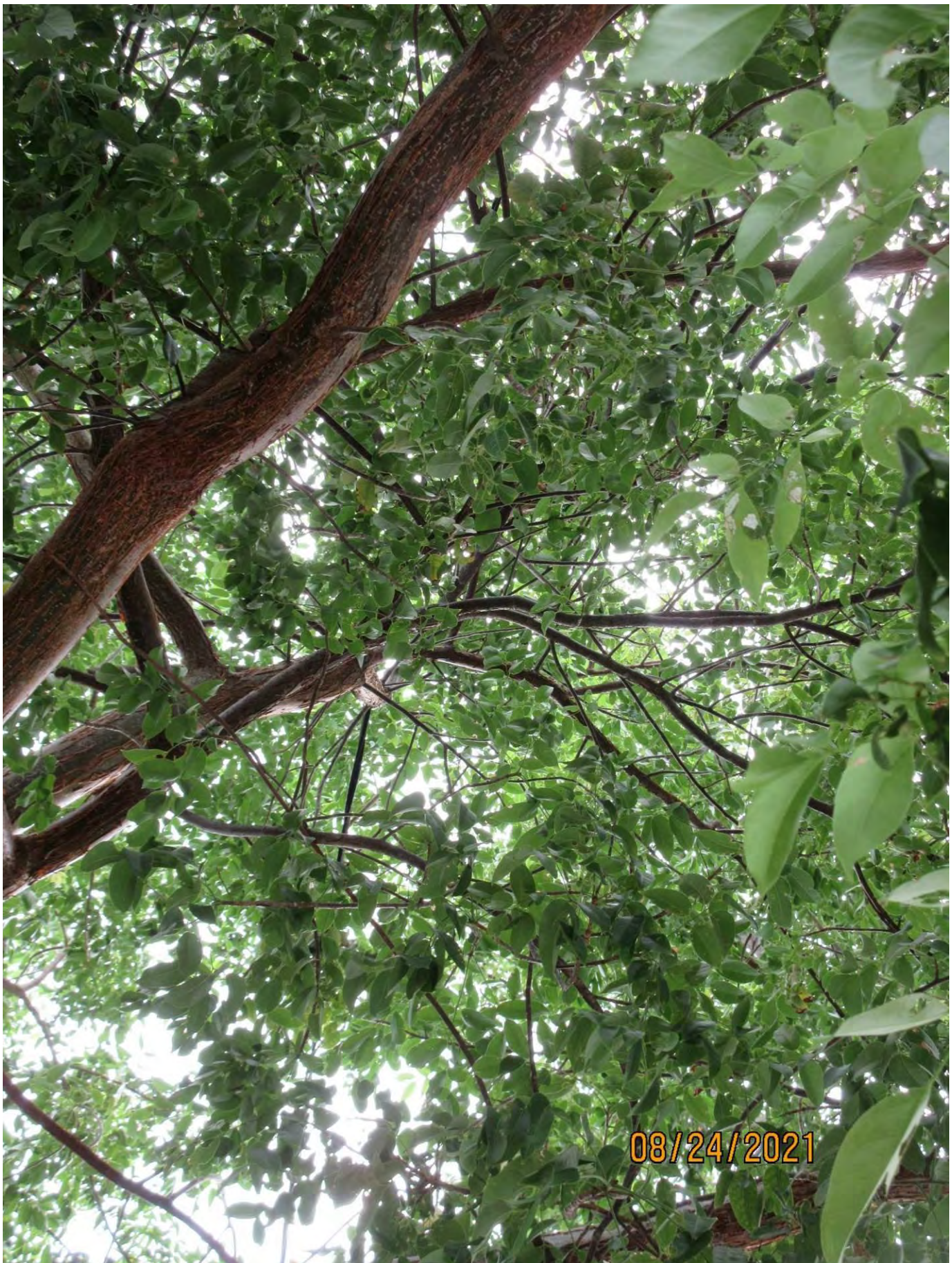
Photo of tree canopy, view 1.