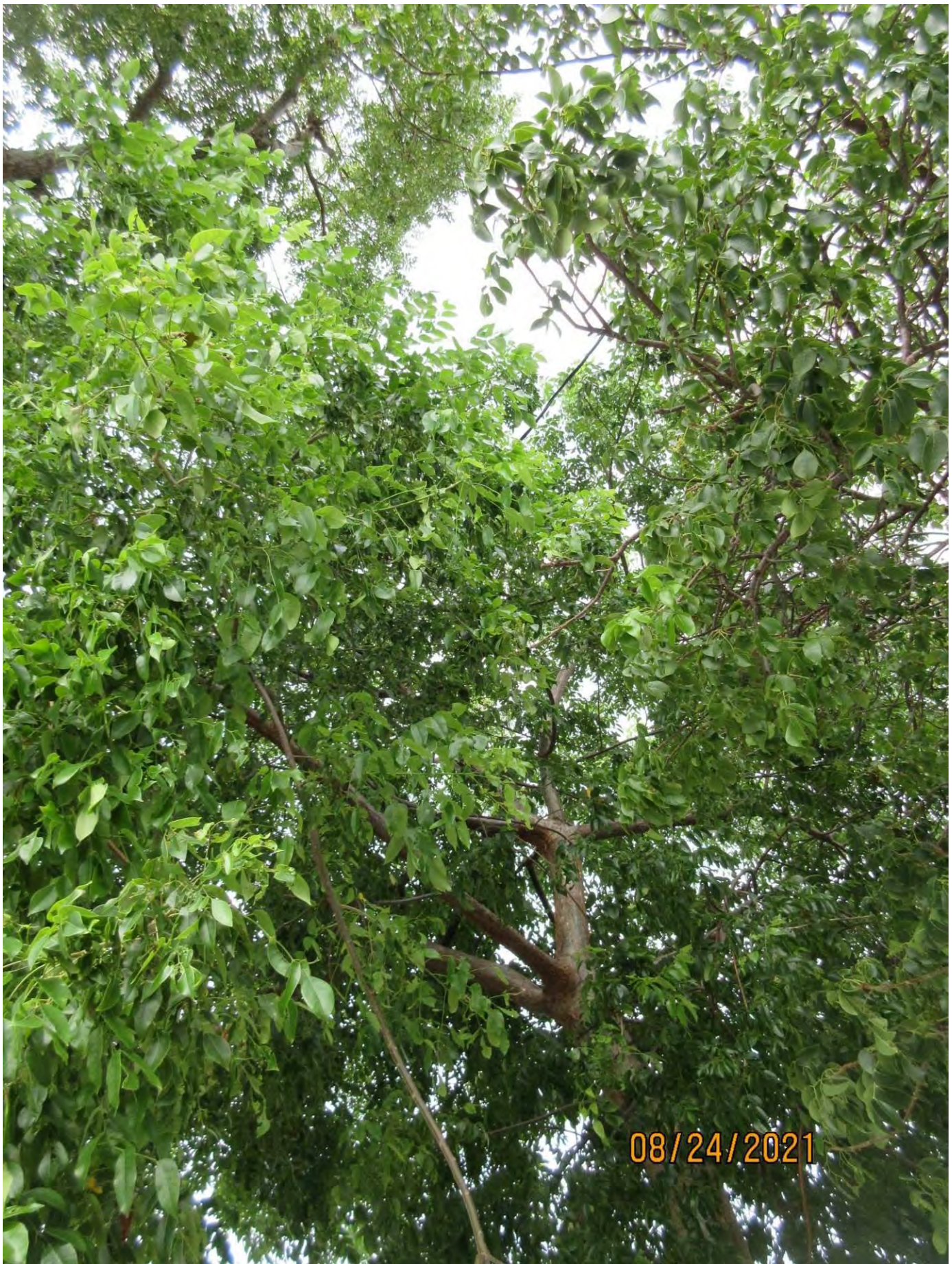
Photo of tree canopy, view 1.