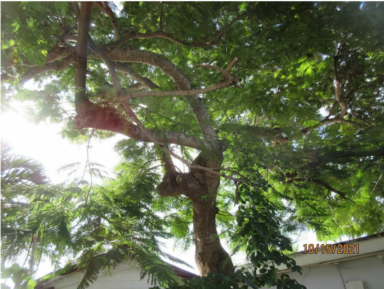
From the 4 th Street alley side of tree, looking at canopy, view 2.