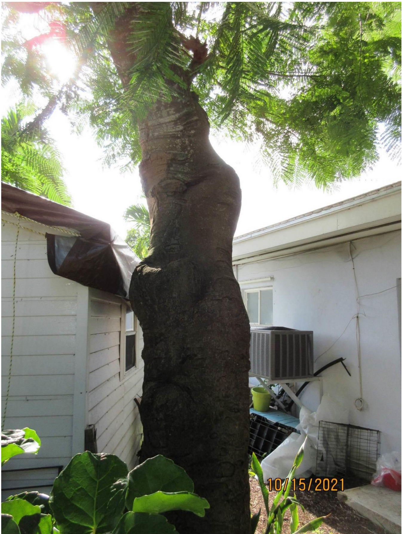
From the 4 th Street alley side of tree, looking at trunk.