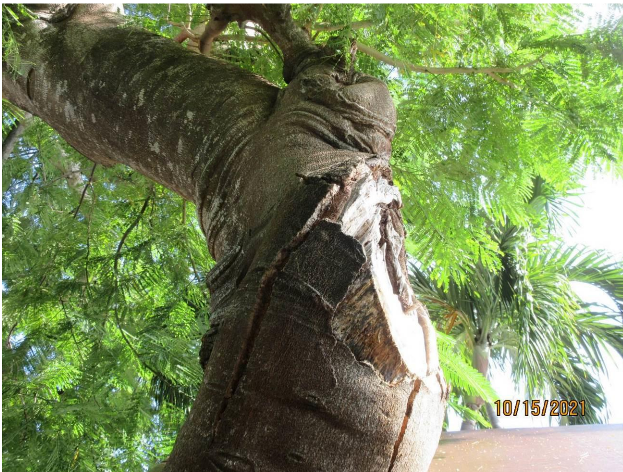
Photo showing tear area in main trunk, view 2.