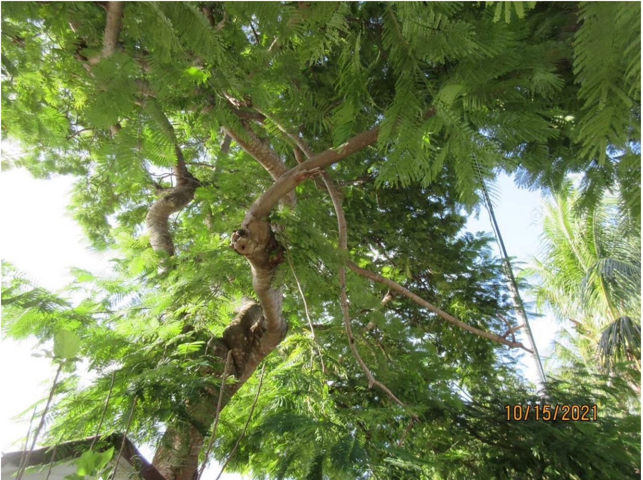
From the 4 th Street alley side of tree, looking at canopy, view 3.