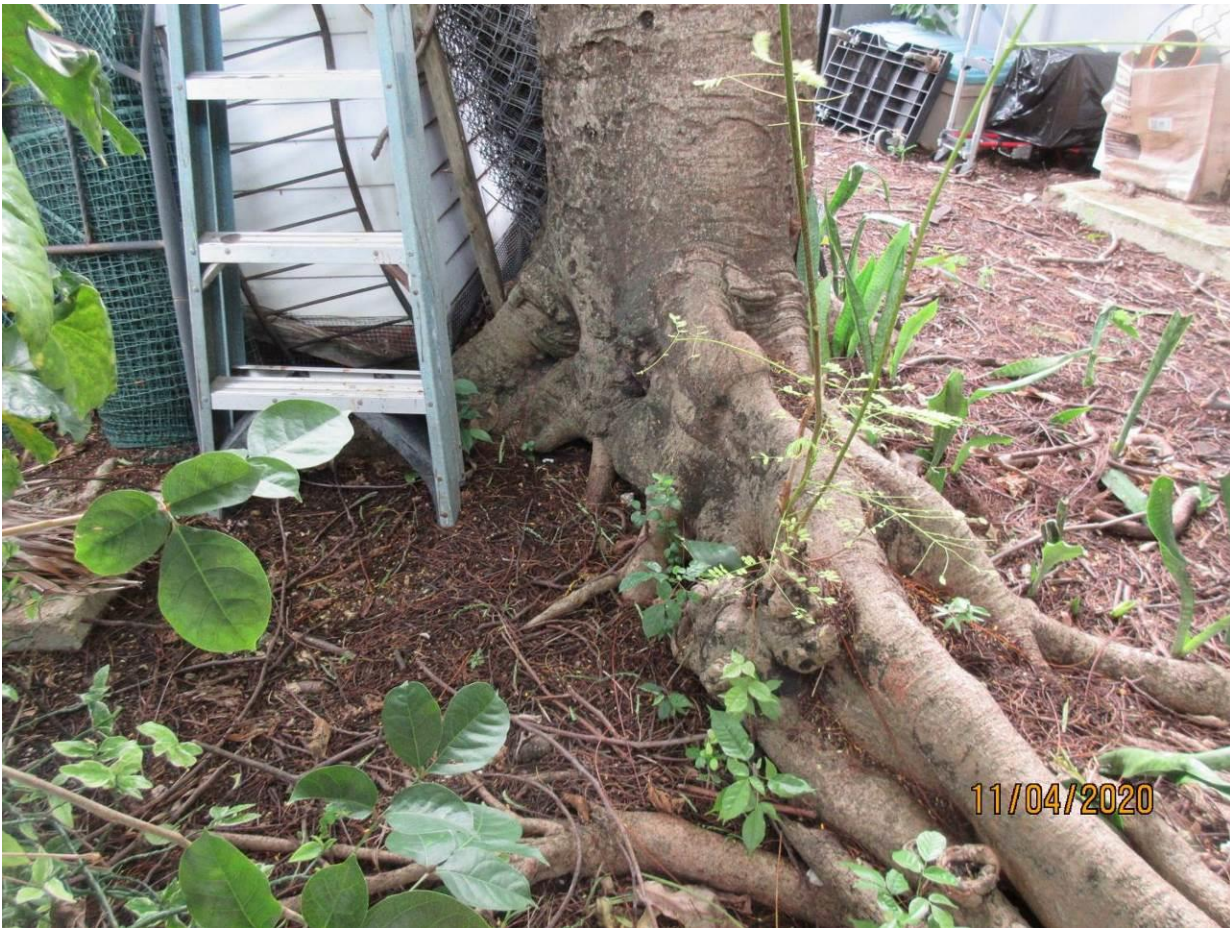
From the 4 th Street alley side of tree, looking at base of tree.