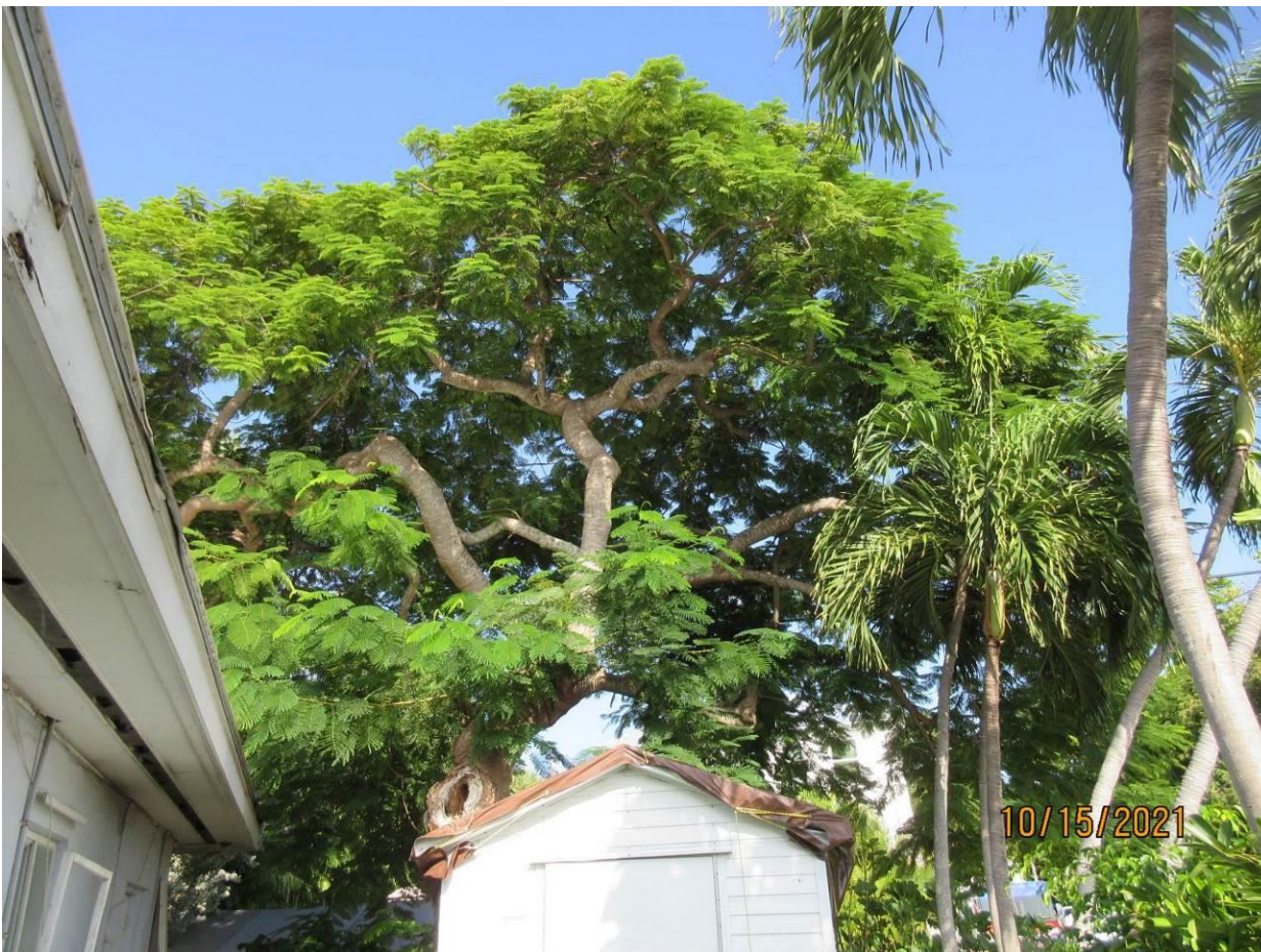
Standing on the property looking at tree canopy.