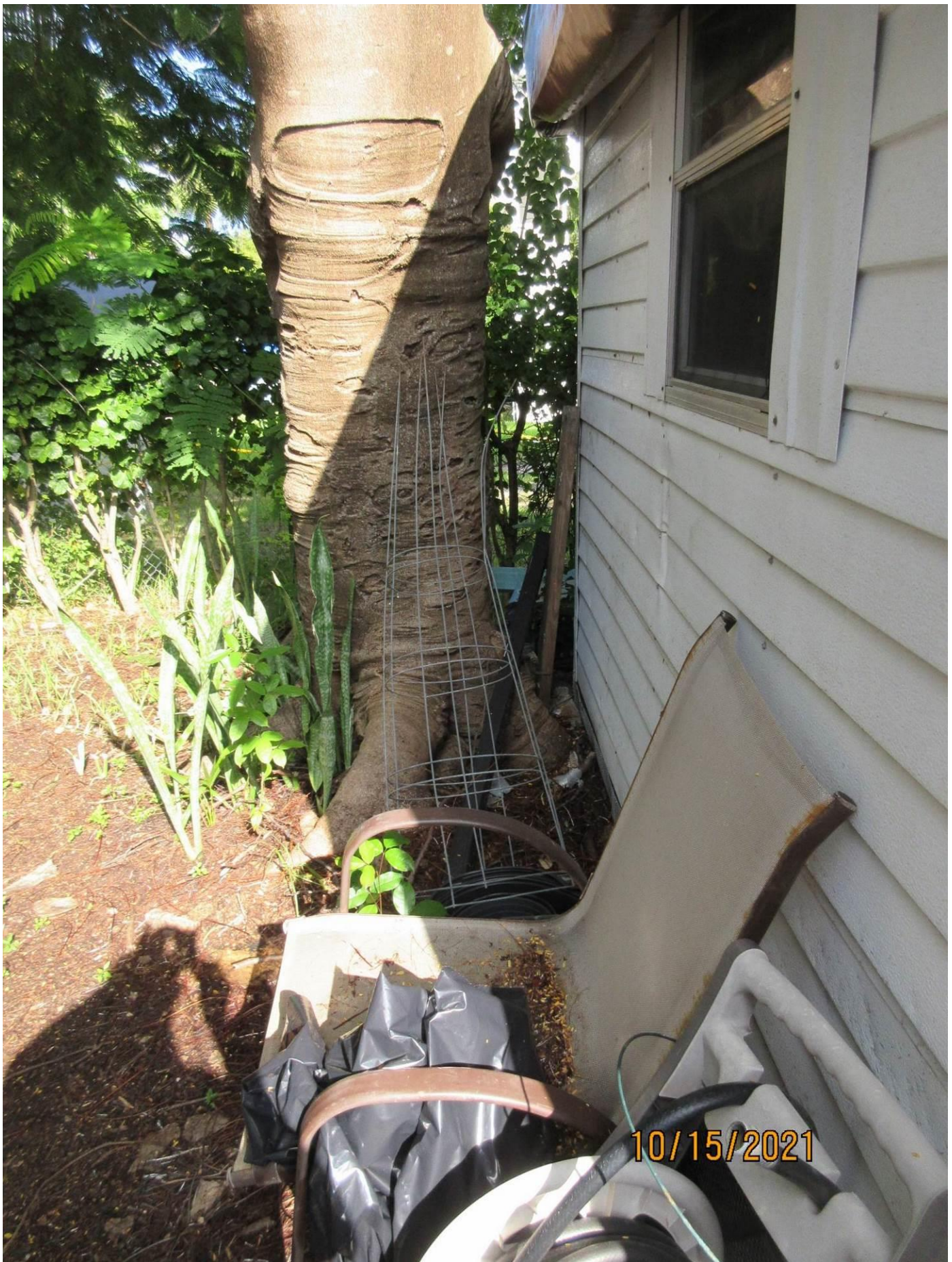
Standing on property looking at main trunk and base of tree.