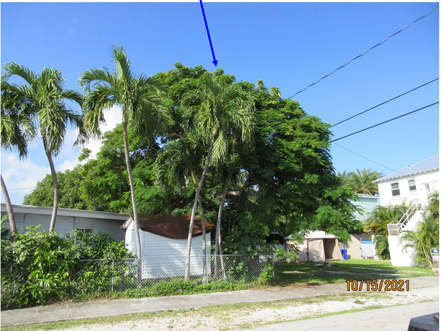
Photo showing location of tree.

Tree Species: Royal Poinciana (Delonix regia)