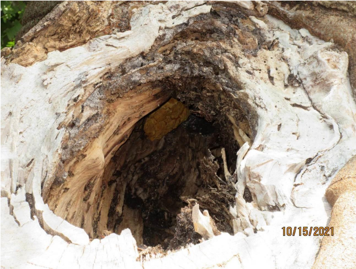
Close up view of decay and termite mud in tear area of trunk.