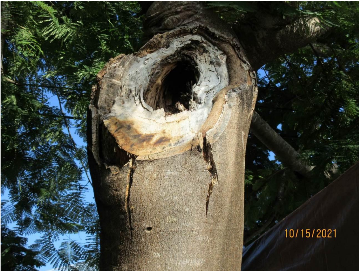
Photo showing tear area in main trunk, view 1.