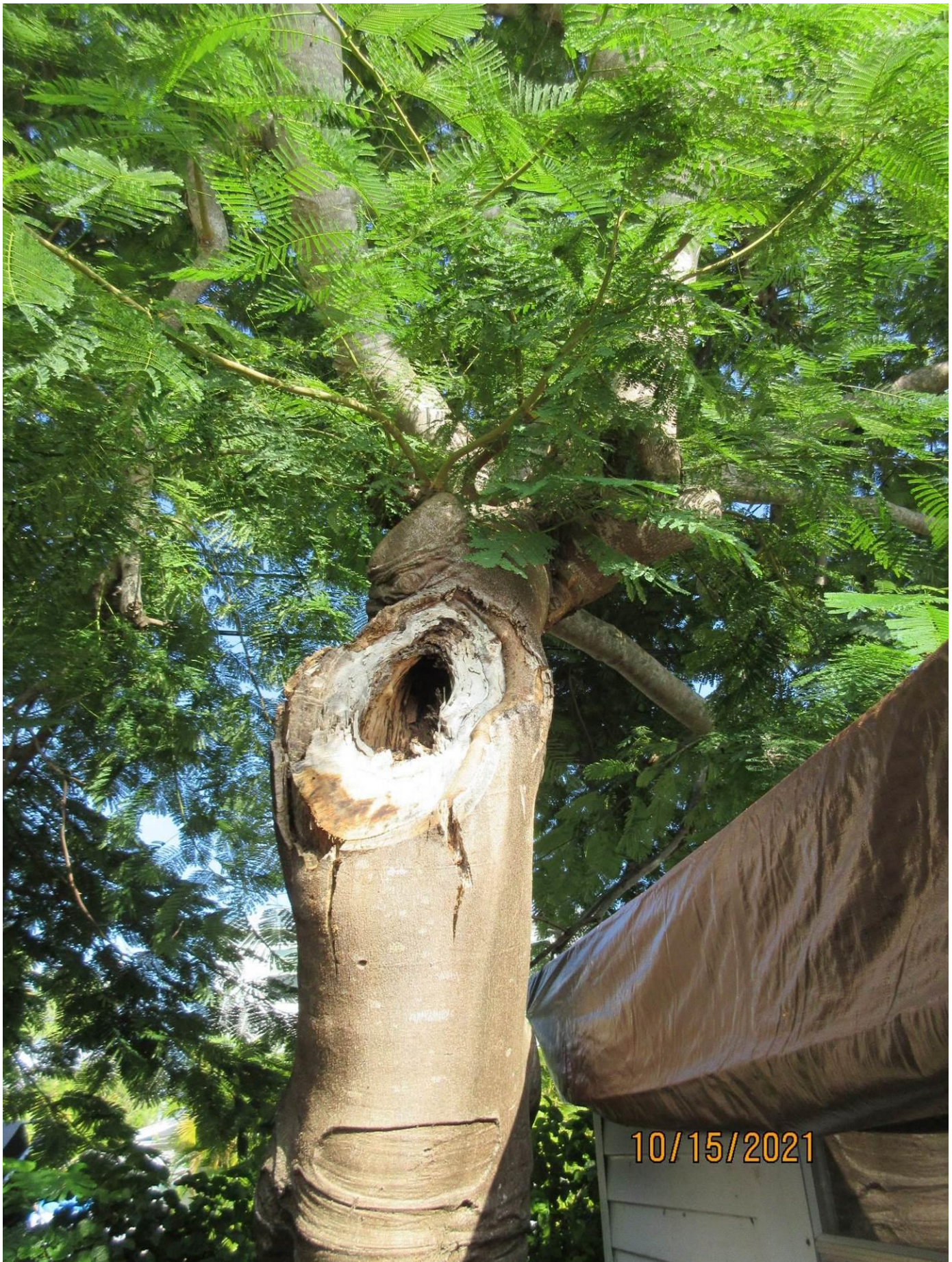
Standing on property looking at main trunk, canopy, and old tear area.