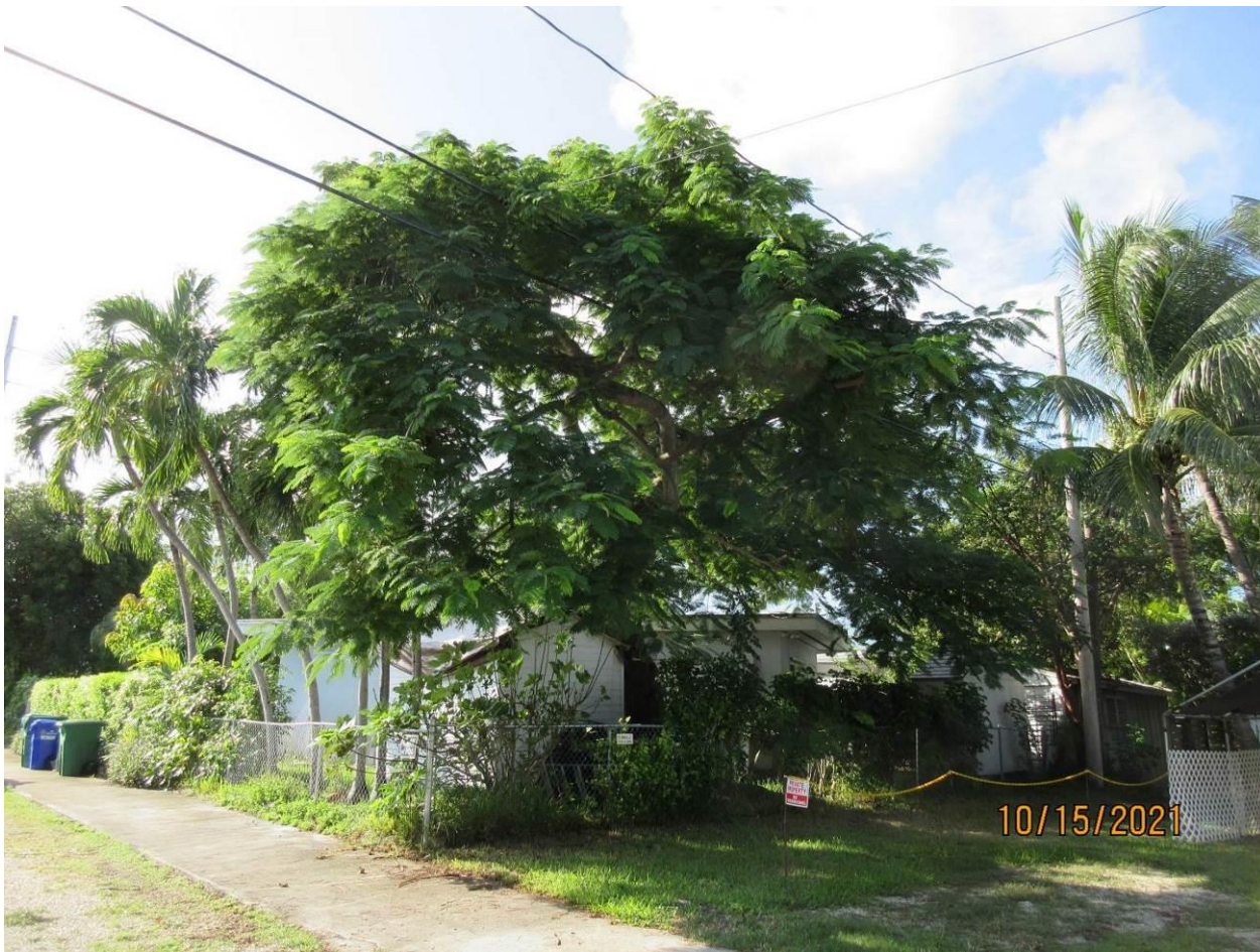
Standing on 4 th Street looking at whole tree.