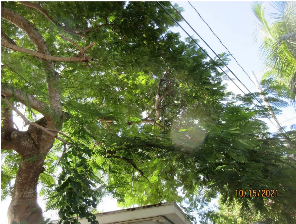
From the 4 th Street alley side of tree, looking at canopy, view 1.