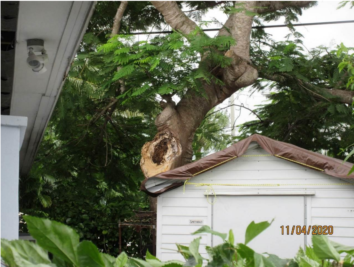
Photo of tree and tear area from one year ago.