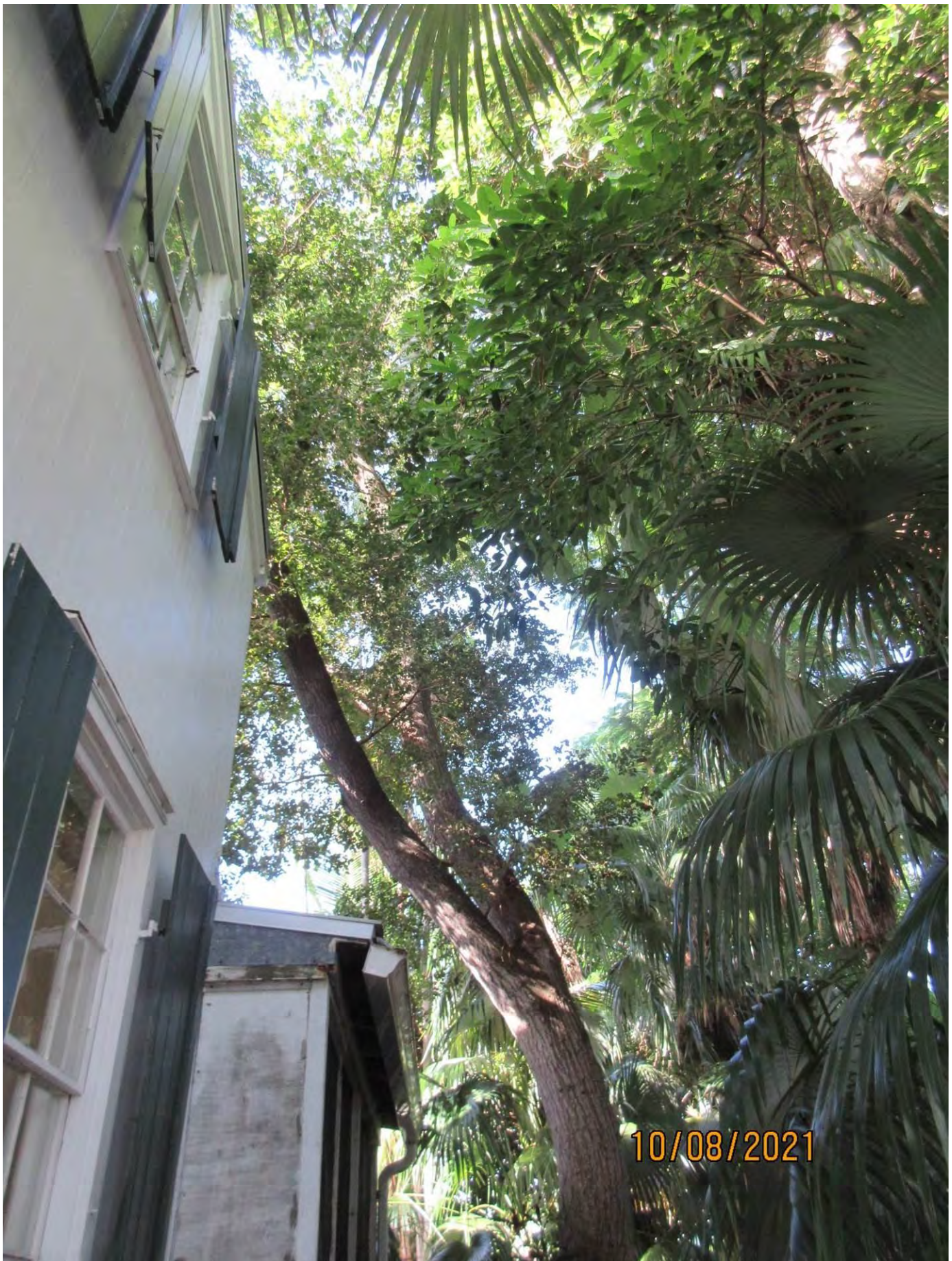
Photo showing location of trunk and canopy branch structure in relation to house.