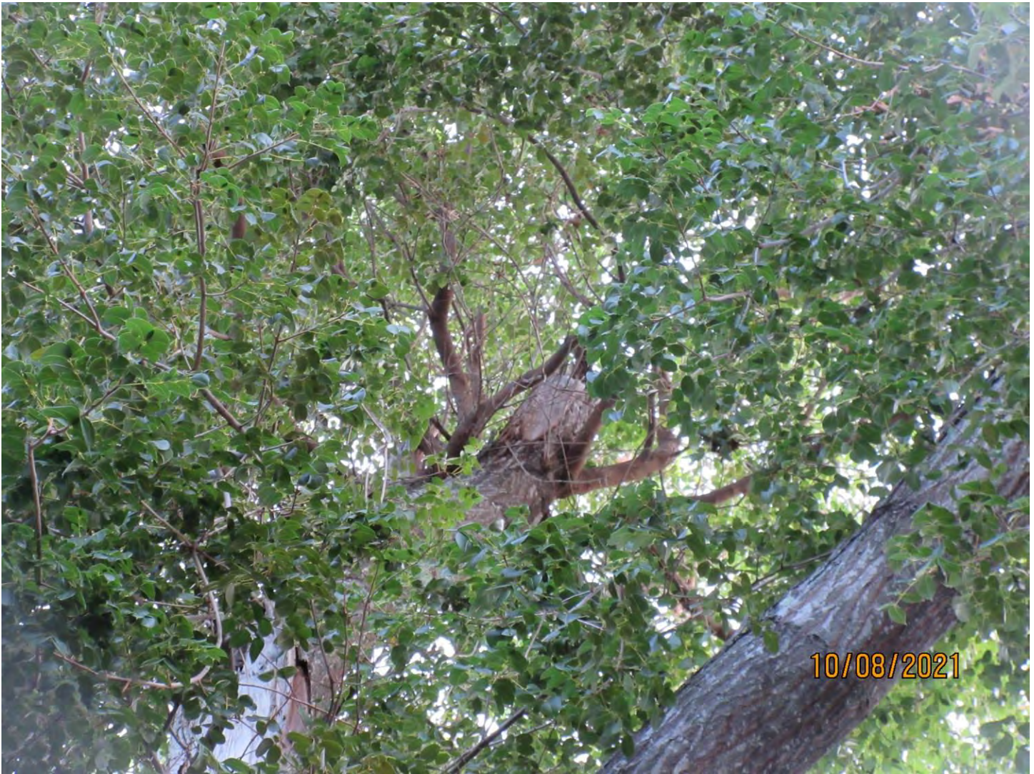
Close up of broken main leader area.