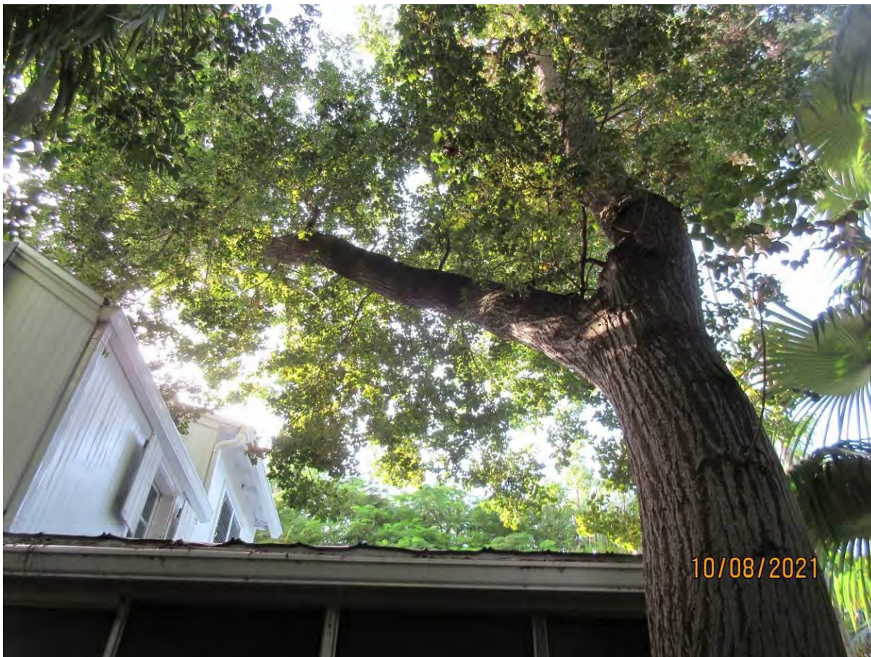
Photo of tree trunk and canopy, view 1.