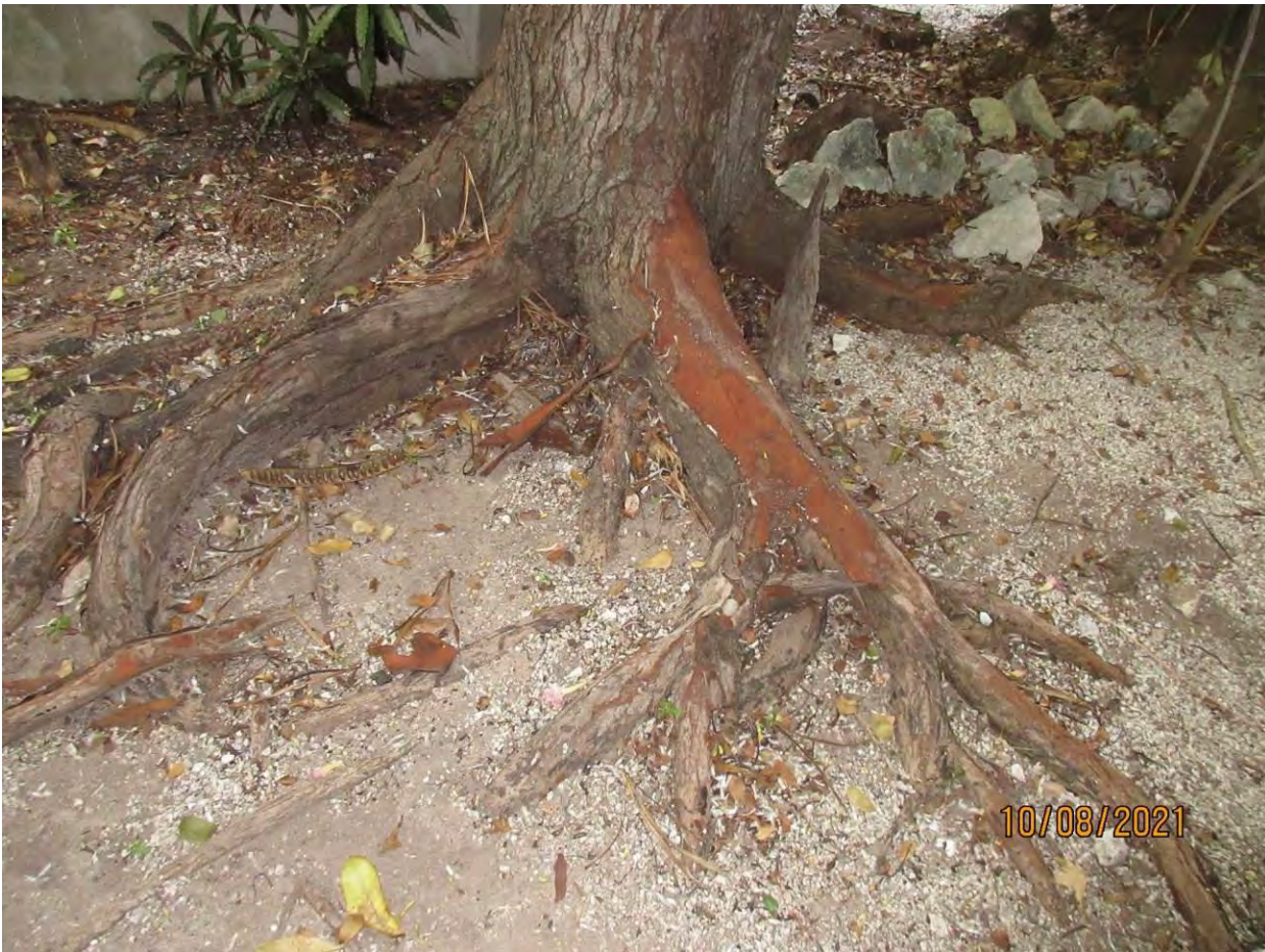
Photo of base of tree and root system, view 3.