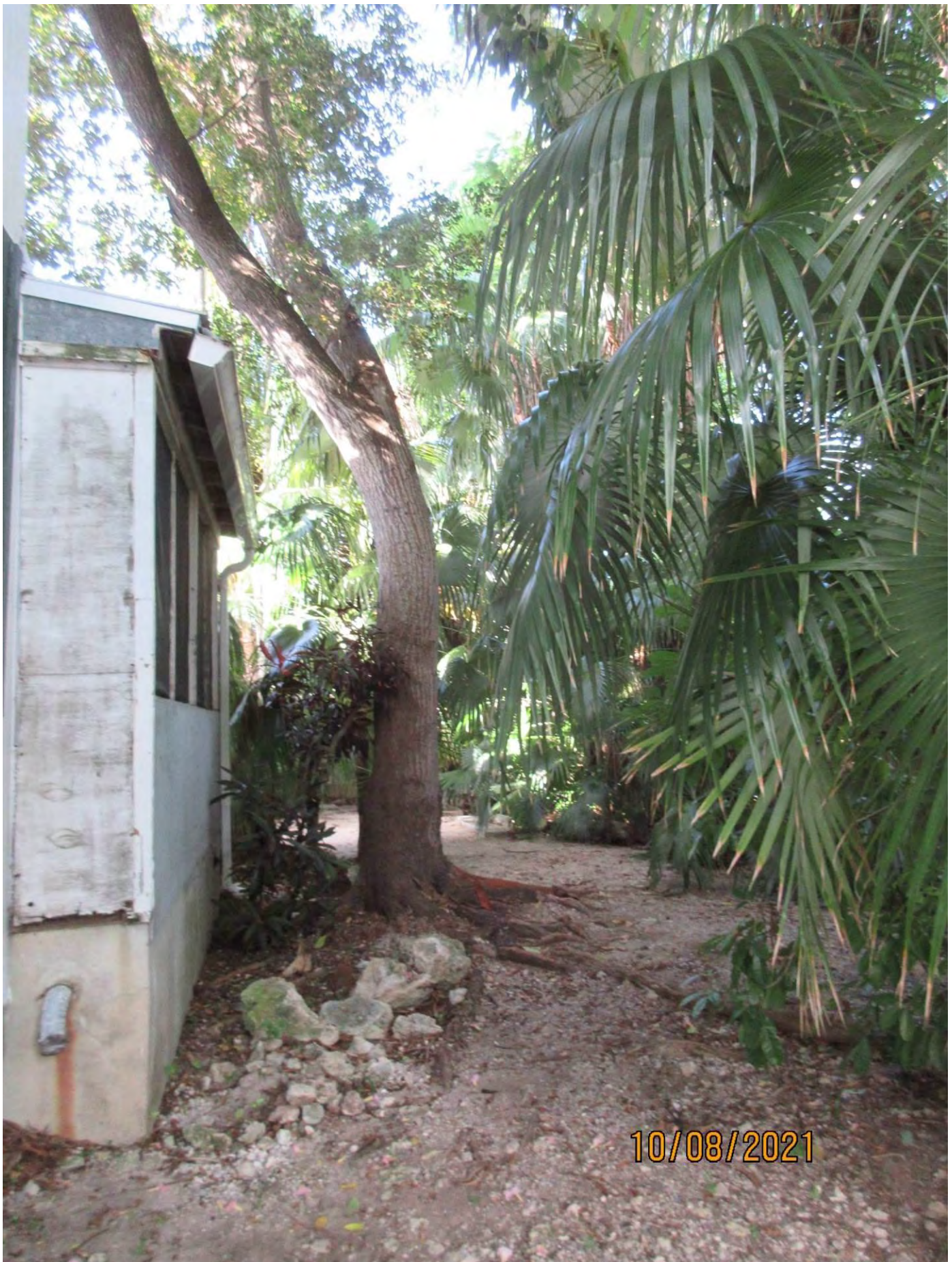
Photo showing location of trunk and base of tree in relation to house.