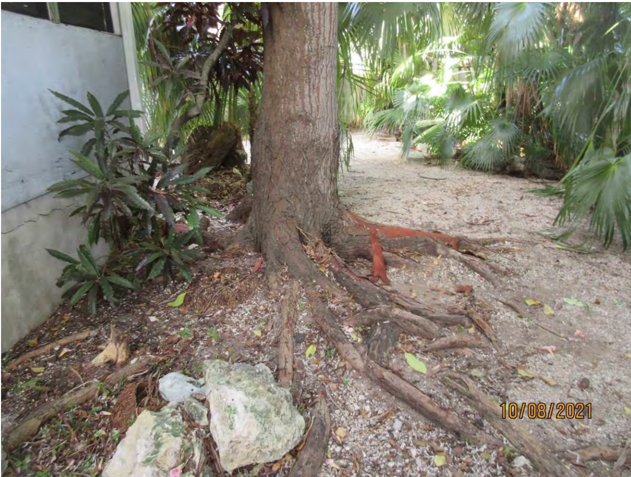
Photo of base of tree and root system, view 1.