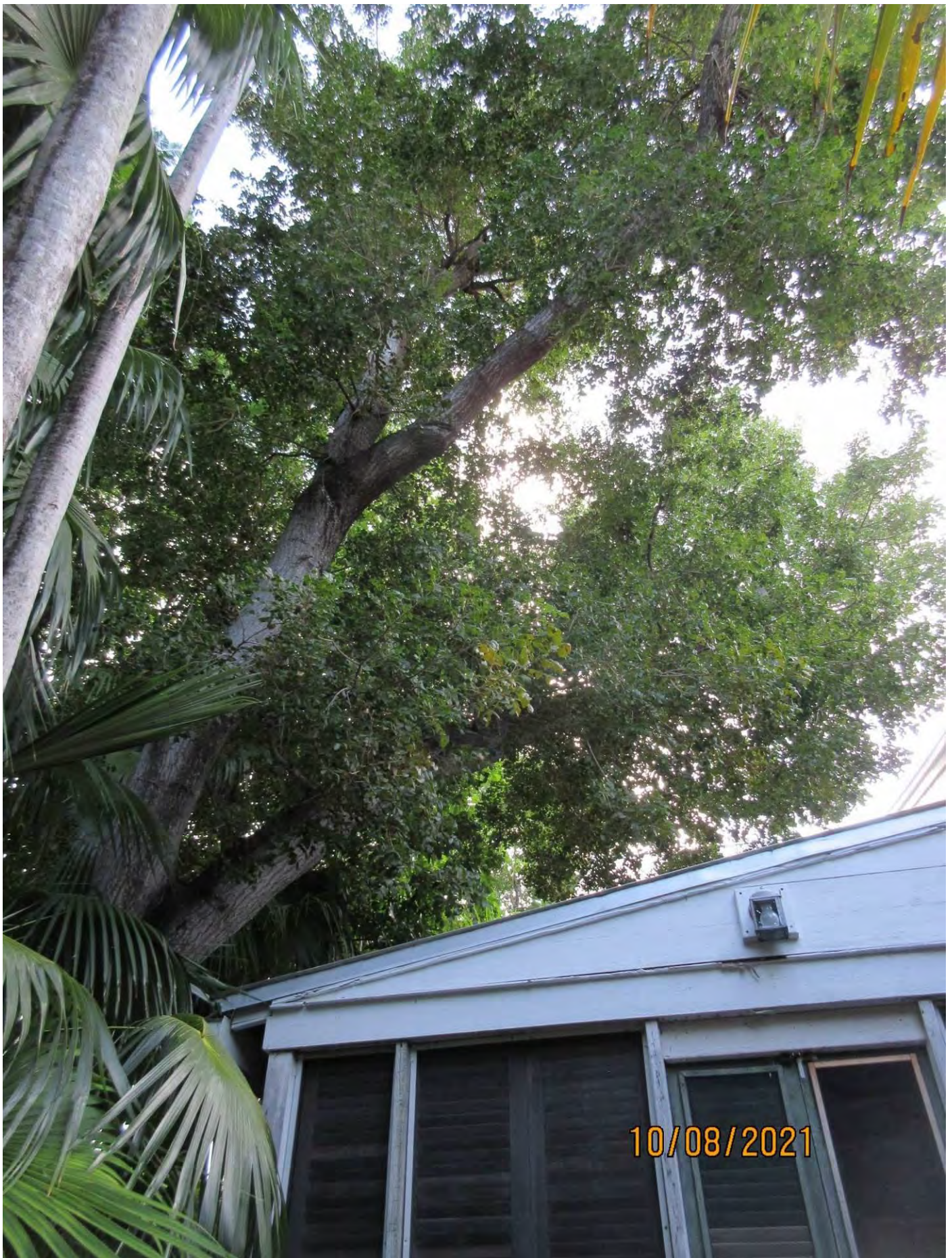
Photo of tree trunks and canopy, view 3. Standing in rear yard looking toward White Street.