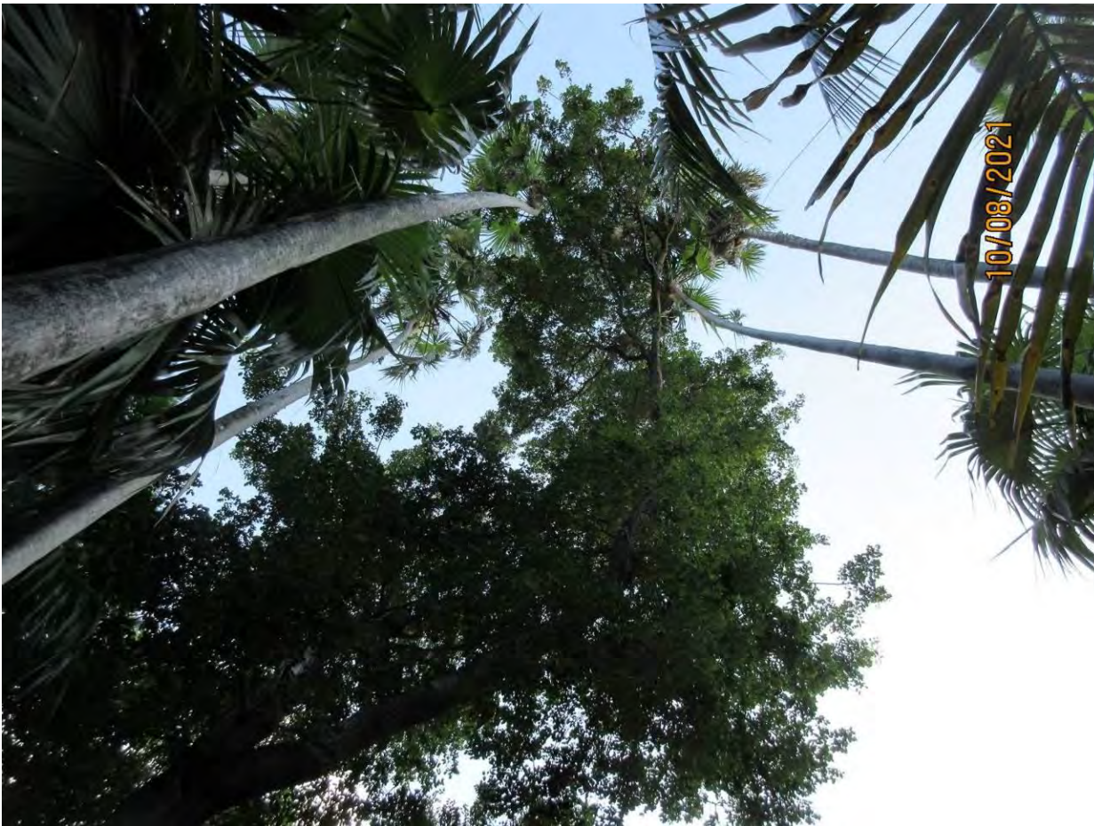
Photo of tree canopy with old Thatch Palms growing through it.