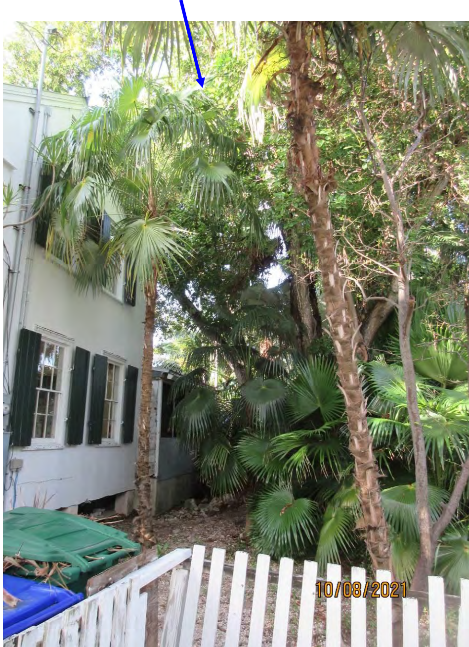
Photo showing location of tree.

Tree Species: Mahogany (Swietenia mahagoni)