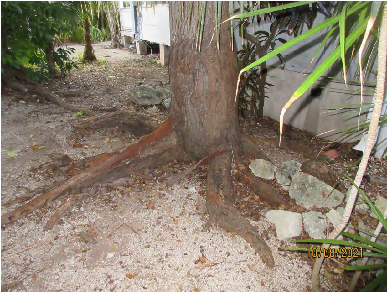
Photo of base of tree and root system, view 2.

Reddish area is tree wood where the bark has been stripped off during inspection.