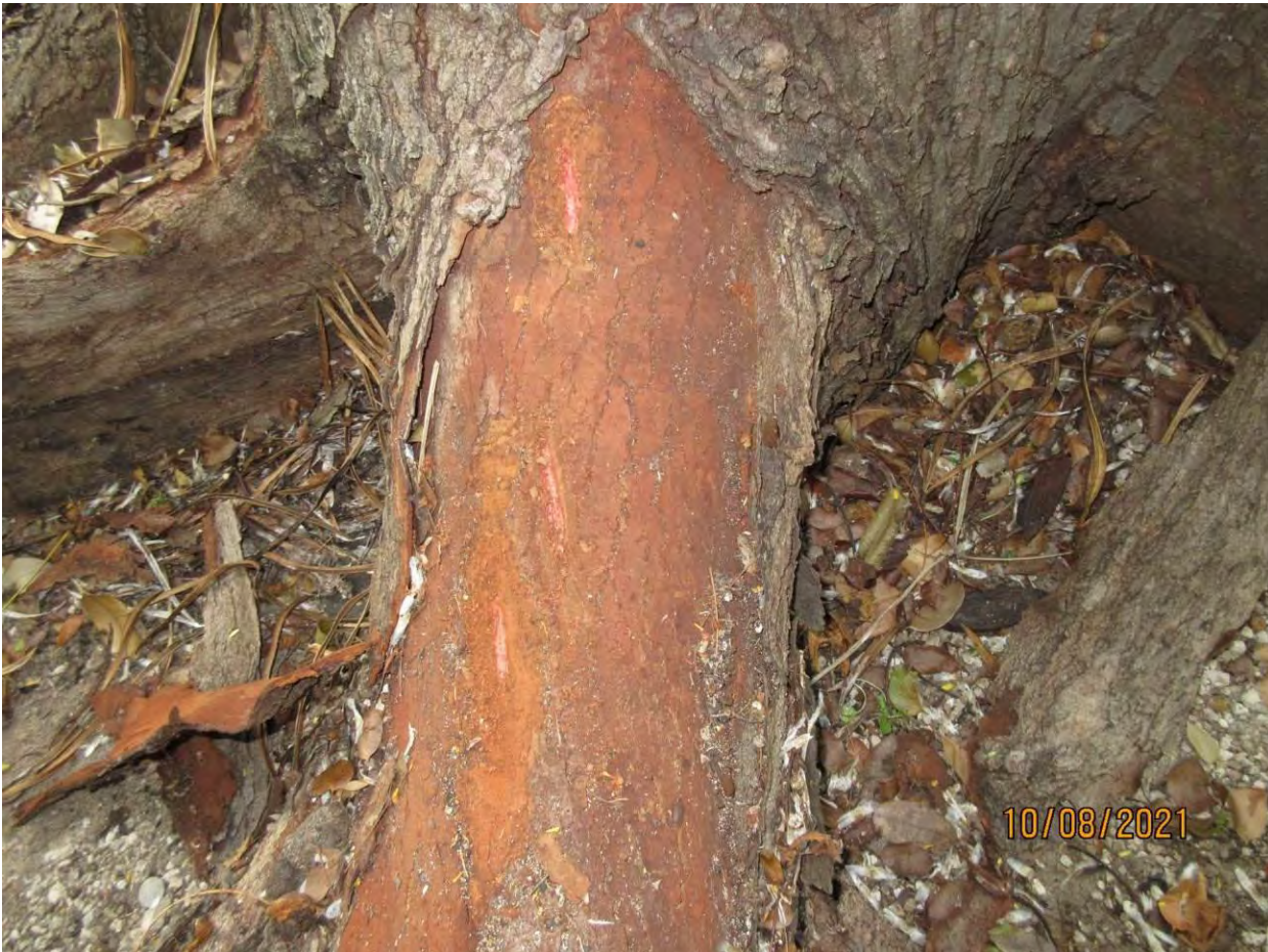
Close up of root wood area. Scrapings indicated hard wood under bark area.